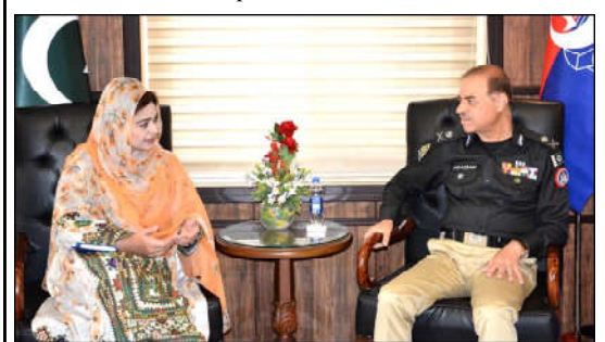
QUETTA: Provincial Secretary Women Development Saira Atta meeting with Inspector General of Police Moazzam Jah Ansari.

The policy is also aimed at promoting the organic agriculture, increasing the biodiversity, protecting food and helping the growers to make compatible with the climatic changes.