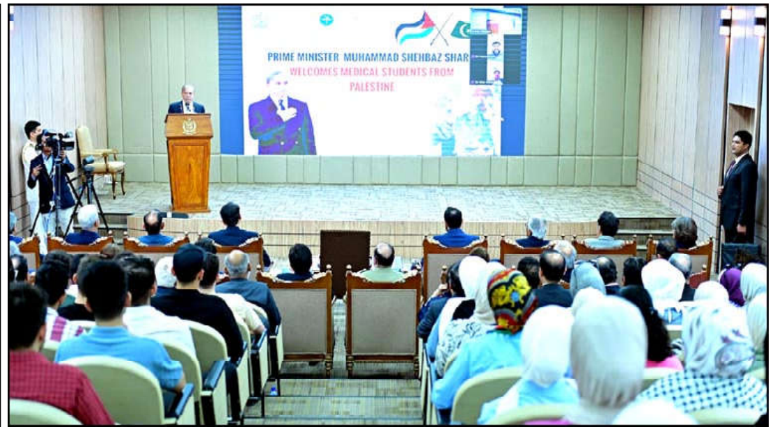
ISLAMABAD: Prime Minister Muhammad Shehbaz Sharif addressing a ceremony held in honour of students of Palestine who recently arrived in Pakistan to complete their medical education.

Prime Minister Sharif regretted the double standards in this world where the powerful and mighty remained untamed. He said the hope of the Palestinian people gave inspiration to the entire world who were facing challenges and where every family was suffering.