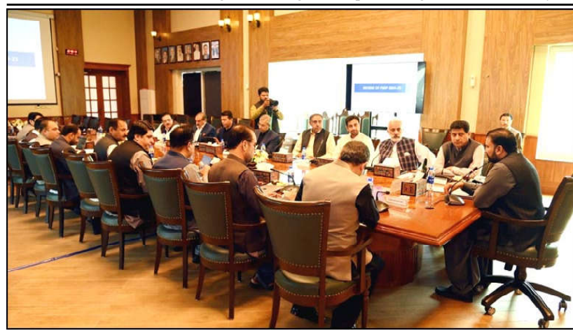
QUETTA: Chief Minister Balochistan Mir Sarfraz Ahmed Bugti presiding over a meeting to review progress on development projects.