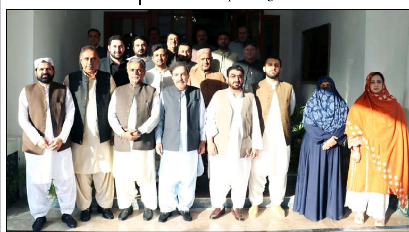
QUETTA: Governor Balochistan Sheikh Jaffar Khan Mandokhail in a group photo with Provincial Ministers and MPAs belong to PML-N.

The BUJ also recommended the journalists to take advantage of this opportunity in order to make use of the RTI laws to get public information.