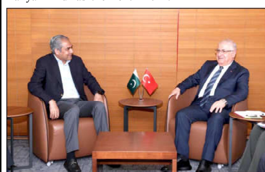
ISTANBUL: Federal Minister for Interior Mohsin Naqvi in a meeting with Turkish Minister of National Defense Yasar GÜLER.

The notification said, "In exercise of the powers conferred by clause (3) of Article 175 A read with Article 177 and 179 of the constitution of the Islamic Republic of Pakistan, the President of the Islamic Republic of Pakistan is pleased to appoint Mr. Justice Yahya Afridi, Judge of Supreme Court, as Chief Justice of Pakistan, for a term of three years with effect from 26-10-2024.