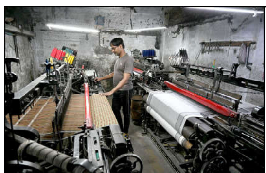
HYDERABAD: Worker busy in preparing design on the handkerchief and traditional fabric by machine at a local textile factory.

He said that we are also focusing on enhancing our design capabilities (replacing the physical samples to 3D prototypes) and creating high-end products that command premium quality in international markets.