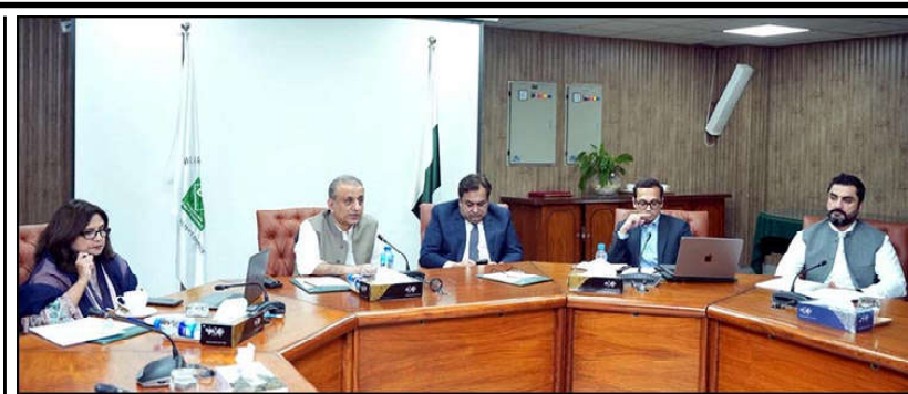
ISLAMABAD: Federal Minister for Board of Investment, Privatization & Communications Abdul Aleem Khan presided over a meeting on Road Shows in China.

He said this initiative is part of Pakistan's broader strategy to increase its global food exports, targeting the Middle East as a crucial growth area. By establishing stronger trade connections, Pakistan aims to enhance its export portfolio and contribute to the economic growth of both countries through mutually beneficial trade partnerships, he added.