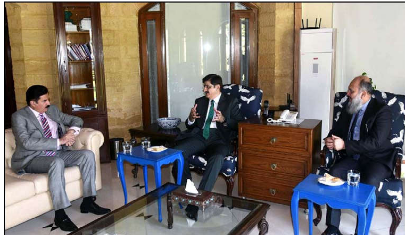
KARACHI: Sindh Chief Minister, Syed Murad Ali Shah exchanges views with Federal Commerce Minister, Jam Kamal and Governor Khyber Pakhtunkhwa Faisal Karim Kundi during meeting held at CM House in Karachi.

service quota has been submitted to the Public Service Commission, along with a case for 631 sub-inspector positions under the 25% quota for current assistant sub-inspectors. The police vehicle procurement process is ongoing at a budget of 802 million PKR, which includes the purchase of 34 double cabins, 15 single cabins, 30 single cabin vehicles, and 15 bikes. Additionally, work is underway to bulletproof 79 vehicles at a cost of Rs. 760 million. The Chief Minister stressed the need for prompt completion of recruitment and vehicle purchases.