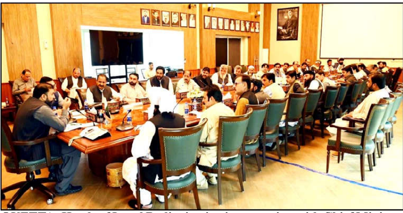
QUETTA: Heads of Local Bodies institutions meeting with Chief Minister Balochistan Mir Sarfaraz Ahmed Bugti.