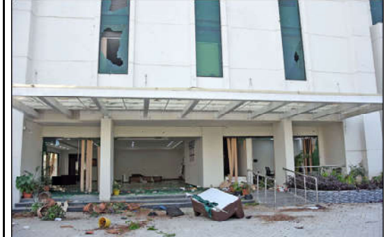
RAWALPINDI: A view of damage building of a college from students during a protest of students in favor of their demands at 6th road in the city.

She said that strict action would be taken against all those who spread fake information in this regard and did negative propaganda.