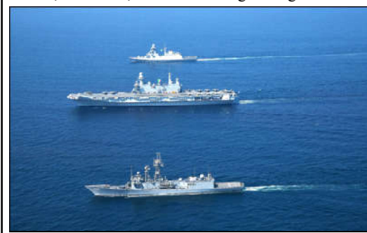
Pakistan and Italian Navy ships during bilateral exercise in North Arabia Sea.