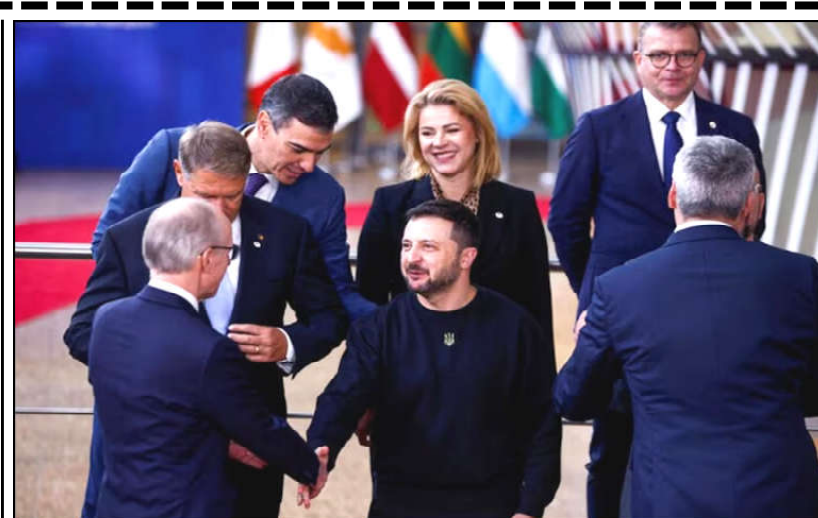
Luxembourg's Prime Minister Luc Frieden, Romania's President Klaus Iohannis, Spain's Prime Minister Pedro Sanchez, Ukraine's President Volodymyr Zelenskyy, and President of the European Council Charles Michel attend a European Union leaders summit in Brussels, Belgium.

Israel has been fighting Hamas since the October 7 attack — which resulted in the deaths of 1,206 people, mostly civilians, according to an AFP tally of official Israeli figures.