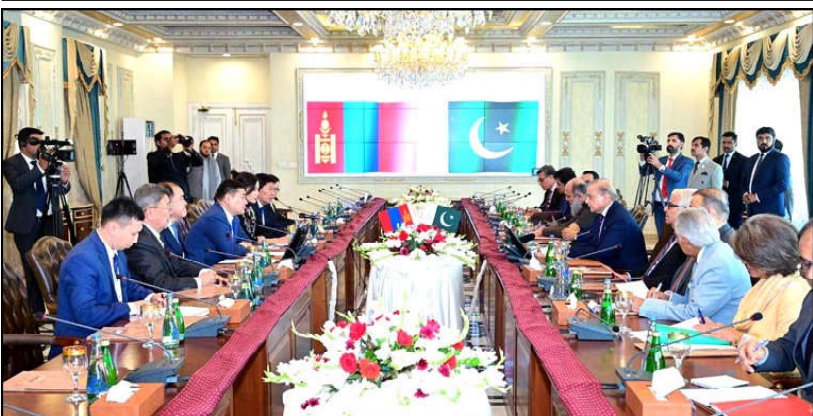
ISLAMABAD: The Prime Minister of Mongolia H.E. Luvsannamsrain Oyun-Erdene along with a delegation meets Prime Minister Muhammad Shehbaz Sharif.