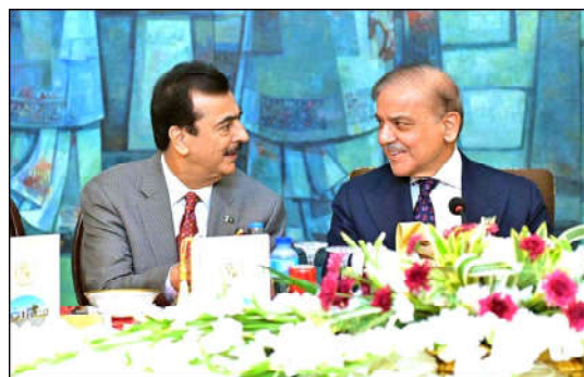
ISLAMABAD: Prime Minister Muhammad Shehbaz Sharif with Chairman Senate Syed Yousuf Raza Gillani at a banquet organized in honor of the senators.

He appreciated Pakistan's constructive contributions to SCO's work and activities across all domains and expressed satisfaction over Pakistan's leadership role as SCO CHG Chair.