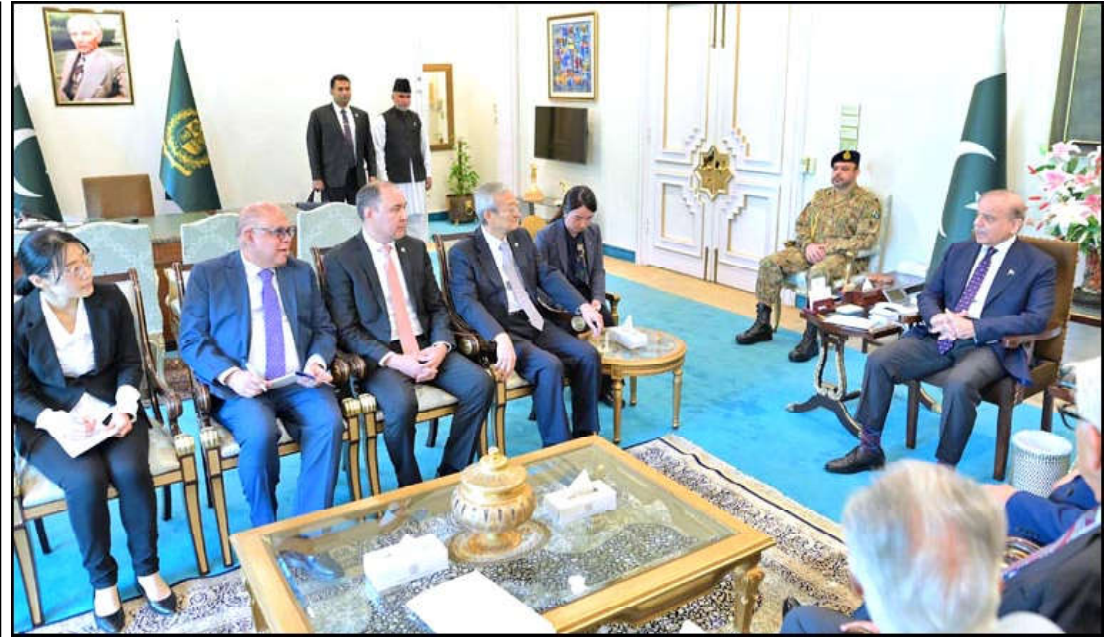
ISLAMABAD: Secretary General Shanghai Cooperation Organisation Zhang Ming calls on Prime Minister Muhammad Shehbaz Sharif.

The PTI chief said he would later hold a meeting with Jamiat Ulama-e-Islam-Fazl (JUI-F) chief Maulana Fazlur Rehman on the matter as well.