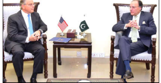
ISLAMABAD: Federal Minister for Finance & Revenue Senator Muhammad Aurangzeb called on by the Ambassador of USA to Pakistan H.E. Donald Blome.

Tarar said that with the help of NGOs, the government had sent relief items to Gaza and Lebanon to support the war-ravaged people. He also criticized the PTI for writing letters to the International Monetary Fund (IMF) to push Pakistan towards default, orchestrating the May 9 attacks, vandalizing memorials of martyrs, and calling for protests during the Shanghai Cooperation Organization summit.