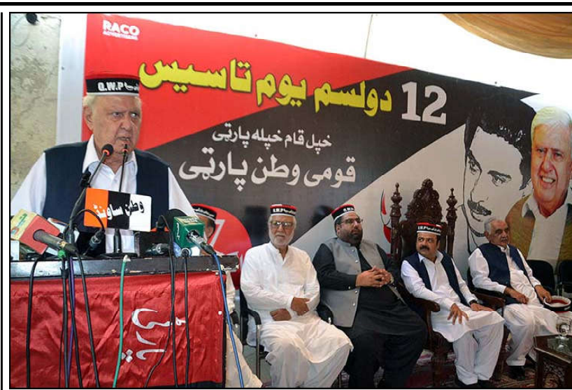
PESHAWAR: Quami Watan Party Chairman, Aftab Ahmad Khan Sherpao addresses to participant during Annual Foundation Day ceremony held in Peshawar.