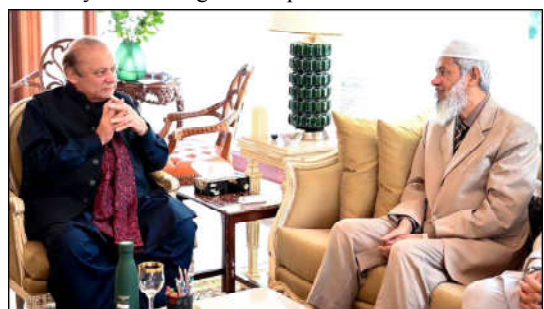
LAHORE: Renowned religious scholar Dr. Zakir Naik meeting with Quaid PML (N) Muhammad Nawaz Sharif

ISLAMABAD (APP): Speaker of the National Assembly, Sardar Avaz Sadiq Monday said that the white cane is a symbol of independence, confidence, and freedom for those with visual impairments. While paying tribute to the courage and resilience of visually impaired persons on the occasion of White Cane Safety Day, he said that this day serves as an encouragement for all of us to support and empower visually impaired individuals and include them in the national mainstream. The Speaker emphasized that visually impaired individuals are an important part of our society, and ensuring their well-being and empowerment is our collective responsibility. "By harnessing their