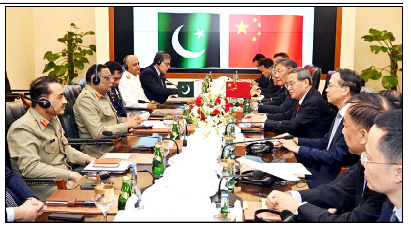
ISLAMABAD: Chinese Premier Li Qiang holding a significant meeting with Chairman of the Joint Chiefs of Staff Committee and the Service Chiefs.