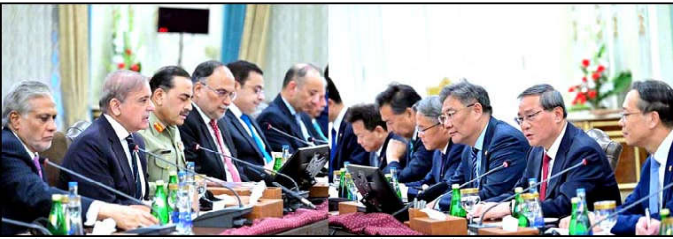
ISLAMABAD: Prime Minister Muhammad Shehbaz Sharif and Chinese Premier, Li Qiang in delegation level talks.