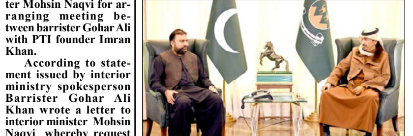
QUETTA: Chief Minister Balochistan, Mir Sarfraz Bugti with a Qatari Royal family member.

QUETTA: The Chief Minister Balochistan, Mir Sarfraz Bugti has reiterated his government's plan to send 30,000 youth of the province to Qatar and other countries after imparting them the necessary training under the CM Youth Skills Development Programme. He said that it is for the first time in history of the province that the youngsters are being provided opportunities of livelihood abroad in large number. These youngsters would not only earn respectable livelihood for them and their families, but would also send foreign exchange back to Pakistan. These views were expressed by the Chief Minister while speaking to the member of Royal family of Qatar, Sheikh Talal Khalifa Al Thani, who called on him along with other members of the family here at the CM's secretariat on Monday. During the course of meeting, they discussed the matters of mutual interest and cooperation. The Chief Minister apprised the member of Qatar Royal family about the CM's Youth Skills Development Programme and share details about it. Speaking on the occasion, Chief Minister said that the Youth Skills Development would bring economic stability in the country and province bringing down the poverty. The member of Qatar Royal family, Sheikh Talal Khalifa Al Thani hailed the CM Balochistan Youth Skills Development Programme and termed it welcoming. He assured that youth of the province would be provided the opportunities of livelihood in Qatar.