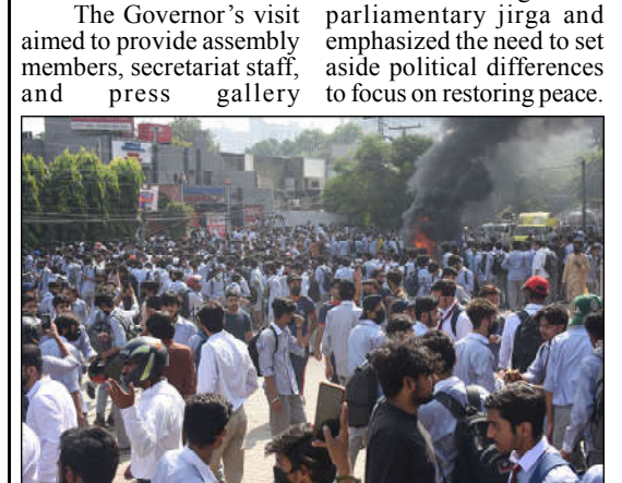
LAHORE: Angry students protest by burning tyres and furniture a local college, after the alleged rape of a female student by security card at Gulberg in the Provincial Capital.