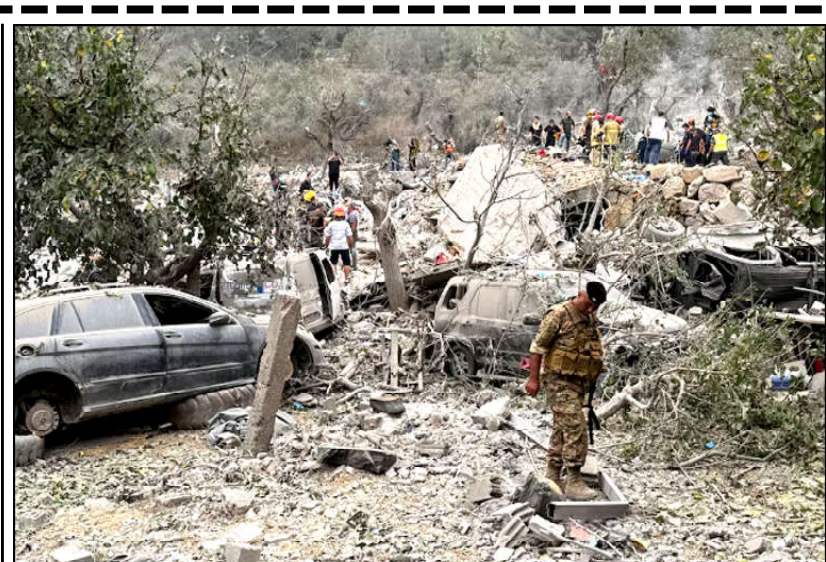
Lebanese army soldier inspects a site damaged by an Israeli air strike in the Christian-majority region of Aitou in north Lebanon.

ground operation in Lebanon earlier this month with the goal of weakening Hezbollah and pushing the militant group away from the border to allow thousands of displaced Israelis to return to their homes. Inside Gaza, an Israeli airstrike killed at least 20 people including children at a school Sunday night, according to two local hospitals. The school in Nuseirat was sheltering some of the many Palestinians displaced by the war. Meanwhile, explosions hit early Monday outside Al-Aqsa Martyrs Hospital in Deir al-Balah, killing three people and injuring about 50 others, the hospital said. Tents caught fire, and residents of the Central Gaza community carried the injured into the hospital. Hezbollah's deadly strike in Israel came the same day that the United States announced it would send a new air-defense system to Israel to help bolster protection against missiles, along with troops needed to