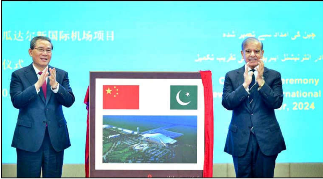
ISLAMABAD: Prime Minister Muhammad Shehbaz Sharif and Chinese Premier, Li Qiang unveiling a plaque to mark the completion of New Gwadar International Airport.

Ph: 284 1470/2841473 Vol: XIX No. 225, Rabi-us-Sani 11, 1446 AH Tuesday October 15, Pages 04, Price Rs. 15