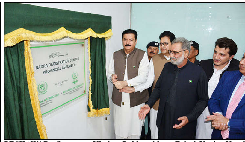
PESHAWAR: Governor Khyber Pakhtunkhwa Faisal Karim Kundi inaugurates NADRA registration Center at Provincial Assembly.

Khan Gandapur in the chair, took stock of the progress made on the decisions of the cabinet meetings. The participants were informed that a total of 2564 new vacancies have been approved in the cabinet meetings. Moreover, Rs 8.5 billion has been released for the deserving households under the Ramadan package. Additionally, 1356 new vacancies have been approved to strengthen police in the province, and Rs. 600 Million have been released for the purchase of armored vehicles for the police.