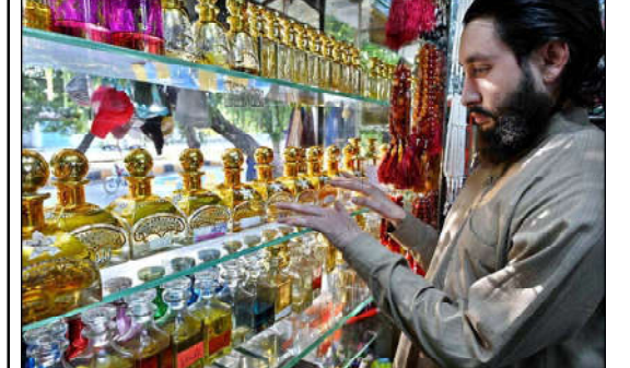
ISLAMABAD: A shopkeeper arranging and displaying perfumes to attract the customers in the city.

ISLAMABAD (Online): Special Investment Facilitation Council (SIFC) playing a pivotal role in taking the country's economy on the path of development and restoring the confidence of the world. As a result of these efforts, China, Russia and Brazil have recently expressed their desire to invest in various sectors of Pakistan. China desires to shift its various industries to Pakistan while Russia and Brazil are involved in trade agreements with Pakistan.