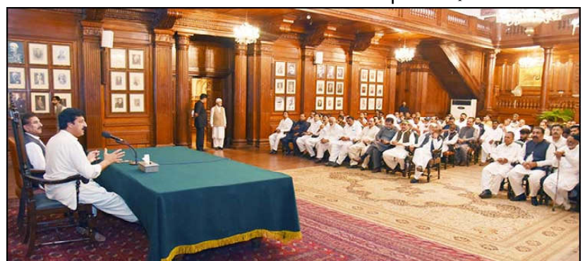
LAHORE: Governor Punjab Sardar Saleem Haider Khan expressing his views while meeting the office bearers, ticket holders and workers belonging to District Sheikhupura here at Governor House Lahore.

LAHORE (APP): For the first time the Walled City of Lahore Authority (WCLA) has launched a guided tour of the Lahore Fort in which the hidden spaces of the fort have been opened and the tourists can see them with a trained guide of WCLA. According to WCLA sources here on Monday, this is a monthly guided tour launched by the WCLA in 2024. Places inside Lahore Fort like Arzghah, Kala Burj, Akbari Gate, Akbari Hammam, Kharak Singh Haveli with rooftop views, Akbari Mahal, Sheesh Mahal Attic Rooms, Ranjeet Singh's Last Living Room, British Barracks or Jails, Mughal era Water Channels, The Mysterious grave in the basement, Torture cells near the Royal Kitchens, Zanana Masjid, Naag Temple, Summer Palace and Daulat Khana Khas o Aam have been opened to the public for the first time in this tour.