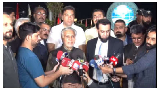
ISLAMABAD: Deputy Prime Minister and Foreign Minister Mohammad Ishaq Dar alongwith Federal Minister for Information and Broadcasting Attaullah Tarar talking with media men after visit to review arrangements for the upcoming CHG-SCO meeting.

ISLAMABAD (APP): Prime Minister Muhammad Shehbaz Sharif and Premier Li Qiang is scheduled to undertake a four-day bilateral visit to Pakistan from October 14-17, 2024 to meet Pakistan's civil and military leadership and attend the Meeting of the Council of the Heads of Government of the Shanghai Cooperation Organization. Premier Li will be accompanied by ministers and senior officials including from the ministries of foreign affairs and commerce, the National Development and Reform Commission and the China International Development Cooperation Agency, according to a curtain raiser issued by the Foreign Office on Sunday. The Chinese premier will call on President Asif Ali Zardari and hold meetings with parliamentary leaders and senior military leadership of Pakistan. He will also attend the Meeting of the Council of the Heads of Government of the Shanghai Cooperation Organization being held in Islamabad on October 15-16.