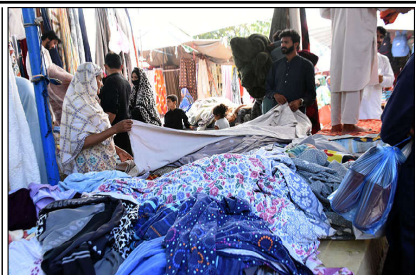
ISLAMABAD: Citizen busy in shopping at Weekly Bazaar at Sector G-10, in the Federal Capital.

He said that the poultry units were sent to various veterinary hospitals at three tehsils of district Lodhran where from the units were distributed among farmers. He said that the initiative not only would make peoples' access to healthy diet easy but also bring profits to the owners.