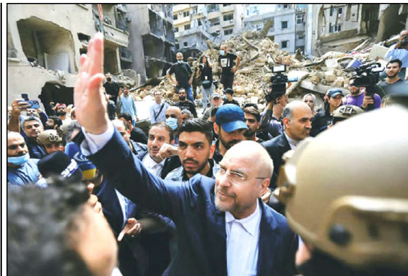
BEIRUT: Iran's Parliament Speaker Mohammad Bagher Ghalibaf waves during his visit to the site of an Israeli air strike in the Basta neighbourhood.

"One of the elements of the migration strategy will be the temporary territorial suspension of the right to asylum," Prime Minister Donald Tusk said on Saturday. "I will demand this, I will demand recognition in Europe for this decision," he told a congress held by his liberal Civic Coalition (KO) grouping, the largest member of Poland's coalition government. Tusk said the right to asylum was being used by Belarusian President Alexander Lukashenko, Russian President Vladimir Putin and by people smugglers in a way that goes against the essence of the right to asylum.