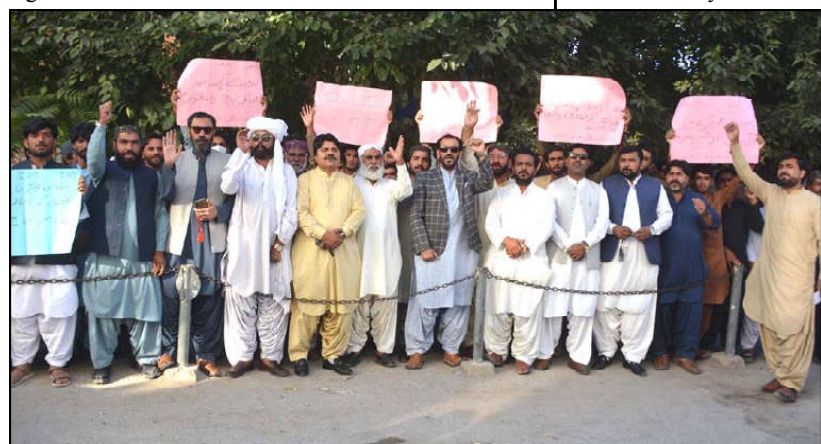
QUETTA: Activists of Bugti Rabita Committee protesting against the Bandits of Kacha outside Quetta Press Club.