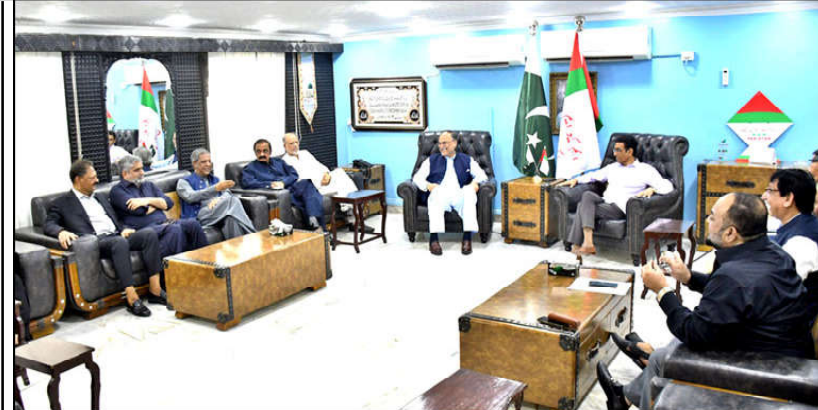
KARACHI: Pakistan Muslim League Nawaz (PML-N) delegation, led by Secretary General Ahsan Iqbal, Advisor to PM Rana Sanaullah, and Federal Minister Azam Nazeer Tarar, meets with MQM-Pakistan leadership, including Chairman Khalid Maqbool Siddiqui, at Pakistan House.

Dar, to another question, said Pakistan is a host to CHG-SCO and would fully meet the responsibility. About the North-South and South-South connectivity, he said the discussions with the relevant countries were in progress and continuing on the bilateral and multilateral levels. But within the SCO framework and protocol, certain matters would be discussed under specific scope of discussions and within its contours, he further clarified.