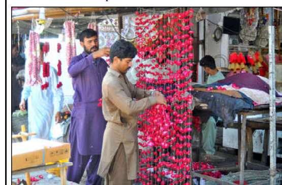
MULTAN: Vendors are busy preparing flower garlands at their roadside setup.