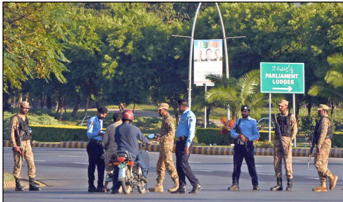
ISLAMABAD: Pak Army soldiers and police personals checking a motorcyclists in front of Parliament House at Constitution Avenue, during security high alert at "red zone" area ahead of Shanghai Cooperation Organisation (SCO) summit, in the Federal Capital.