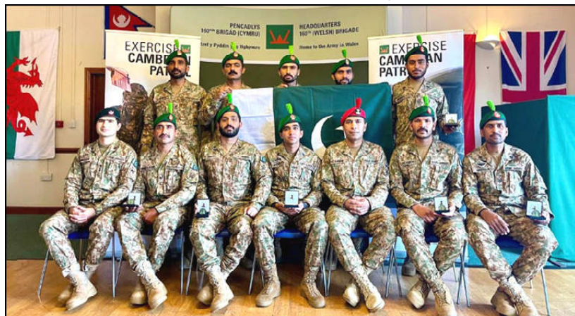
WALES: Pakistan Army Team participate in Exercise Cambrian Patrol-2024, held in Wales. This year, 128 teams from 42 Countries participated in the Exercise and out of all these teams, Pakistan Army's Team showed Exceptional Performance in the exercise and has been awarded with the Gold Medal.

LAHORE (APP): Pakistan Army's team has been awarded the gold medal in Exercise Cambrian Patrol 2024, which concluded today in Wales, United Kingdom. According to a press release issued here, the event, held from the 4th to the 13th of this month, marked the sixty-fifth anniversary of the exercise, which upholds demanding professional standards. Patrols from around the globe had to move tactically across inhospitable terrain, covering a distance of 60 kilometers (kms) within 48 hours, completing specialist tasks in a contested environment, an Inter Services Public Relations (ISPR) news release said.