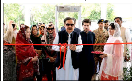
QUETTA: Governor Balochistan Sheikh Jaffar Khan Mandokhail formally inaugurating Fine Arts exhibition at Sardar Bahadur Khan Women's University.

The Prime Minister called for the formulation of a strategy to provide monthly stipends to female students in rural areas of Islamabad, aiming to increase enrollment in these schools. "Technical training should be integrated into the curriculum of Islamabad schools," the Prime Minister said. He added that students who had dropped out of education for any reason should be offered free technical training, and an awareness campaign should be launched to encourage them to return to school. "Teachers are the builders of the nation," he said, highlighting the critical need to establish a high-quality teacher training institution in Islamabad. He also directed a third-party audit of teacher training programs and the assessment of teachers' skills.