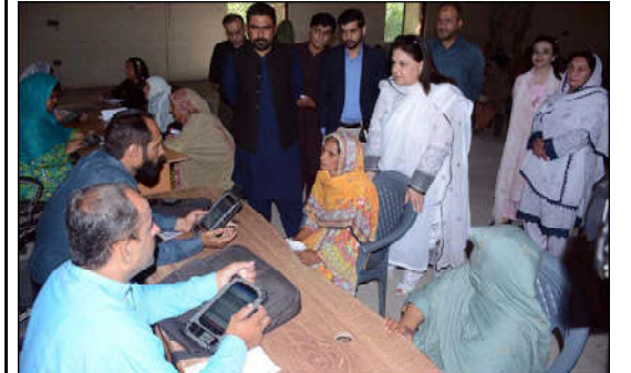
FAISALABAD: Senator Rubina Khalid, Chairperson of the Benazir Income Support Programme (BISP), inspects the Benazir Income Support Program Registration Center at Al Fateh Sports Complex, Salimi Chowk.