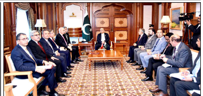
ASHGABAT: President Asif Ali Zardari and the Speaker of Turkiye's Parliament, Numan Kurtulmus, in a meeting on the sidelines of the International Forum on "Interrelation of Times and Civilizations - Basis of Peace and Development" being held in Ashgabat.

Balochistan, Mir Sarfraz Ahmed Bugti, were also present during the meeting. During the meeting, the president said that Turkiye was a great and sincere friend of Pakistan and the Muslim World and had been taking principled positions on the issues faced by the Muslim Ummah as well as raising its voice against injustice. The meeting expressed concern over the grave humanitarian situation in Palestine and Lebanon where Israel was killing innocent people. It was emphasized that the Muslim World needed to make sincere and serious efforts to address the challenges being faced by the Ummah. President Zardari said that Turkiye was on its way to becoming an economic power and expressed his best wishes for the success and prosperity of Turkiye.