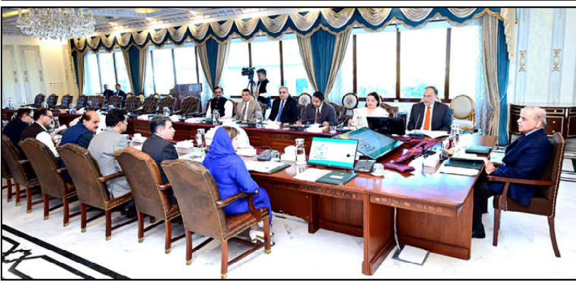
ISLAMABAD: Prime Minister Muhammad Shehbaz Sharif chairs a meeting on matters related to Ministry of Federal Education and Professional Training.