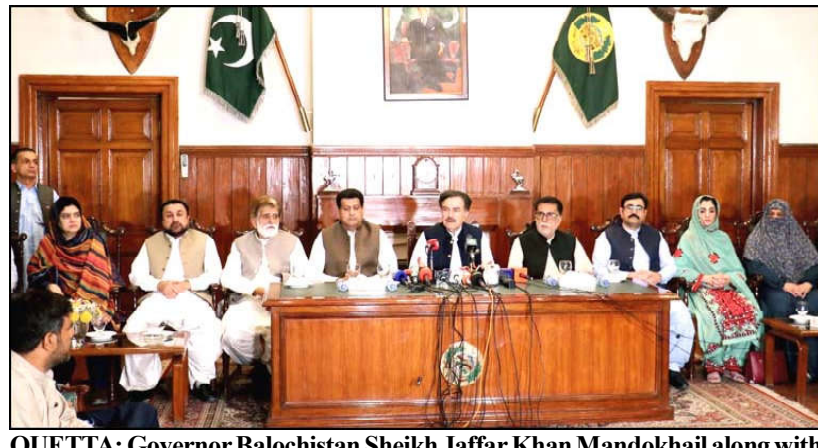
QUETTA: Governor Balochistan Sheikh Jaffar Khan Mandokhail along with Balochistan cabinet members addressing a press conference for Duki incident at Governor House.

ISLAMABAD (Online): Chief Justice of Pakistan (CJP) Qazi Faez Isa has refused to give more adjournment in intra party election review case due to absence of PTI lawyers from hearing remarking dilatory tactics are being used. The CJP further remarked they want headlines but Supreme Court (SC) will not give them any such headline. Intra Party Election review case came up for hearing before a 3-member bench of SC presided over by CJP Qazi Faez Isa Friday. He further remarked the drum beaters made the intra party election case as case of election symbol of bat. The drum beaters should read court's decision first and then criticize it. They should go out side and make propaganda but should not come to court. It is appropriate. graph No 2 of application for adjournment. Paragraph regarding the family engagement of Hamid Khan was read. The CJP remarked this is application for some novel adjournment. Application of such nature has not been seen before. This case was to be fixed for hearing in proposed cause list of May 29. There was application from advocate Ali Zafar for general adjournment till June 4. Open heart surgery of one member of bench took place. He further remarked the drum beaters made the intra party election case as case of election symbol of bat. The drum beaters should read court's decision first and then criticize it. They should go out side and make propaganda but should not come to court. It is appropriate.