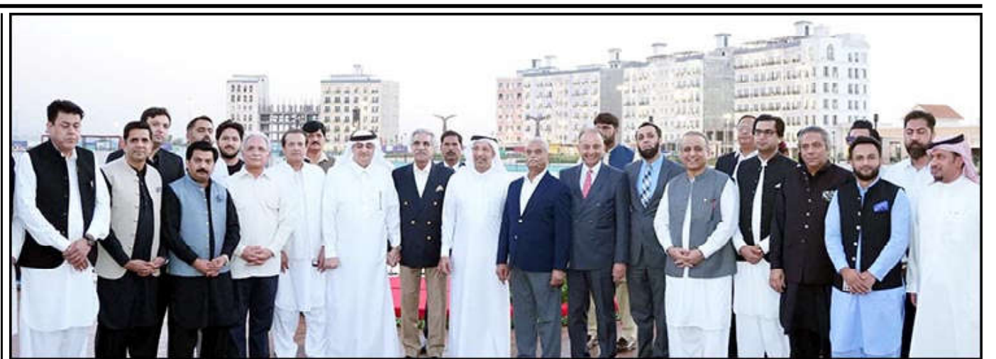
Group photo on reception in honor of KSA Investment Minister, Sh. Khalid Bin Abdul Aziz Al Faleh by Federal Minister for Board of Investment, Privatization & Communications Abdul Aleem Khan in Islamabad.