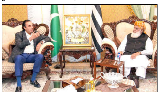
ISLAMABAD: Chairman Pakistan Peoples Party Bilawal Bhutto Zardari talking with Chief of Jamiat Ulema-e-Islam-Fazl (JUI-F) Maulana Fazlur Rehman during a meeting at his residence, in the Federal Capital.

ASHGABAT (APP): President Asif Ali Zardari on Friday addressed an international forum held here in the Turkmen capital, where he emphasized an enhanced focus on the promotion of regional connectivity as well as cultural and economic collaboration in the region. The president, addressing the forum on "Interrelation of Times and Civilizations- Basis for Peace and Development" said that Pakistan and Turkmenistan shared a deep-rooted bond of brotherhood which was built on mutual respect and commonalities of faith and a shared vision for a better and peaceful future. The event, held to mark the 300th birth anniversary of Magtymguly Faragi, a great Turkmen thinker, poet and philosopher, was also attended by several regional leaders including Iranian President Masoud Pezeshkian, Russian President Vladimir Putin, Kazakhstan President Kassym-Jomart Tokayev, Uzbekistan President Shavkat Mirziyoyev, Tajik President Emomali Rehmon, Kyrgyz President Sadyr Japarov and others. President Zardari, who arrived here on Thursday on a two-day visit, called Magtymguly Faragi a "towering figure" of Turkmen literature and a "beacon of spiritual enlightenment." The great Turkmen poet and Pakistan's national poet Allama Muhammad Iqbal shared several commonalities in their poetry and thoughts on Sufism and nationalism, he added.