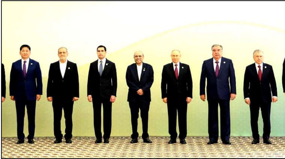
ASHGABAT: President Asif Ali Zardari in a group photo with Heads of States/Governments/Parliaments participating in the International Forum on "Interrelation of Times and Civilizations - Basis of Peace and Development."

Ph: 2841470/2841473 Vol: XIX No. 223, Rabi-us-Sani 08, 1446 AH Saturday October 12, Pages 04, Price Rs.15