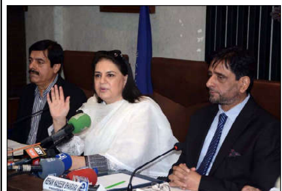
FAISALABAD: Senator Rubina Khalid, Chairperson of the Benazir Income Support Programme (BISP) is addressing members of Faisalabad Chamber of Commerce & Industry (FCCI).

KARACHI (APP): The State Bank of Pakistan (SBP) injected Rs8,623.85 billion into the market through a reverse repo purchase Open Market Operation (OMO) on Friday. According to OMO results issued here, the SBP conducted an Open Market Operation, Reverse Repo Purchase (Injection) on October 11, 2024, for 7-day and 28-day tenors and accepted 38 bids cumulatively amounting to Rs8,623.85 billion. The central bank received 23 bids for a 7-day tenor cumulatively offering an amount of Rs3,722.7 billion at the rate of return ranging between 17.56 to 17.62 percent while 15 bids amounting to Rs4,901.15 billion were received for the 28-day tenor at the rate of return ranging between 17.56 to 17.63 percent. The central bank accepted all 23 bids for 7-day tenor and 15 quotes for 28-day tenor at a 17.56% rate of return.