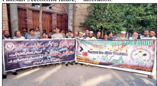
QUETTA: Members of Pakistan Mine Workers Federation are holding protest demonstration against the attack on miners in Duki area of Balochistan, at Quetta press club.

stating that the country is on the path to full economic recovery and sustainable prosperity. This positive outlook is backed by actions already taken by Pakistan's leadership, including implementing enabling regulations and easing business operations for both local and Saudi investors. In a significant development, 27 separate agreements were signed between Pakistan and Saudi Arabia, aiming to boost investment in the country. This move is expected to create a vibrant economy, unlocking new opportunities for growth and development. The agreements demonstrate the commitment of both nations to foster economic cooperation and collaboration.