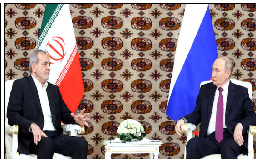
Russian President Vladimir Putin meets Iranian counterpart Masoud Pezeshkian on the sidelines of a cultural forum dedicated to the 300th anniversary of the birth of the Turkmen poet and philosopher Magtymguly Fragi, in Ashgabat, Turkmenistan.

resulted in a new toll of 22 people killed and 117 injured," the ministry said in an updated toll statement. A Lebanese security source, requesting anonymity to discuss sensitive matters, told AFP that Israel had attempted to kill a Hezbollah official who often frequented the locations targeted. Israeli forces fired on positions used by UN peacekeepers in Lebanon on Wednesday and Thursday, the UN force said, as Israel warned Lebanese civilians not to return to homes in the south and pursued a widening offensive against Hezbollah. The UNIFIL force said two of its peacekeepers were injured in one of the incidents when an Israeli tank fired at a watchtower at the force's main headquarters in Ras al-Naqoura, hitting the tower and causing them to fall.