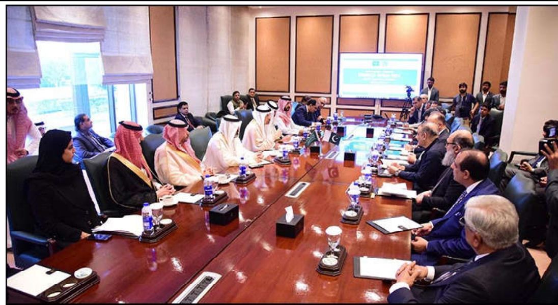
ISLAMABAD: Federal Ministers and private sector leaders in meeting with Saudi Investment Minister H.E. Eng. Khalid bin Abdulaziz Al-Falih to discuss enhancing trade and investment.

Sheikh Khalid expressed enthusiasm about the announcement from the Saudi Crown Prince regarding a $5 billion investment in Pakistan, revealed during Prime Minister Shehbaz Sharif's recent visit shortly after he took office. "I'm delighted to have the Public Investment Fund (PIF) represented among us," he remarked.