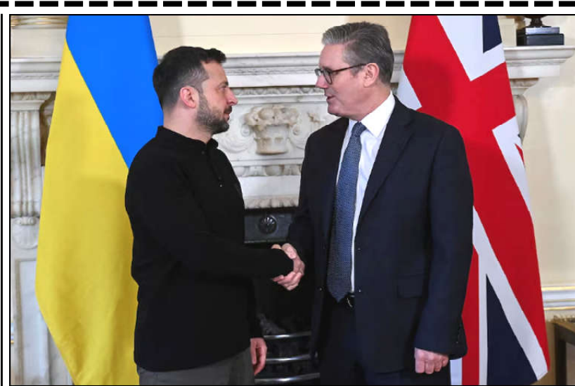
Britain's Prime Minister Keir Starmer and Ukraine's President Volodymyr Zelenskyy shake hands on the day of a bilateral meeting inside 10 Downing Street in London, Britain.

"We need to see fewer barriers to the delivery of aid, not more of them," Thomas-Greenfield said.