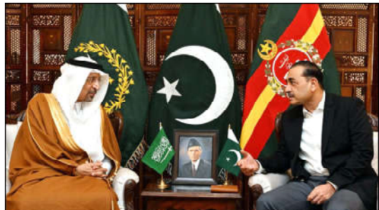
RAWALPINDI: Minister of Investment, Kingdom of Saudi Arabia, Khalid Bin Abdulaziz Al Falih, accompanied by a high-level government cum business delegation, meet with General Syed Asim Munir, NI(M), Chief of Army Staff (COAS).

Independent Report QUETTA: The train service is due to be restored from Quetta to rest of the country today (Friday) as the reconstruction of Dozan railway bridge completed in Bolan area. The Pakistan Railway authorities confirmed that the Jaffar Express is scheduled to depart from Quetta Railway Station for Peshawar at 09:00 AM today. Similarly, the Bolan Mail is scheduled to depart for Karachi from Quetta on October 13. Meanwhile, the trial of engine and train was done by crossing the same from Dozan railway bridge. The Divisional Superintendent of Pakistan Railways Quetta, Imran Hayat personally monitored the trial of train at the bridge. As the trial remained successful, it was decided to restore the train service from Quetta to other parts of the country. It may be recalled that the Dozan railway bridge was destroyed by some unknown miscreants in subversive act on August 26, 2024. After destruction of the railway bridge, the train service was suspended from Quetta for rest of the country.