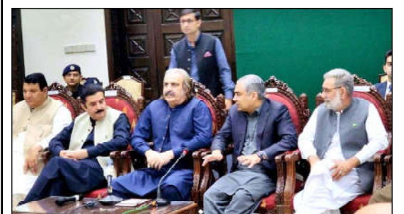
PESHAWAR: Federal Interior Minister, Mohsin Naqvi participating in Grand Jirga organised by the Khyber Pakhtunkhwa government.

PESHAWAR (APP): Governor Khyber Pakhtunkhwa, Faisal Karim Kundi, on Thursday highlighted the significance of peace in the province during a jirga held at the Chief Minister's House. Addressing the gathering, he expressed gratitude to the provincial government for organizing the event and to Federal Interior Minister Mohsin Naqvi for his presence. Governor Kundi acknowledged existing political differences and stressed that the safety and prosperity of the province remain the top priorities. He asserted that negotiations are essential for resolving issues, particularly in light of ongoing challenges, including the situation in Afghanistan. Referring to a recent tragic incident in district Khyber, he underscored the urgency of addressing security concerns, saying that