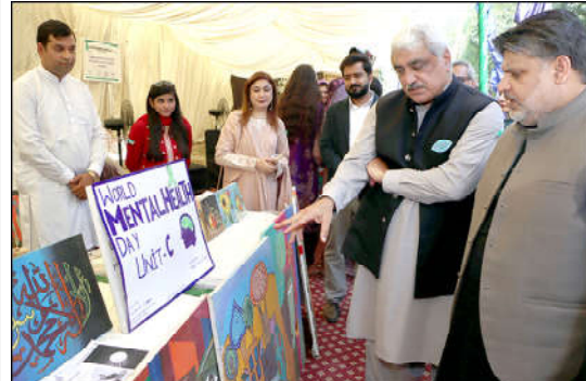
LAHORE: Punjab Health Minister Khawaja Salman Rafique watching the stalls on the eve of World Mental Health Day ceremony at Punjab Institute of Mental Health.

The Provincial Assembly including leadership of all religious-political parties assigned CM KP the responsibility of conducting a peace jirga with concerned for solution of all matters through consultation and peaceful means. The CM KP has accepted the responsibility of conducting a peace jirga and thanked the participants for reposing trust in him.