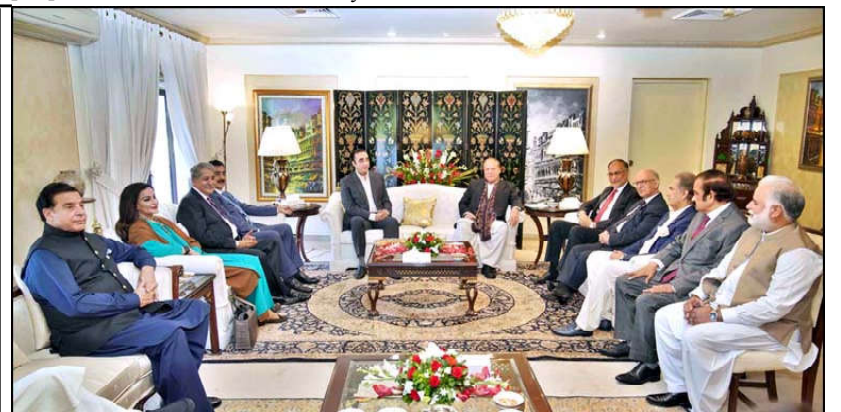
ISLAMABAD: Chairman Pakistan People's Party, Bilawal Bhutto Zardari along with senior party leaders meet with President PML-N, Mian Muhammad Nawaz Sharif and senior party leaders at Punjab House.

ISLAMABAD (APP): Chairman Pakistan People's Party, Bilawal Bhutto Zardari, met with former Prime Minister Muhammad Nawaz Sharif on Thursday to discuss the country's current situation and explore solutions to the challenges it faces. The meeting took place at Punjab House, Islamabad, where Pakistan Muslim League-N President Nawaz Sharif warmly welcomed Bilawal Bhutto upon his arrival. The two leaders expressed satisfaction over the inflation rate drop from 32% to 6.9%, the reduction in the policy rate, overall economic progress, and the continuous improvement in economic indicators, including the record $8.8 billion sent by overseas Pakistanis. The two leaders expressed optimism about the swift relief for Pakistan and its people, calling it an auspicious sign, while also welcoming the arrival of the Saudi investor delegation and the hosting of the the Shanghai Cooperation Organisation (SCO) summit in the federal capital. The two leaders agreed that these activities mark a highly positive development for Pakistan's international standing and economic progress. Nawaz Sharif stated that time has proven the 2006 Charter of Democracy (CoD) to be a historic and timely decision. He credited the charter with stabilizing democracy, allowing Parliament to complete its term, and uniting political parties against non-democratic forces that promoted sit-ins and unrest.