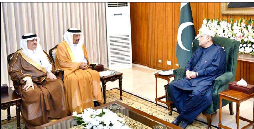
ISLAMABAD: A Saudi delegation led by Minister for Investment, Khalid bin Abdulaziz Al-Falih called on the President Asif Ali Zardari at Aiwan-e-Sadr.