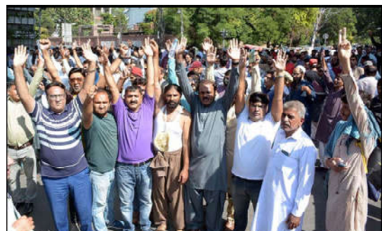
LAHORE: Members of All Pakistan Clerks Association (APCA) are holding protest demonstration against massive unemployment, increasing price of daily use products and inflation price hiking, at Civil Secretariat in Lahore.

honoring the top position holders of MDCAT 2024 organized by Khyber Medical University (KMU) Peshawar. He remarked that today's event is a clear testament to the provincial government's commitment to elevating the health sector to international standards. The introduction of British-level nursing training will significantly enhance the quality of nursing, fostering overall growth in this vital profession.