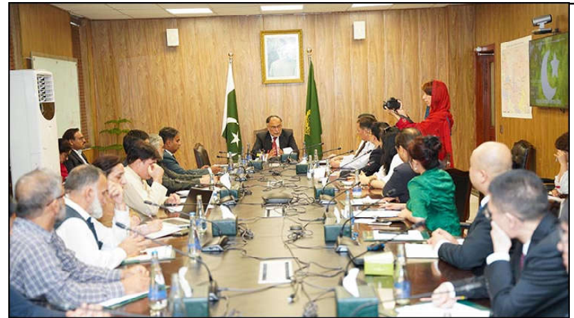
Federal Minister for Planning Development & Special Initiatives Ahsan Iqbal meeting with delegation from the China Asia Economic Development Association (CAEDA) here in Islamabad.