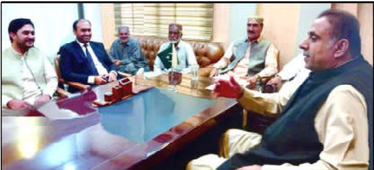
QUETTA: A delegation meeting with Provincial Minister for Communication and Works Mir Saleem Ahmed Khosa.

The meeting was attended by Minister for Petroleum Senator Masood Malik, Minister for Commerce Jam Kamal Khan, Minister for Privatization Abdul Aleem Khan, Minister for Interior Senator Syed Mohsin Raza Naqvi, Minister for Religious Affairs & Interfaith Harmony Chaudhry Salik Hussain and Senator Saleem Mandviwalla. Saudi Ambassador in Islamabad Nawaf Saeed Al Malki was also present in the meeting.