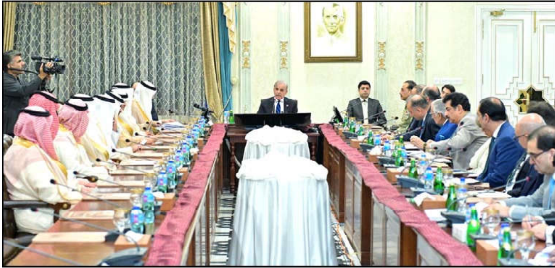
A delegation of the Kingdom of Saudi Arabia led by Investment Minister H. E. Mr Khalid Bin Abdul Aziz Al Falih called on Prime Minister Muhammad Shehbaz Sharif in Islamabad.

Ph: 2841470/2841473 Vol: XIX No. 222, Rabi-us-Sani 07, 1446 AH Friday October 11, Pages 04, Price Rs.15