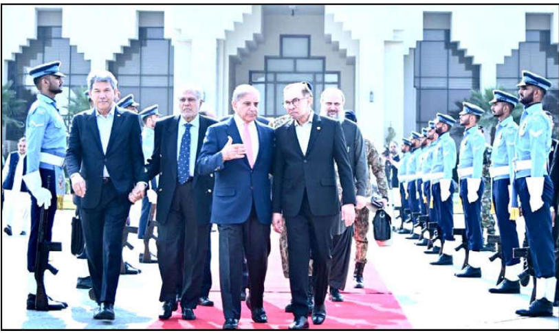
RAWALPINDI: Prime Minister, Muhammad Shehbaz Sharif bidding farewell to Prime Minister of Malaysia, Dato Seri Anwar Ibrahim before his departure at PAF Nur Khan Air Base in Rawalpindi.