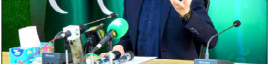
ISLAMABAD: Federal Minister for Information and Broadcasting Attaullah Tarar addressing a press conference.

Prime Minister Shehbaz Sharif had invited the Prime Minister of Malaysia to visit Pakistan on the occasion of the World Economic Forum in Riyadh. Tarar informed that Halal meat and rice exports from Pakistan to Malaysia will be increased and initially one hundred thousand tons of rice will be exported.