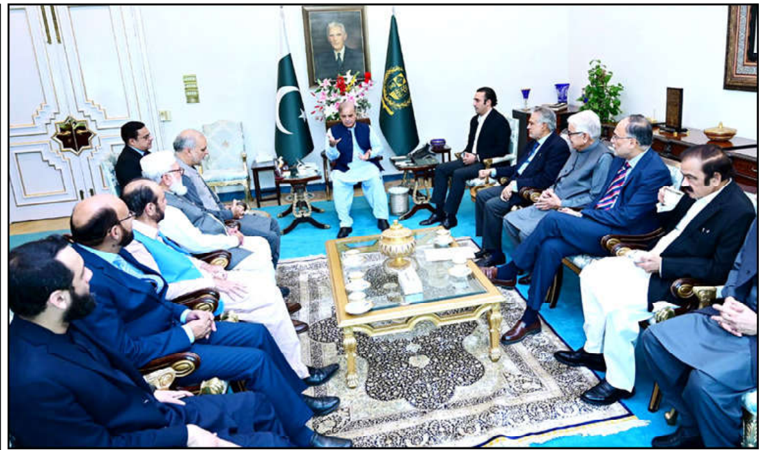
ISLAMABAD: Chairman Pakistan People's Party, Bilawal Bhutto Zardari and a delegation of Jamaat Islami led by Amir e Jamaat Islami Haafiz Naeem ur Rehman call on Prime Minister Muhammad Shehbaz Sharif.

The JI Ameer also lauded the prime minister's speech at the United Nations General Assembly for raising the issue of ongoing Israeli atrocities against Palestinians, and commended the walkout by the Pakistani delegation, led by the prime minister, at the start of the Israeli prime minister's speech.