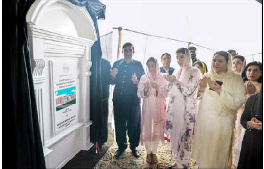
LAHORE: Punjab Chief Minister Maryam Nawaz Sharif offering Dua after inaugurating first Autism School in Pakistan.