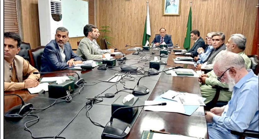
ISLAMABAD: Federal Minister for Planning, Development & Special Initiatives, Ahsan Iqbal, chairs a high-level review meeting to address the challenges hindering the development of Gwadar Port and the Free Zone.

He added that PTI is doing the politics of chaos and anarchy in the country.