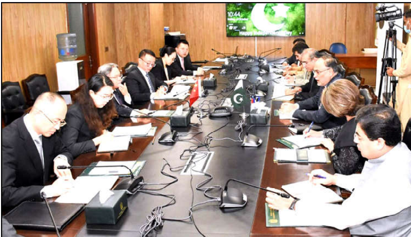
ISLAMABAD: Chinese Ambassador to Pakistan, Jiang Zaidong meets with Federal Minister for Planning, Development & Special Initiatives, Ahsan Iqbal ahead of the upcoming historic visit of Chinese Premier, Li Qiang.