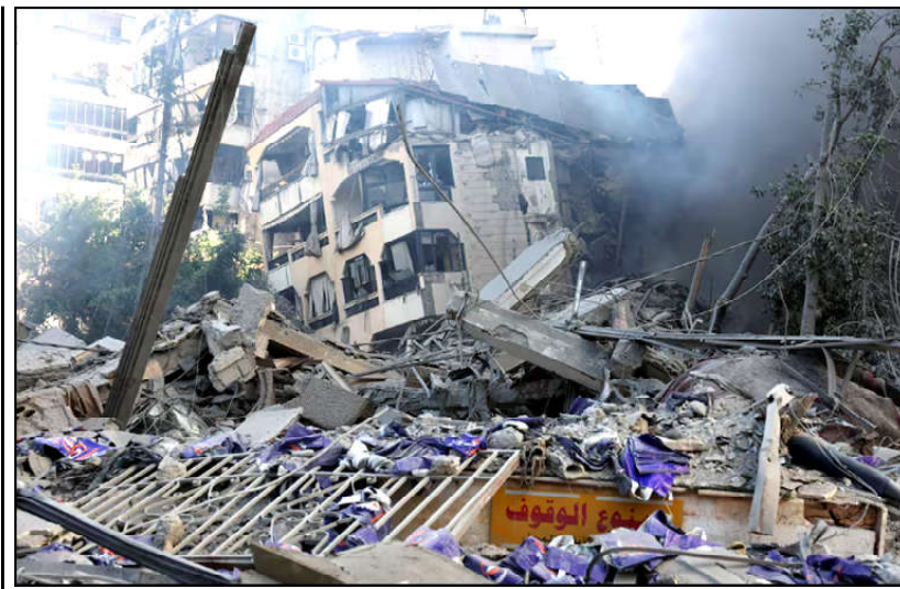
A view of damaged buildings and debris in the aftermath of a strike amid ongoing hostilities between Hezbollah and Israeli forces, in Beirut's southern suburbs, Lebanon.

repelled several land operations by Israeli troops, including with ambushes and in direct clashes. Lebanese security sources say Israeli troops have entered Lebanese territory and been pushed back several times in recent days, without setting up a permanent presence. Rocket sirens wailed constantly in northern Israeli towns, sending residents running for shelter, as Hezbollah kept up its cross-border fire. The Israeli military said it hit "targets belonging to Hezbollah's intelligence headquarters in Beirut", Lebanon's state-run National News Agency reported three air strikes on Beirut's southern suburbs, with a source close to Hezbollah telling AFP the target was an evacuated building that housed the group's media relations office.