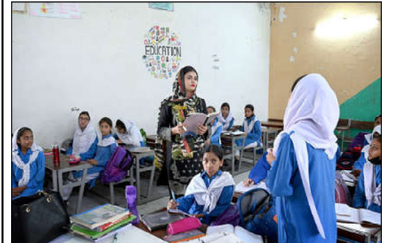
LAHORE: A teacher performing her duty at a local school as world celebrates the World Teacher's Day, also known as International Teachers Day.

Programme was the largest scholarship programme in the history of Pakistan under which the fee of 30,000 intelligent students of public and private universities would benefit. The minister said that the fee of the four-year BS degree programme of the intelligent students would be paid every year on behalf of Punjab Chief Minister Maryam Nawaz and every year new students would also be included in the scholarship scheme. He said that the eligibility criteria regarding family income range had been set with the monthly income of Rs300,000 to support upper middle class families in the scholarship programme.