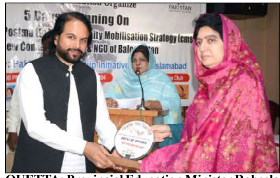
QUETTA: Provincial Education Minister Raheela Hameed Khan Durrani distributing shields among participants during concluding ceremony of Community Mobilisation Strategy training organized by Dara ul Amal Welfare Organization