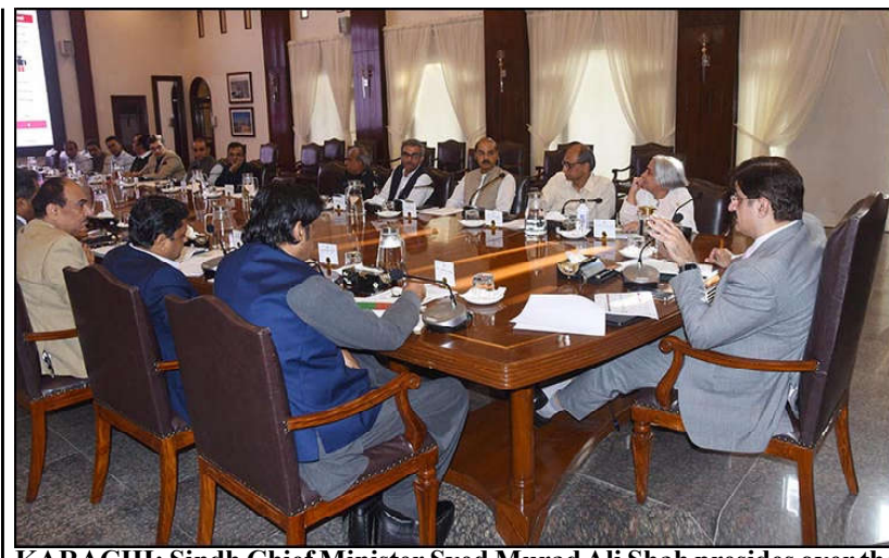
KARACHI: Sindh Chief Minister Syed Murad Ali Shah presides over the high level meeting to review anti-polio campaign.

PHC approves transit bail of CM KP till Oct 25 in two cases PESHAWAR (Online): Peshawar High Court (PHC) has approved transit bail of Chief Minister (CM) KP Ali Amin Gandapur in two cases till October 25. Transit bail plea of KP CM came up for hearing before Chief Justice (CJ) PHC Ishtiaq Ibrahim Friday. Alam Khan advocate counsel for the petitioner said CM KP Ali Amin Gandapur has filed petition for transit bail in high court.