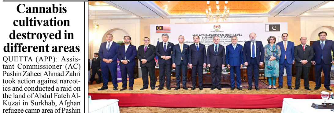
ISLAMABAD: Prime Minister Muhammad Shehbaz Sharif and Prime Minister of Malaysia YAB Dato' Seri Anwar Ibrahim in a group photo at Malaysia-Pakistan High Level Business Dialogue.