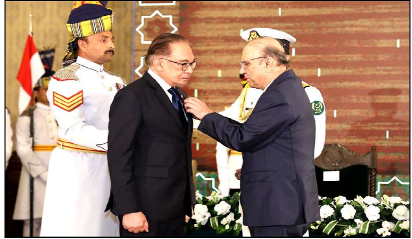
President Asif Ali Zardari conferring the award of Nishan-e-Pakistan upon the Prime Minister of Malaysia, Dato Seri Anwar Ibrahim, during a special investiture ceremony held at Aiwan-e-Sadr.

posed the option and said that the constitutional petitions had also been dealt with the reference. The matter of dealing with the constitutional petitions could not be sent to the President, he added. The chief justice said that if Article 63A was clear, then what was the need for its interpretation. Appeals of disqualified members also have to come to the Supreme Court, and if the court decision leads to disqualification, the appeal will be ineffective, he remarked. The Additional Attorney General said that the decision on Article 63A was full of contradictions. He said that on the one hand it said that vote was a fundamental right but at the same time this right was abolished on the direction of the party.