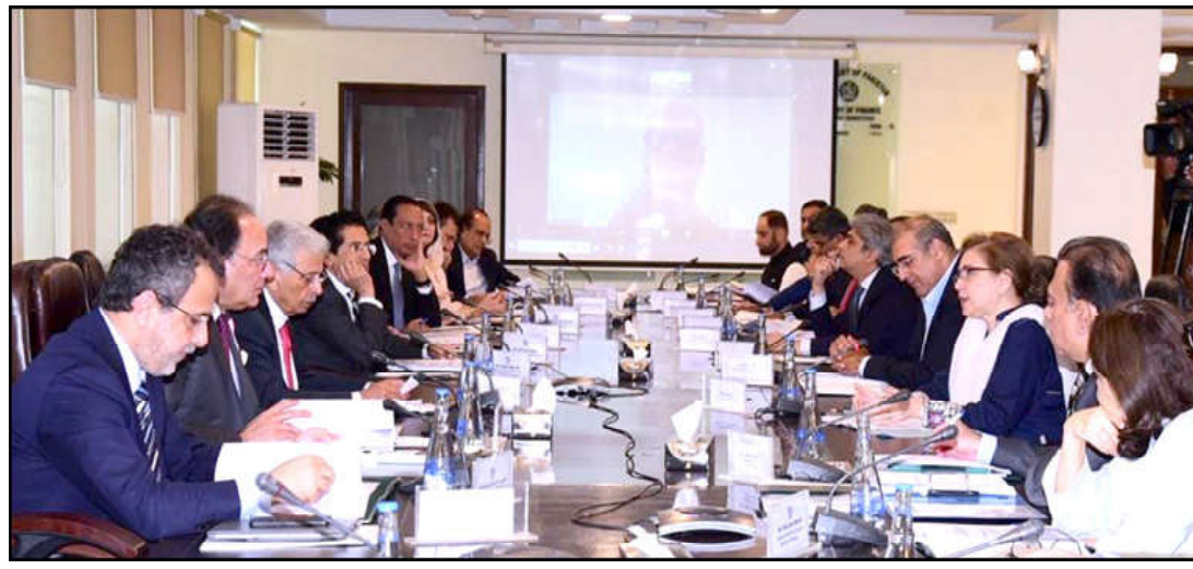
ISLAMABAD: Federal Minister for Finance and Revenue Senator Muhammad Aurangzeb chaired the meeting of the Economic Coordination Committee (ECC) at the Finance Division in Federal Capital.