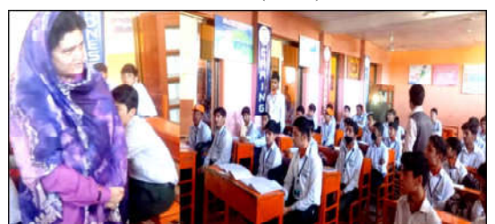
QUETTA: Provincial Education Minister Raheela Hameed Khan Durran inspecting class room during her visit to Sandeman School.