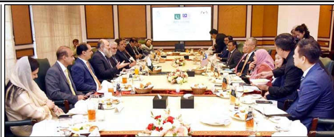
ISLAMABAD: Federal Minister for Commerce Jam Kamal Khan and his Malaysian counterpart Tengku Zafrul Aziz discuss strengthening trade, focusing on rice, halal meat exports, and business cooperation.