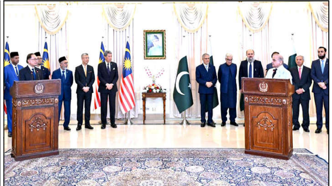
ISLAMABAD: Prime Minister Muhammad Shehbaz Sharif and the Prime Minister of Malaysia, Dato Seri Anwar Ibrahim address a joint press stakeout.

he said that thousands of Pakistani students were currently studying in Malaysia to help strengthen the people-to-people contacts. Prime Minister Shehbaz said that Malaysia's development should be emulated as a role model for all Muslim countries where foreign direct investment and exports were on the increase.