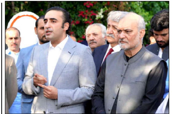
ISLAMABAD: Chairman Pakistan People's Party Bilawal Bhutto Zardari talking with media persons along with Chief of Jamaat-e-Islami Hafiz Naem Ur Rehman after a meeting at Zardari House, in the Federal Capital.