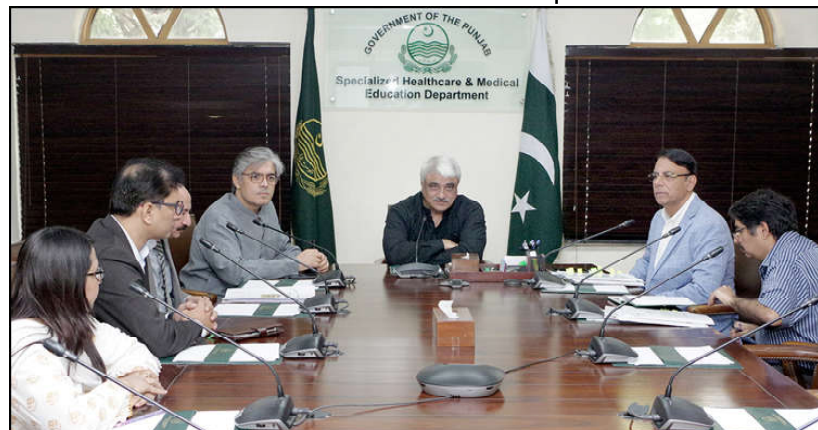
LAHORE: Punjab Minister for Health Khawaja Salman Rafique presides over the high level meeting regarding Chief Minister Children Heart Surgery Program at Specialized Healthcare & Medical Education Department.

He said that the fight against drug abuse requires the joint effort of teachers, parents and the wider society.