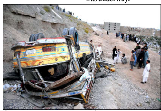
QUETTA: A large number of people are gathered after a bus fell into a ditch due to over speeding, near Hazara Graveyard located on Western Bypass in Quetta.

He said that each and every case diagnosed with poliovirus happens to be painful and matter of concern. The Chief Minister said that at the time when world is finding new avenues of development, we are not ridding of the poliovirus. He urged the parents to get their children administered the anti-polio drops voluntarily. Moreover, he directed to the Health Department and Emergency Operation Center for Polio Eradication to launch special anti-polio campaign in the province. He also directed to make the immunization campaign most effective.