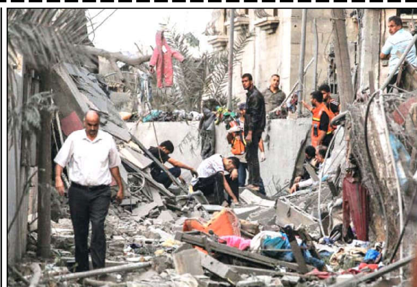
Palestinian rescuers and locals search the debris of a collapsed building in Khan Younis after an Israeli air strike.

Starting his first trip to Qatar as president, Pezeshkian said his country wanted "security and peace", but Israel had triggered an escalation by assassinating Hamas leader Ismail Haniyeh in Tehran.