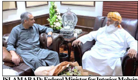
ISLAMABAD: Federal Minister for Interior Mohsin Naqvi meets with JUI-F Chief Maulana Fazal ur Rehman in Federal Capital.