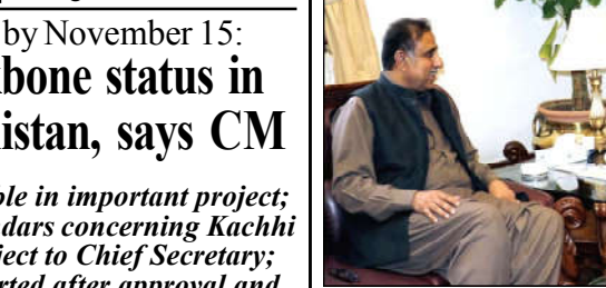
QUETTA: Provincial Minister Mir Saleem Ahmed Khosa meeting with Governor Balochistan Sheikh Jaffar Khan Mandokhail