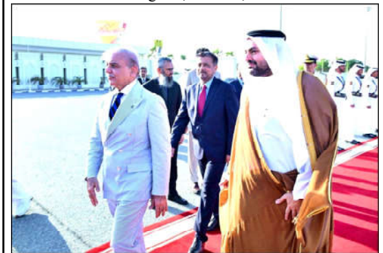
DOHA: Prime Minister Muhammad Shehbaz Sharif arrives at Doha International Airport for his 2 day official visit of Qatar. He is being received by Qatar's Minister of State, Muhammad bin Abdulaziz Al-Khulaifi.

"During this visit, I look forward to productive exchange of views with the Qatari leadership to further enhance our brotherly relations," Sharif said on X after arriving in Doha. "I will also inaugurate a special exhibition at Qatar Museum highlighting the cultural heritage of Pakistan." During his visit, the prime minister will hold bilateral meetings with Sheikh Tamim bin Hamad Al Thani, Amir of the State of Qatar and Mohammed bin Abdulrahman bin Jassim Al-Thani, Prime Minister.