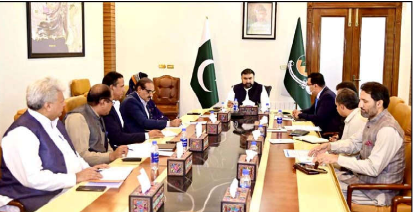
QUETTA: Balochistan Chief Minister Mir Sarfraz Bugti presides over the review meeting on the performance of the textbook board at the Chief Minister's Secretariat.

Justice Minallah has observed that if people think that those institutions, which are instituted to protect their rights.