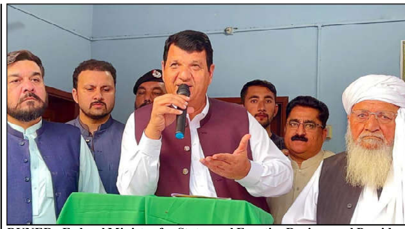
BUNER: Federal Minister for States and Frontier Regions and President PML-N KP, Engr Amir Muqam addressing Jirga Members in Buner.