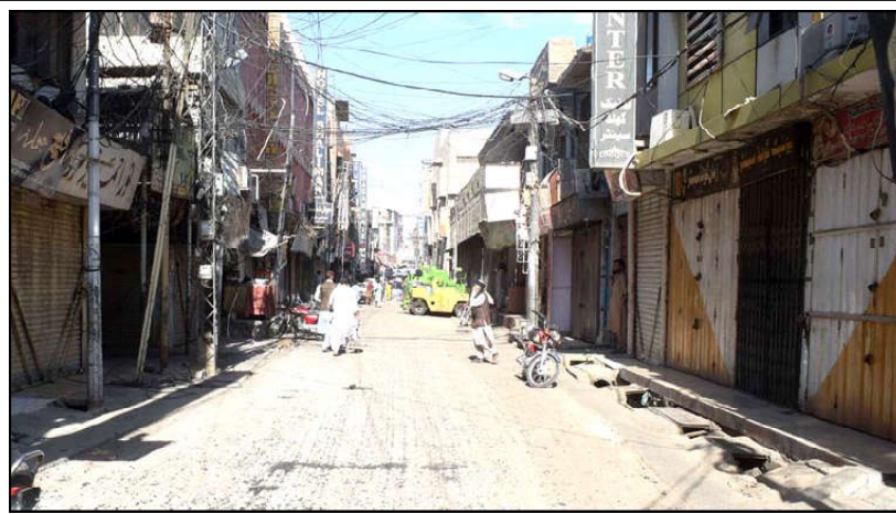
QUETTA: A view of closed shop during a shutter down strike call by Balochistan National Party.

Independent Report QUETTA: Another polio case has been reported from Balochistan increasing tally of cases of crippling disease to 22. The Emergency Operation Center for polio eradication sources said that the new polio case has been reported from Chaghai, which is the first one of the district during the current year. The sources said that the polio virus has been detected in a child belonging to Chaghai. It may be mentioned here that in all 21 cases of polio had already been reported in the province during current year. Out of the total polio cases, six were reported from Killa Abdullah and three from Quetta district.