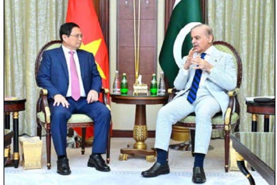
RIYADH: Prime Minister Muhammad Shehbaz Sharif meets Prime Minister Pham Minh Chinh of Vietnam on the sidelines of the 8th Future Investment Initiative (FII) Conference.

RIYADH (APP): Prime Minister Muhammad Shehbaz Sharif on Wednesday met with his Vietnamese counterpart Pham Minh Chinh and expressed Pakistan's desire to enhance its ties with Vietnam, while highlighting the immense potential of the two countries to enhance trade and investment cooperation. In the meeting held on the sidelines of the 8th Future Investment Initiative (FII) Conference, the two leaders discussed ways to strengthen bilateral relations, particularly in trade and investment. Prime Minister Shehbaz proposed an exchange of trade and business delegations between both countries to further explore these opportunities. The two leaders reaffirmed their commitment to strengthening people-to-people ties and promoting tourism between the two countries. Appreciating Vietnam's role in the ASEAN region, Prime Minister Shehbaz sought support for Pakistan's efforts to become a full dialogue partner of ASEAN. He also extended an invitation to the Vietnamese prime minister to undertake an official visit to Pakistan.