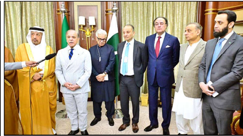
RIYADH: Prime Minister Muhammad Shehbaz Sharif, Minister for Investment of the Kingdom of Saudi Arabia Engineer Khalid bin Abdulaziz Al-Falih and Advisor at the Saudi Royal Court Mohammad Bin Mazaid Al-Tuwaijri in a joint press conference on the sidelines of the 8th Future Investment Initiative Conference.

serve as a catalyst for a prosperous and sustainable future. Accompanied by Advisor at the Royal Court Mohammad Mazaid Al-Tuwaijri, Saudi Minister Al Falih told the media that during his recent visit to Pakistan, both sides had signed 27 MoUs for investment worth $2.2 in Pakistan. He announced that following Prime Minister Shehbaz's meeting with Crown Prince and their discussion, the number of MoUs has been increased from 27 to 34 to add $600 million in investment.