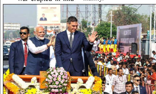
Spanish Prime Minister Pedro Sanchez with his Indian counterpart Narendra Modi waving to crowd in India's Gujarat.

UNITED NATIONS: Secretary-General Antonio Guterres appealed to the Security Council on Monday for its support to help protect civilians in war-torn Sudan, but said conditions are not right for deployment of a UN force. "The people of Sudan are living through a nightmare of violence — with thousands of civilians killed, and countless others facing unspeakable atrocities, including widespread rape and sexual assaults," Guterres told the 15-member council. War erupted in mid-April 2023 from a power struggle between the Sudanese army and the paramilitary Rapid Support Forces ahead of a planned transition to civilian rule, and triggered the world's largest displacement crisis. "Sudan is, once again, rapidly becoming a nightmare of mass ethnic violence," Guterres said, referring to a conflict in Sudan's Darfur region about 20 years ago that led to the International Criminal Court charging former Sudanese leaders with genocide and crimes against humanity.