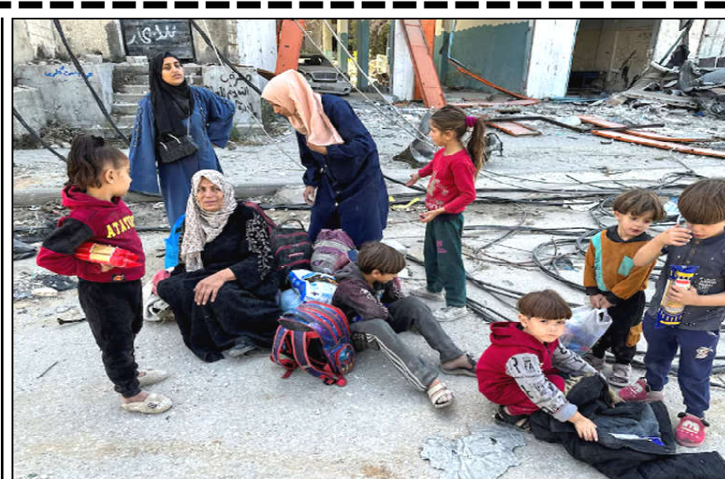
Displaced Palestinians ordered by the Israeli military to evacuate the northern part of Gaza take a rest as they flee amid an Israeli military operation, in Jabalia in the northern Gaza Strip.

JERUSALEM: Israel's air strikes "hit hard" Iran's defences and missile production, Prime Minister Benjamin Netanyahu said, but Iranian Supreme Leader Ayatollah Ali Khamenei said the damage from Saturday's attack should not be exaggerated. With warfare raging in Gaza and Lebanon, direct confrontation between Israel and Iran risks spiralling into a regional conflagration. But a day after the air strikes, there was no sign they would spark another round of escalation. However, heavy fighting in Lebanon between Israeli forces and Iran-backed Hezbollah, which sharply intensified over recent weeks, continued on Sunday with an Israeli airstrike killing eight people in a residential block in Sidon, medicals said. "The air force attacked throughout Iran. We hit hard Iran's defence capabilities and its ability to produce missiles that are aimed at us," Netanyahu said in a speech, calling the attack "precise and powerful" and saying it met all its objectives. The Islamic Republic has not signalled how it will respond to Saturday's long-anticipated strikes, which involved scores of fighter jets bombing targets near the capital Tehran and in the western provinces of