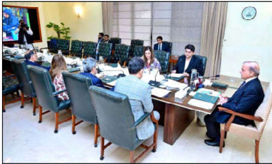
ISLAMABAD: Prime Minister Muhammad Shehbaz Sharif chairs a meeting on Polio Eradication.