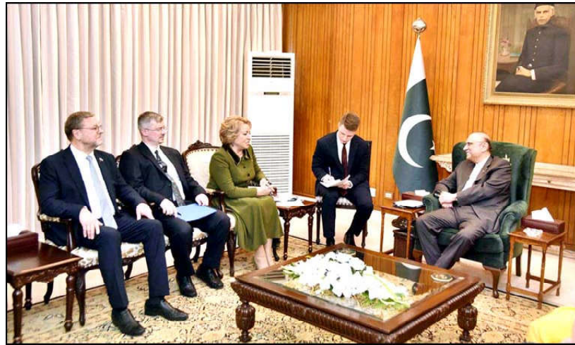
ISLAMABAD: The Russian Parliamentary delegation, led by the Speaker of the Russian Federation Council, Ms. Valentina Matvienko, at Aiwan-e-Sadr.

He stressed that we need to improve our water and sanitation system in this regard.