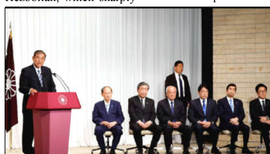
Japanese Prime Minister and leader of the ruling Liberal Democratic Party (LDP) Shigeru Ishiba speaks next to LDP lawmakers during a press conference a day after Japan's lower house election, at the party's headquarters in Tokyo, Japan.

BRUSSELS: NATO on Monday confirmed that North Korean troops have been sent to Russia to aid in its almost three-year war against Ukraine and that some have already been deployed in Russia's Kursk border region, where Russia has been struggling to push back a Ukrainian incursion. "Today, I can confirm that North Korean troops have been sent to Russia, and that North Korean military units have been deployed to the Kursk region," NATO Secretary-General Mark Rutte told reporters. Rutte said that the move represents "a significant escalation" in North Korea's involvement in the conflict and marks "a dangerous expansion of Russia's war." His remarks came after a high-level South Korean delegation including top intelligence and military officials as well as senior diplomats briefed the alliance's 32 national ambassadors at NATO headquarters in Brussels. Rutte said NATO is "actively consulting within the alliance, with Ukraine, and with our Indo-Pacific partners," on developments and that he is due to talk soon with South Korea's president and Ukraine's defense minister. "We continue to monitor the situation closely," he said.