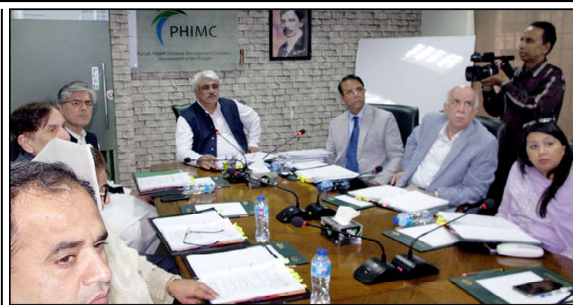
LAHORE: Punjab Minister for Health Khawaja Salman Rafique presides over the 87th Board of Directors meeting at Punjab Health Initiative Management Company.

PESHAWAR (APP): Khyber Pakhtunkhwa Chief Minister Ali Amin Gandapur on Monday directed the Revenue department to issue electronic Property Cards to citizens of merged district as soon as possible so that they could easily access their land records using mobile application. Presiding over a meeting of Board of Revenue here, he said that issuance of electronic Property Card was an important initiative of the provincial government in relation to revenue reforms, adding that the provincial government was implementing effective use of information and communication technology for land record reforms. He said that the Card would bring transparency in all matters of land records and would help end disputes related to property ownership in addition to the provision of various facilities. Earlier, the CM was informed during briefing that the Property Card would act as an e-passbook enabling the citizens to easily access all their land