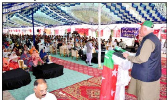
QUETTA: National Party (NP) Chief, Dr. Abdul Malik Baloch addresses during 7th National Congress and Balochistan Wahdat Convention held in Quetta.