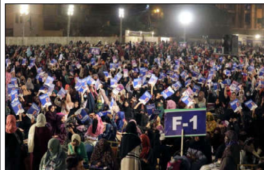
KARACHI: A large number of students gather to attend Aptitude Test Examination ceremony of the IT courses program under "Bano Qabil Mega Project 4.0" organized by Al-Khidmat Foundation, held at North Karachi Hockey Stadium in Karachi.