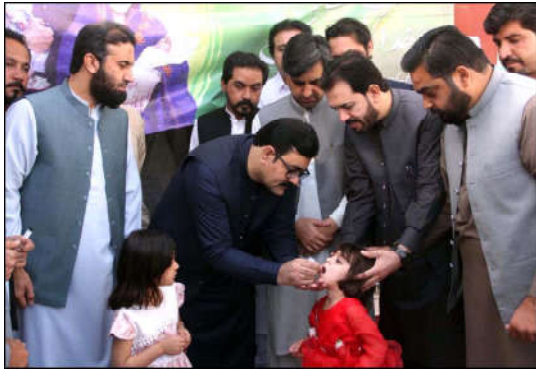
QUETTA: Balochistan Minister for Health, Bakht Muhammad Kakar administers polio drops to child during the launching ceremony of Polio Eradication Campaign in Quetta.