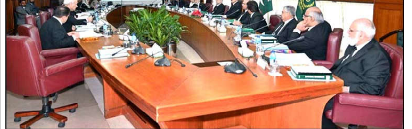
ISLAMABAD: The Hon'ble Chief Justice of Pakistan Justice Yahya Afridi presides over Full Court meeting at Supreme Court of Pakistan.

Reviewing the case Management Plan, the judges discussed a range of strategies to achieve the plan's targets. Criminal and civil cases, as detailed in the