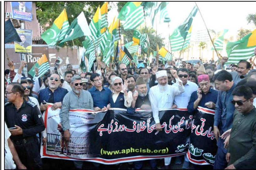
KARACHI: Participants of the All Parties Hurriyat Conference participate in rally and chant slogans against Indian atrocities in IIOJK on Kashmir Black Day.

of over 900,000 Indian troops in occupied Kashmir and the imposition of oppressive black laws. In a tribute to the martyrs of Kashmir, the assembly expressed respect for their sacrifice and called upon the international community to take notice of these HR violations and atrocities. It urged India to revoke its illegal actions taken on August 5, 2019 and reaffirmed the need for the Kashmiris to be allowed to determine their future in accordance with United Nations Security Council resolutions.