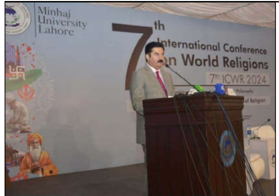
LAHORE: Governor Khyber Pakhtunkhwa Faisal Karim Kundi addressing 7th International Conference on World Religions at Minhaj University.

Highlighting the strategic significance of KP, which shares a border with Afghanistan, he noted that while two global powers have attempted to control the region, neither succeeded. He acknowledged the province's ongoing struggle against extremism and terrorism and expressed his desire to organize a similar conference in Khyber Pakhtunkhwa to engage the local community in promoting peace. In a media briefed later, Kundi underscored the critical role of the judicial system, stating that an improved justice system could address many societal issues — an objective in line with the Pakistan People's Party's vision. He reiterated the government's commitment to overcoming political differences to ensure peace and progress in Khyber Pakhtunkhwa. He also pledged support for initiatives aimed at providing employment for the youth and endorsed any efforts that promote positive development in the region.