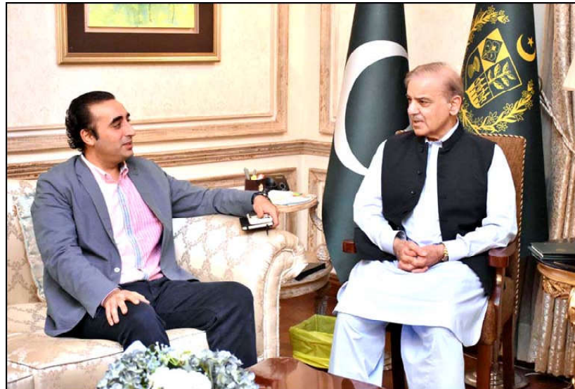
LAHORE: A delegation of Pakistan People's Party led by Chairman Bilawal Bhutto Zardari calls on Prime Minister Muhammad Shehbaz Sharif.

NA Speaker Ayaz Sadiq, Governor Punjab Saleem Haider, Rana Sanaullah Khan, Maryam Aurangzeb, Azam Nazeer Tarar and Raja Pervez Ashraf were also present on the occasion.