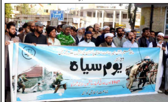
QUETTA: Activists of Jamat-e-Islami (JI) are holding rally to express solidarity with Kashmiri people and condemn brutality of Indian Army in Kashmir on the occasion of Black Day of Kashmir, in Quetta.

The president, in a statement, commended the bravery of security forces for conducting successful operations against Khawarij terrorists.