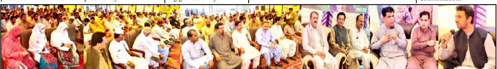
KHARAN: Provincial Finance Minister Mir Shoaib Noshervani listening the problems of the people during open katchery.

Oct 27, 1948. Participants in the rally were adorned their bicycles with the national green and white flags and wore black armband to mark the day in support of the victims of violence of Indian troops in occupied valley.