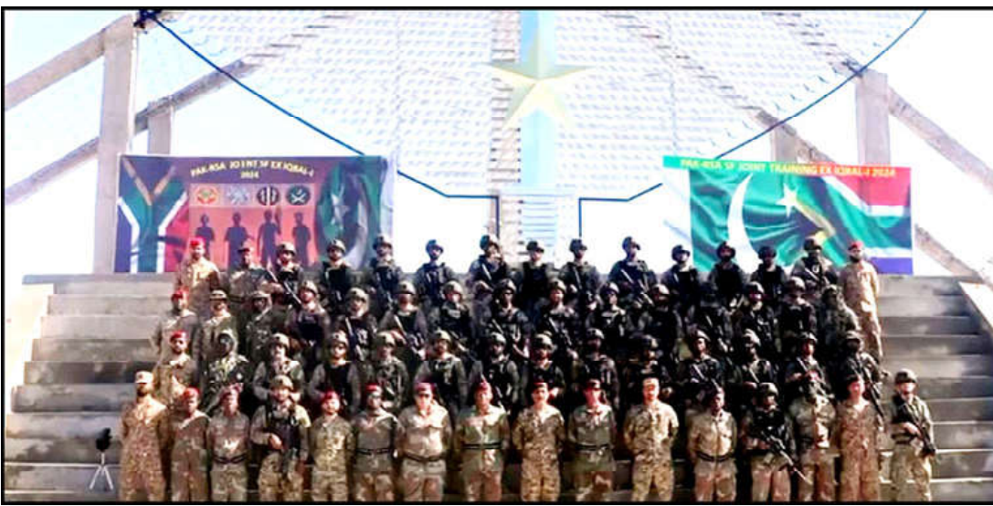
RAWALPINDI: The Combat Teams from Special Services Group, Pakistan Army and Republic of South Africa Special Forces in a group photo during closing ceremony of Pakistan-South Africa Joint Exercise Iqbal-I.