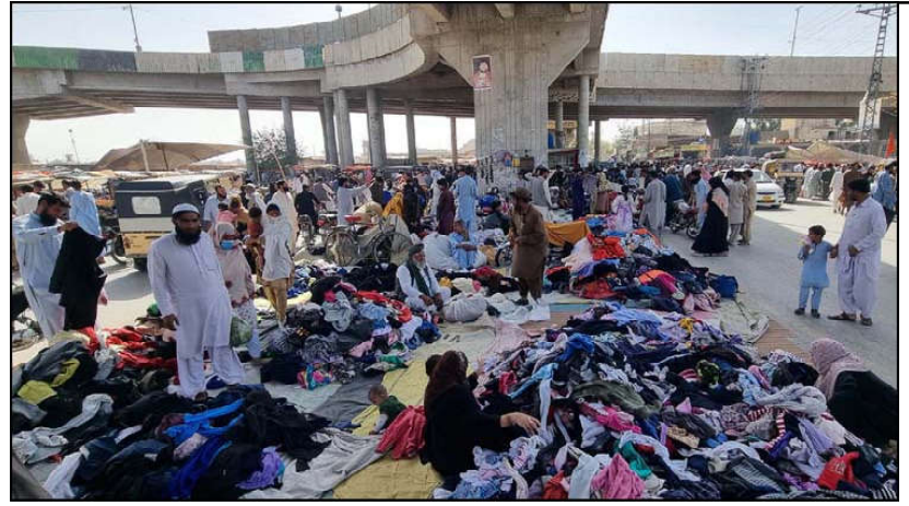
QUETTA: Warm clothes are being selling at a roadside stall as the demand of warm clothes increased in city on the arrival of winter season, at a weekly bazar in Quetta.