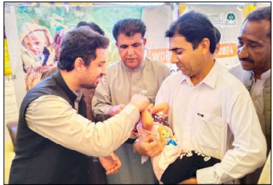
KHARAN: Provincial Finance Minister Mir Shoaib Noshervani inaugurates anti-polio campaign in Balochistan by administering polio drops to child.

He expressed the hope that the current IMF programme would be the last programme. "Our foreign reserves have increased to $11 billion.