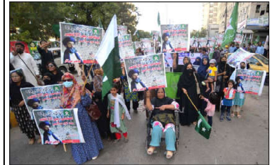
KARACHI: Members of religious organization are holding rally to express solidarity with Kashmiri people and condemn brutality of Indian Army in Kashmir on the occasion of Black Day of Kashmir, at Karachi press club.

LAHORE (APP): Senior Provincial Minister Marriyum Aurangzeb said on Sunday that following Chief Minister Maryam Nawaz Sharif's directives, the Environment Protection Department's squads have demolished four industrial units in Lahore for contributing to pollution. These factories had repeatedly ignored notices to install emission control systems. Additionally, 941 vehicles were inspected, with fines issued to 234 smoke-emitting vehicles, 72 vehicles impounded, and total fines amounting to 503,000 rupees. In other actions, six kilns in Layyah, one in Sheikhupura, and four in Rawalpindi were shut down for failing to convert to zigzag technology. Marriyum Aurangzeb stated that Chief Minister Maryam Nawaz Sharif had directed the Environment Protection Department to act against smog without any compromise. She urged Lahore's residents to actively support the anti-smog action plan and avoid contributing to pollution.