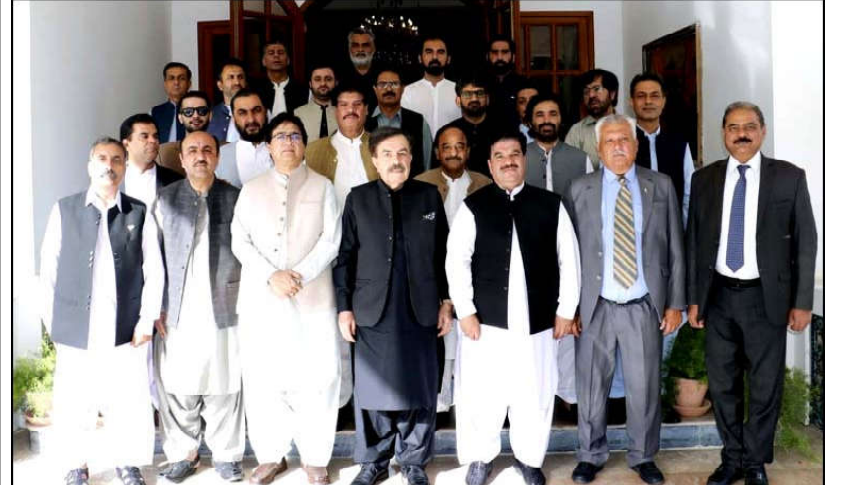
QUETTA: Balochistan Governor Jaffar Khan Mandokhail in a group photo with PML-N Balochistan Lawyers Wing.