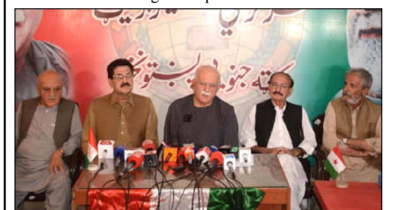
QUETTA: Chairman PkMAP Mahmood Khan Achakzai addressing a Press Conference.

He said October 27 marked a somber turning point in the history of Jammu and Kashmir. On this day, seventy-seven years ago, the Indian forces landed in Srinagar, marking the beginning of a prolonged and painful chapter for the region. Over the past seven decades, India has employed various strategies to strengthen its control over Indian Illegally Occupied Jammu and Kashmir (IIOJK), he added. However, since August 5, 2019, they had witnessed an accelerated effort to undermine the internationally recognized disputed status of IIOJK.