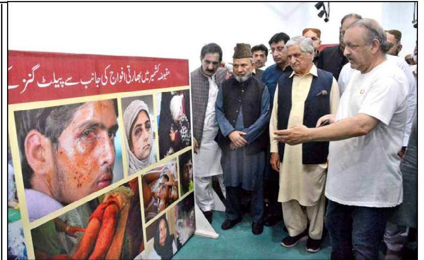
KARACHI: The former President and Prime Minister of Azad Jammu and Kashmir (AJK) Sardar Mohammed Yaqoob Khan with other participants viewing pictorial exhibition on the occasion of Kashmir Black Day at Arts Council of Pakistan.