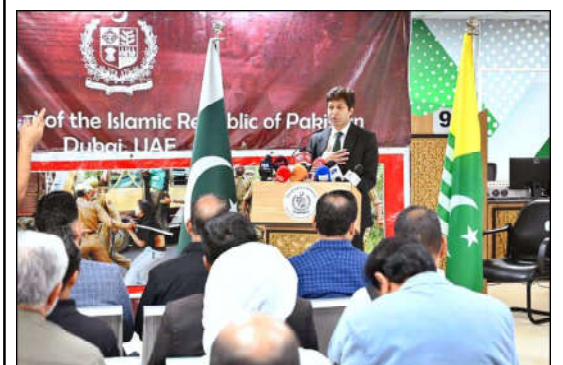
DUBAI: H.E. Hussain Muhammad, Consul General speaks during an event arranged to observe 27th October Kashmir Black Day at the Consulate General of Pakistan.

ISLAMABAD (APP): Federal Minister for Commerce Jam Kamal Khan on Sunday reiterated Pakistan's steadfast commitment to the Kashmiris' cause, emphasizing the nation's dedication to advocating for the freedom, dignity, and justice of the Kashmiri people. As the country stands united with the people of Kashmir, honoring their sacrifices and supporting their rightful pursuit of peace, said a news release. "We observe Black Day, marking the beginning of a decades-long struggle faced by the people of Jammu and Kashmir since 27th October 1947", the minister said. This solemn day serves as a reminder of the injustices endured by the Kashmiri people and their unwavering determination to secure their right to self-determination.