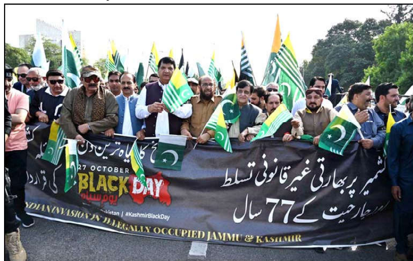
ISLAMABAD: Minister for Kashmir Affairs Engineer Amir Maqam leading a rally on the occasion of Kashmir Black Day to express solidarity with the people of Indian Illegally Occupied Jammu and Kashmir.

"India's hope to bury this issue is a false dream. The struggle for freedom will continue until Kashmiris are granted their rightful autonomy," he added.