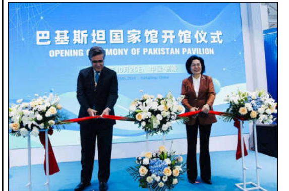
Ambassador of Pakistan to China H.E. Mr. Khalil Hashmi inaugurated Pakistan Pavilion at 31st China Yangling Agricultural Hi-Tech Fair.

The sector also played a significant role in employment, supporting 631,000 jobs in 2023, equivalent to one in five jobs in Dubai. With projected growth, an additional 185,000 jobs will be created by 2030, bringing the total to 816,000 jobs.