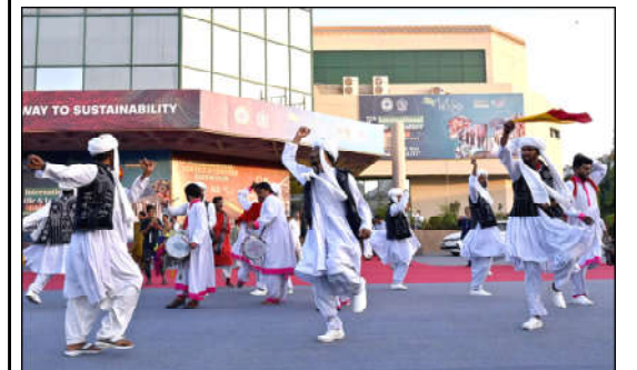
KARACHI: Artists perform traditional folk dances on the closing day of the 5th International Textile and Leather Exhibition, TEXPO 2024, at the Expo Center.

Ghulam Muhammad Safi emphasized on highlighting the long-standing dispute of Kashmir at the global level, saying that India is committing serious violations of human rights in Kashmir, which cannot be ignored anymore and will be raised on international forums. Safi highlighted the difficulties faced by the people of IIOJK, saying that the voice should be raised for the rights of Kashmiris not only in Azad Jammu and Kashmir but in the whole world.