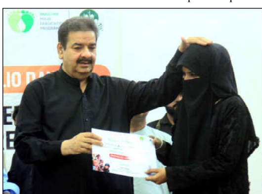
HUB: Advisor to Chief Minister Balochistan on Commerce and Industry, Mir Ali Hassan Zehri presenting certificate to frontline polio worker during ceremony on the eve of World Polio Day, in Hub.

It said that lasting peace and stability in South Asia are contingent upon the final resolution of the Kashmir dispute, in accordance with United Nations Security Council resolutions and the aspirations of the Kashmiri people. The House reiterated its rejection of India’s continued efforts to change the internationally recognized status of India’s illegally occupied Jammu and Kashmir, its demographic structure, and its political landscape. The resolution also condemned the prolonged detention of thousands of political activists and the banning of several Kashmiri political parties.