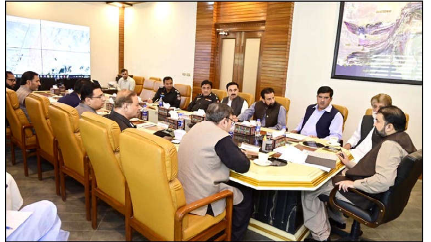
QUETTA: Chief Minister Balochistan Mir Sarfaraz presiding over a meeting regarding anti-encroachment and operation against land grabbers across the province

The minister acknowledged the historical context of the ANF, which was first established in 1957 and reconstituted in the 1970s, and highlighted its global reputation as an effective anti-narcotics force.