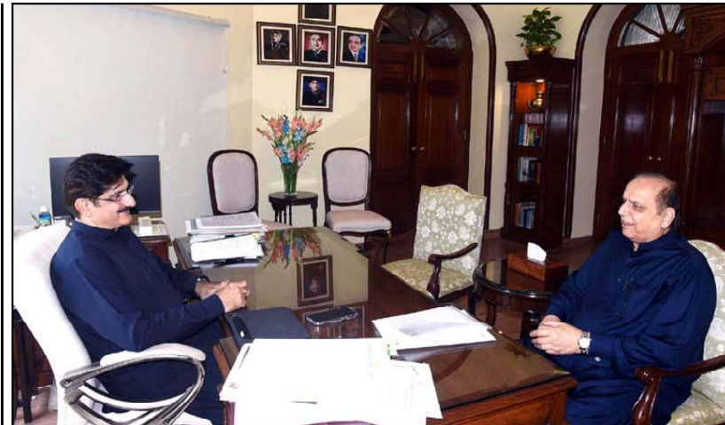
KARACHI: Sindh Chief Minister, Syed Murad Ali Shah exchanging views with Imtiaz Ahmed Shaikh, Member of Provincial Assembly (MPA) during meeting held at CM House in Karachi.

initiative, the fund for purchasing homes for the families of martyred constables and head constables has been increased by Rs. 5 million, bringing the total to Rs. 18.5 million. Similarly, families of martyred ASIs and sub-inspectors will now receive a total of Rs. 24.5 million, reflecting an increase of Rs. 7 million. For the families of martyred inspectors and DSPs, the fund has been increased by Rs. 10