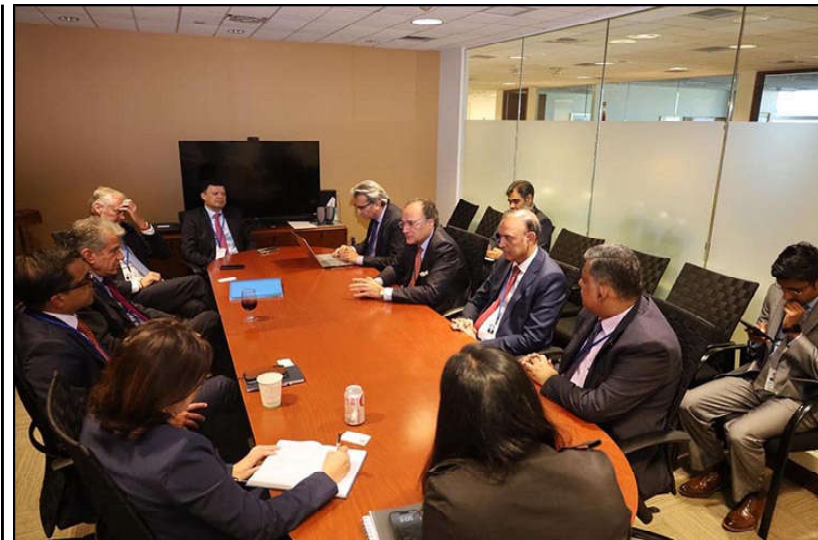
WASHINGTON DC: Federal Minister for Finance and Revenue Senator Muhammad Aurangzeb, accompanied by Governor SBP, held a meeting with the lead team of JP Morgan Bank.

The exchange rate of the Emirates Dirham and the Saudi Riyal decreased by 05 paise and 07 paise to close at Rs 75.59 and Rs73.91 respectively.