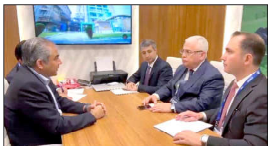
ISTANBUL: Federal Minister for Interior Mohsin Naqvi in a meeting with Azerbaijan's Minister of State for Interior Aliyev Ismat Rashid in Istanbul.

COAS expressed his satisfaction over the combat readiness of Pakistan Air Force and the progress made through various modernization and up-gradation programs. Later, he witnessed exercise operations, static display of various niche and disruptive technologies where he was briefed on the modernization efforts of Pakistan Air Force to stay abreast with contemporary security challenges which was later followed by an enthralling aerial display by PAF fighter jets. COAS also interacted with the aircrew and appreciated the resolve of PAF personnel to safeguard the aerial frontiers of Pakistan. He emphasized on the critical role of inter-service collaboration, which he believes is essential for achieving operational success.