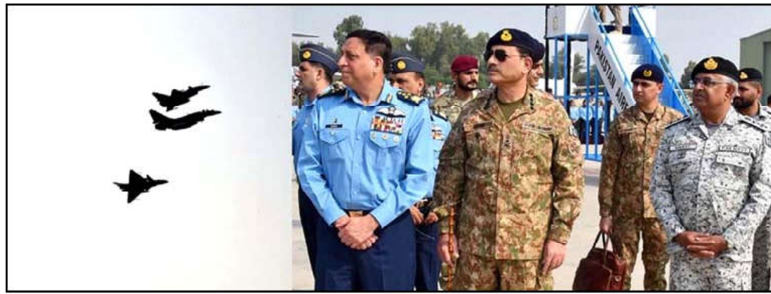
RAWALPINDI: Chief of Army Staff (COAS), General Syed Asim Munir witness the ongoing Multinational Exercise Indus Shield-2024, at an operational Air Base of Pakistan Air Force (PAF).

One of the key points of discussion was the Pakistan Navy's recent successful operation in the Northern Arabian Sea, which resulted in the seizure of over 2,400 kilograms of narcotics worth an estimated $145 million. Minister Aliyev praised the Pakistan Navy's swift action and commended the effective leadership of Minister Naqvi in guiding the nation's anti-narcotics efforts. He acknowledged Pakistan's critical role in combating drug trafficking in the region and highlighted how such operations are crucial for regional stability.