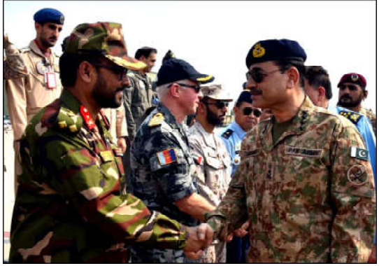
RAWALPINDI: Chief of Army Staff (COAS), General Syed Asim Munir interacts with aircrew during the Multinational Exercise Indus Shield-2024, at an operational Air Base of Pakistan Air Force (PAF).

She called upon the international community to press Israel to cease all aggressive actions against UNIFIL immediately and forthwith cease.