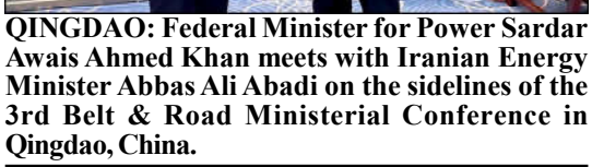
QINGDAO: Federal Minister for Power Sardar Awais Ahmed Khan meets with Iranian Energy Minister Abbas Ali Abadi on the sidelines of the 3rd Belt & Road Ministerial Conference in Qingdao, China.

In their letter, the lawmakers belonging to the Democratic party urged President Biden to prioritize human rights in the US policy towards Pakistan. "We write today to urge you to use the United States' substantial leverage with Pakistan's government to secure the release of political prisoners including former Prime Minister Khan and curtail widespread human rights abuses," they wrote.