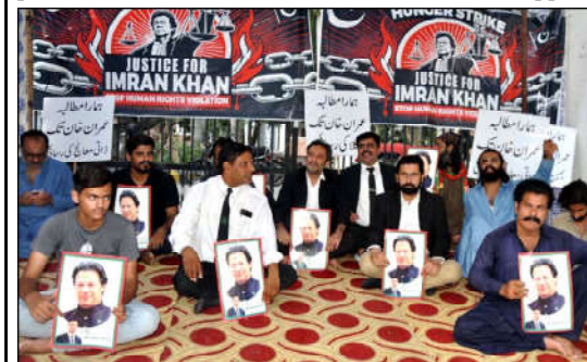
HYDERABAD: Members of Tehreek-e-Insaf (PTI) Lawyers Wing are holding protest demonstration for release of PTI Founder Imran Khan, outside Civil Court in Hyderabad.

He expressed gratitude to Prime Minister Shehbaz Sharif, PPP Chairman Bilawal Bhutto Zardari, and the Federal Minister and Chairman of WAPDA for their support.