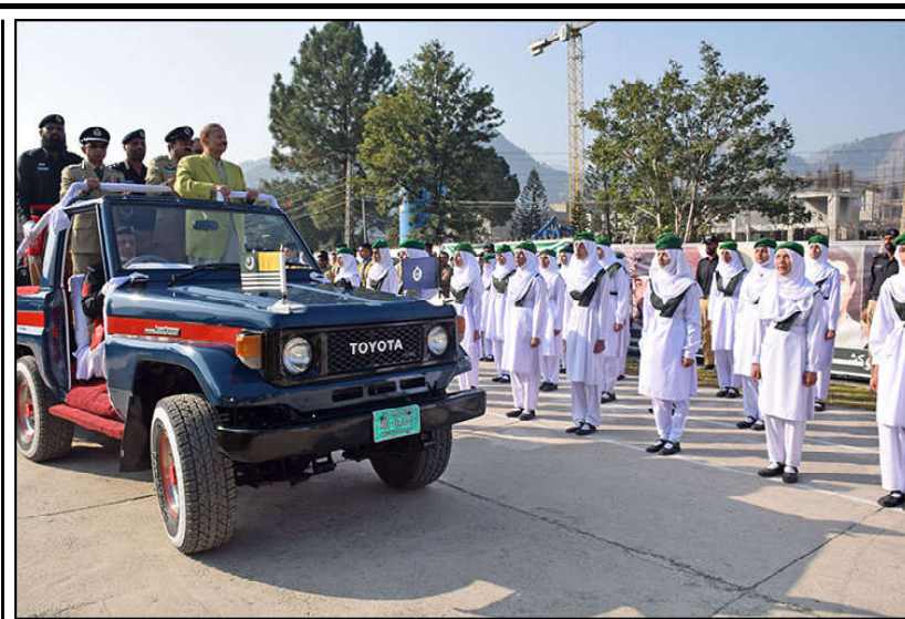
MUZAFFARABAD: President Azad Kashmir, Barrister Sultan Mahmood Chaudhry inspecting the parade on the occasion of the 77th foundation day of Azad Kashmir.

He informed that acting on a tip-off, ANF team conducted a raid near the Motorway Interchange, Balkasar and foiled a drug smuggling attempt from Khyber-Pakhtunkhwa to Punjab.