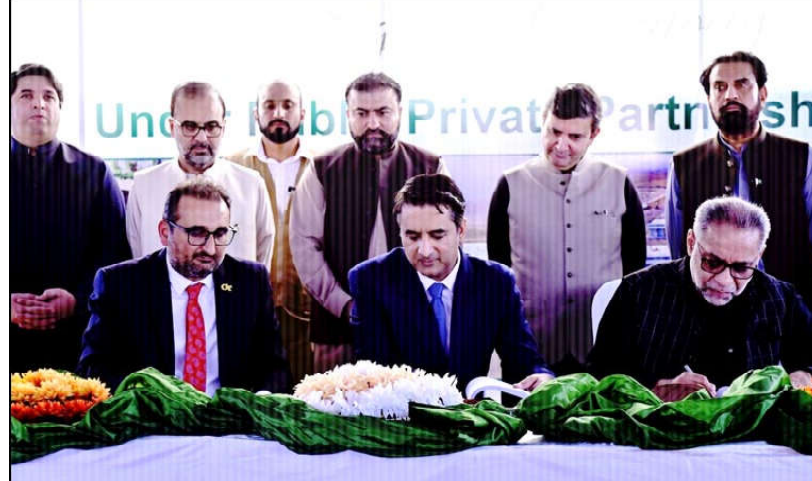
QUETTA: Balochistan Chief Minister, Mir Sarfaraz Bugti along with others witnesses MoU signing agreement during signing ceremony of four projects run under Public Private Partnership, held in Quetta.

sioner (Sariab) Mariyah Shmeoun ordered the closure of all mini petrol pumps at Hazarganj Truck Adda and issued stern warnings, cautioning that no pumps will be allowed in high-trafficked areas. Those who reopen pumps in such areas will face severe consequences. This action is part of the administration's efforts to protect citizens and maintain order in Quetta.