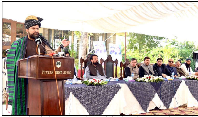
PISHIN: Chief Minister Balochistan Mir Sarfaraz Ahmed Bugti addressing participants of inaugural ceremony of shifting of agriculture tubewells on solar energy.

The condition of personal hygiene of factory employees was poor and fitness certificate masks, head covers etc. were also not available, he said.