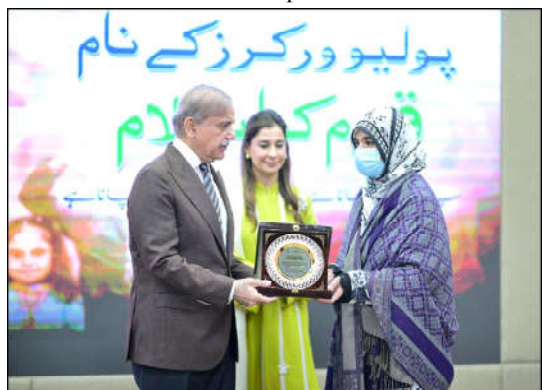
ISLAMABAD: Prime Minister Muhammad Shehbaz Sharif presenting souvenirs to front line Polio Workers and the relatives of those Polio Workers who embraced martyrdom in the line of duty.

"With this commitment, we will meet success and polio will be pushed out of the country and will never be allowed to resurface," he resolved, and also appreciated the Saudi government's support.