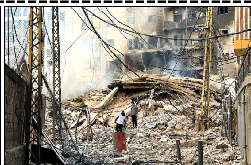
Men walk on the rubble at a site damaged in the aftermath of Israeli strikes on Beirut's southern suburbs, amid the ongoing hostilities between Hezbollah and Israeli forces, Lebanon.