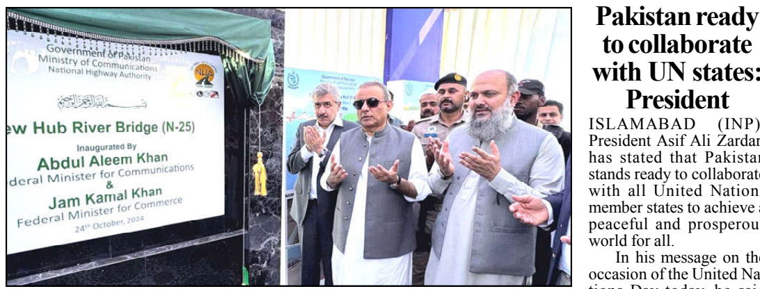
Federal Minister for Board of Investment, Privatization & Communications Abdul Aleem Khan and Federal Minister for Commerce Jam Kamal Khan inaugurating the Hub River Bridge (N-25).