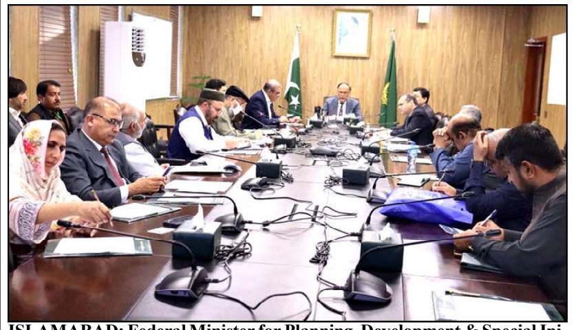
ISLAMABAD: Federal Minister for Planning, Development & Special Initiatives, Ahsan Iqbal, chairing a meeting of the Prime Minister's Committee for Planning and Execution of Foreign-Funded Development Projects in Federal Capital.

The prime minister, in a social media post on X, called the UN Day an occasion to recommit to the principles and objectives of the UN Charter, which provided the basis for a peaceful, and prosperous world.