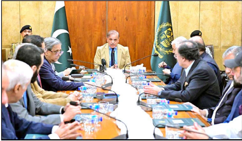
ISLAMABAD: Prime Minister Muhammad Shehbaz Sharif chairs a meeting of the Federal Cabinet.

Ph: 2841470/2841473 Vol: XX No. 96, Rabi-us-Sani 17, 1446 AH Monday October 21, 2024, Pages 04, Price Rs.15