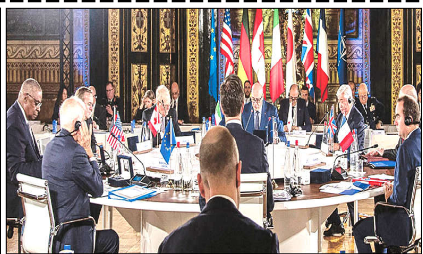
Italy's Defence Minister Guido Crosetto speaks during a roundtable, part of the G7 Defence Ministers Summit, in Naples.

and the Hezbollah militant group in Lebanon, where a year of escalating tensions boiled over into all-out war last month. Israel sent ground troops into Lebanon at the start of October. The Lebanese army said three of its soldiers were killed in an Israeli strike on their vehicle in southern Lebanon. There was no immediate comment from the Israeli military on Sunday's strike. Lebanon's army has largely kept to the sidelines in the war between Israel and the Hezbollah. The military is a respected institution in Lebanon but is not powerful enough to impose its will on Hezbollah or defend the country from an Israeli invasion. On Saturday, a drone targeted Israeli Prime Minister Benjamin Netanyahu's house, causing no casualties. It wasn't clear if the house was hit. The military said Hezbollah fired around 160 projectiles into Israel on Sunday.