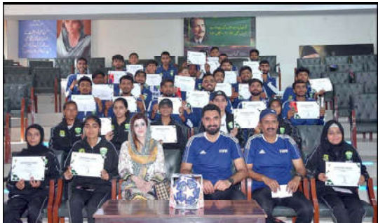
SIALKOT: A group photo of participants of the first ever Referee Refresh and Talent Hunt Course in Sialkot Organizers by FIFA and District Football Association.