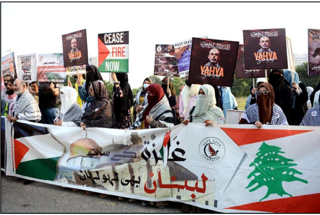
ISLAMABAD: Activists of Save Gaza hold placard during the protest in support of the oppressed and resistance in Gaza outside the National Press Club.