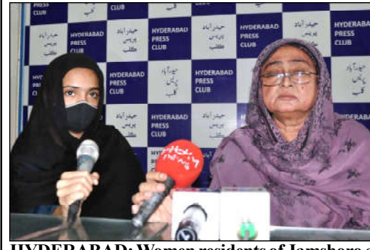
HYDERABAD: Women residents of Jamshoro are holding press conference for acceptance of their demands, held at Hyderabad press club.