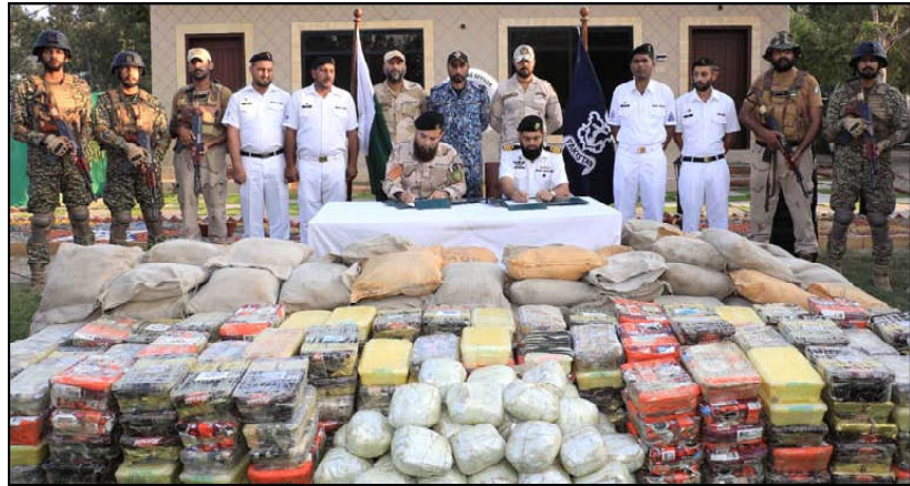
Pakistan Navy officials handing over the seized Narcotics to ANF officials at Gwadar.