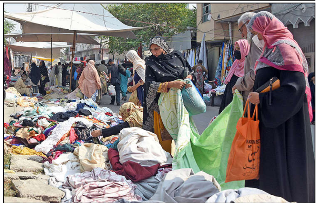
RAWALPINDI: People selecting and purchasing second hand warm clothes on the beginning of winter season at Landa Bazar in Sunday weekly Bazaar Committee chowk area, in the city.

He said S. Jaishankar extended a symbolic hand of cooperation to Pakistan, signaling a potential thaw in the long-strained bilateral ties between the two nuclear-armed neighbors. Relations between both countries have been tense for decades, marked by territorial disputes, particularly over Kashmir, and intermittent armed conflict. However, the Indian participation in SCO provides an opportunity for constructive dialogue. His interaction with Prime Minister Shehbaz Sharif and others is good omen.