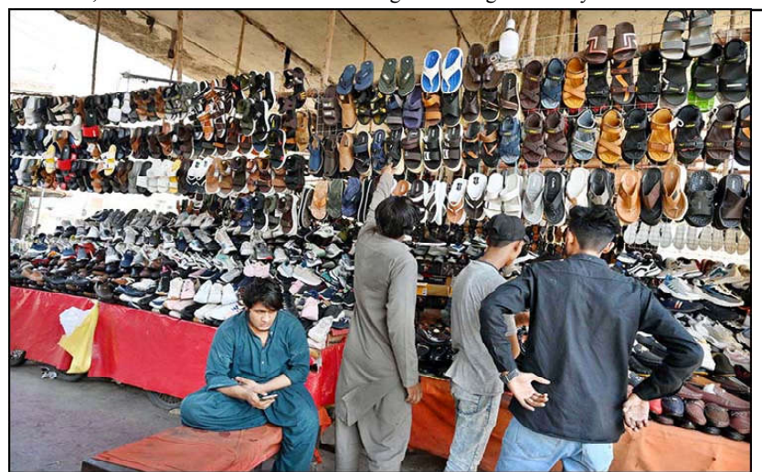
HYDERABAD: People selecting and purchasing shoes from setup under the shade of Makki Shah Flyover.