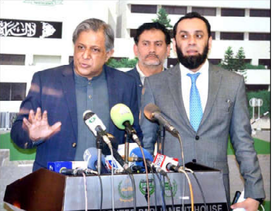
ISLAMABAD: Federal Minister for Law and Justice Senator Azam Nazeer Tarar and Federal Minister for Information and Broadcasting Ataulah Tarar holding a joint Media talk.

ISLAMABAD (Online): The Federal Cabinet has approved the proposed draft of the 26th constitutional amendment of the coalition parties including the Pakistan People's Party. According to a statement issued by Prime Minister Office, the Federal cabinet meeting was held under the chairmanship of Prime Minister Muhammad Shehbaz Sharif, in which the Minister of Law and Justice again gave a detailed briefing on the 26th constitutional amendment. The federal cabinet has approved the proposed draft of the 26th constitutional amendment of the coalition parties including the Pakistan People's Party.