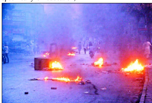
KARACHI: Activists of a religious party burned tyres on a road during protest, in Provincial Capital.