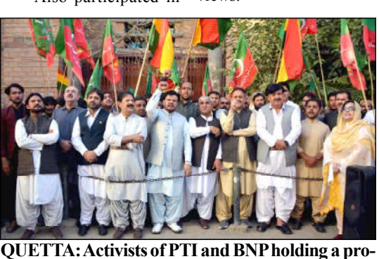
test in front of Press Club

In addition to this, the programme also provided a platform for the meaningful dialogue and exchange of