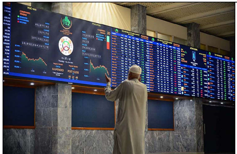
KARACHI: Brokers are busy in trading at Pakistan Stock Exchange (PSX) in Karachi.