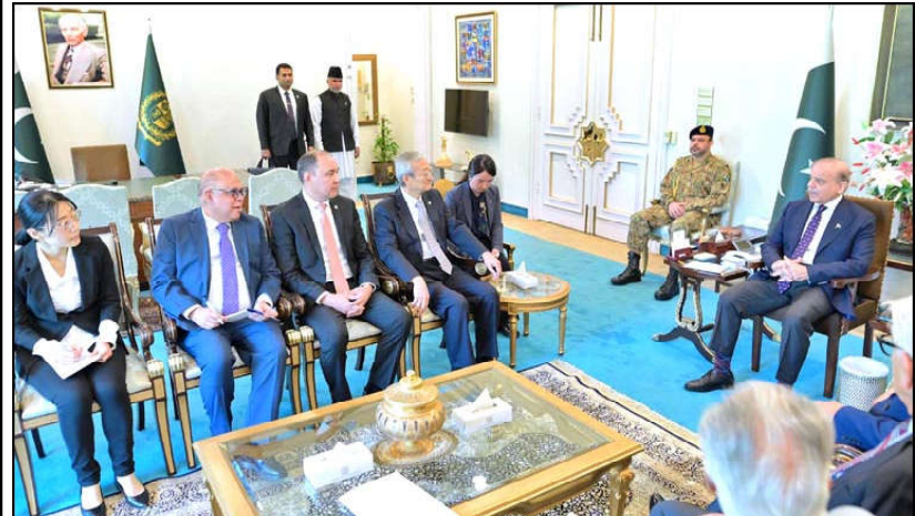
ISLAMABAD: Secretary General Shanghai Cooperation Organisation Zhang Ming calls on Prime Minister Muhammad Shehbaz Sharif.