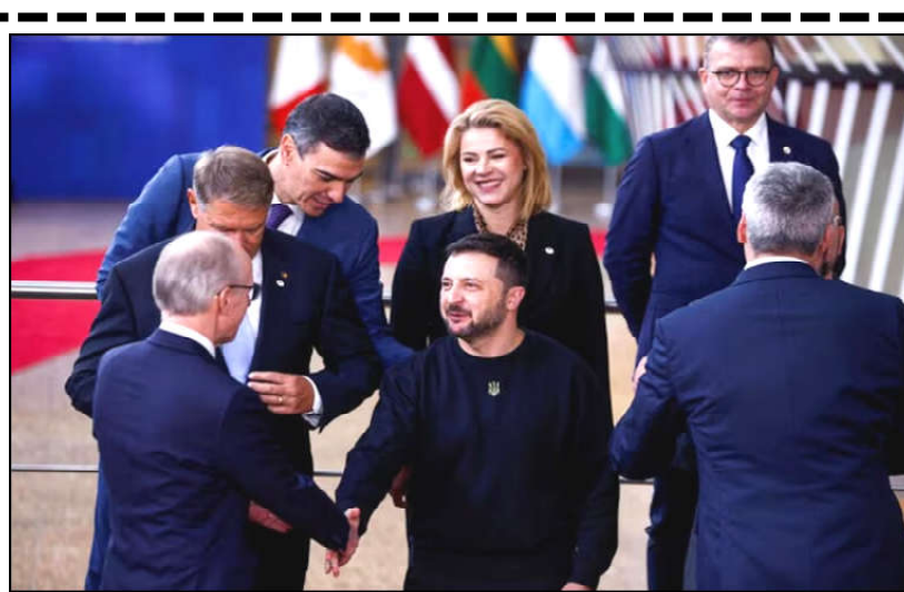
Luxembourg's Prime Minister Luc Frieden, Romania's President Klaus Iohannis, Spain's Prime Minister Pedro Sanchez, Ukraine's President Volodymyr Zelenskyy, and President of the European Council Charles Michel attend a European Union leaders summit in Brussels, Belgium.

ged military offensive has killed over 42,000 Palestinians, including women and children. Sinwar became the group's new leader after the killing of its former political chief Ismail Haniyeh in July. Hamas and Iran blame Israel for Haniyeh's killing, but Israel has not commented on it. Israel's announcement on Sinwar comes weeks after it assassinated Hezbollah chief Hassan Nasrallah in a massive strike in Lebanon, where its military has been waging an offensive since late September. A slew of other Iran-backed commanders have also been killed in recent months. With Hamas hugely weakened more than a year into the Gaza conflict, Sinwar's death deals a major blow to the organisation. In a brief statement, the military ear-