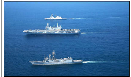
Pakistan and Italian Navy ships during bilateral exercise in North Arabia Sea.

They reaffirmed the Government of Pakistan's commitment to supporting their brothers and sisters in distress and stressed the importance of collaboration by welfare organizations and the Pakistani public in strengthening these efforts.