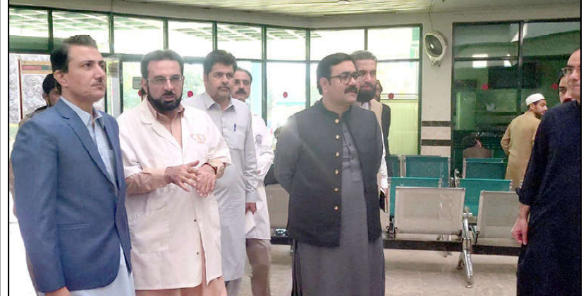
QUETTA: Provincial Health Minister Bakht Muhammad Kakar visiting Balochistan Institute for Nephrology Urology Quetta. Secretary Health Mubejzur Rehman Panezai is also present

The Mongolian prime minister also planted a sapling in the lawn of the Prime Minister's House.