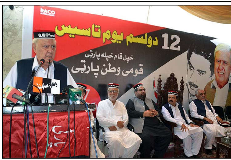
PESHAWAR: Quami Watan Party Chairman, Aftab Ahmad Khan Sherpao addresses to participant during Annual Foundation Day ceremony held in Peshawar.