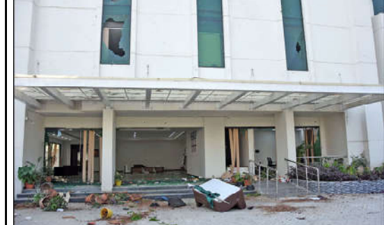
RAWALPINDI: A view of damage building of a college from students during a protest of students in favor of their demands at 6th road in the city.

Insaf Student Wing were found involved in creating chaos. She alleged that the PTI defamed a girl and her family as per planning. Azma said police were performing its duty to maintain law and order, and all cities including Lahore, Gujranwala, Rawalpindi were normal. She said that strict action would be taken against all those who spread fake information in this regard and did negative propaganda.