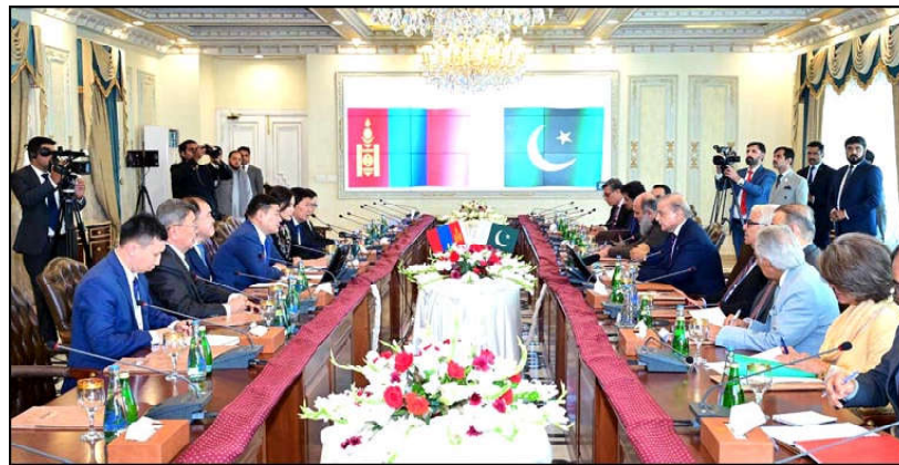
ISLAMABAD: The Prime Minister of Mongolia H.E. Luvsannamsrain Oyun-Erdene along with a delegation meets Prime Minister Muhammad Shehbaz Sharif.

He said that we are political and democratic people, and as such have always made democratic policies. However, adding he alleged that the party is being kept away from the political and democratic struggle. He also said that the federation has not comprehended the issue of