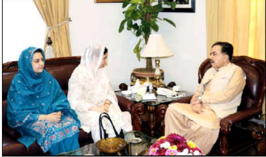
QUETTA: Chairman Balochistan Commission on the Status of Women Fozia Shaheen meeting with Governor Balochistan Sheikh Jaffar Khan Mandokhail

Federal Ministries, Gilgit-Baltistan and the representatives of Azad Jammu and Kashmir (AJK) governments briefed the minister regarding the preparations and arrangements for Kashmir Black Day.