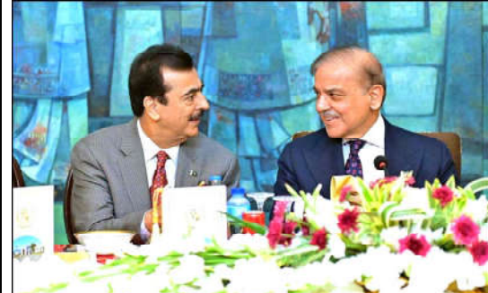
ISLAMABAD: Prime Minister Muhammad Shehbaz Sharif with Chairman Senate Syed Yousuf Raza Gillani at a banquet organized in honor of the senators.

ISLAMABAD (INP): PML-N and PPP withdraw from the proposal for federal constitutional courts, agreeing on alternative reforms. Prime Minister Shehbaz Sharif has met with President Asif Ali Zardari at the President house to discuss proposed constitutional amendments and the prevailing political situation. The meeting on Thursday comes as the Pakistan Muslim League-Nawaz (PML-N) and Pakistan Peoples Party (PPP) step back from their earlier proposal to establish constitutional courts. Express News reported. Moreover, during a special parliamentary committee meeting, chaired by Khurshid Shah, discussions were held on the 26th constitutional amendment draft. According to sources, the governing coalition parties and Jamiat Ulema-e-Islam (JUI-F) have agreed to drop the proposed 26th constitutional amendment, which called for the creation of constitutional courts.