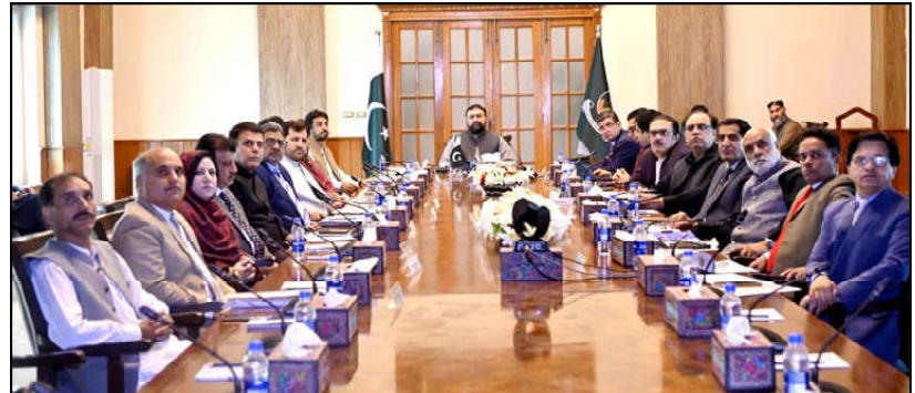
QUETTA: Chief Minister Balochistan Mir Sarfraz Ahmed Bugti presiding over a meeting regarding financial and administrative affairs of Public Sector Universities of the province.

besides other concerned. Describing lawlessness and subversive acts as a curse, the Governor said that we would take concrete measures for making the Zhob division hub of peace. In addition to this, safety of the national highways and effectiveness of the economic activities would also be ensured in the province, adding Governor said. He said that we are united for bringing sustainable peace and prosperity in the whole province. Surely, we would overcome the challenge of law and order with support of the masses, he said. Meanwhile, certain decisions were made for improving law and order situation following recommendations of the participants.