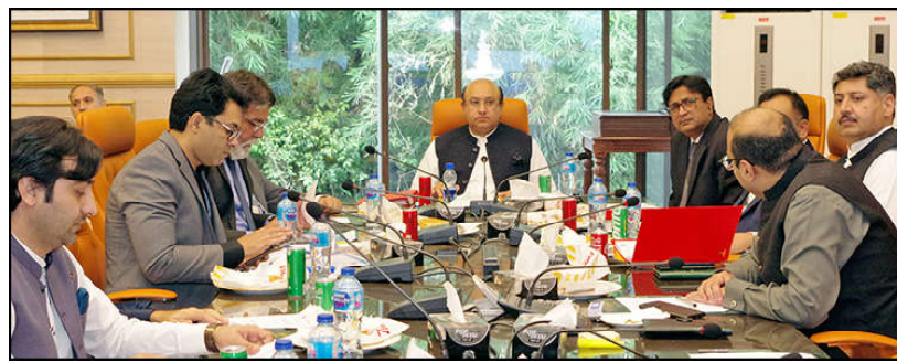
LAHORE: Punjab Finance Minister Mujtaba Shuja-ur-Rehman presides over the 48 th meeting of Punjab Pension Fund Management Committee.

resolved the issue in peaceful manner" they remarked and expressed profound appreciation for his crucial role in this regard and said "As the Chief Minister had successfully resolved the October 11 and Bannu issues, we trust that he will also address our concerns", they remarked. Chief Minister Ali Amin Gandapur appreciated the Kuki Khel elders for reposing trust to resolve the issue and assured them that he would make every possible efforts to live up to their expectations. He stated that a meeting with relevant stakeholders would be held next week to finalize a plan for the repatriation and rehabilitation of the displaced people.