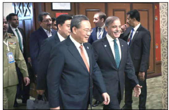
ISLAMABAD: Prime Minister Muhammad Shehbaz Sharif receiving the Chinese Premier H.E. Li Qiang at the venue of the 23rd SCO Council of Heads of Government Meeting.

He said that there are extraordinary circumstances in the province while separatist movement is going on. He said that the smuggling of fuel has been causing loss of billions of rupees. He said that those benefiting from the smuggling of fuel are others and he would reveal their names soon. However, we are trying to find the way out of the issue. The Chief Minister was speaking in the session of provincial assembly here on Wednesday.