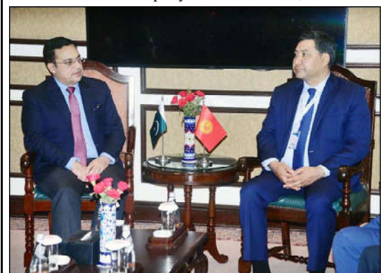
ISLAMABAD: Federal Minister for Economic Affairs, Ahad Cheema in meeting with Kyrgyz Finance Minister Daniyar Amangeldiev.

Participants including the President of WCCI Charsadda, local women entrepreneurs, the Additional Deputy