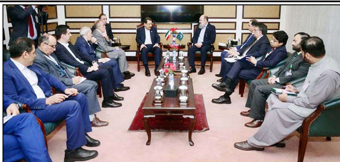
ISLAMABAD: Federal Minister for Commerce, Jam Kamal Khan meeting with Iran's Minister for Industry, Mining, and Trade, Mohammad Atabak, during the SCO 2024 summit. The discussion focused on enhancing bilateral trade, industrial cooperation, and regional economic ties.

ISLAMABAD (APP): The 100-Index of the Pakistan Stock Exchange (PSX) continued with bullish trend on Wednesday, gaining 365.32 more points, a positive change of 0.43 percent, closing at 86,205.66 points against 85,840.34 points on the last trading day.