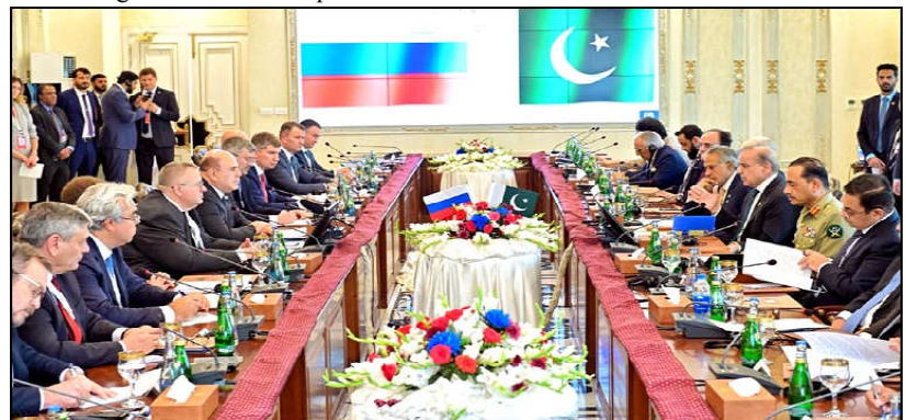
Russian Prime Minister H.E. Mikhail Mishustin along with a delegation meets Prime Minister Muhammad Shehbaz Sharif in Islamabad.

action would be taken against anyone attempting to harm others' lives or property, condemning PTI's habitual use of threats against the opponents. He said that if anyone tried to harm another person, the state will set an example by holding the perpetrators accountable. He also accused the PTI of writing letters to the International Monetary Fund to push Pakistan towards default, orchestrating the May 9 attacks, vandalizing memorials of martyrs, and calling for protests during the Shanghai Cooperation Organization (SCO) Summit. "This is a non-serious threat," he remarked, pointing to the internal conflicts and divisions within PTI.