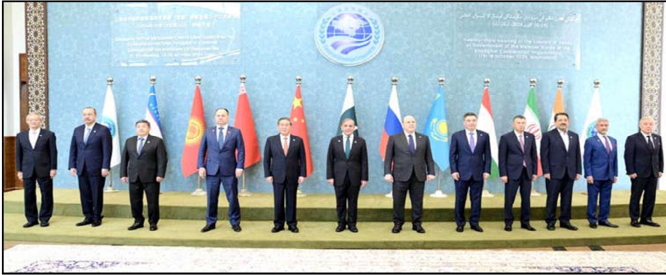
ISLAMABAD: A group photograph of Prime Minister of Pakistan Muhammad Shehbaz Sharif and Heads of delegations of the 23rd SCO Heads of Government Meeting.

Ph: 2841470/2841473 Vol: XX No. 93, Rabi-us-Sani 13, 1446 AH Thursday October 17, 2024, Pages 04, Price Rs.15