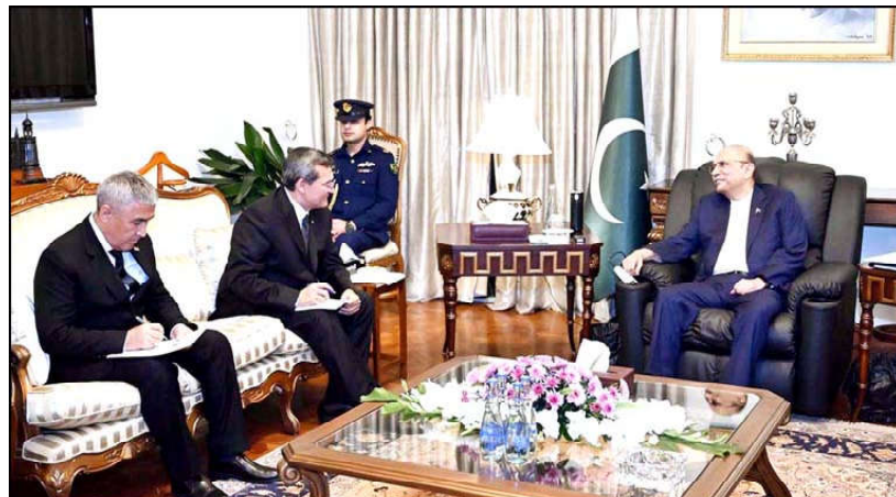
ISLAMABAD: The Deputy Chairman of the Cabinet of Ministers/Minister of Foreign Affairs of Turkmenistan, Rashid Meredov, calls on President Asif Ali Zardari, at Aiwan-e-Sadr.