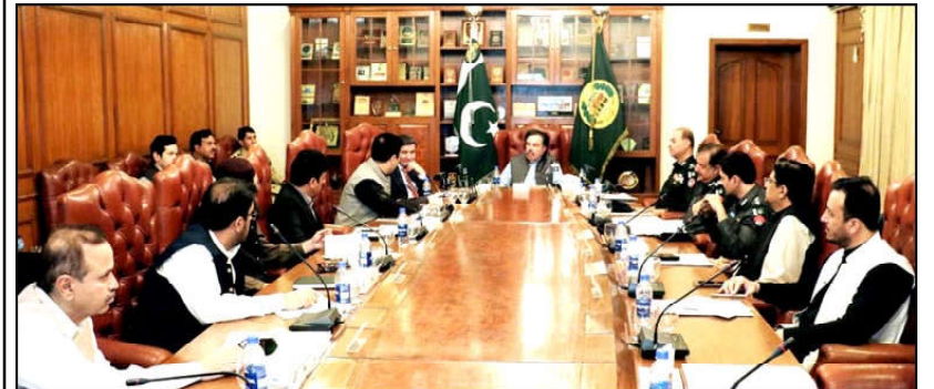
QUETTA: Governor Balochistan Sheikh Jaffar Khan Mandokhail presiding over a meeting regarding law and order situation in Zhob Division.