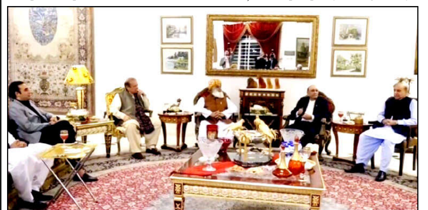
PPP Chairman Bilawal Bhutto-Zardari, PML-N President Nawaz Sharif, Jamiat Ulema-i-Islam-Fazl chief Maulana Fazlur Rehman, President Asif Ali Zardari and Prime Minister Shehbaz Sharif attend a meeting in Lahore.

prime minister, who earlier received the participating leaders at the venue before a group photo, said that the SCO collaboration, spanned academic and tourism linkages, poverty alleviation, and the empowerment of women and youth across the SCO region—a reflection, of our determination, to promote prosperity through unity.