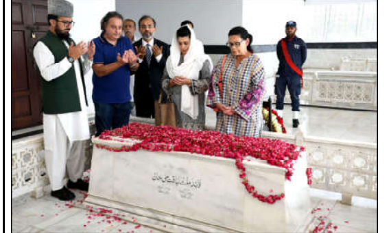
KARACHI: Relatives offering Fathia, on the occasion of the death anniversary of the first Prime Minister of the country Liaquat Ali Khan.