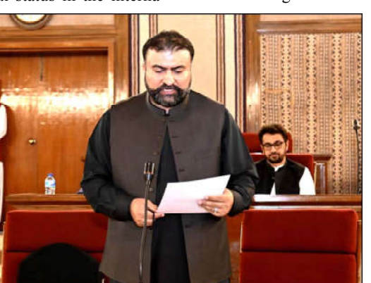
QUETTA: Chief Minister Balochistan Mir Sarfaraz Ahmed Bugti presenting a resolution in the Balochistan Assembly

In a statement issued Therefore, should take concrete steps here on Monday, the Governor said that the alliance for increasing coordination and friendly relations becoming at the level of region in the political history among the member countries and different nations of the world is getting central status in the internaof the whole region