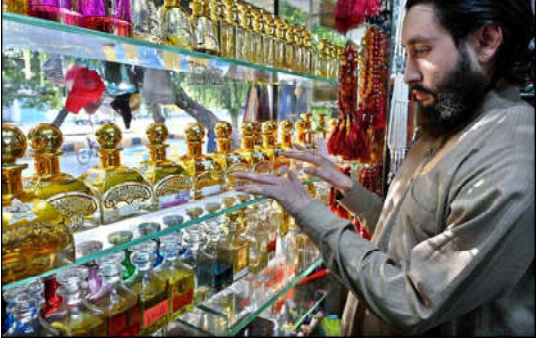
ISLAMABAD: A shopkeeper arranging and displaying perfumes to attract the customers in

He said the visit will significant help expanding cooperation in various sectors, particularly in trade, infrastructure relations between the two development, and energy projects. China is already fortifying the invincible Pakistan's largest trading partner and a key player in bonds of brotherhood and the China-Pakistan Economic his Corridor statement issued here, he (CPEC), which has brought said the visit underscores billions of dollars in the unwavering friendship investments to Pakistan. This visit will further characterized Chinaenhance these economic Pakistan ties for decades. initiatives, fostering Both countries share a mutual growth and deep-rooted bond that has development, he added.