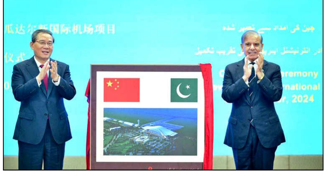
ISLAMABAD: Prime Minister Muhammad Shehbaz Sharif and Chinese Premier, Li Qiang unveiling a plaque to mark the completion of New Gwadar International Airport.

Ph: 2841470/2841473 Vol: XX No. 91, Rabi-us-Sani 11, 1446 AH Tuesday October 15, 2024, Pages 04, Price Rs.15