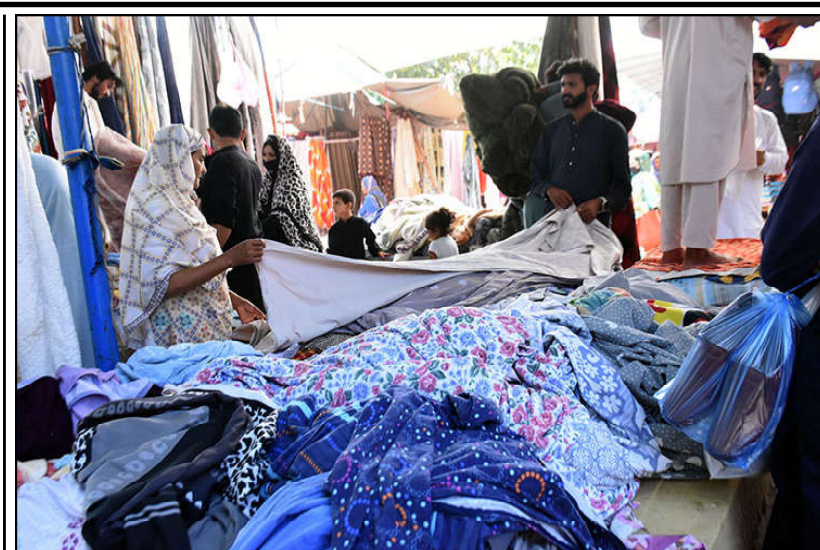
ISLAMABAD: Citizen busy in shopping at Weekly Bazaar at Sector G-10, in the Federal Capital.

He said that the poultry units were sent to various veterinary hospitals at three tehsils of district Lodhran where from the units were distributed among farmers. He said that the initiative not only would make peoples' access to healthy diet easy but also bring profits to the owners.