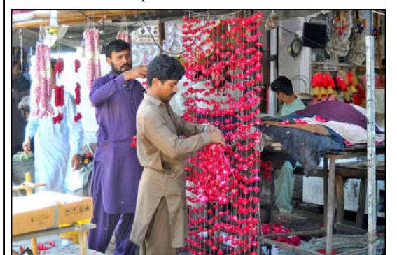
MULTAN: Vendors are busy preparing flower garlands at their roadside setup.