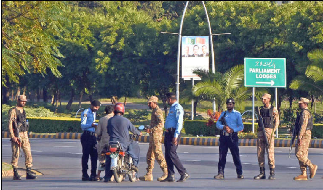
ISLAMABAD: Pak Army soldiers and police personals checking a motorcyclists in front of Parliament House at Constitution Avenue, during security high alert at "red zone" area ahead of Shanghai Cooperation Organisation (SCO) summit, in the Federal Capital.

Ph: 2841470/2841473 Vol: XX No. 90, Rabi-us-Sani 10, 1446 AH Monday October 14, 2024, Pages 04, Price Rs.15