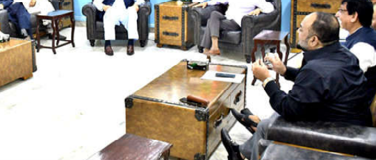
ISLAMABAD: Deputy Prime Minister and Foreign Minister Mohammad Ishaq Dar along with Federal Minister for Information and Broadcasting Attaullah Tarar talking with media men after visit to review arrangements for the upcoming CHG-SCO meeting

The Chinese premier will call on President Asif Ali Zardari and hold meetings with parliamentary leaders and senior military leadership of Pakistan. He will also attend the Meeting of the Council of the Heads of Government of the Shanghai Cooperation Organization being held in Islamabad on October 15-16.