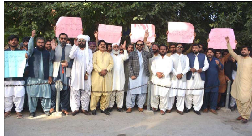
QUETTA: Activists of Bugti Rabita Committee protesting against the Bandits of Katcha outside Quetta Press Club.