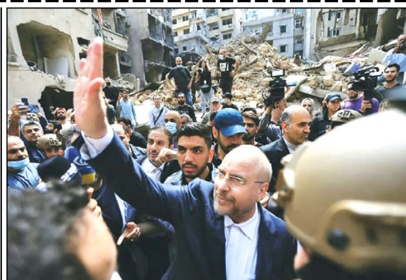
BEIRUT: Iran's Parliament Speaker Mohammad Bagher Ghalibaf waves during his visit to the site of an Israeli air strike in the Basta neighbourhood.

Nine people were killed in Maisra village in the northeast, with 15 wounded, the ministry said. Four people were killed and 18 wounded in an apartment building on the edge of Barja south of Beirut. The ministry said Rayak and Tal Chaha hospitals in the Bekaa Valley were damaged, while seven people were wounded in strikes on Brial and Temnine in Baalbek-Hermel province. In Nabatieh, eight people were wounded. Beirut's southern suburbs, which have previously faced heavy bombardment, have not been struck in the past 48 hours. Hezbollah functions as a state within a state there.