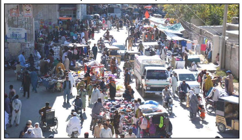
QUETTA: Citizens busy in buying daily commodities from Joint road Sunday bazaar.

PESHAWAR (INP): Pakistan Tehreek-e-Insaf (PTI) leader Atif Khan said that Chief Minister Khyber Pakhtunkhwa Ali Amin Gandapur's absence demoralized party workers during their protest at Islamabad's D-Chowk. In an exclusive interview with a private TV Channel, he said that there was no clear message from the party leadership regarding the protest strategy on October 4. "The leadership should have clarified its further course of action after the workers reached D-Chowk. The workers should have been communicated clearly to hold just a protest or stage a sit-in," Atif Khan added. He said that after all that, the PTI workers are disappointed. Expressing concerns over the party's current trajectory, Atif Khan said that currently they are lacking clear direction and decision-making. To a question, he said the PTI cannot be eliminated by the forces who want to do so. "Eventually, stakeholders will have to negotiate and find a way forward with the PTI." When asked about potential deals, Atif Khan responded, "Deals are made for personal gain, while the right path is for the country's benefit." Regarding the PTI's current leadership, Atif Khan voiced his dissatisfaction, stating, "Everyone in the party is playing a double game; those who meet in Adiala Jail (with Imran Khan) discuss unnecessary matters." Earlier on Friday, PTI announced another protest demonstration at Islamabad's D-Chowk on October 15, the day when Shanghai Cooperation Organisation (SCO) Summit.