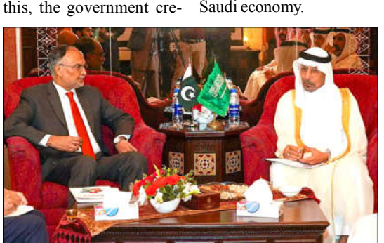
ISLAMABAD: Saudi Investment Minister Khalid Bin Abdulaziz Al Falih meeting with Federal Minister for Planning Ahsan Iqbal.

The minister sug-gested training Pakistan's workforce and upgrading When the current government took office again, the challenge was to stabitheir technical capabilities lize the economy for longto retain them within the term growth. To achieve Saudi economy.