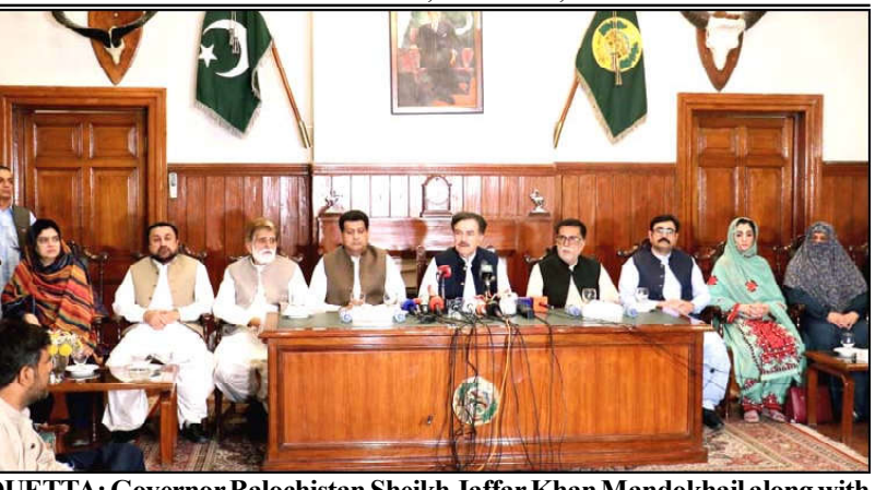
QUETTA: Governor Balochistan Sheikh Jaffar Khan Mandokhail along with Balochistan cabinet members addressing a press conference for Duki incident at Governor House.

The strong protest was also lodged along with bodies of the deceased persons by the relatives of the deceased and others