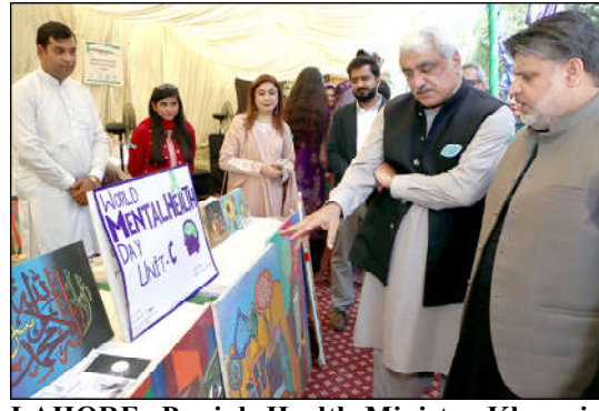
LAHORE: Punjab Health Minister Khawaja Salman Rafique watching the stalls on the eve of World Mental Health Day ceremony at Punjab Institute of Mental Health.

The Assembly including leadership of all religiouspolitical parties assigned CM KP the responsibility of conducting a peace jirga with concerned for solution of all matters through consultation and peaceful means. The CM KP has accepted the responsibility of conducting a peace jirga and thanked the participants for reposing trust in him.