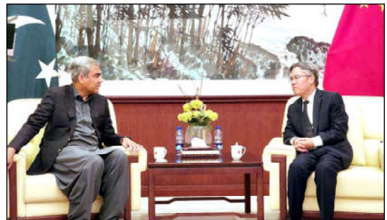
ISLAMABAD: Federal Minister for Interior Mohsin Naqvi in a meeting with Chinese Ambassador Jiang Zaidong in Federal Capital.