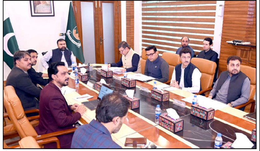
QUETTA: Chief Minister Balochistan Mir Sarfaraz Ahmed Bugti presiding over a meeting to review progress of Chief Minister Youth Skills Development Programme

He also demanded an immediate and unconditional ceasefire and end to brutalities against the Palestinian people; lifting of the siege of Gaza; provision of unimpeded humanitarian, and medical aid; and to hold Israel accountable for its violations of international law, war crimes and acts of genocide; He on the occasion directed to ensure merit in the Youth Skills Development Programme at every level. He said that the future of Balochistan depends on provision of livelihood to the youth by utilizing their positive capabilities. He said that the required resources would be provided for implementation on the CM Youth Skills Development Programme as surely thousands of youngsters would get the opportunities of respectable livelihood abroad.