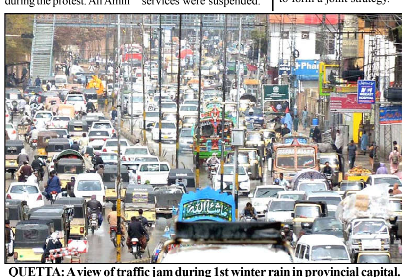
QUETTA: A view of traffic jam during 1st winter rain in provincial capital.

QUETTA (APP): Medical Technician series of one-year diploma courses in the fields of Tech, Assistant, Lab Assistant and Technician commenced in Jafarabad area of Nasirabad division under NAVTAC. According to press release issued on Monday, in the first batch, which was started from July, 100 boys and girls from Naseerabad division, Subhatpur, Jafarabad, Dera Allah-yar, Usta Muhammad, Jhal