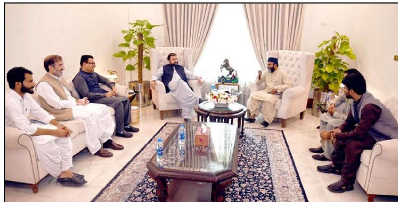
QUETTA: MPA Maulana Hidayat ur Rehman and others meeting with Chief Minister Balochistan Mir Sarfraz Ahmed Bugti

ISLAMABAD (INP): The government has announced plans to dissolve two authorities under the Health Ministry, sources said on Monday. According to source, the decision will be taken to ensure cost-cutting measures and streamlining healthcare services. Sources said that the Islamabad Blood Transfusion Authority and the Human Organ Transplant Authority will be merged with the Islamabad Healthcare Regulatory Authority, resulting in a significant reduction in staff. Earlier today, the Pakistan government decided to dissolve the Ministry of States and Frontier Regions (SAFRON). The SAFRON ministry will be merged into the Ministry of Kashmir Affairs and Gilgit-Baltistan (GB), following recommendations from the Rightsizing Committee.