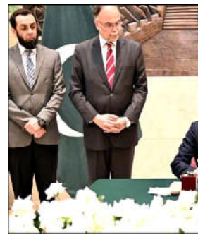
ISLAMABAD: Prime Minister Muhammad Shehbaz Sharif visiting the Chinese Embassy in Islamabad to offer his heartfelt condolences over the loss of Chinese citizens' lives in a terrorist attack in Karachi.