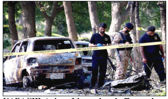
KARACHI: A view of the cordoned-off area where the wreckage of destroyed vehicles lies following a deadly explosion near Karachi Airport occurred late Sunday night.