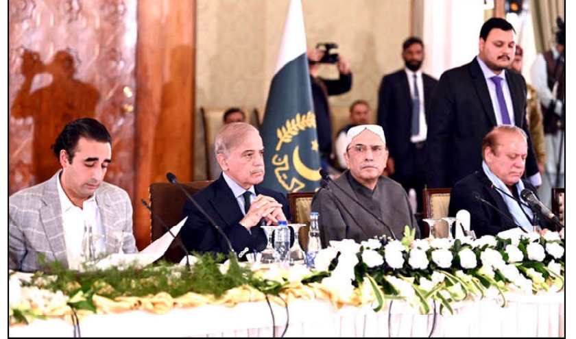
ISLAMABAD: President Asif Ali Zardari, Prime Minister Shehbaz Sharif, PML-N Quaid Nawaz Sharif and PPP Chairman Bilawal Bhutto Zardari attending All Parties Conference (APC) on Palestine and Gaza held at Aiwan-e-Sadr