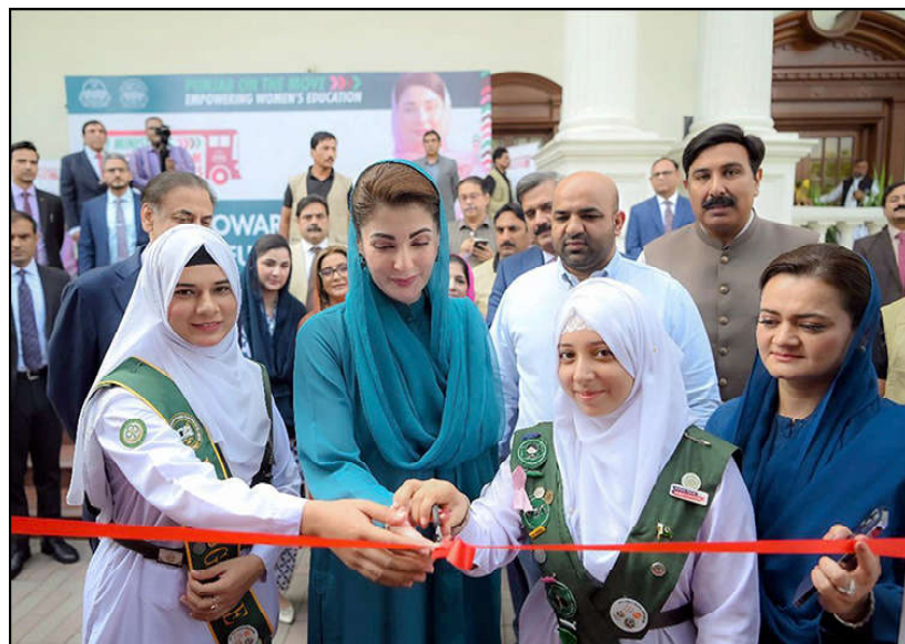
LAHORE: Punjab Chief Minister Maryam Nawaz Sharif along with students of Girls College inaugurate Chief Minister Transport Program for Women.

LAHORE (APP): Punjab Chief Minister Maryam Nawaz Sharif inaugurated Chief Minister Transport Programme for Women with 76 buses for girls' colleges across Punjab. Nineteen buses were given to women's colleges under the programme in phase-1. The CM on Monday during a ceremony met the students of women's colleges, who presented her a bouquet. The CM called the girls students on stage while inaugurating the transport programme. She handed over keys of buses to the principals of 19 women's colleges. Chief Minister Maryam Nawaz inspected the buses, and evaluated a proposal to provide air-conditioned buses for girls' colleges. She was briefed in detail by Secretary Higher Education Dr. Farrukh Naved about the Program. The CM was apprised that buses would be provided to 76 colleges in Punjab in three phases. In the first phase, buses have been given to 19 tehsils deprived of transport. These tehsils include: Bhakkar, Sialkot, Chiniot Kamalia, Hasilpur, Malakwal, Ferozewala, Shorekot, Jatoi, Fateh Jang, Hasan Abdal, Kot Momin, Jalalpur Pirwala, Kallar Syedan, Pindi Ghep, Manchanabad and Sharqpur. In the second phase, girls colleges of Nowshera Virkan, Dina, Yazman, Pindi Bhattian, Lalian, Bhawana, Kot Addu, Taxila, Sarai Alamgir and Pellaan would get buses.