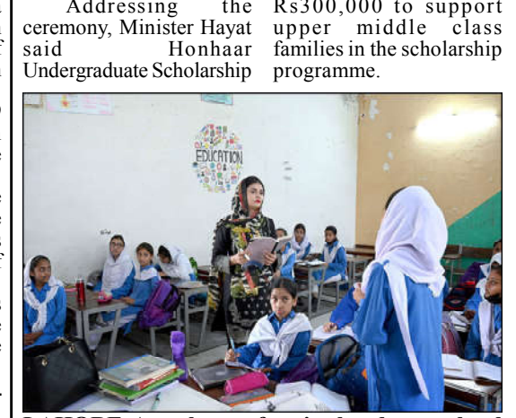
LAHORE: A teacher performing her duty at a local school as world celebrates the World teacher's Day, also known as International Teachers Day.

Programme was the largest scholarship programme in the history of Pakistan under which the fee of 30,000 intelligent students of public and private universities would benefit. The minister said that the fee of the four-year BS degree programme of the intelligent students would be paid every year on behalf of Punjab Chief Minister Maryam Nawaz and every year new students would also be included in the scholarship scheme. He said that the eligibility criteria regarding family income range had been set with the monthly income of Rs300,000 to support upper middle class families in the scholarship programme.