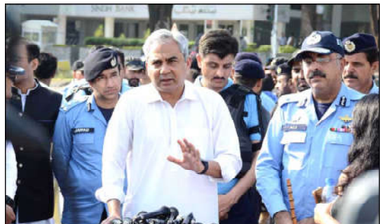
ISLAMABAD: Federal Interior Minister Mohsin Naqvi talking to media persons at D Chowk.