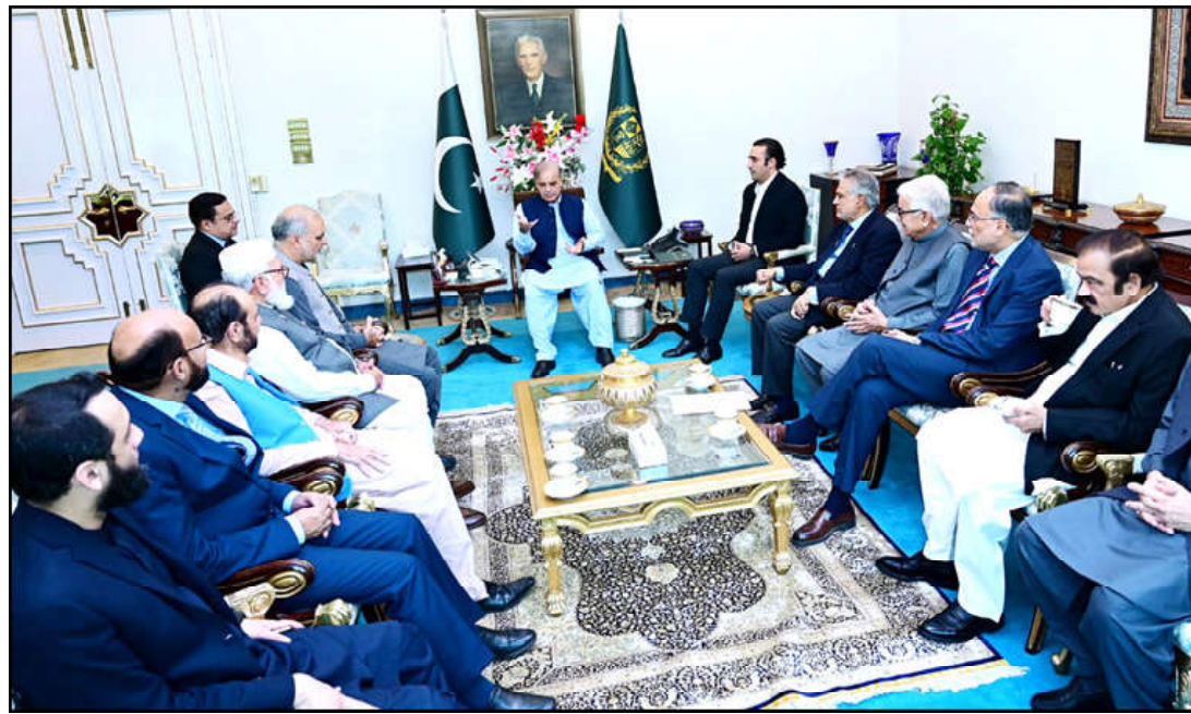
ISLAMABAD: Chairman Pakistan People's Party, Bilawal Bhutto Zardari and a delegation of Jamat Islami led by Amir e Jamat Islami Haafiz Naeem ur Rehman call on Prime Minister Muhammad Shehbaz Sharif.

Interior Minister Mohsin Naqvi stated during the meeting that additional personnel from the Pakistan Army, Rangers, Frontier Corps (FC), and Punjab police would be deployed for security duties at the SCO summit.