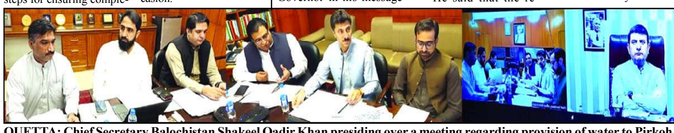
QUETTA: Chief Secretary Balochistan Shakeel Qadir Khan presiding over a meeting regarding provision of water to Pirkoh, Dera Bugti

During the course, the development strategy of provincial government, ongoing important development schemes of different sectors and development goals of future were discussed on the occasion.