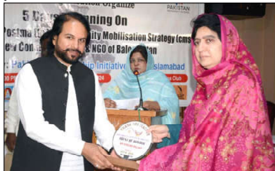
QUETTA: Provincial Education Minister Raheela Hameed Khan Durrani distributing shields among participants during concluding ceremony of Community Mobilization Strategy training organized by Dara ul Amal Welfare Organization

transparent manner. He said that the necessary directives have been issued to the revenue officers according to the settlement manual. During the process, no injustice would be made with any stakeholder during the settlement, the Minister Revenue assured. He said that the credit of digitalization of the revenue record goes to the incumbent government. He said that it is our firm resolve to remove the public complaints regarding board of revenue. In this regard, open courts would be conducted to resolve the issues and thus ensure good governance, he added. Meanwhile, the Minister inspected the record room of settlements and got briefing from the concerned officials. He directed to the concerned to ensure preservation of the land record.