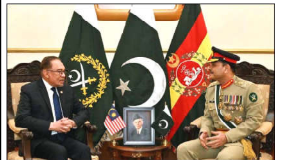
RAWALPINDI: Chief of Army Staff (COAS), General Syed Asim Munir exchanges views with Prime Minister of Malaysia, Dato Seri Anwar Ibrahim during meeting held at General Headquarters in Rawalpindi.

The Army Chief also attended the investiture ceremony and state banquet held in honour of the Malaysian prime minister at the Presidency.