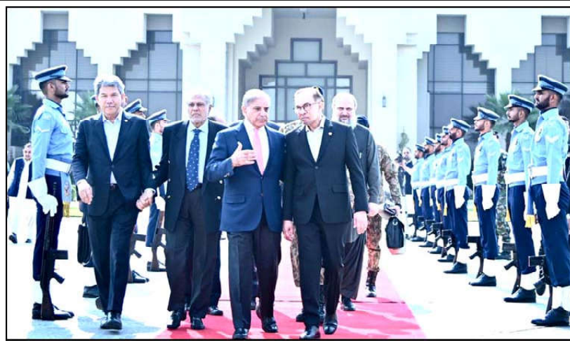
RAWALPINDI: Prime Minister, Muhammad Shehbaz Sharif bidding farewell to Prime Minister of Malaysia, Dato Seri Anwar Ibrahim before his departure at PAF Nur Khan Air Base in Rawalpindi.