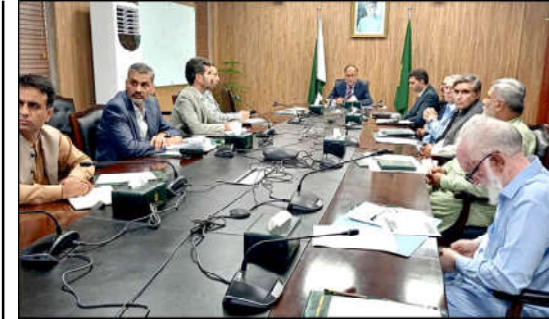
ISLAMABAD: Federal Minister for Planning, Development & Special Initiatives, Ahsan Iqbal, chairs a high-level review meeting to address the challenges hindering the development of Gwadar Port and the Free Zone.

President Asif Ali Zardari will also attend the All Parties Conference.