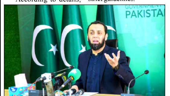
ISLAMABAD: Federal Minister for Information and Broadcasting Attaullah Tarar addressing a press conference.

Ahead of its rallies in Islamabad and Lahore earlier this month, the government had issued a set of strict guidelines.