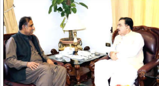
QUETTA: Provincial Minister Mir Saleem Ahmed Khosa meeting with Governor Balochistan Sheikh Jaffar Khan Mandokhail

Independent Report QUETTA: The Government of Balochistan has decided to open 3,700 closed schools in the province. According to the Provincial Education Department, the schools were closed due to non-availability of the teachers in different districts of the province. The Education Department would recruit the teachers on contract so as to post them in the schools going to be opened. The committee would make recruitment of the teachers on contract under supervision of Deputy Commissioners in their respective districts. The sources informed that at least 40 closed schools have been reopened in Pishin and Awaran districts.