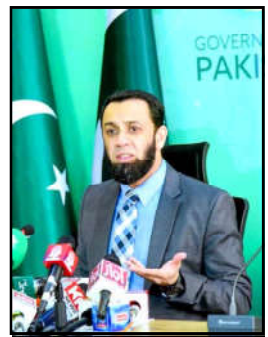
LAHORE (INP): President Pakistan Muslim League-Nawaz (PML-N) and former prime minister, Muhammad Nawaz Sharif has said that his party has never left the people nor will leave them at mercy of fate.

ISLAMABAD (APP): Federal Minister for Information, Broadcasting, National Heritage and Culture Attaullah Tarar said on Tuesday that Prime Minister Muhammad Shehbaz Sharif effectively pleaded the case of Palestinians during his historic speech at the United Nations General Assembly as the leader of Muslim Ummah. Addressing a press conference, the minister said that PM Shehbaz's address to the UNGA was highly appreciated all over the world, which was an honour for Pakistan. The prime minister championed the causes of Muslim Ummah, including Palestine and Kashmir, he added. His bilateral meetings with heads of state and gov-