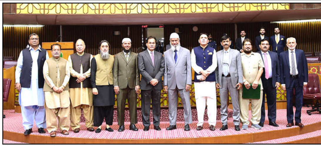
ISLAMABAD: Speaker National Assembly Sardar Ayaz Sadiq in a group photo with Renowned Islamic Philosopher Dr. Zakir Abdul Karim Naik at Parliament House.

cans of beer were recovered from Gadani area. In a similar operation, 332 kg of high quality hashish was recovered from Gwadar in the last few days. Apart from this, 44.5 kg of high quality heroin hidden in a suspicious house and bushes were seized from Winder and Uthal and two persons were arrested. The seized liquor and heroin are worth around Rs 60 million in the international market. It should be noted that Pakistan Coast Guard is always engaged in preventing drug and all kinds of smuggling and will continue to play its role in cleaning the society from the scourge of drugs and illegal weapons.