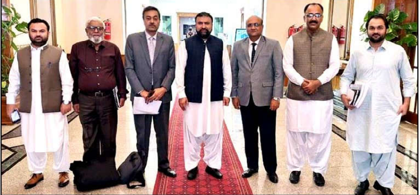
QUETTA: Chief Minister Balochistan Mir Sarfraz Ahmed Bugti in a group photo with officials of Kachhi Canal Project