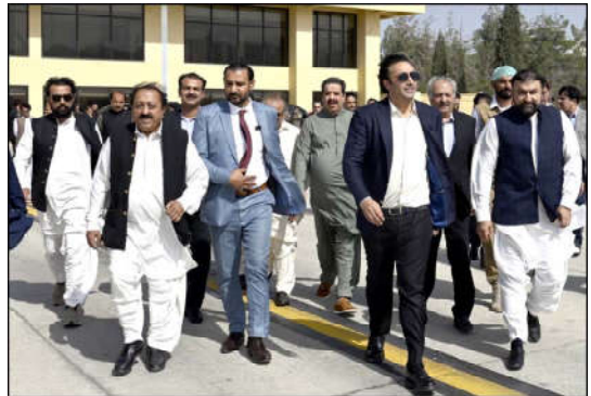
QUETTA: Chief Minister Balochistan Mir Sarfaraz Ahmed Bugti coming to airport to see off PPP Chairman Bilawal Bhutto Zardari to Islamabad.

During the meeting, Chaudhry Salik Hussain apprised the Omani side of the major reforms the government was undertaking to improve the emigration process of Pakistani workers, their professional capacity enhancement, and the marketing of the Pakistani workforce abroad. He said that the Ministry of Overseas Pakistanis was upgrading the technical training centers in Pakistan on modern lines which would train the workforce according to the certification requirement of each country or region. Chaudhry Salik Hussain informed that the Ministry of Overseas Pakistanis was going to start a compulsory pre-departure orientation program for all the workers going abroad which would educate them about the labor laws of the host country.