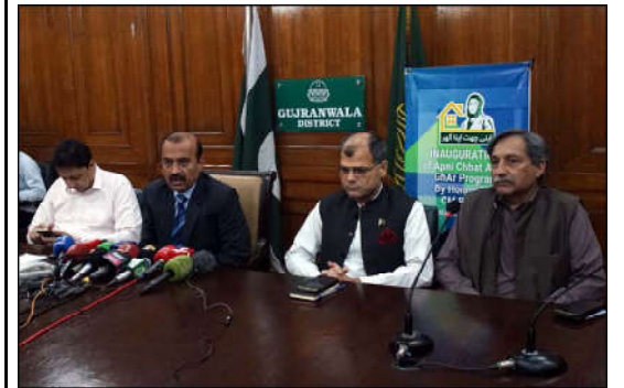
GUJRANWALA: Chief Minister Directorate for Evaluation, Feedback, Inspection and Monitoring (DEFIM) Chairperson, Brigadier (Retd) Babar Ala Uddin addresses to media persons during press conference, in Gujranwala.

The chief minister appealed to the citizens that never forget your elders, rather give them the respect and status they deserve. Only those societies rise that value their elders.