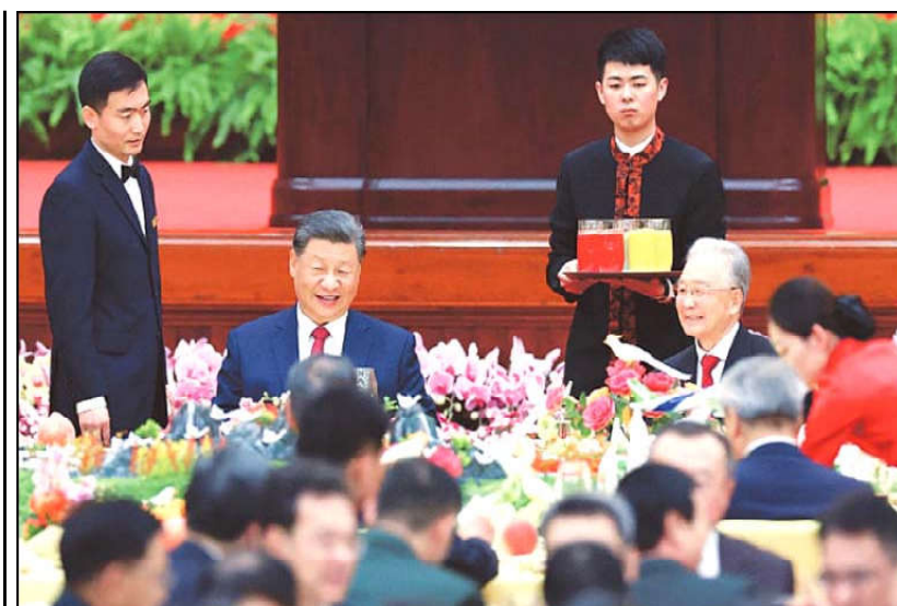
President Xi Jinping and ex-premier Wen Jiabao attend the national day reception at the Great Hall of People.