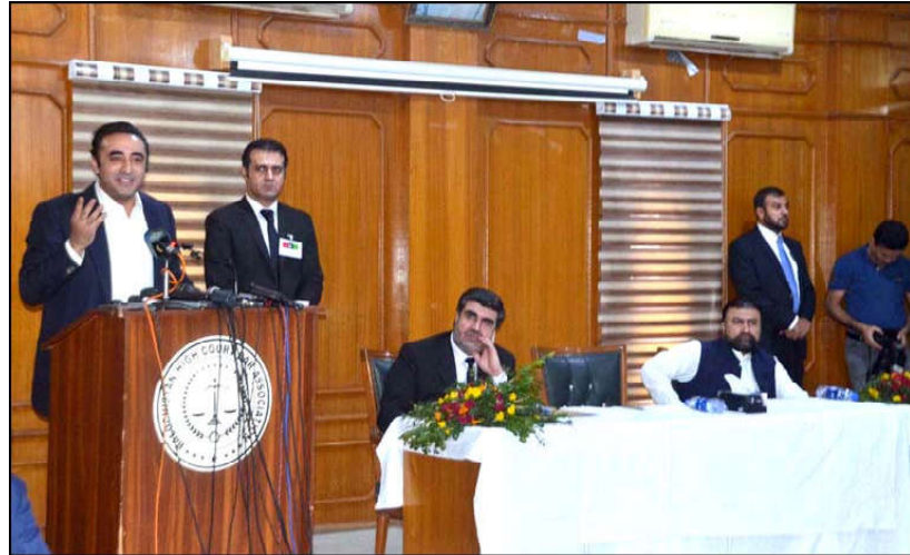
QUETTA: Chairman of Pakistan People's Party (PPP) Bilawal Bhutto Zardari addresses the Balochistan High Court Bar Association, focusing on key legal and political issues in the provincial capital.

September this year bringing the spiraling inflation to record low in the last 44 months. "With the grace of Allah Almighty, the promises made with the public have started yielding results. With inflation rate at 6.9pc, the common man will get relief," the press release quoted the prime minister as saying. The prime minister further observed that with continuous reduction in the petroleum prices, the public was getting relief, whereas after interest rate slide, the business activities would get a spur. He also expressed his satisfaction at the achievement of target of bringing the inflation rate to 7pc in 2024 ahead of next year.