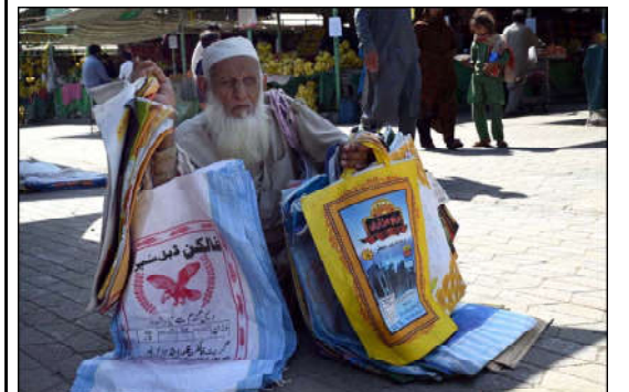
ISLAMABAD: An elderly vendor patiently awaits customers, offering eco-friendly shopping bags at the weekly Bazaar in Federal Capital.

The ministry informed the committee that a special task force, led by the Finance Minister, had been established by the Prime Minister to address the issue, with progress being made towards a resolution, and its detailed report on any final decisions was awaited.