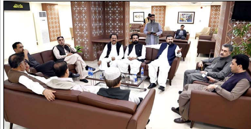
QUETTA: Chief Minister Balochistan Mir Sarfaraz Ahmed Bugti talking with Provincial Ministers and MPAs at Quetta airport

eral decades. These relations are important for the regional peace and balance of power and stability, he added. The Chief Minister said that Pakistan values its relations with China a lot and the CPEC is also an important part of expanding the long-standing relations between the two countries. He said that work is continued on certain important projects including trade and energy, he added. The Chief Minister said that the provincial government would ensure timely completion of all the projects under CPEC. With this, not only more opportunities of livelihood would be created, but new era of development and construction would be started in the province, adding he believed. He said that the people of two countries could be brought together through cultural exchange programmes. He said that the provincial government is taking steps to make effective the progress on the CPEC projects.