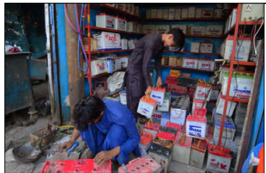
KARACHI: Technician busy in repairing work of batteries to earn his livelihood for support his family, as demand of batteries in city during hot weather of summer season and high tariff of electricity bills, at his workplace located on Garden area in Karachi.