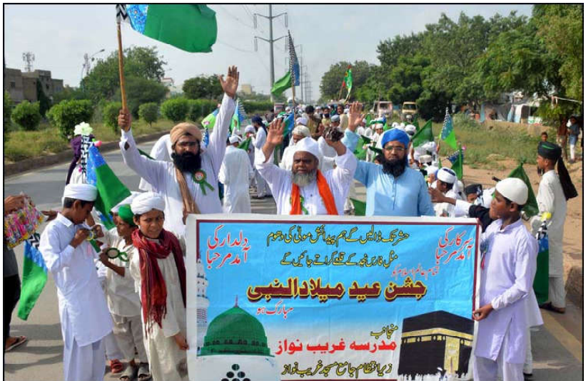
KARACHI: Members of Religious Organization are holding Jashan-e-Eid Milad-un-Nabi (SAW) rally in connection of 12th Rabi-ul-Awwal the Birthday Ceremony of Holy Prophet (P.B.U.H) coming ahead, held at Korangi area.