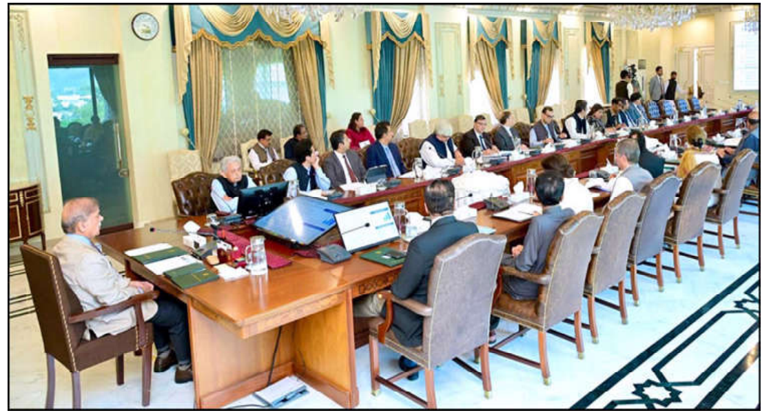
ISLAMABAD: Prime Minister Muhammad Shehbaz Sharif chairs a meeting on the use of Electric Vehicles.

The forum was informed that the first license for the domestic production of four-wheeled electric vehicles was issued in September this year, and the first locally manufactured electric car is expected to be available in the market by December. The meeting was informed that the country currently has 45,000 two- and three-wheeled electric vehicles, as well as 2,600 four-wheeled electric vehicles. Additionally, it was told that the installation of recharging stations for electric vehicles would be prioritized along motorways, GT Road (National Highway 5), and National Highways 65 and 70.