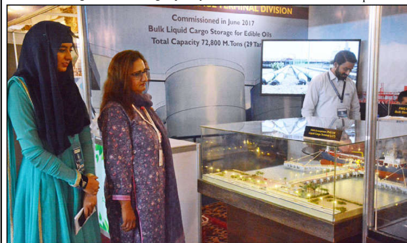
KARACHI: Participants of the International Maritime Sustainability Exhibition & Conference Pakistan (IMSEC) 2024 visiting a stall during the Conference.