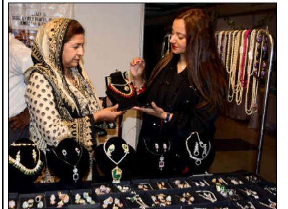
ISLAMABAD: Citizens visiting different stalls at Sixth Islamabad Expo at Pak-China Friendship Center in the Federal Capital.