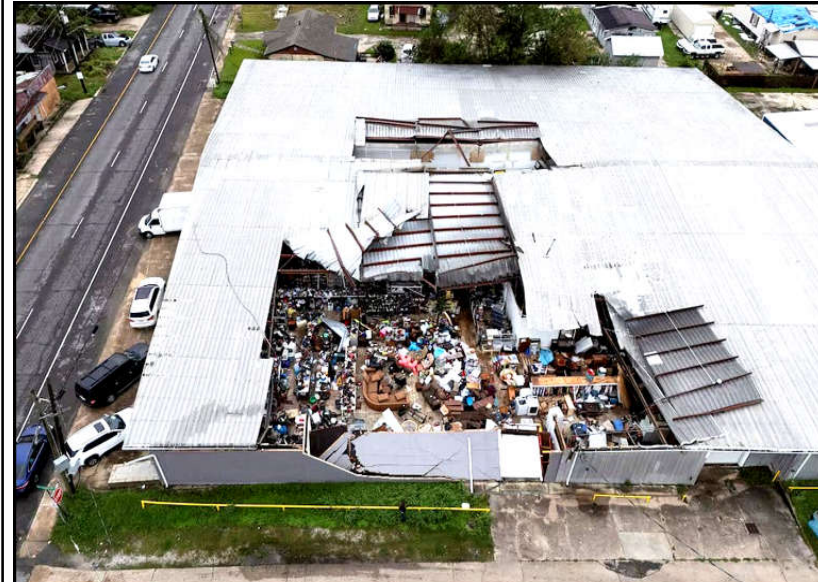
A drone view shows the Junk In The Trunk thrift store, which suffered a roof failure and wall collapse due to the effects of Hurricane Francine, in Houma, Louisiana, US.

Monitoring Desk PRAGUE: Prague was putting up flood defences in the city's historic centre after Czech forecasters expanded a warning for extreme rainfall to areas of the country including the capital, which suffered catastrophic flooding more than 20 years ago. Heavy rain has pounded mostly eastern parts of the Czech Republic since Thursday, and the most affected areas may see more than a third of annual rainfall over four days by Sunday. Similar weather has been forecast around central Europe, including southern Germany and parts of Austria, Poland, and Slovakia over the coming days. "Data shows we are