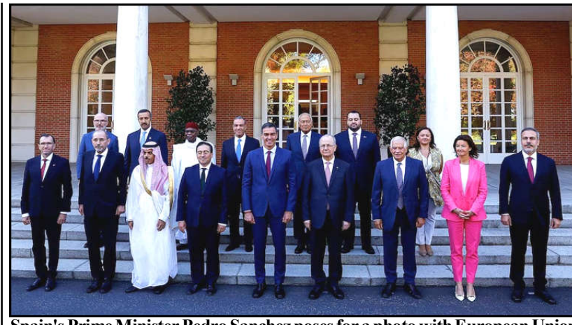
Spain's Prime Minister Pedro Sanchez poses for a photo with European Union foreign policy chief Josep Borrell, Palestinian Prime Minister Mohammad Mustafa, Saudi Arabia's Foreign Minister Prince Faisal bin Farhan Al-Saud, Jordan's Foreign Minister Ayman Safadi, Slovenian Foreign Minister Tanja Fajon, Norway's Foreign Minister Espen Barth Eide, Turkey's Foreign Minister Hakan Fidan, on the day of a meeting at Moncloa Palace in Madrid, Spain.

Such a two-state solution was set out in the 1991 Madrid Conference and the 1993-95 Oslo Accords, but the peace process has been moribund for years. However, the search for a peaceful solution has been given new urgency by the 11-month-long war in the Gaza Strip between Israel and the Palestinian militant groups Hamas - the bloodiest episode yet in the overall conflict - as well as escalating violence in the occupied West Bank.