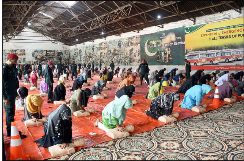
LAHORE: Students busy in first aid exercise at 1122 rescue office, in the Provincial Capital, on the eve of World First Aid Day.