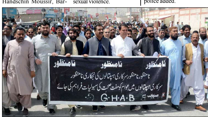
QUETTA: Activists of Balochistan Grand Health Alliance hold protest rally in favor of their demands.