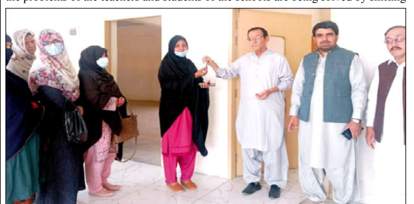
the school to a new building, providing facilities to the people of the area in getting education for the students.