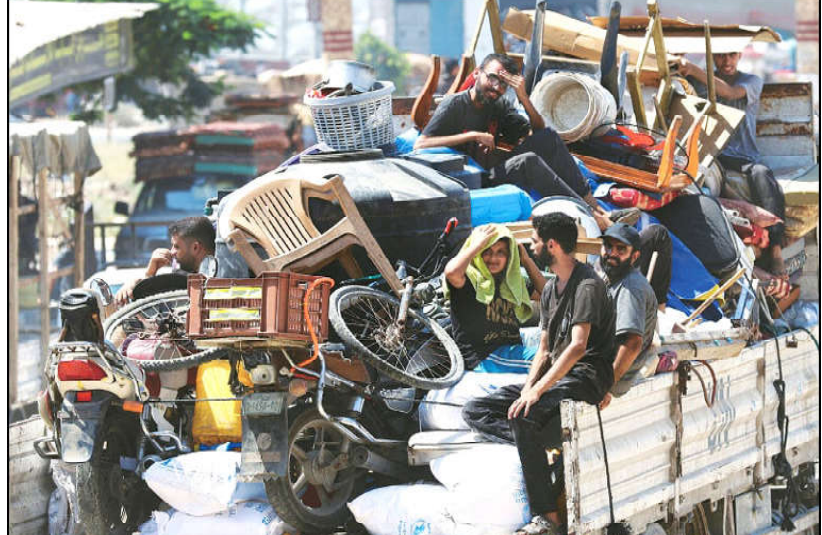
Displaced Palestinians prepare to leave a refugee camp following an Israeli evacuation order.

Monitoring Desk LONDON: The Electronic Travel Authorization (ETA) scheme is similar to the ETA system in the United States. The interior ministry announced that all visitors who do not require a visa to travel to Britain will need an ETA from April 2, 2025. "Everyone wishing to travel to the UK — except British and Irish citizens — will need permission to travel in advance of coming here."