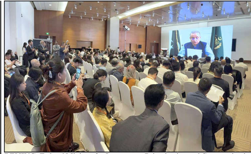
BEIJING: Federal Minister for Investment, Privatization and Communication Abdul Aleem Khan speaking via video message at "Pakistan Investment Conference: Together for a Shared Future" hosted by the Embassy of Pakistan at the China International Fair for Trade in Services (CIFTIS).

ISLAMABAD (APP): The per tola price of 24 karat gold increased by Rs.400 and was sold at Rs.266,300 on Friday compared to its sale at Rs.265,900 on last trading day. The price of 10 grams of 24 karat gold also increased by Rs.343 to Rs.228,309 from Rs.227,966 whereas the price of 10 gram 22 karat gold went up to Rs.209,283 from Rs.208,970, the All Sindh Sarafa Jewellers Association reported. The price of per tola and ten gram silver remained unchanged at Rs.2,950.