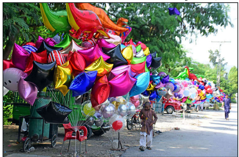
ISLAMABAD: Vendors displayed colorful fancy balloons attraction for customers alongside a road, in the Federal Capital.

An exclusive video regarding Pakistan's dynamic world of Pakistan's Maritime industry was played after the National Anthem. The video showcased the nation's ports, harbours and vital role in global trade and sustainability. From the bustling Karachi Port to the strategic Gwadar Port witness how Pakistan is positioning itself as a key in Maritime innovation.