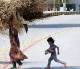
ISLAMABAD: Gypsy woman carrying dry woods on their head for domestic use at a road, in the Federal Capital.

ISLAMABAD (APP): Former prime minister and senior leader of Pakistan People's Party (PPP) Central Punjab, Raja Pervaiz Ashraf on Saturday, criticized the Pakistan Tehreek-e-Insaf (PTI) leadership, calling them the enemy of Pakistan's interests, democracy, parliament, constitution, and peace. Speaking on the floor of the National Assembly, he said, "The leadership of PTI is an enemy of consensus, Pakistan, peace, and the interests of the people, as well as democracy, parliament, and the constitution." He said that while the committee established by the National Assembly Speaker aims to improve