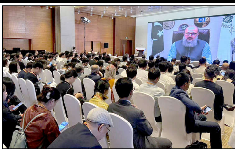
BEIJING: Federal Commerce Minister Jam Kamal Khan speaks via video message at "Pakistan Investment Conference: Together for a Shared Future" organised by the Embassy of Pakistan at the China International Fair for Trade in Services (CIFTIS).

mocracy by representing the will of the people, formulating public policy, and addressing the nation's most pressing challenges. It is the primary forum for addressing grievances, ensuring inclusivity, and fostering a resilient future for Pakistan, the president said. He said "it is through democratic principles that we can achieve equality, socio-economic justice, the rule of law, and freedom of expression". President Zardari stressed that as Pakistan faced contemporary challenges, it was highly essential to strengthen democratic institutions, undertake reforms, and work collectively to consolidate democracy. "Let us recommit ourselves to upholding democratic values and ensuring that democracy continues to flourish in Pakistan," he added. Meanwhile Prime Minister Muhammad Shehbaz Sharif has reaffirmed the country's unwavering commitment to democracy, constitutionalism.