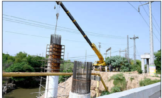
ISLAMABAD: Labourers busy in work of flyover under construction 10th Avenue during development work in Federal Capital.