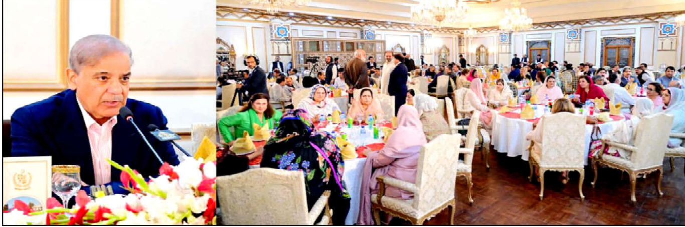
Prime Minister Muhammad Shehbaz Sharif addresses a banquet he hosted in honor of Parliamentarians in Islamabad

Ph: 2841470/2841473 REG: No. BC-116 B/ID-445 Vd XXVI No. 25, Rabi-ul-Awwal 10, 1446 AH Sunday September 15, 2024 Pages 08, Price Rs.15