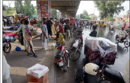
GUJRANWALA: Motorists are standing under the shade of flyover to protect themselves from heavy downpour, at GT road in Gujranwala.