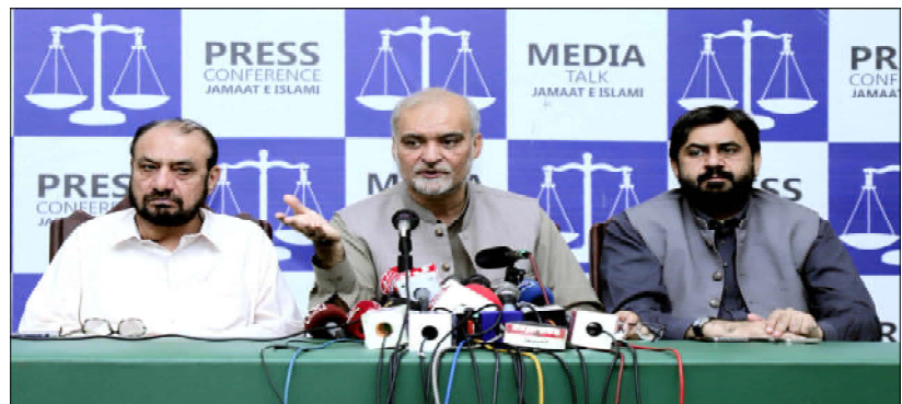
LAHORE: Ameer Jamaat-e-Islami Hafiz Naeemur Rehman addressing a press conference

Law Minister Senator Azam Nazeer Tarar said whosoever would violate the decision of the parliamentary party by casting vote against its decision would be liable to get disqualified. "The Supreme Court in its decision said that they interpret the article as it will be liable to get disqualified there and his vote will not be counted which is strange as the penalty should be imposed if the act is considered otherwise it is null and void. However, the review for the judgment is pending for past two years," he said.