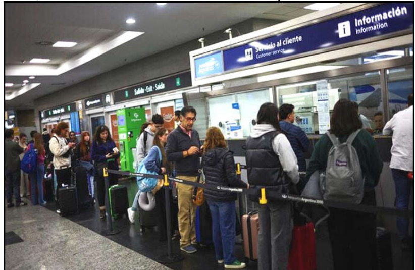
Stranded passengers wait in line at the Aerolineas Argentinas customers service office at the Aeroparque Jorge Newbery airport, during an aviation unions strike, in Buenos Aires.

Monitoring Desk SYDNEY: Australia moved to strip medals from Afghanistans war commanders whose units were involved in alleged war crimes and "unlawful conduct". Defence Minister Richard Marles said the decision — related to specific unit commanders who were in charge between 2005 and 2016 — was needed to "address the wrongs of the past". Fewer than ten commanders will be stripped of their awards, but their names will not be released for privacy reasons. An official inquiry into the 11-year period examined the alleged unlawful killing of 39 civilians and prisoners in Afghanistan by Australia's elite special forces.