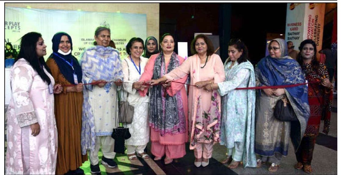
ISLAMABAD: Coordinator to Prime Minister on Climate Change, Romina Khurshid Alam along with others inaugurating 14 Islamabad Expo Exhibition.

alities and work towards the country's betterment. Mustafa Kamal warned that failing to recognize the current situation could lead to widespread disillusionment among PTI members, potentially causing them to leave the party. He emphasized the importance of directly engaging with party leaders to address these issues, rather than relying on ineffective indirect communication. Pakistan Peoples Party (PPP) leader Shazia Marri said that protecting democracy and the Parliament would serve the country's best interests.