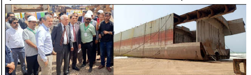
GADDANI: Secretary General International Maritime Organization Arsenio Antonio Dominguez along with Federal Minister for Port and Shipping Qaiser Sheikh visiting Gaddani Ship breaking yard