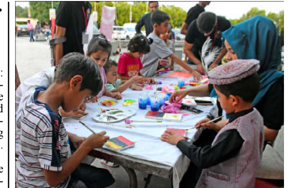
ISLAMABAD: Children taking part in art and painting at Sixth Islamabad Expo at Pak-China Friendship Center in the Federal Capital.

ISLAMABAD (APP): The Islamabad Capital Territory (ICT) police have successfully curtailed criminal activities throughout the year, recovering looted items valued at Rs. 140.16 million. According to police spokesperson these recovered items include vehicles, gold ornaments, motorcycles, cash, and other valuables. He said over the past eight months, police have arrested 1,175 members of 496 criminal gangs involved in serious offenses such as robbery, theft, and vehicle snatching. Additionally, 3,163 individuals linked to property-related crimes were detained, he added.