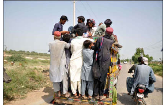
HYDERABAD: Passengers are travelling on an overloaded vehicle that may cause any life risk of them, passing through a road violating the traffic rules, need attention of authorities, in Hyderabad.