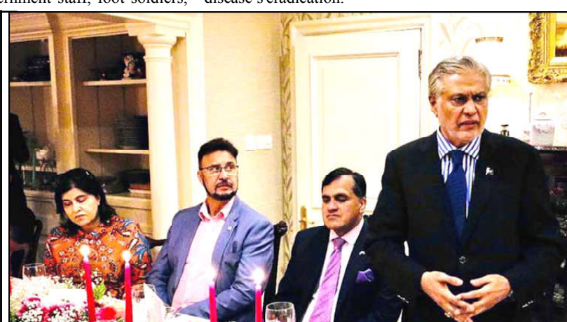
Senator Mohammad Ishaq Dar, Deputy Prime Minister/Foreign Minister interacts with British Parliamentarians of Pakistani origin in London.

Authorities have sealed the affected areas, gathered evidence, and launched investigations into the attacks three viduals.