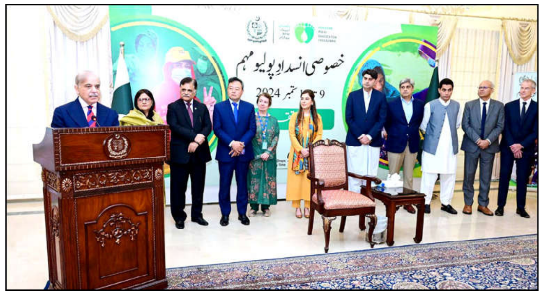
ISLAMABAD: Prime Minister Muhammad Shehbaz Sharif addressing the inaugural ceremony of countrywide Special Anti-Polio Campaign.