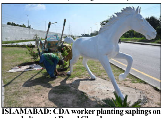
green belt area at Rawal Chowk.

rate and encourage every child to complete their education, the prime minister pointed out that the government had introduced scholarships and other incentives. In this rapidly emerging world, developing literacy and skills in line with technology is inevitable; the prime minister said adding that the government was implementing a comprehensive plan to integrate technology into the educational system, ensuring that the youth were equipped with the necessary skills to thrive in the digital economy