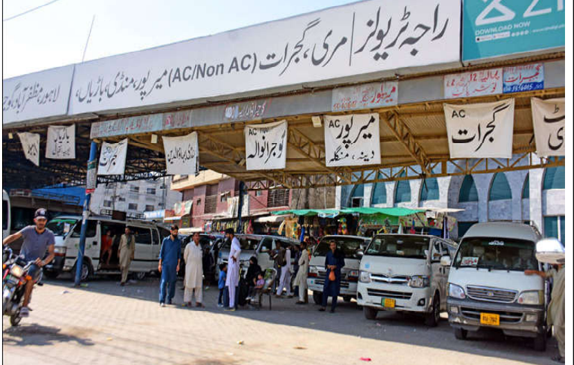
ISLAMABAD: A view of deserted look Bus stand as commuters facing problems in travelling, as the road of the twin cities were blocked in the wake of PTI Jalsa at Sangjani in the Federal Capital.

With a collective grant of USD 77.8 million, the project is the largest such investment at the national level. and is estimated to directly benefit more than 680,000 people and indirectly support morethan 7 million people across theproject sites in Pakistan