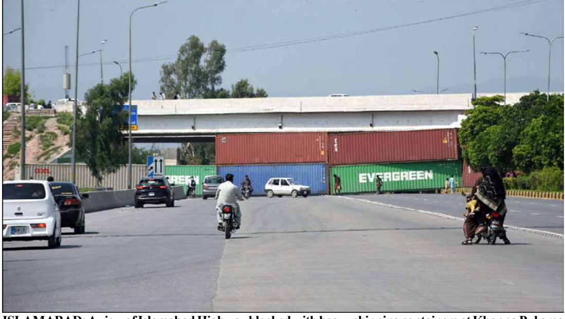
ISLAMABAD: A view of Islamabad Highway blocked with heavy shipping containers at Khanna Pul area due to security reason during PTI public gathering (Jalsa) at Sangjani, in the Federal Capital.