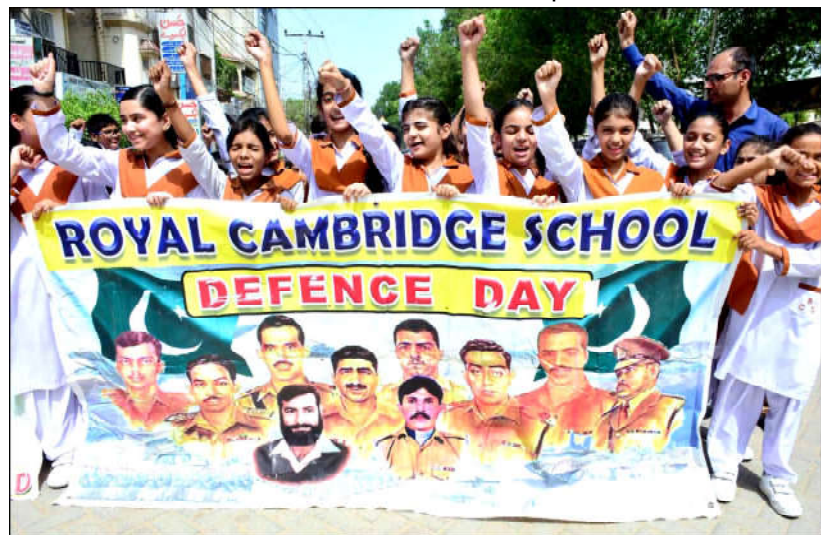
HYDERABAD: Students are participating in the rally in connection with Pakistan Defense Day at Latifabad.

This race aims not only to promote cycling as a sport but will also serve as a platform to unite cycling enthusiasts from different regions, who promote camaraderie and sportsmanship. Both PCF and SSGC are leaving no stone unturned to make this event a memorable one for all participants and spectators.