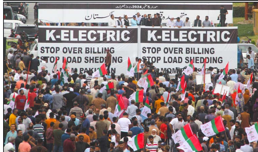
KARACHI: MQM Pakistan activists hold protest outside K electric.