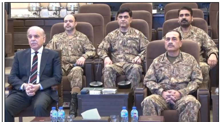
RAWALPINDI: Prime Minister, Muhammad Shehbaz Sharif along with General Asim Munir, Chief of Army Staff (COAS) attended Concluding Session of Army War Game held in Rawalpindi.

Acknowledging the challenges in Balochistan, he noted that certain elements exploited some sort of 'deprivation' among the local population.