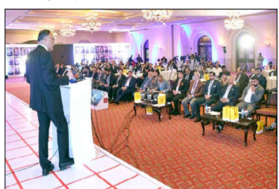
ISLAMABAD: Federal Minister for Planning, Development and Special Initiatives Ahsan Iqbal speaking as the Chief Guest at the launch of the book "Pakistan's 100 Most Successful CEOs and Diplomats."

The president reassured the nation of unwavering commitment to eradicating terrorism from the country, emphasising that efforts would continue till the menace was completely eliminated.