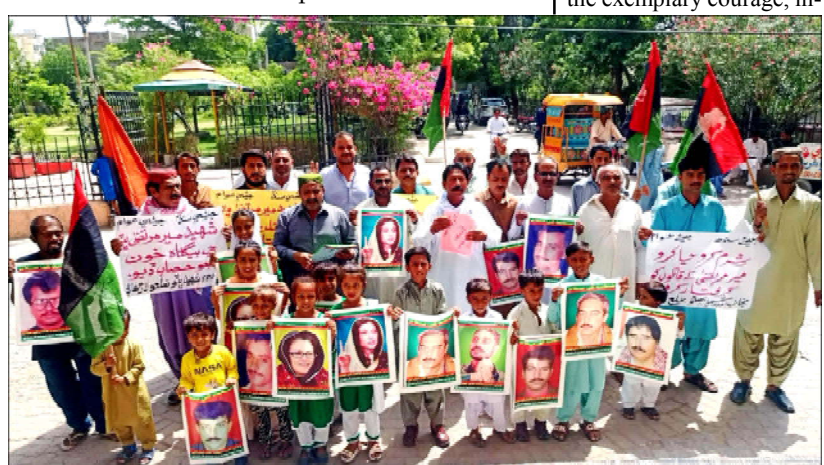
LARKANA: Activists of Peoples Party Shaheed Bhutto (PPP-SB) holding protest demonstration for arrest killers of Martyred Mir Murtaza Bhutto and his friends and demanded justice for them, held at Jinnah Bagh

During the visit, the Assistant Commissioner strictly instructed the shopkeepers to avoid placing goods on both sides of the road, otherwise strict action will be taken against them.