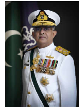
PN Task Group destroyed Indian radar station and shore installations at Dwaraka, establishing uncontested dominance at sea from the very outset of the conflict.

"Today, we pay tributes to the courageous heroes who were audacious in their planning, undaunted in their action and instilled fear in the hearts of our enemy. Pakistan Navy's Operation 'SOMNATH' remains a shining example to this unflinching resolve, as we commemorate this venerable occasion to honour the feats and sacrifices of our brave sentinels of sea, our Navy stands vigilant and unfaltering in its commitment to defend maritime borders and secure our vital sea routes - the lifeblood of our economy."