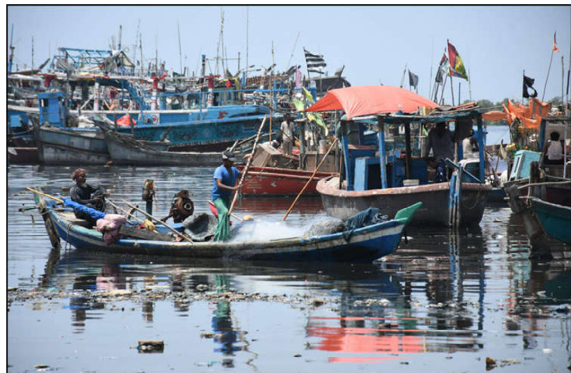
KARACHI: Fishermen on the way for fishing on small launch in the morning.