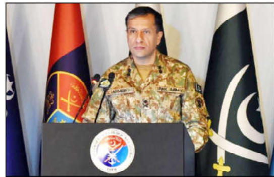
emerged martyrdom in the last eight months, calling them real heroes of the nation. He assured their families that their sacrifices would not be in vain.

embraced martyrdom in the last eight months, calling them real heroes of the nation. He assured their families that their sacrifices would not be in vain. Highlighting a recent operation in the Tirah Valley against the banned Tcheek-i-Taliban Pakistan