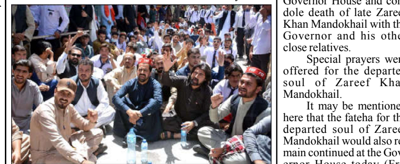
QUETTA: Different students union holds protest outside QPC.