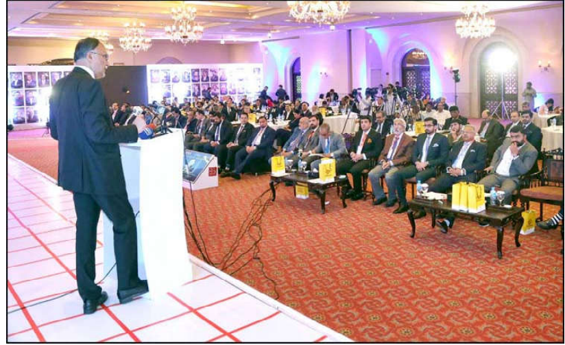
ISLAMABAD: Federal Minister for Planning, Development and Special Initiatives Ahsan Iqbal speaking as the Chief Guest at the launch of the book "Pakistan's 100 Most Successful CEOs and Diplomats."