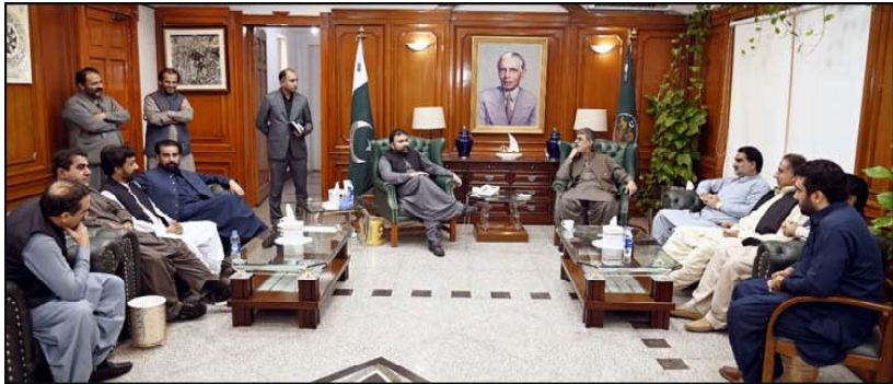
QUETTA: Provincial Ministers, Parliamentary Secretaries and others meeting with Chief Minister Balochistan Mir Sarfaraz Ahmed Bugti

the event of aggression. The military leadership reaffirmed their unwavering resolve to safeguard the national sovereignty and territorial integrity at all cost. It was reiterated that Pakistan Army remained fully cognizant of the prevailing security challenges and would continue to enhance its capabilities to thwart any aggressive designs against Pakistan. Federal Ministers for Defence, Finance and Information, Chief of the Army Staff and senior military officials were in attendance.