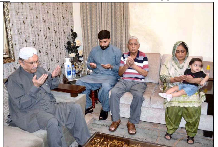
LAHORE: President Asif Ali Zardari offering Fateha over the martyrdom of Captain Muhammad Ali Qureshi Shaheed during his visit to Lahore.

It was decided that all the public transport would be operated on all routes in the day time. It was informed that a proposal is also under consideration to operate the transport in form of convoy in the night for all the concerned security institutions would ensure safety of the passengers through joint strategy. It was also decided to increase patrolling of the law enforcement agencies on the national highways located all over the province. Addressing the meeting, Additional Commissioner Quetta sought cooperation of the transport union for protection of the passengers and ensuring safe journey on the highways. He said that protection of general public is responsibility of the government and as such it would take measures for their protection.