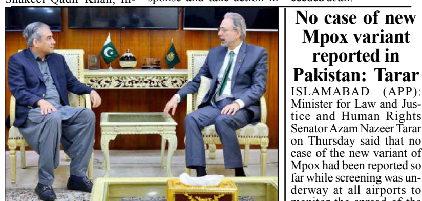
ISLAMABAD: Interior Minister Mohsin Naqvi in a meeting with Ambassador of Turkey Dr. Mehmet Pacaci.

case of any incident. He on the occasion directed to the Inspector General of Police to end safari culture from the police and ensure merit in the department. Similarly, he directed to the Director General Levies to improve professional training of the Quick Response Force of Levies force further. He asserted that we would eliminate the terrorism, crimes and subversive acts from the province. He said that the ultimate victory against war of terrorism would be ours and adding he asserted that endeavours of weakening the state would not be succeeded at all.