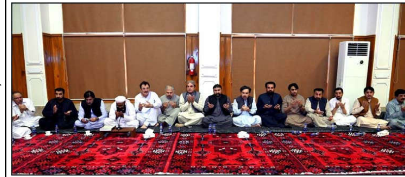
QUETTA: Chief Minister Balochistan Mir Sarfaraz Ahmed Bugti offering Dua after condoling with Governor Balochistan Sheikh Jaffar Khan Mandokhail on sad demise of his uncle former Senator Sheikh Zareef Khan Mandokhail

Tarar said during the previous tenure, the government faced threat of default and due to fluctuating currency rates.