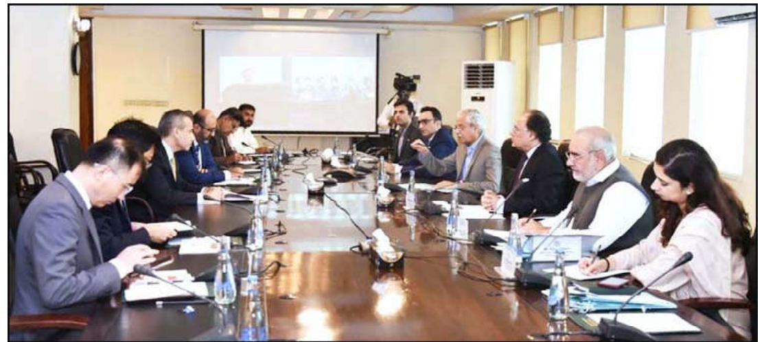
ISLAMABAD: Federal Minister for Finance and Revenue, Senator Muhammad Aurangzeb in a meeting with the leadership of Pak China Investment Company Limited (PCICL) to discuss boosting Chinese investment in Pakistan.

peace is only possible when the plight of the Kashmiri people is alleviated. They bear illegal subjugation and a continuous reign of terror by the Indian armed forces over the unfinished agenda of the partition of the sub-continent. The revocation of the autonomous status of Indian Illegally Occupied Jammu and Kashmir (IIOJK) has further compounded the problem.