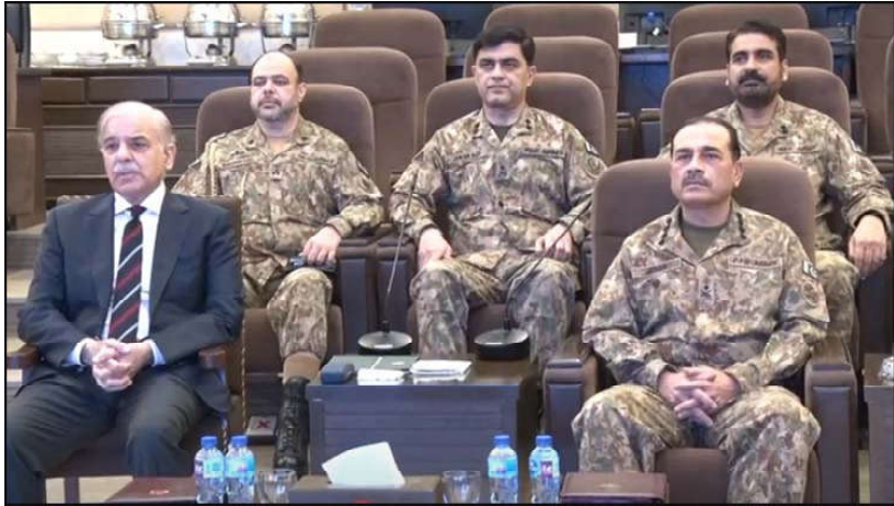
RAWALPINDI: Prime Minister, Muhammad Shehbaz Sharif along with General Asim Munir, Chief of Army Staff (COAS) attended Concluding Session of Army War Game held in Rawalpindi.

Ph: 2841470/2841473 Vol: XIX No. 194, Rabi-ul-Awwal 01, 1446 AH Friday September 06, Pages 04, Price Rs.15