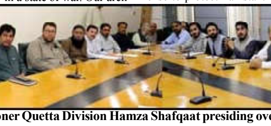
QUETTA: Commissioner Quetta Division Hamza Shafiqat presiding over a meeting of Coordination Committee regarding development projects