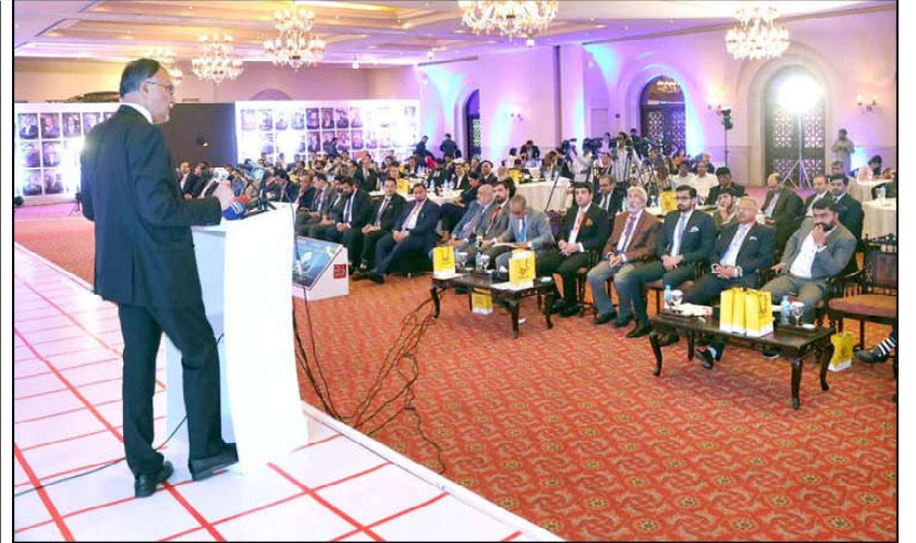
ISLAMABAD: Federal Minister for Planning, Development and Special Initiatives Ahsan Iqbal speaking as the Chief Guest at the launch of the book "Pakistan's 100 Most Successful CEOs and Diplomats."

ISLAMABAD (APP): President Asif Ali Zardari has said that Pakistan's armed forces were vigilant and ever ready to respond to any challenge to national sovereignty and territorial integrity and also fully prepared to defeat terrorists. The president, in his message to the nation on the Defence and Martyrs' Day of Pakistan, said that Pakistan's armed forces were provided with adequate defence equipment and possessed the desired professional skills and the will to protect the country from all challenges. On the Day, he paid homage to the country's Ghazis and Shuhada, who rendered immense sacrifices and bravely defended the country against external aggression. "This day is a reminder of our nation's unwavering commitment and determination to defend its sovereignty. I pay homage to the brave sons of the soil who shattered the enemy's dreams to harm Pakistan," he remarked. The president said that Pakistan sought peace and stability in the region and was committed to peaceful coexistence with all neighbours. "However, enduring peace is only possible when the plight of the Kashmiri people is alleviated. They bear illegal subjugation and a continuous reign of terror by the Indian armed forces over the unfinished agenda of the partition of the sub-continent. The revocation of the autonomous status of Indian Illegally Occupied Jammu and Kashmir (IIOJK) has further compounded the problem."