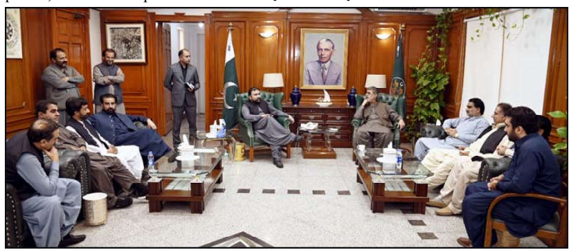
QUETTA: Provincial Ministers, Parliamentary Secretaries and others meeting with Chief Minister Balochistan Mir Sarfaraz Ahmed Bugti

The prime minister, who was attending the concluding session of Army War Game, also acknowledged the Armed Forces' role in preserving the delicate balance of power, essential for peace in nuclearized South Asia, according to a press release.