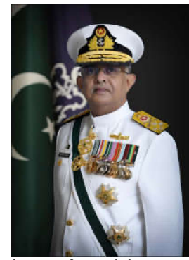
ISLAMABAD: Chief of the Naval Staff, Admiral Naveed Ashraf