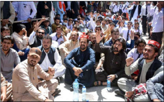
QUETTA: Different students union holds protest outside QPC.