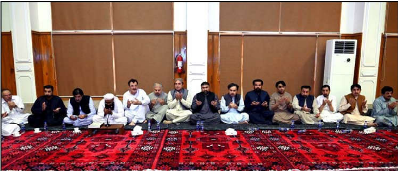
QUETTA: Chief Minister Balochistan Mir Sarfraz Ahmed Bugti offering Dua after condoling with Governor Balochistan Sheikh Jaffar Khan Mandokhail on sad demise of his uncle former Senator Sheikh Zareef Khan Mandokhail