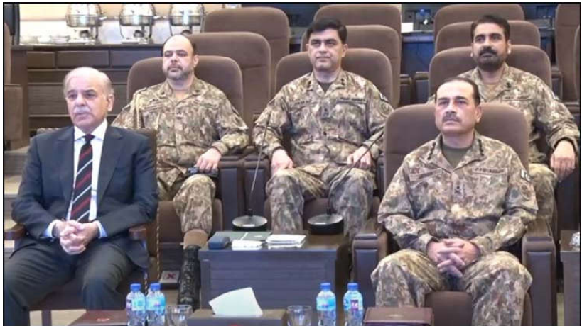
RAWALPINDI: Prime Minister, Muhammad Shehbaz Sharif along with General Asim Munir, Chief of Army Staff (COAS) attended Concluding Session of Army War Game held in Rawalpindi.

Ph: 2841470/2841473 Vol: XX No. 59, Rabi-ul-Awwal 01, 1446 AH Friday September 06, 2024, Pages 04, Price Rs.15