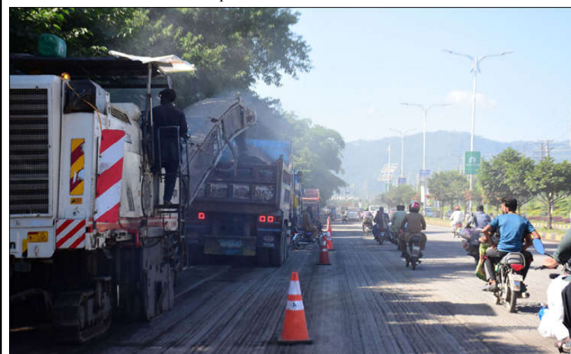
ISLAMABAD: Road reconstruction under process outside Islamabad Club in the Federal Capital.