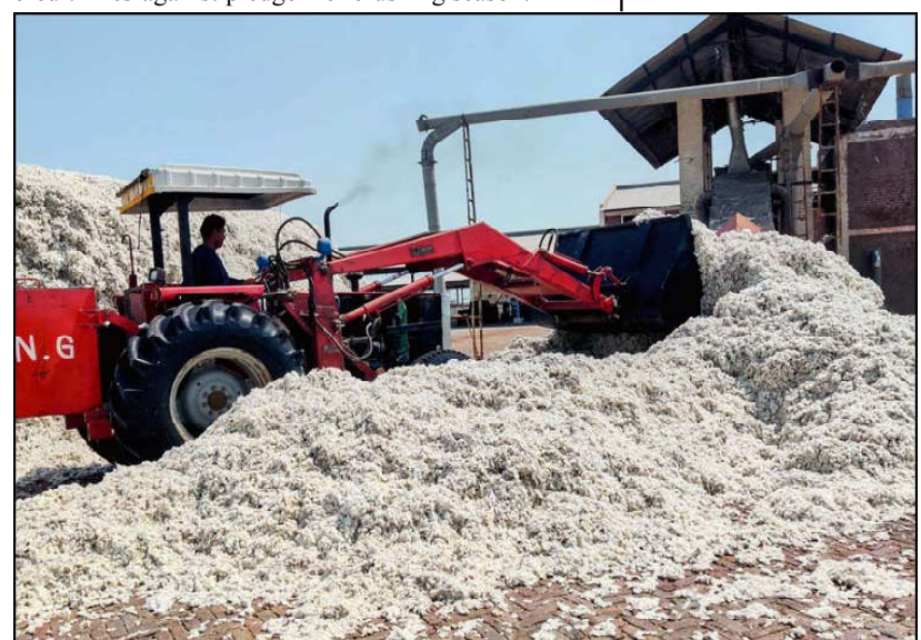
SUKKUR: Labours busy generating cotton and their work to earn their livelihood for support their families, at workplace as the demand of cotton for making warm clothes increased in city due arrive of winter season while the cotton generators are facing severe losses due to low production in all the districts of Sindh, in Sukkur.

This bullish trend of PSX was driven by optimism surrounding the anticipated approval of a $7 billion loan from the International Monetary Fund (IMF), with the IMF Executive Board scheduled to meet on September 25, according to AHL research. Additionally, a 50 basis points rate cut by the Federal Reserve boosted market participation across Asian markets, including Pakistan. Large Scale Manufacturing Industries (LSMI) output saw a year-on-year increase of 2.4% in July 2024, although it decreased by 2.1% on a month-on-month basis.