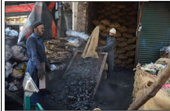
RAWALPINDI: Workers shoveling coal at Hamilton Road for customers at a coal yard.