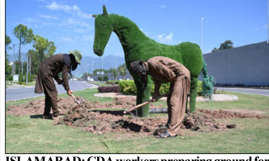
ISLAMABAD: CDA workers preparing ground for planting saplings on green belt area at Rawal Chowk.

adopting corporate best practices. As part of this initiative, the newly established Technology and Digitalization Wing block, has been made operational. This block is equipped with state-of-the-art hardware and software to enhance efficiency. A corporate-style work environment has been introduced, featuring open desks work environment and an open-door policy to enhance efficiency and transparency. The implementation of this modern technology is part of a broader initiative aimed at increasing transparency in office operations and improving overall performance.