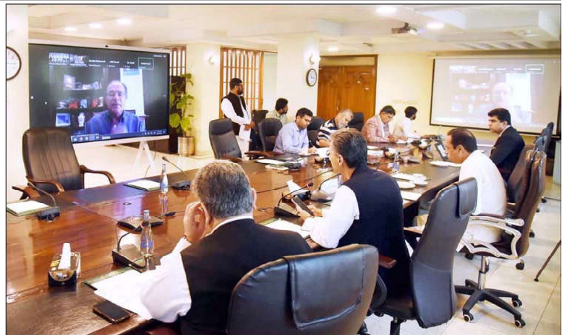
ISLAMABAD: Federal Minister for Finance and Revenue, Senator Muhammad Aurangzeb, chairs the virtual meeting of the Cabinet Committee on State-Owned Enterprises (CCoSOEs) at the Finance Division.

adding the development and progress of Small Medium Enterprises are top priority of the current government. The government is determined to maintain equitable development of SMEs in all provinces of the country that is why a coordination process has been initiated with provinces on direction of the PM, he said and assured that the government will facilitate and incentivize SMEs to achieve optimal economic growth in the country.