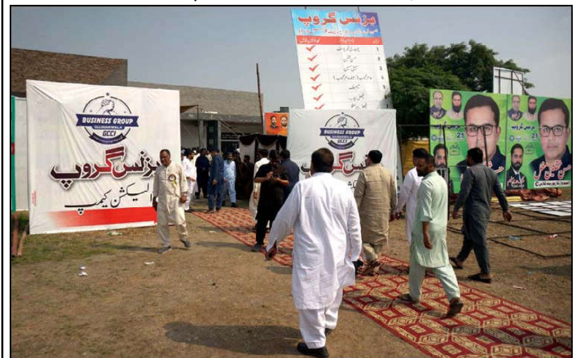
GUJRANWALA: Members of Gujranwala Chamber of Commerce and Industry gather for casting their votes during Gujranwala Chamber of Commerce and Industry Election 2024-25, held at GCCI premises in Gujranwala.

most popular and frequently purchased items were available with minimal or no discount. Consequently, a clear gap was observed between the advertised discounts and the real offers, compelling the customers to ask multiple questions to determine the actual discounts available on their chosen items. Some of the brands were, however, offering flat discounts or concessions (discounts up to some upper limit) with adequate disclosures/disclaimers i.e. on the entire/limited or specified stock which is highly appreciated by the CCP. The Commission advises various consumer brands offering discounts to preclude distributing any misleading information and ensure clear and adequate disclosures regarding actual and discounted prices with the details of the stock on offer with flat or differential discounts. Undertakings, Brands and outlets violating this directive may face enforcement action by the CCP under Section 10 of the Competition Act, 2010. Similarly, consumers are also advised to exercise vigilance.