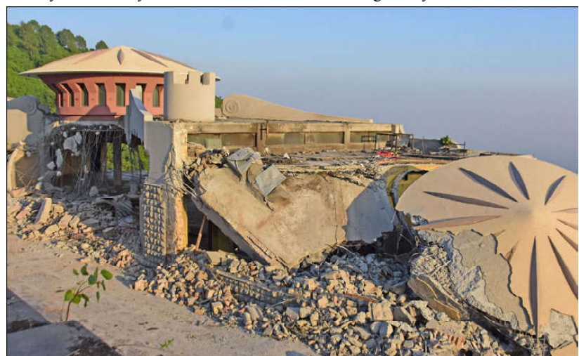
ISLAMABAD: Work in progress on Demolition of illegal constructions in Margallah Hills by Islamabad Wildlife Management Board.