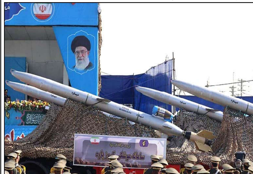
Bavar missiles are displayed during the annual military parade marking the anniversary of the outbreak of the Iran-Iraq war in Tehran.