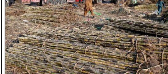
ISLAMABAD: A laborer busy in loading sugarcane on delivery truck at Vegetable and Fruit Market in Federal Capital.

The Iris portal, a user-friendly tax filing system, is a key initiative in this effort, he said, adding that the FBR is focused on building a motivated, satisfied.