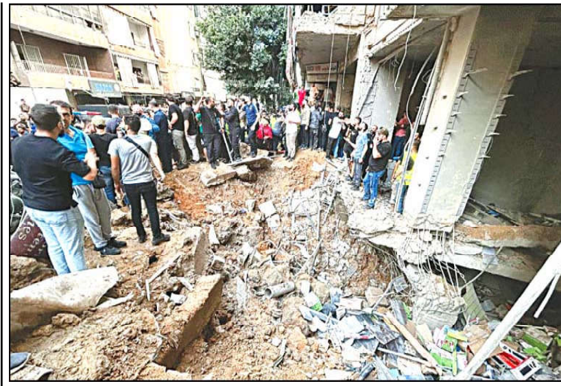
BEIRUT: People inspect the damage at the scene of an Israeli strike in the southern suburbs of the Lebanese capital.