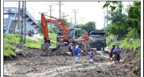
ISLAMABAD: Heavy machinery being used for the repair of Pandora Link Road in the Federal Capital.

Each participant will undergo a full body search before being allowed entry, he added.