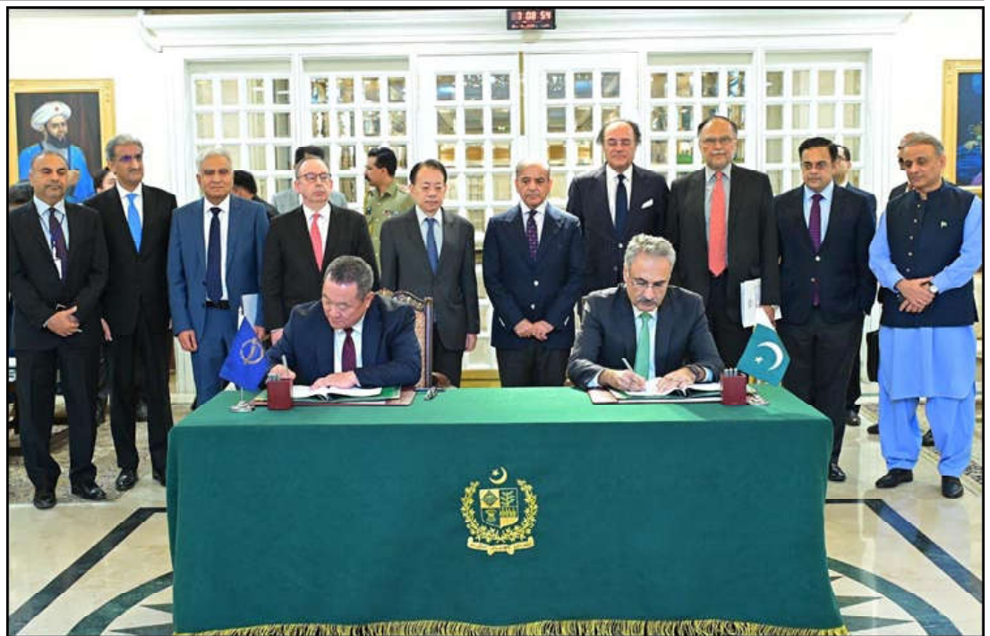
ISLAMABAD: Prime Minister Muhammad Shehbaz Sharif and President of Asian Development Bank Mr. Masatsugu Asakawa witness signing of loan agreements with regard to Sindh Emergency Housing Reconstruction Project and Khyber Pakhtunkhwa Rural Roads Development projects.