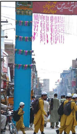
QUETTA: A view of gate install on Liqaut bazaar in connection with Jashne Eid Milad Un Nabi (SAWW) on 12th Rabi Ul Awwal.

In response to a query regarding the opposition's claim of not receiving the draft of the amendments, he clarified that constitutional drafts are never made public, rather these are presented in the Parliament.