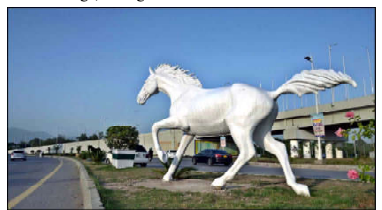
ISLAMABAD: A newly installed horse model by CDA adds beauty to Rawal Dam Chowk in the Federal Capital.

This cooperative initiative marks an important step in advancing elder care in Pakistan, allowing both countries to explore further cooperation in smart elder care in a more refined, standardized, and professional manner, according to a report from China Economic Net.