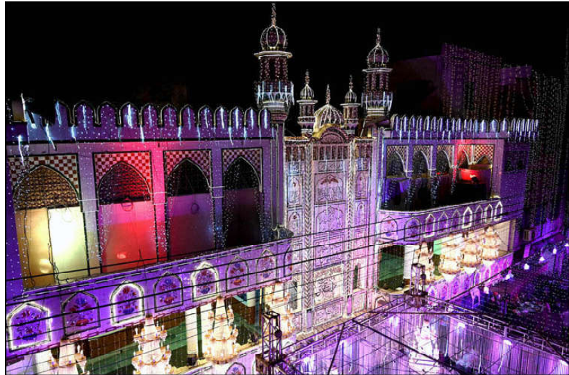
LAHORE: An illuminated view of Jamia Masjid Shah Inayat Qadri (Oonchi Masjid) decorated with colorful lights in connection with Eid Milad-un-Nabi (SAWW) Celebrations.