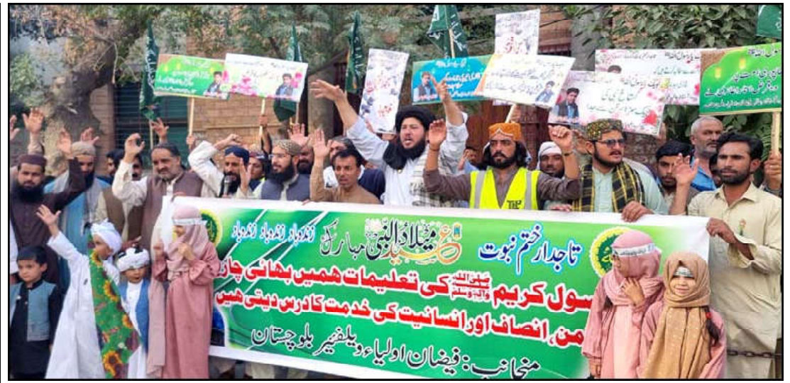
QUETTA: Members of Religious Organization holding Jashan-e-Eid Milad-un-Nabi (SAW) rally in connection of 12th Rabi-ul-Awwal

youth were well-positioned to provide IT solutions to companies across the United States at much more affordable rates. Similarly, Pakistan could also help meet the demand for pharmacists and nurses in the United States, he added. The meeting also discussed Pak-US cooperation in the education sector and ongoing efforts to strengthen existing collaboration.