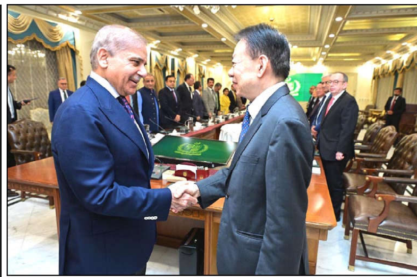
ISLAMABAD: President of Asian Development Bank Mr. Masatsugu Asakawa calls on Prime Minister Muhammad Shehbaz Sharif.

LASBELA (APP): Several persons were injured in a collision between two passenger coaches on Makran-Coastal Highway in Lasbela district of Balochistan, news channels quoting Rescue sources reported on Monday.