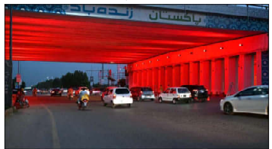
ISLAMABAD: A view of newly installed colorful lights under a bridge at Zero Point in Federal Capital.