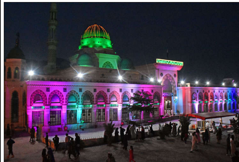
ISLAMABAD: An illuminated view of a Shrine of Bari Imam decorated with colorful lights, in connection with Eid Milad-un-Nabi (PBUH) celebrations, in the Federal Capital.