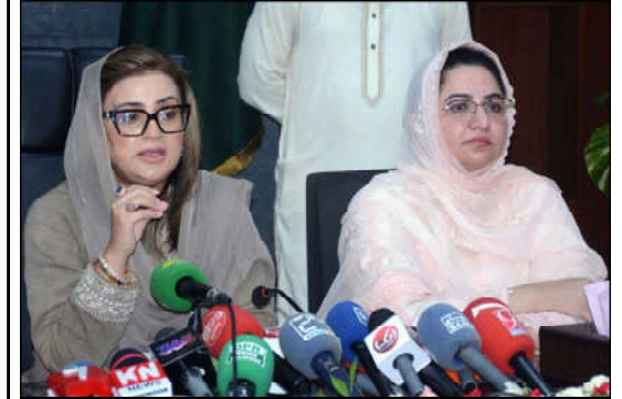
FAISALABAD: Punjab Information and Culture Minister, Ms. Uzma Bukhari, briefs the media on the arrangements for the Eid Milad-ul-Nabi celebration at the Commissioner's office.

Facilitation Council. He said that development in the country depends on development in industry and trade and international investment. The Governor Punjab said that the government is committed to increase investment by introducing investor-friendly policies. He said that the investment from friendly countries in various sectors including agriculture and energy is welcomed. He said that all sectors of the economy are open for investment with attractive incentives and liberal policies to provide favorable business.