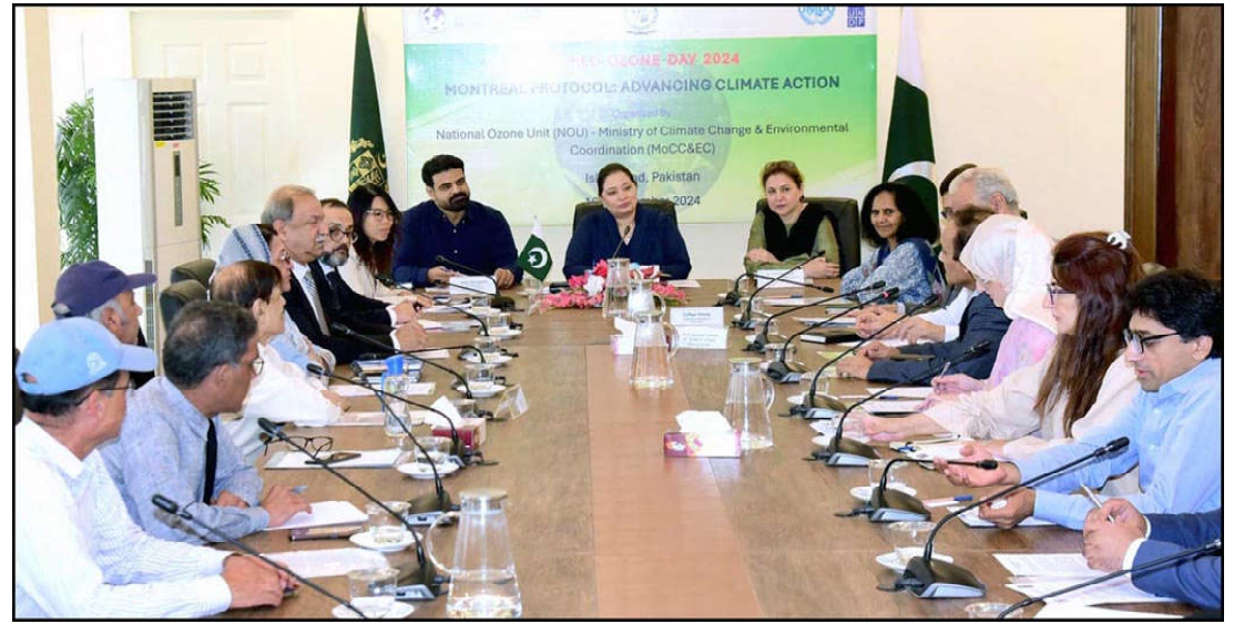
ISLAMABAD: Coordinator to Prime Minister on Climate Change, Romina Khurshid Alam addressing at the World Ozone Day 2024 event in Islamabad.

"Ozone for Life: Solutions for a Warming Planet", she reaffirmed the present government's dedication to preserving the ozone layer and combating climate change. Romina Khurshid Alam highlighted that this year's theme emphasises the critical role of the ozone layer in protecting life on Earth and highlights the interconnectedness of ozone layer protection and climate action. It reflects the ongoing efforts to address both ozone depletion and