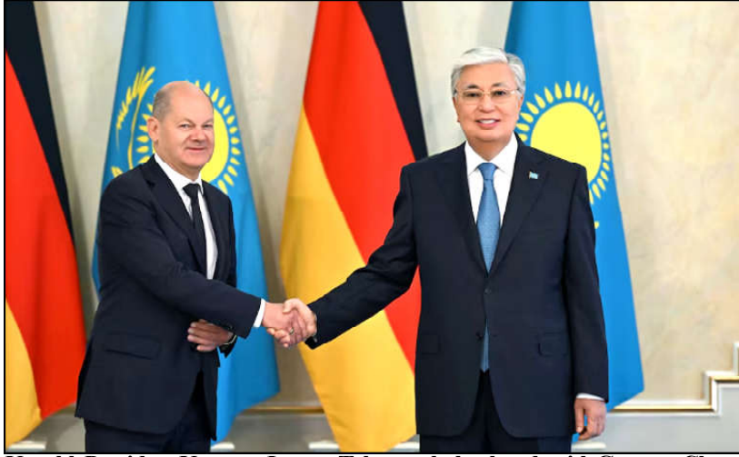
Kazakh President Kassym-Jomart Tokayev shakes hands with German Chancellor Olaf Scholz during a meeting in Astana, Kazakhstan.

Monitoring Desk ISTANBUL: A senior Hamas official told AFP on Sunday that the Palestinian Islamist movement had ample resources to continue fighting Israel despite losses sustained over more than 11 months of war in Gaza. "The resistance has a high ability to continue," Osama Hamdan told AFP during an interview in Istanbul. "There were martyrs and there were sacrifices... but in return there was an accumulation of experiences and the recruitment of new generations into the resistance." His comments came less than a week after Israeli Defence Minister Yoav Gallant told journalists that Hamas, whose October 7 attack triggered the war, "no longer exists" as a military formation in Gaza. "The number of casualties... is much less than what is expected in a battle of this size, level and breadth," Hamdan said on Sunday. Israeli Prime Minister Benjamin Netanyahu launched retaliatory military operations to destroy Hamas after the group's surprise attack on southern Israel, which resulted in the deaths of 1,205 people, mostly civilians, according to an AFP tally based on Israeli official figures.