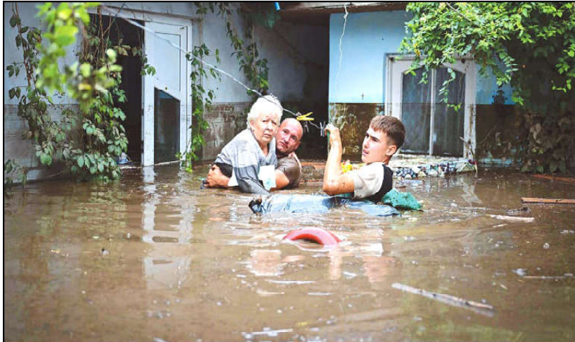
Residents rescue an elderly person from the rising flood waters in the Romanian village of Slobozia Conachi.