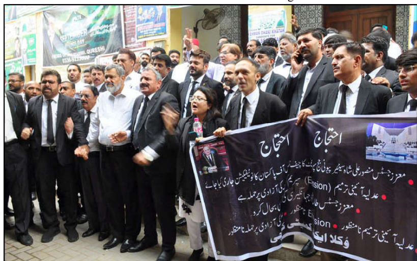
KARACHI: Lawyers hold a banner during protest in favor of their demands at city court, in the Provincial Capital.