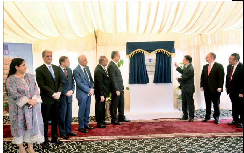
ISLAMABAD: The President of Asian Development Bank (ADB) Masatsugu Asakawa is inaugurating the foundation of ADB's new building in the presence of Secretary Economic Affairs in Federal Capital.