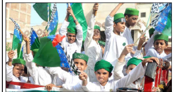
HYDERABAD: Children participating in rally in connection with Eid-Milad-un-Nabi celebrations at Latifabad.

After the deadline, strict action will be taken against the use of plastic bags. The meeting decided to launch a project to convert brick kilns to zig-zag technology. Under the project, soft loans will be provided to owners on easy terms. The meeting discussed the declaration of tourist areas as environmentally sensitive. The Environment Department was directed to consult with all stakeholders and submit final proposals for cabinet approval. The meeting discussed the establishment of a Climate Change Center. Relevant authorities were directed to submit proposals for the establishment.