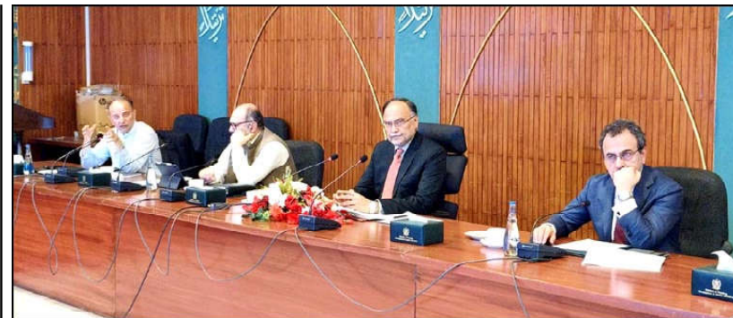
Federal Minister for Planning, Development, and Special Initiatives, Prof. Ahsan Iqbal, chairing a meeting of the Cabinet Committee on Chinese Investment Projects (CCoCIP) here in Islamabad.

tors. Justice Naeem Akhtar Afghan remarked already there are enormous difficulties. We will not let the public funds waste. The CJP remarked "work out projects but all should be done under constitution. Governments are changed then the projects linger on. The development projects should not be worked out under the individual persons. We have no concern with it what projects are being framed. There should be transparency. The court adjourned the hearing of the case for three weeks.