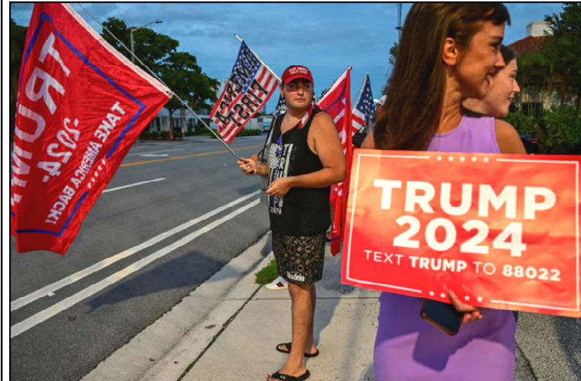
Supporters of Donald Trump gather around Mar-A-Lago, after he returned from Trump International Golf Club following an assassination attempt, to his residence at Mar-A-Lago, in Palm Beach, Florida.

Monitoring Desk PYONGYANG: North Korean Foreign Minister Choe Son Hui has flown to Russia to attend the fourth Eurasian Women's Forum and the BRICS Women's Forum in Saint Petersburg, Russia's embassy in North Korea said on Monday. "Russian Ambassador (Alexandra Ivanovich) Matsegora saw off North Korean Foreign Minister Choe Son Hui at the Pyongyang International Airport," the embassy said in a post on its Vkontakte social network.