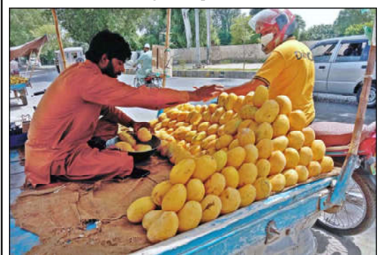
BAHAWALPUR: A man buys fresh mangoes from a local vendor at a roadside stall in the city.