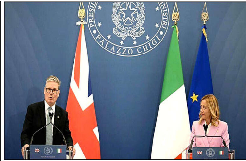
Italian Prime Minister Giorgia Meloni and British Prime Minister Keir Starmer give a joint press conference at Villa Doria Pamphili in Rome after their meeting.