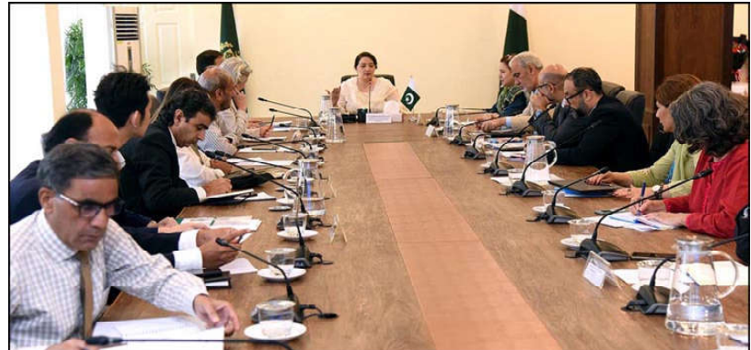
ISLAMABAD: Prime Minister's Coordinator on Climate Change and Environmental Coordination, Romina Khurshid Alam addressing a meeting of development partners regarding preparation for COP29.

Detailed information about all the programs offered is also available on the university website.