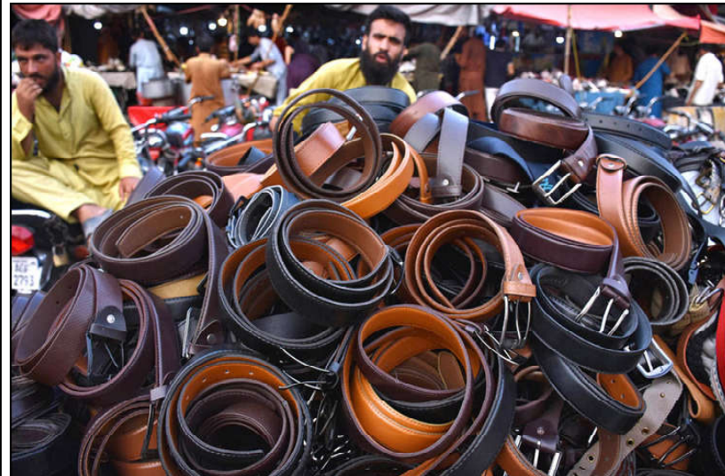
LAHORE: A vendor displaying and selling the leather belts on his handcart at Landa Bazar in the Provincial Capital.

ISLAMABAD (APP): The 100-Index of the Pakistan Stock Exchange (PSX) continued with bullish trend on Wednesday, gaining 970.20 more points, a positive change of 1.22 percent, closing at 80,461.34 points against 79,491.14 points on the last working day. A total of 400,195,963 shares were traded during the day as compared to 536,187,271 shares the previous day, whereas the price of shares stood at Rs 15,904 billion against Rs. 8,911 billion on the last trading day. As many as 439 companies transacted their shares in the stock market.