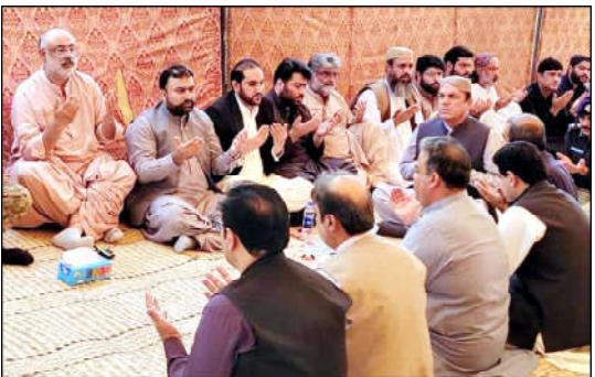
Chief Minister Balochistan Mir Sarfaraz Ahmed Bugti offering Dua after condoling death of Provincial Minister Sardar Safar Chakar Khan Domki with his relatives in Lehri.

provide a forum to discuss opportunities for enhancing intra-Commonwealth cooperation on a number of important issues, such as fostering sustainable development, strengthening democratic institutions, and empowering Commonwealth youth. Noting the King's longstanding interest in environmental issues and various initiatives for climate sustainability, the prime minister said that he particularly looked forward to engaging with Commonwealth leaders on climate change, as Pakistan was highly vulnerable to the impacts of climate change. The prime minister also inquired after the King's health and conveyed his best wishes for The Princess of Wales, who had successfully completed her treatment.