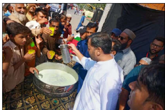
KARACHI: Muttahida Qaumi Movement (MQM-P) Deputy Convener, Mustafa Kamal along with others distributing drinking juice from Sabeel during celebration of religious procession on the occasion of 12th Rabi-ul-Awwal Eid Milad-un-Nabi.

During a briefing with the Secretary of the C&W Department and other officials, it was disclosed that an additional 13-kilometre section is being constructed to further connect Sahiwal to nearby areas, with a budget of Rs. 1.4 billion. This additional development is expected to be completed soon. The minister emphasized the government's commitment to improving public infrastructure, stating, "Our mission is to provide the best facilities to the public." He also highlighted the introduction of e-tendering to ensure transparency and confirmed that high-quality materials are being used to guarantee the durability of the roads. He assured that more highways would be completed in the near future, further enhancing Punjab's road network.