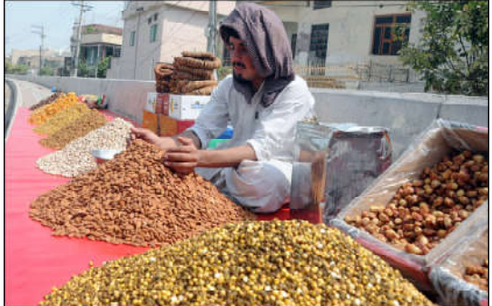
MULTAN: A vendor displaying dry fruit at his roadside setup on the footpath to attract customers.