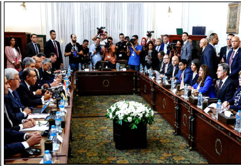
U.S. Secretary of State Antony Blinken attends a U.S.-Egypt strategic dialogue with Egypt's Foreign Minister Badr Abdelatty in Tahrir Palace in Cairo, Egypt.

He cited Hamas' execution of six Israeli hostages last month. He did not name Israel, which is believed to have targeted members of groups aligned against it in Lebanon, Syria and Iran that have set back the talks. President Abdel Fattah al-Sisi told Blinken in their meeting on Wednesday morning that Egypt opposed attempts to "escalate the conflict and expand its scope regionally" and called for all parties to act responsibly, the Egyptian presidency said in a statement.