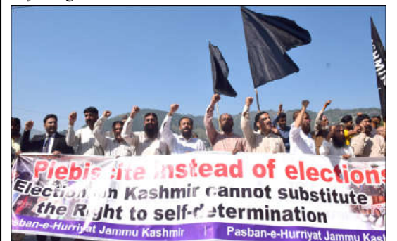
MUZAFFARABAD: Kashmiris shouting slogans at Azadi Chowk against the elections in Occupied Kashmir and demanding referendum.

The bench inquired from EC authorities if we don't accept intra party election of PTI now too then what will be future. DG political finance told the bench no organizational structure of party will remain any more. The bench directed the authorities to provide assistance to them at this point. Barrister Gohar said we too will assist you on this matter. EC had done what it could do on not holding intra party election. Member KP inquired if even now too we don't accept PTI intra party election then we have powers to do what.