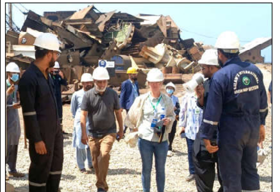
GADDANI: Team of IMO visiting Gaddani Ship Breaking Yard

Meanwhile, the processions were also taken out and different activities organized in other parts of the province marking the Eid Miladun Nabi (SAW).