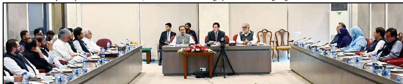
ISLAMABAD: Speaker National Assembly Sardar Ayaz Sadiq in a meeting with MPs & Officers of Khyber Pakhtunkhwa at Parliament House.

The government has recently reduced the petroleum prices according to which, diesel has been reduced by Rs 13.6 paisa and petrol by Rs.10 per litre.