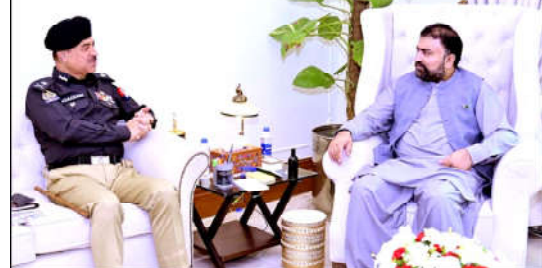
QUETTA: Inspector General of Police Balochistan Moazzam Jah Ansari meeting with Chief Minister Balochistan Mir Sarfraz Ahmed Bugti

The Chief Minister issued on the spot directives to concerned authorities to resolve the issues. Speaking to the public delegations, Mir Sarfraz Bugti said that sustainable solution can be found to the public issues by improving governance. He said that the common men are deprived of the basic facilities including health and education and they are facing different issues and hardships. The Chief Minister said that if the institutions established for the public interests may play effective role as per their mandate, then 90 percent of the issues can be resolved at the local level. He stressed that every official has to perform to serve the general public.