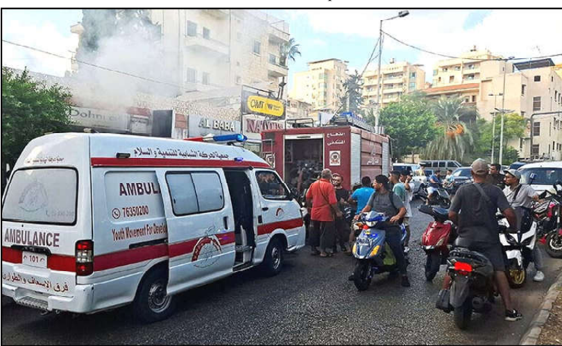
People gather as smoke rises from a mobile shop in Sidon, Lebanon.

The protests began in July and morphed into an anti-government movement. Hasina has been living in India since. The country's powerful military is play-