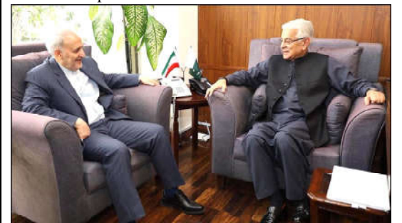
ISLAMABAD: Iranian Ambassador to Pakistan Dr. Reza Amiri Moghadam called on Federal Minister for Defence, Defence Production, and Aviation Khawaja Muhammad Asif.