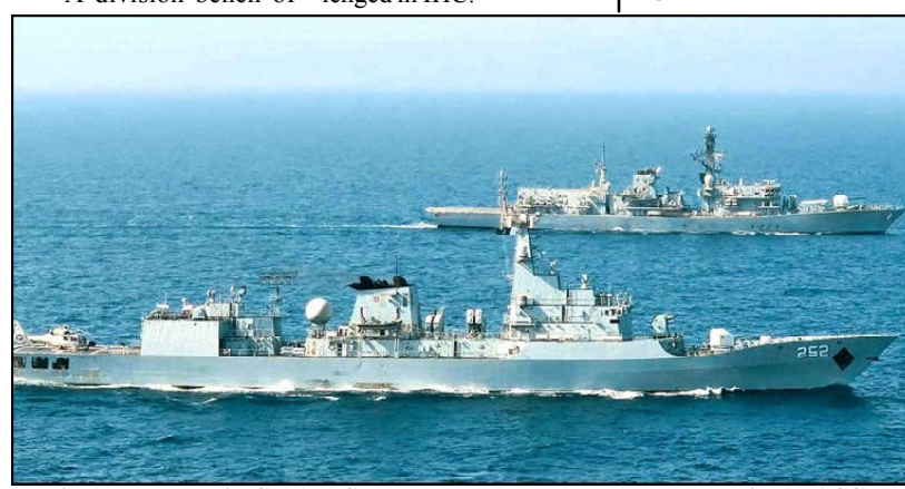
Pakistan Navy ship SHAMSHEER conducted passage exercise (PASSEX) with HMS LANCASTER during Regional Maritime Security Patrol.

cation and as such is taking concrete steps for its promotion. He said that no conscious person can deny the importance of science and information technology in present era. The Provincial Ministers and other participants stressed the need to improve performance of the universities further. They asserted that no negligence would be tolerated in the educational activities of the students.