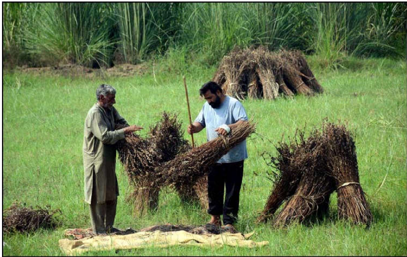
FAISALABAD: Farmers make bundles after harvesting the sesame crop at their farm.