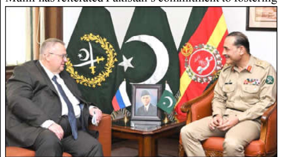
traditional defence ties with Russia. He was talking to Russian Deputy Prime Minister Alexei Overchuk, who paid a courtesy call on him at the General Headquarters in Rawalpindi today.

RAWALPINDI (APP): Chief of Army Staff Syed Asim Munir has reiterated Pakistan's commitment to fostering