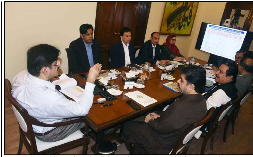
KARACHI: Sindh Chief Minister, Syed Murad Ali Shah presides over a meeting regarding repairing of flood-affected roads, at CM House in Karachi.

Chief Minister Ali Amin Khan Gandapur emphasized the portal's significance, stating, "The purpose of this portal is to provide immediate solutions to people's problems. We are empowering the people, because solving their problems is our priority." He assured that complaints will not be closed until the complainant is satisfied, reiterating the government's commitment to citizen-centric governance. This revolutionary portal is a testament to the Khyber Pakhtunkhwa government's dedication to leveraging technology for good governance and citizens empowerment, he said and added that as the province continues to embrace digital transformation, the "Ikhtiyar Awam Ka" portal sets a new standard for public service delivery.