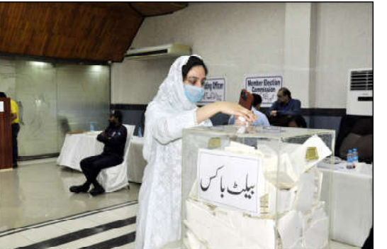
FAISALABAD: Voters casting their votes during the Elections of Chamber of Commerce in the city.