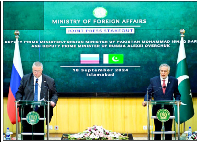
Deputy Prime Minister and Foreign Minister Senator Mohammad Ishaq Dar along with Deputy Prime Minister of Russia Alexei Overchuk addresses a joint press stakeout at the Ministry of Foreign Affairs, Islamabad