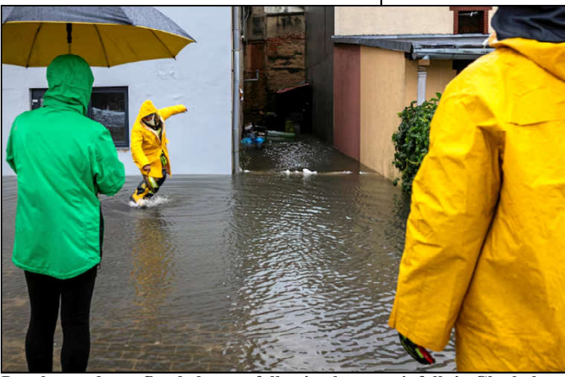
People stand on a flooded street following heavy rainfalls in Glucholazy, Poland.

At least seven people have died due to the blazes in the Aveiro and Viseu districts, with dozens of houses destroyed and tens of thousands of hectares of forest and scrubland consumed. Authorities have mobilised more than 5,000 firefighters.