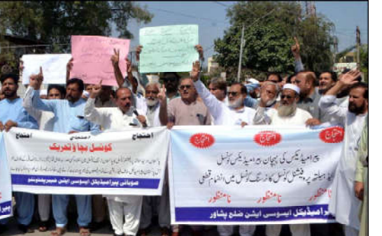
PESHAWAR: Members of Paramedical Staff Association are holding protest demonstration for acceptance of their demands, at Peshawar press club.