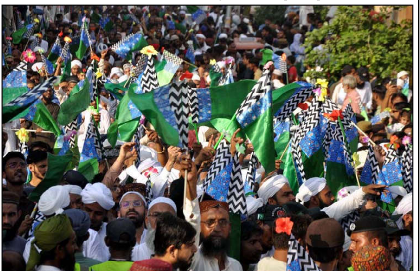
HYDERABAD: Sunni Muslims are holding religious procession on the occasion of 12th Rabi-ul-Awwal Eid Milad-un-Nabi, the birthday anniversary celebration of Holy Prophet Muhammad (PBUH), in Hyderabad.