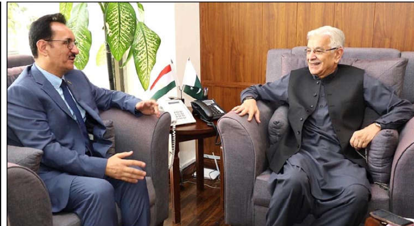
ISLAMABAD: Sharifzoda Yusuf Toir, Ambassador of the Republic of Tajikistan called on Federal Minister for Defence, Defence Production and Aviation, Khawaja Muhammad Asif.