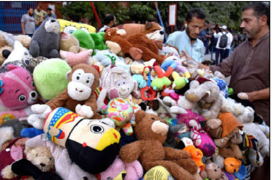
LAHORE: A vendor displaying and selling the used toys on their handcart at Landa Bazar in the Provincial Capital.

the import of petroleum products declined by 13.41 percent, from $ 971.371 million last year to $ 841.113 million during the time period under review. However, the imports of petroleum crude increased by 107.15 percent, from $ 456.238 million to $ 945.087; natural gas liquefied by 10.65 percent, from $ 645.430 to $ 714.195 whereas the imports of petroleum gas liquefied went up by 67.41 percent and reached to $ 98.044 million as compared to $ 164.134 last year.