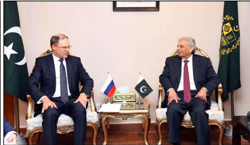
The Deputy Minister of Industry and Trade of Russian Federation Aleksei Gruzdev meets with Minister for Industries, Production and National Food Security Rana Tanveer Hussain in Islamabad.

ISLAMABAD (APP): Pakistani rupee on Wednesday appreciated by 08 paise against the US dollar in the interbank trading and closed at Rs 278.04 against the previous day's closing of Rs 278.12. However, according to the Forex Association of Pakistan (FAP), the buying and selling rates of the dollar in the open market stood at Rs 279.20 and Rs 280.70 respectively. The price of Euro increased by 18 paise to close at Rs 309.47 against the last day's closing of Rs 309.29, according to the State Bank of Pakistan (SBP). The Japanese yen decreased by 03 paise and closed at Rs1.95, whereas an increase of 39 paise was witnessed in the exchange rate of the British Pound, which traded at Rs366.97 as compared to the last day's closing of Rs366.58.