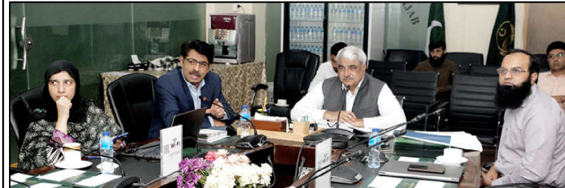
LAHORE: Punjab Health Minister Khawaja Salman Rafique chairs the 15 th syndicate meeting of Nishtar Medical University, held at the Department of Specialised Healthcare and Medical Education.