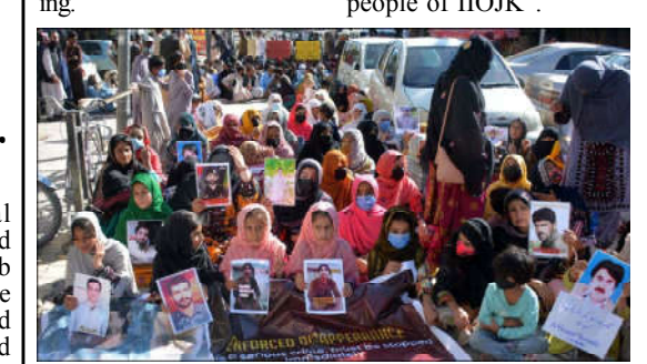
QUETTA: Relatives of missing persons holding a protest demonstration in front of Quetta Press Club