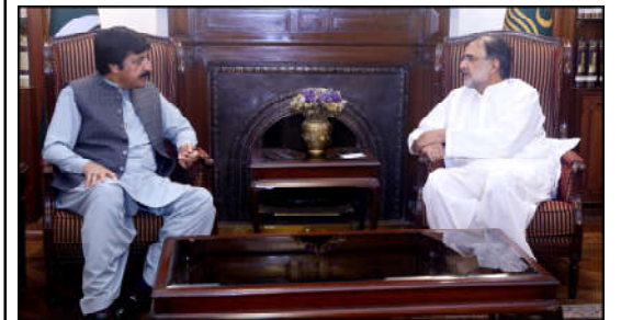
LAHORE: Senior leader of People's Party, Qamar Zaman Kaira called on Punjab Governor, Sardar Saleem Haider Khan at Governor House.

Senior Provincial Minister Marriyum Aurangzeb was also present.