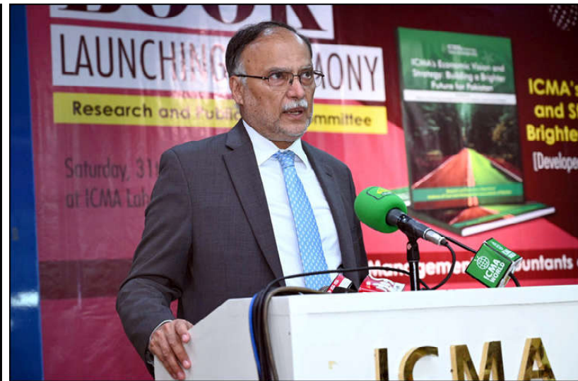
LAHORE: Federal Minister for Planning Development & Special Initiatives of Pakistan, Ahsan Iqbal is talking to the media at ICMA.

Ahsan Iqbal said that everyone could differ from one's opinion and one could not claim one's opinion as ultimate, and when difference of opinion was not tolerated, it leads to hatred among people and destroys the social fabric. A party and its top leader used to trample upon those who would differ from his opinion, and subject its political opponent to severe character assassination through social media and create hate for them among the people. The previous PML-N government brought everything in order till 2017, he said and cited that then PML-N government, through effective and well-conceived policies, had eliminated the menace of terrorism, overcome the power load-shedding, brought huge foreign investment through CPEC in Pakistan, controlled the inflation and improve all economic indicators.