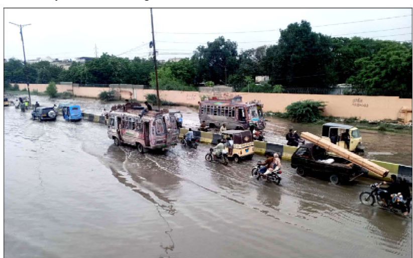
HUB: Commuters are facing difficulties in transportation due to stagnant rainwater causing of poor sewerage system after heavy downpour of monsoon season, at Hub River road in Hub

The inquiry revealed that a fictitious woman was portrayed as the widow of the late Adeb Dar Muhammad Kamal and was paid Rs. 4.3 million in pension. Additionally, the fraudulent recipient was receiving the monthly pension of the deceased Adeb.