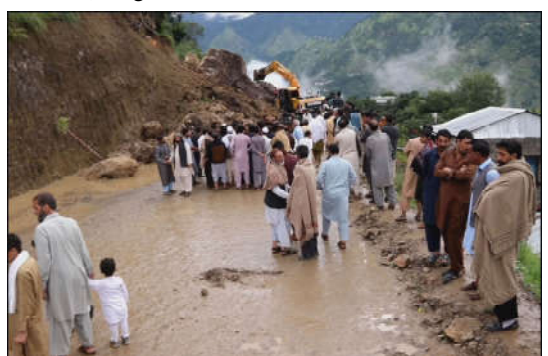
ABBOTTABAD: Local man standing on Thindiyani road, where houses were destroyed due to heavy landslides.