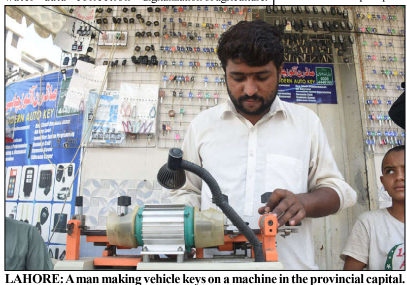
LAHORE: A man making vehicle keys on a machine in the provincial capital.

Florence Rolle, during her speech, emphasized the importance of precise information and data for effective decision-making for government, research institutions and farmers in the face of climate change challenges. "The installation of this flux tower and other sophisticated instruments highlight FAO's commitment to support the digitalization of agriculture.