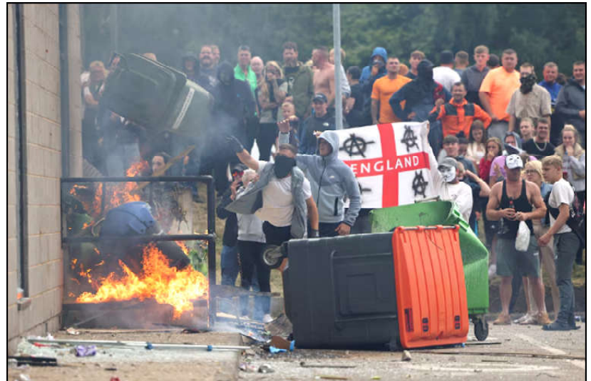
Demonstrators toss a trash bin during an anti-immigration protest, in Rotherham, Britain.

Footage on national broadcaster NHK showed homes with roofs partly sheered off while cars drove wheels-deep on flooded roads in the country's southwest.