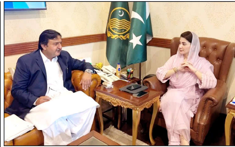
LAHORE: Speaker Punjab Assembly Malik Muhammad Ahmed Khan meeting with Punjab Chief Minister Maryam Nawaz Sharif.