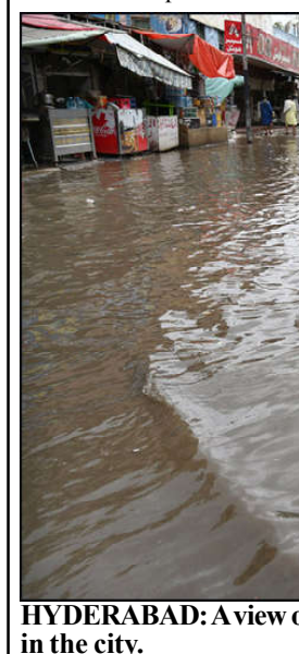
HYDERABAD: A view of rain water accumulated at railway station after rain in the city.

In 7 th operation, 2.4 kg hashish was recovered from two suspects.