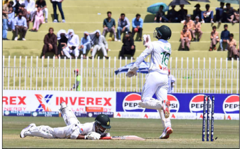
RAWALPINDI: Bangladesh players celebrating to take the wicket of Pakistan Shah Masood during the second day of the last cricket Test match playing between Pakistan and Bangladesh at Pindi Cricket Stadium.

Heavy rains may create water logging in low-lying areas of Makran coast, the Met Office said.