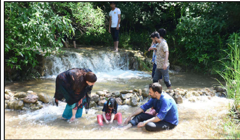
ISLAMABAD: Families enjoying in a waterfall at Trail 5, Margalla Hills, in the Federal Capital.

The KPT's emergency response teams are on standby, ready to respond to any situation that may arise, he informed.