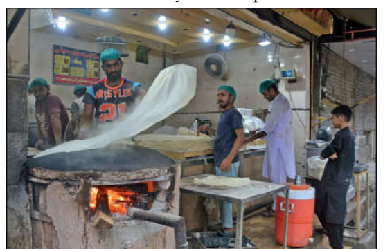
RAWALPINDI: A vendor is preparing traditional food item Samosa Patti in his shop during rainy weather at Kashmiri Bazaar in the city.