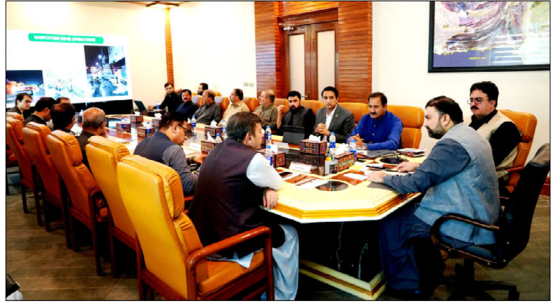
QUETTA: Chief Minister Balochistan Mir Sarfraz Ahmed Bugti presiding over a review meeting of Solid Waste Management project

The Chief Minister directed to submit the details of shops established on the government land in Quetta in next meeting.