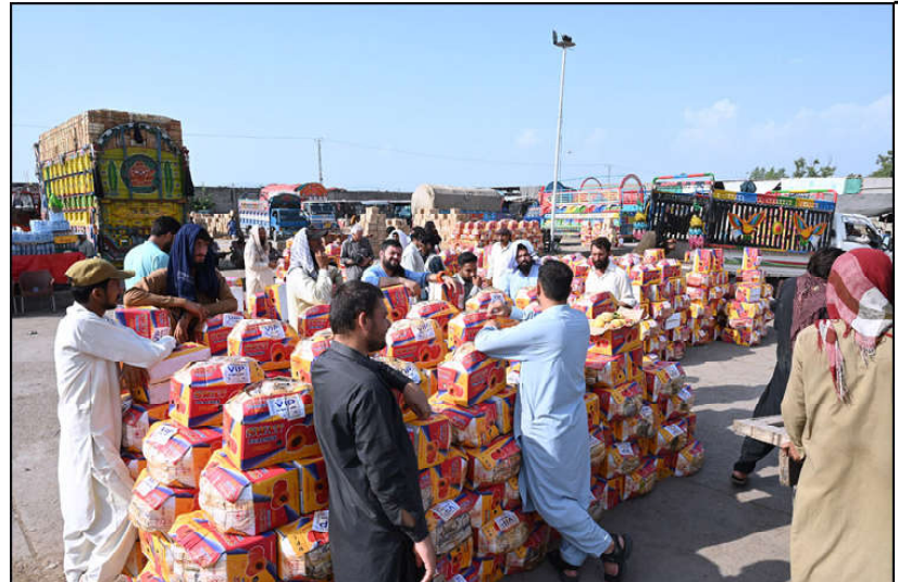
ISLAMABAD: Local vendors purchasing fruits at Fruit and Vegetable Market in the Federal Capital.