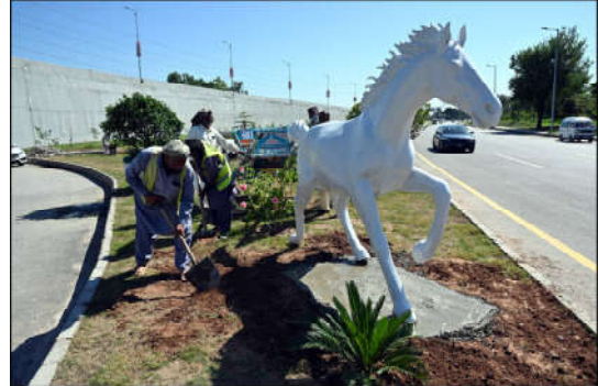
ISLAMABAD: CDA workers installing Horse Cart replica at Rawal Chowk during beautification of the city.