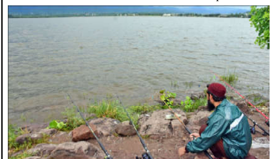
ISLAMABAD: A man is catching fish at Rawal Dam, in the Federal Capital.

The Anti-corruption Circle Islamabad has registered a case against the accused and more arrests are expected on identification of the arrested persons.