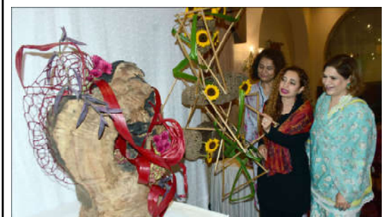
ISLAMABAD: Females taking interest in flowers decorations exhibition arranged by Floral Art Society of Pakistan Magnolia Chapter.

The governor, along with other distinguished guests, also participated in a ceremonial cake-cutting to mark the celebration.