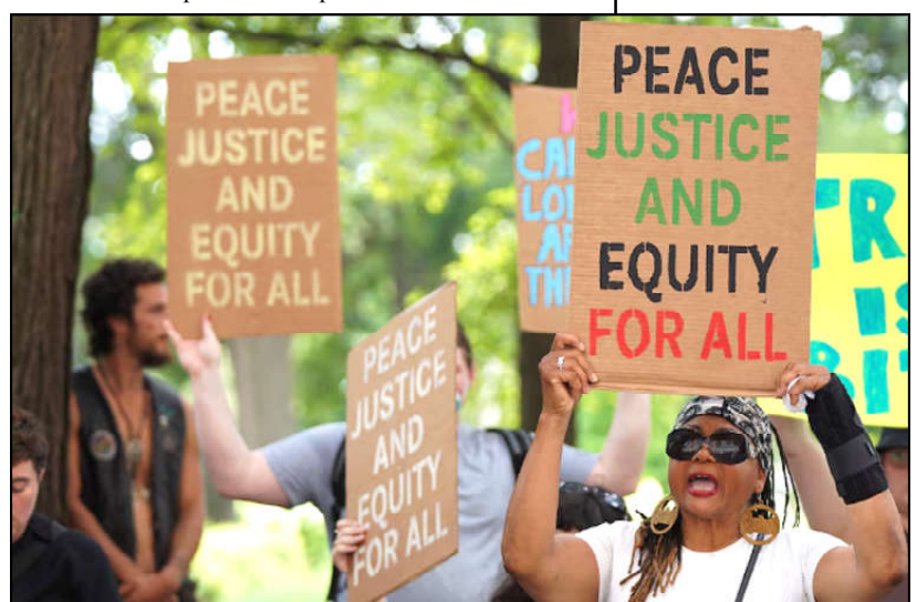
Demonstrators protest against the participation of Republican presidential nominee and former U.S. President Donald Trump in the National Association of Black Journalists convention, outside the venue in Chicago, Illinois, U.S.

"It would have been enough not to steal," he wrote on social media platform X. "Then there would be no need to whine now."