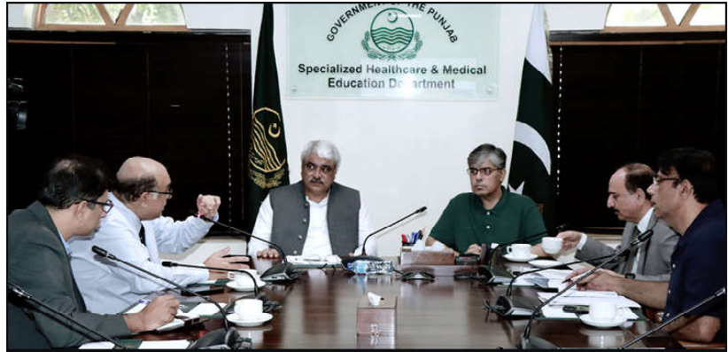
LAHORE: Punjab Minister for Health Khawaja Salman Rafique presides over the meeting of Specialized Healthcare and Medical Education Department.

He appealed to the citizens to protect government resources and properties like their own, adding that the development projects would be ineffective until the people prove to be responsible and behave like civilized citizens. He said that rehabilitation centres were being established at government hospitals as well as private hospitals for the treatment of drug addicts. He said the 'Solar Systems' were being provided to people to address the issue of electricity. He also appealed to the people to avoid electricity theft as the permanent solution of load-shedding was not possible without controlling the power theft issue.