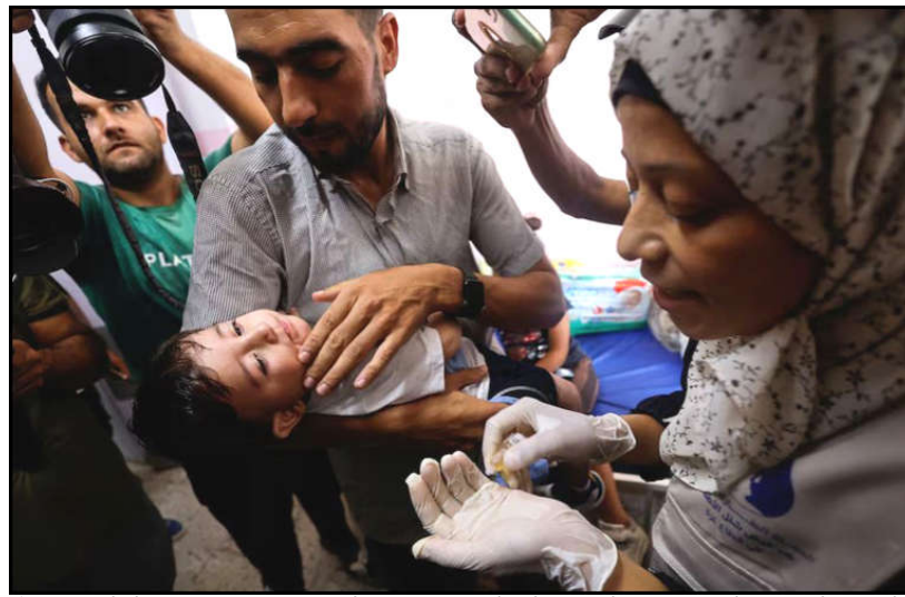
A Palestinian man holds a child, as the child is vaccinated against polio, amid the Israel-Hamas conflict, at Nasser hospital in Khan Younis in the southern Gaza Strip.

Israeli troops pulled back from other West Bank towns late Thursday but fighting raged on around Jenin, long a hub of militant activity.