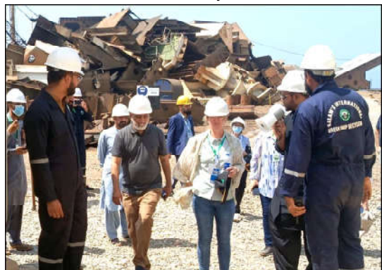
GADDANI: Team of IMO visiting Gaddani Ship Breaking Yard