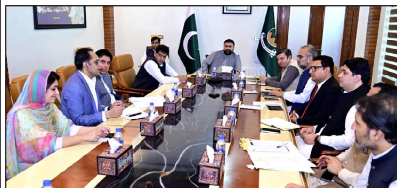
QUETTA: Chief Minister Balochistan Mir Sarfaraz Ahmed Bugti presiding over meeting regarding establishment of Private Special Economic Zone Turbat