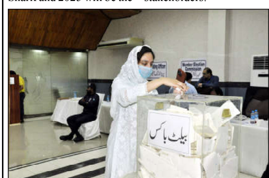
FAISALABAD: Voters casting their votes during the Elections of Chamber of Commerce in the city.

He said that Prime Minister Shehbaz Sharif had set up a Gems and Stone Committee which would form a growth-oriented policy with the consultation of all stakeholders.