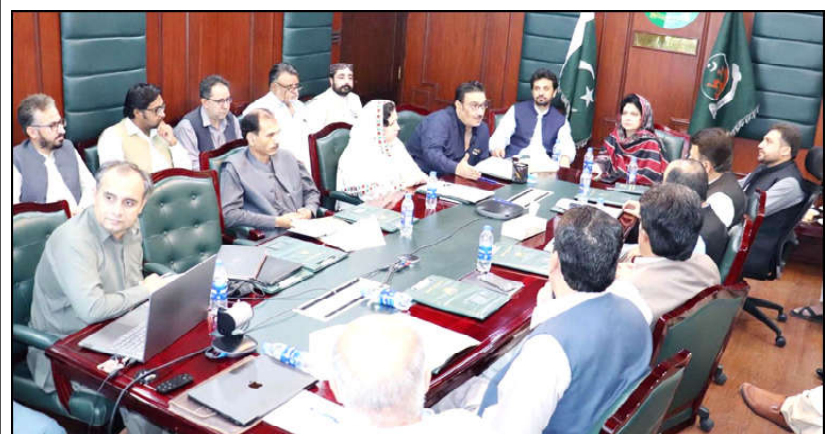
QUETTA: Provincial Finance Minister Mir Shoaib Nausherwani and Education Minister Raheela Hameed Khan Durrani presiding over joint meeting of University Finance Commission

He urged the nation to follow the teachings of Holy Prophet Muhammad (PBUH), emphasizing support for the vulnerable, prioritizing those struggling with poverty and hunger.