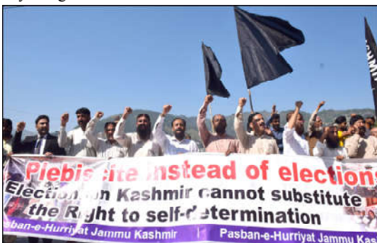
MUZAFFARABAD: Kashmiris shouting slogans at Azadi Chowk against the elections in Occupied Kashmir and demanding referendum.