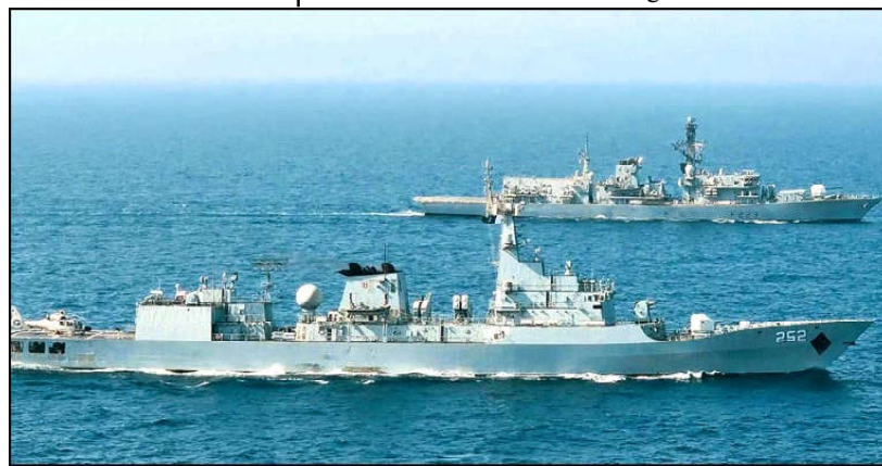
Pakistan Navy ship SHAMSHEER conducted passage exercise (PASSEX) with HMS LANCASTER during Regional Maritime Security Patrol.

Accountability court had rejected acquittal plea and its decision was challenged in IHC.