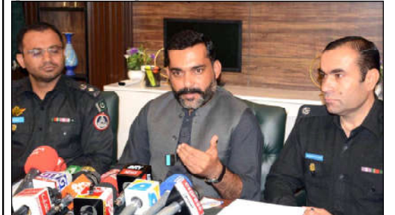
QUETTA: SSP Serious Crimes Investigation Wing, Zuhair Muhsin addressing a press conference.