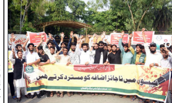
LAHORE: Activists of Pakistan Markazi Muslim League, hold a banner during protest in favor of their demands in front Governor House, in the Provincial Capital.