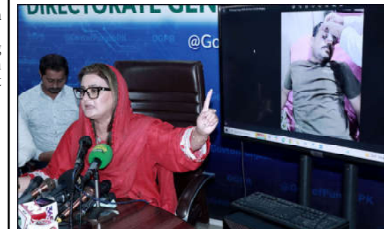
LAHORE: Punjab Information Minister Azma Bukhari talking to media persons at DGPR.