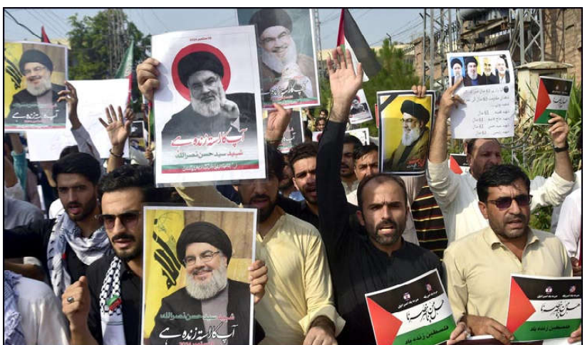
PESHAWAR: Activists of Imamia Students Federation hold a protest against killing of Hezbollah's leader Hassan Nasrallah outside PPC. Hezbollah's leader Hassan has been killed in an Israeli air attack on Lebanon's capital Beirut.

Parties Hurriyat Conference (APHC Gillani Group) said that Prime Minister Muhammad Shehbaz Sharif had won the hearts and minds of all Kashmiris for exclusively highlighting the Kashmir dispute in its true perspective at UNGA. He said Indian occupational forces' war crimes, state terrorism and human rights abuses had made life a worst nightmare for over one million oppressed Kashmiris. APHC leader said India had imposed military siege on some 10 million Kashmiris in IOJK where over 900,000 Indian forces were deployed with no regards for human rights.