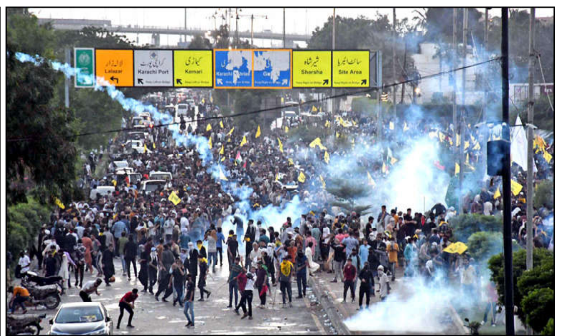
KARACHI: Police fires teargas shell to disperse to stop activists of Majlis Wahdat-e-Muslimin from reaching the U.S. Consulate during an anti-Israel protest in the Provincial Capital.

QUETTA (APP): Earthquake of 4.5-magnitude were felt on Sunday in Kalat district and adjacent areas of Balochistan. According to the Pakistan Meteorological Department, the earthquake, recorded at a depth of 25 kilometers, had its epicenter located approximately 13 kilometers south of Kalat, reported private news channel. While the seismic activity caused alarm, there were no reports of casualties or significant property damage in Kalat or surrounding areas, officials confirmed.