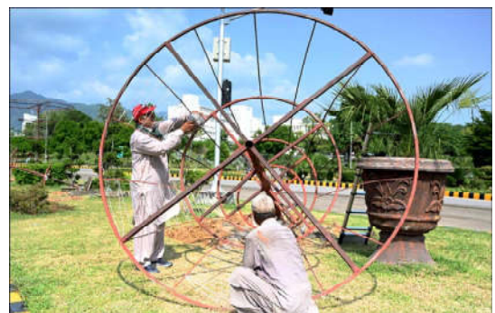
ISLAMABAD: CDA workers busy fixing a tree stand to enhance beauty of Federal Capital in front of Parliament House.