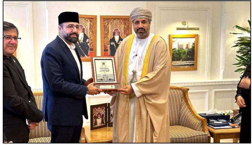
OMAN: Federal Minister for Overseas Pakistanis and Human Resource Development, Chaudhry Salik Hussain, receiving a souvenir from Oman's Minister of Labour, Dr Mahad bin Said bin Ali.