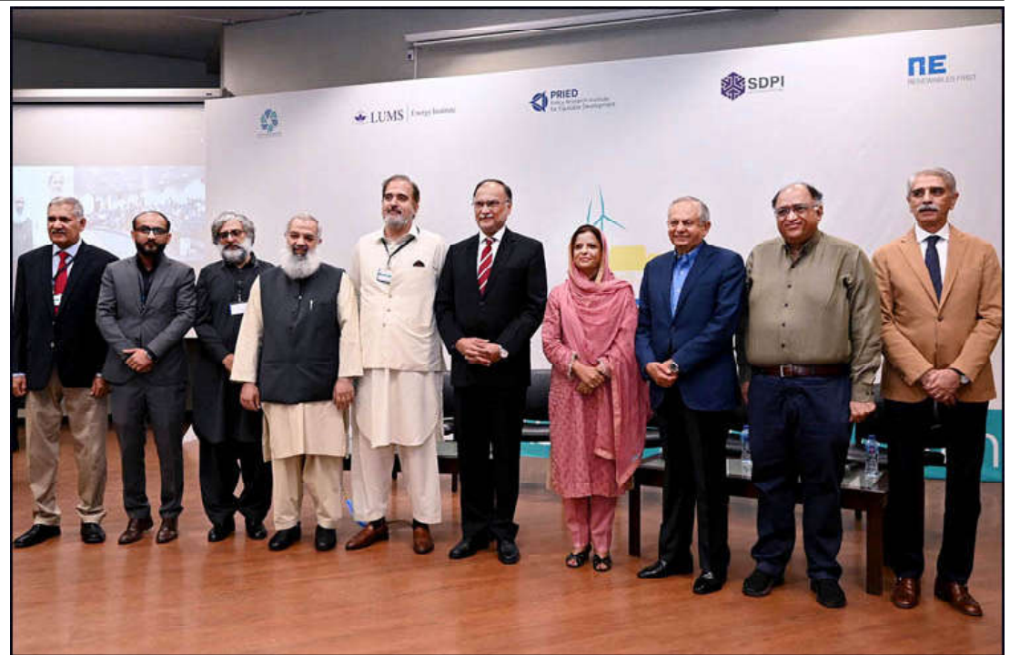
LAHORE: Federal Minister for Planning, Development & Special Initiatives, Ahsan Iqbal in a group photograph with the participants of Asia's Energy Transition Summit at LUMS University.