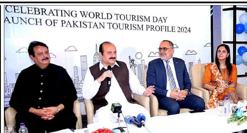
ISLAMABAD: Prime Minister's Youth Programme (PMYP) Chairman Rana Mashhood Ahmad Khan addressing the inaugural ceremony of launching of Pakistan Tourism Profile 2024.

the doors of the Election Commission of Pakistan (ECP) and courts for promoting a peaceful and constitutional approach to resolving disputes, he stressed. Senator Irfan Siddiqui also praised Prime Minister Shehbaz Sharif's powerful speech at the 79th United Nations General Assembly (UNGA), where he addressed pressing global issues. PM Sharif's speech was notable for its emphasis on key issues such as Israel's military actions in Gaza, the unresolved Kashmir dispute, the global climate crisis and the international community's failure to uphold justice and human rights.