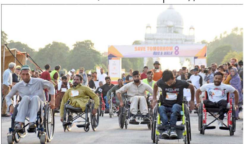
ISLAMABAD: Disable persons take part in race during a ceremony title 'Save Tomorrow 8 Run and Walk' at Fatima Jinnah Park, organized by KKAFF, in the Federal Capital.