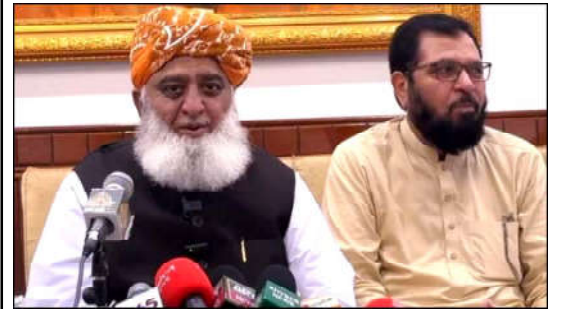
Amir JUI Maulana Fazlur Rehman addressing a Press conference.

PESHAWAR (INP): After being re-elected as the Jamiat Ulema-e-Islam-Fazl (JUI-F) chief for five years, Maulana Fazlur Rehman has slammed the incumbent government, saying that the "fake parliament" lacks a real mandate for a major constitutional amendment. "We want a fresh [general] election," Fazl said while addressing a press conference after the conclusion of the party's intra-party poll in Peshawar on Sunday. "This parliament does not deserve this huge constitutional amendment." The government pushed the proposed constitutional package amid speculation about a potential extension in the tenure of Chief Justice of Pakistan (CJP) Qazi Faez Isa, who is set to retire in October this year, following the Pakistan Tehreek-e-Insaf's (PTI) request last month for the early issuance of a notification regarding the appointment of the next top judge. The ruling coalition left no stone unturned to woo Fazl, with leaderships of the Pakistan Muslim League-Nawaz (PML-N) and the Pakistan Peoples Party (PPP) holding a flurry of meetings with the cleric, but to no avail. Detailing ongoing consultations with the PPP and the major opposition party — PTI, he said that the JUI-F and the said parties would share their draft amendments. The cleric stressed that such amendments should be Continued on page 2