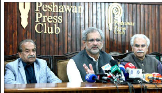
PESHAWAR: Former prime minister and Awam Pakistan Party leader, Shahid Khaqan Abbasi addresses to media persons during press conference held at Peshawar press club.

ISLAMABAD (APP): Chairman of the Senate, Syed Yousuf Raza Gilani, on Sunday, strongly condemned the tragic shooting incident in Panjgur, where miscreants opened fire on laborers. Expressing deep sorrow over the loss of lives, he extended heartfelt condolences to the families of the deceased laborers and prayed for the departed souls. He said that the unjustified killing of innocent laborers is against all human values, and those responsible for this heinous act deserve no leniency.