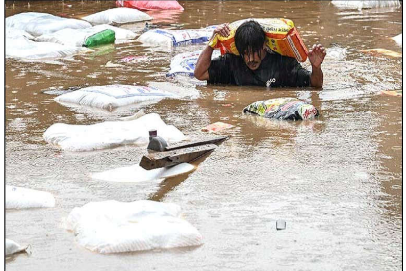
A man carrying a sack of flour wades through floodwater after the Bagmati River overflowed following heavy monsoon rains in Kathmandu.

set rules at our border and to enforce them, and I take that responsibility very seriously," she said. "We are also a nation of immigrants... and so we must reform our immigration system to ensure that it works in an orderly way, that it is humane and that it makes our country stronger." Harris said as president she would revive a bipartisan border bill Trump "tanked" last year, which would add 1,500 border agents and pay for 100 machines to detect smuggled fentanyl, a synthetic opioid ravaging US communities. And she said anyone crossing the border illegally would be barred from seeking asylum in the country. But "hard-working migrants" who come to the US legally should be given a pathway to citizenship, she said.