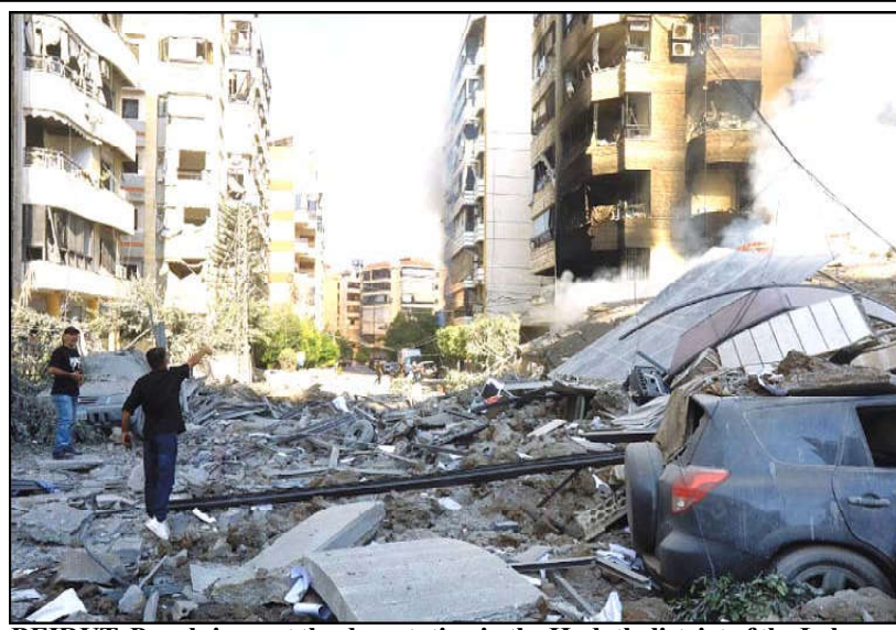
BEIRUT: People inspect the devastation in the Hadath district of the Lebanon capital's southern suburbs in the aftermath of intense Israeli air strikes.