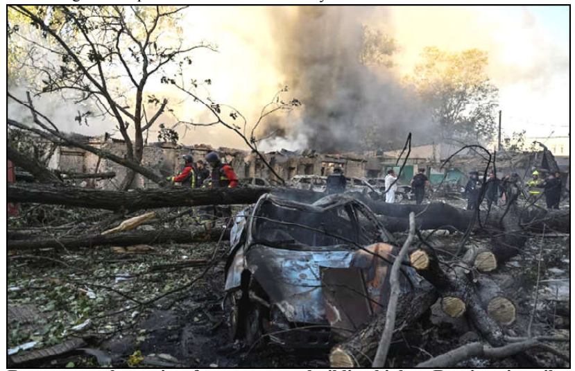
Rescuers work at a site of an apartment building hit by a Russian air strike, amid Russia's attack on Ukraine, in Zaporizhzhia, Ukraine.