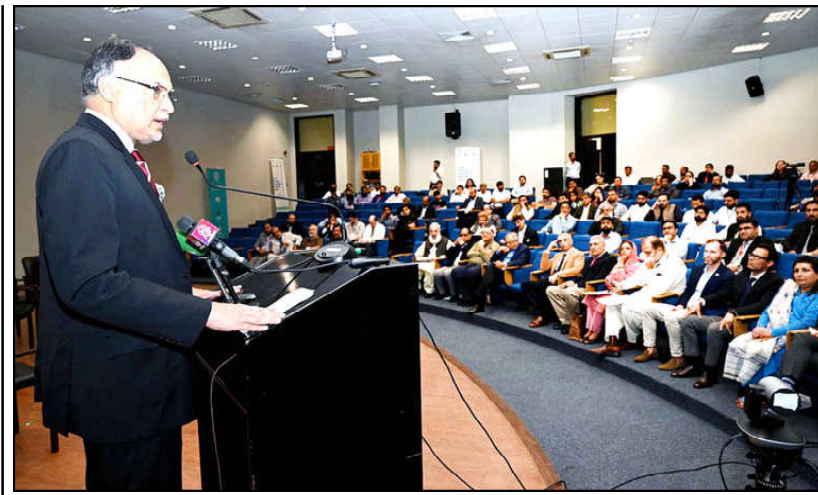
LAHORE: The Federal Minister for Planning, Development & Special Initiatives, Ahsan Iqbal Addressing to Asia's Energy Transition Summit at LUMS University.