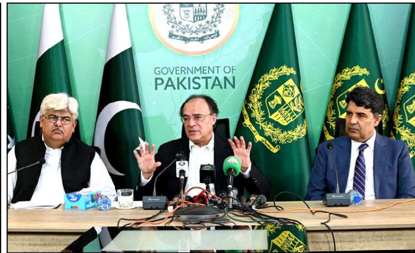
ISLAMABAD: Federal Minister for Finance and Revenue Senator Muhammad Aurangzeb addressing a press conference at PTV Headquarter.

ISLAMABAD (Online): The newly appointed head of the National Security Agency, Lt. Gen. Muhammad Asim Malik will assume his duties today, Monday. Few days ago, Prime Minister Shehbaz Sharif had appointed Lt. Gen. Asim Malik as DG ISI. He is set to assume his new role on Monday, Lt Gen Muhammad Asim Malik will be succeeding Lt Gen Nadeem Anjum. Lt Gen Asim Malik, HI (M) is currently serving as Adjutant General at the General Headquarters (GHQ) in Rawalpindi. He has previously commanded an infantry division in Balochistan and an infantry brigade in Waziristan.