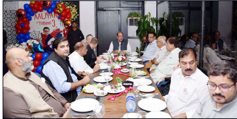
LAHORE: A delegation of International Labour and Trade Unions meeting with Punjab Minister for Industries and Commerce Ch. Shafay Hussain.