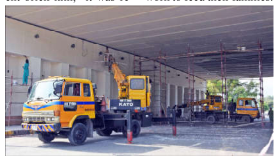
ISLAMABAD: Workers of Capital Development Authority (CDA) installing new colorful lights under zero point bridge, in the Federal Capital.