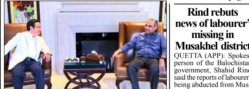
LAHORE: Federal Minister for Interior Mohsin Naqvi in a meeting with Chinese Consul General Zhao Shiren.

ISLAMABAD (APP): Re-affirming the government's resolve to implementing homegrown structural reforms, Federal Minister for Finance and Revenue, Senator Muhammad Aurangzeb here on Sunday emphasized the crucial need to bring fundamental changes in the DNA of country's economy, leading to an export-driven model, thereby fostering sustainable growth. The minister said the macroeconomic stability has continued during the first quarter of the current fiscal year, however it needed permanence to lead to sustainable growth. "Macroeconomic stability is not an end in itself, it is a means to an end," he remarked. Hence, bringing structural reforms was not only a requirement by the International Monetary Fund (IMF), but Pakistan needed it. He said, Pakistan was in defining moment, because it is going to determine the direction of the journey, and "we are very clear, about the direction of journey." For homegrown economic growth, Continued on page 2