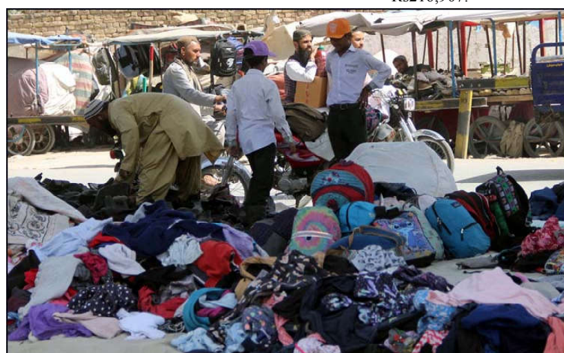
QUETTA: People are buying clothes from stalls due to price hiking, at a weekly bazaar located on Benazir Flyover in Quetta.

LAHORE (APP): SAARC Chamber of Commerce and Industry former President Iftikhar Ali Malik emphasized that the IMF bailout package is crucial for implementing structural reforms, reducing fiscal deficits, controlling inflation, and stabilizing the economy. He believes this support will also enhance the country's long-term economic prospects and help address balance of payments issues. In a statement issued here on Sunday, he lauded the key role of Prime Minister Shehbaz Sharif, Deputy Prime Minister Ishaq Dar for making best possible efforts to secure the IMF program mainly aims to address economic