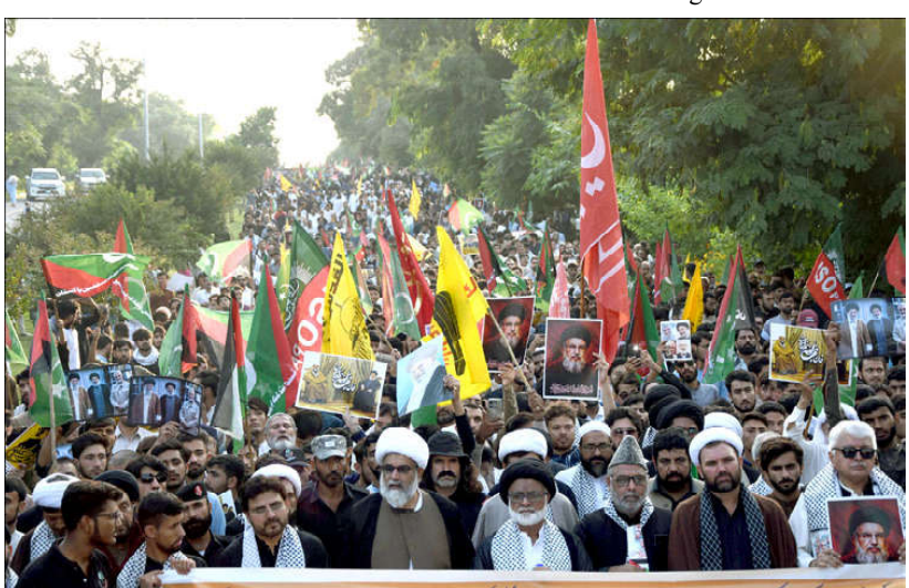
ISLAMABAD: Activists of Majlis Wahdat-e-Muslimeen carrying placards and Palestinian national flags stand beside a portrait of slain Lebanese Hezbollah chief Hassan Nasrullah, during an anti-Israel protest in the Federal Capital.