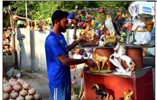
LAHORE: A vendor arranging and displaying the different kinds of clay made decoration items to attract the customers at his roadside setup.