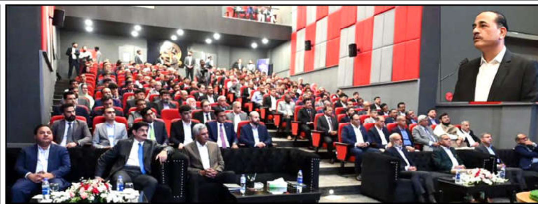
KARACHI: Chief of Army Staff (COAS) General Asim Munir addressing inaugural ceremony of Innovista Indus IT Park, a hub aimed at empowering Pakistan's youth by fostering academia-industry collaboration in the field of Information Technology, particularly Artificial Intelligence