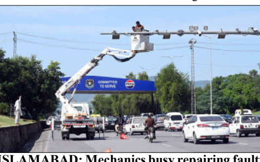
ISLAMABAD: Mechanics busy repairing faulty CCTV cameras at Faizabad.