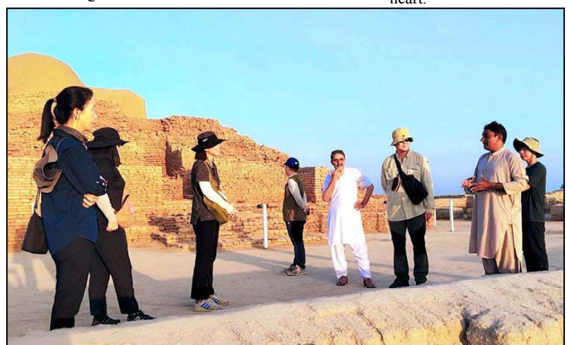
MOHENJO DARO: A tourist delegation from Korea are visiting and expressed keen interest in the historical ruins of the World Heritage Monuments of Mohenjo Daro.