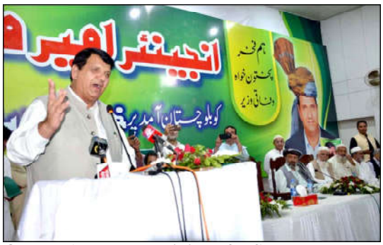
QUETTA: Federal Minister for States and Frontier Regions (SAFRON) Amir Muqam addresses a ceremony in honoring the hard work and dedication of coalmine workers.

QUETTA (APP): Federal Minister for States and Frontier Regions (SAFRON) Amir Muqam on Friday said that all out efforts would be taken to ensure the protection of coalminers and basic facilities as the workers working in the coal mines are the asset of the country. The workers are working hard and contributing to the country's economy and development, Amir Muqam said while addressing a ceremony organized in the honor of coalmines workers. He said that the people associated with the coal mines would be provided all the facilities and privileges for avoiding tragic incidents in the mining sites. He said on the mines where injustice was done with the workers will be sealed and ban would be also imposed on those mines in the province which lack precautionary measures. Amir Muqam said that no compromise will be made on the protection and rights of the workers working in the coal mine. The government was the key priority to provide all possible facilities to the workers, their all legitimate demands would be addressed. He also announced 2 ambulances for the coal mine workers. Engineer Amir Muqam hailed the approval of 7 billion dollar IMF deal, which will stabilize the economy of the country. "The political rivals of the PML-N and anti Pakistan elements tried their best to sabotage the financial deal to put the country in the financial crises, however their nefarious designs failed," Amir Muqam remarked. Federal Minister said that those who destroy peace cannot be Pakistanis.