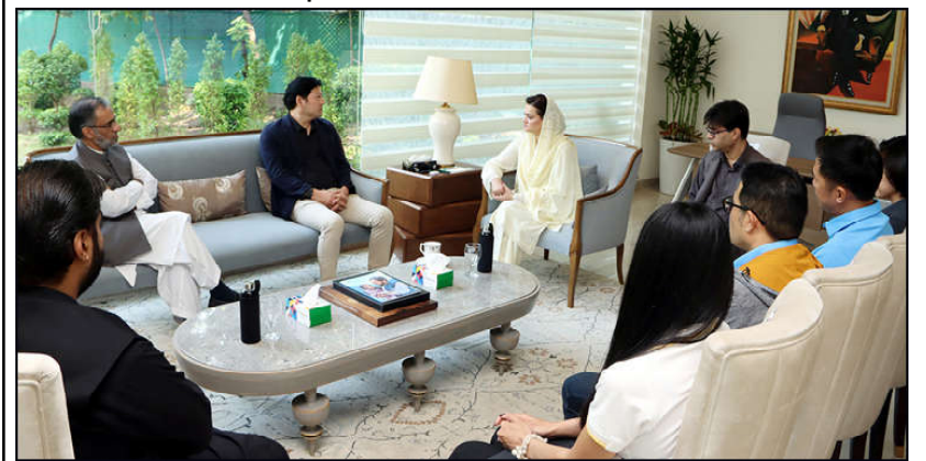
LAHORE: A delegation of Thai Union meeting with Senior Minister Punjab Mariyum Aurangzeb.