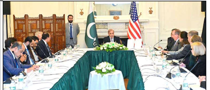
NEW YORK: Prime Minister Muhammad Shehbaz Sharif meets with a delegation of the US-Pakistan Business Council on the sidelines of 79th session of the United Nations General Assembly.