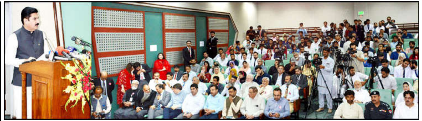
PESHAWAR: Khyber Pakhtunkhwa Governor Faisal Karim Kundi addressing the World Heart Day event at Rehman Medical Institute, Hayatabad.

conference to collaboratively address the province's pressing issues. Meanwhile, Khyber Pakhtunkhwa's first female paragliding pilot, Benazir Awan, called on Governor Faisal Karim Kundi. The meeting focused on promoting adventure sports for women in the province and showcasing Khyber Pakhtunkhwa's positive image globally. During the discussion, Benazir Awan presented her proposals to create more opportunities for women in adventure sports, particularly paragliding. She emphasized the exceptional talents of women in the province and advocated for greater participation in adventure sports to highlight their skills on the international stage.