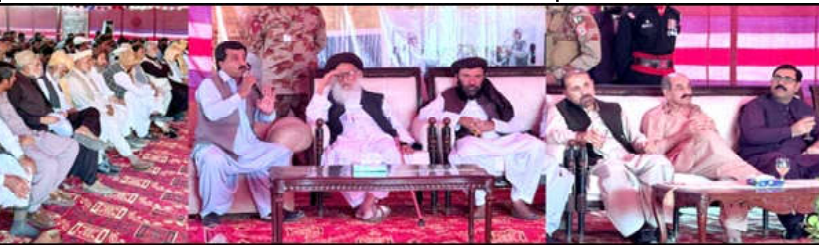
ZHOB: Chief Minister Balochistan Mir Sarfraz Ahmed Bugti addressing elites during tribal jirga. Provincial Ministers, Parliamentary Secretaries, MPAs and high officials are also present

QUETTA (INP): Chairman of the Pashtunkhwa Milli Awami Party, Mahmood Khan Achakzai, has cautioned Maulana Fazlur Rehman, stating that endorsing the proposed constitutional amendments could harm his political standing.