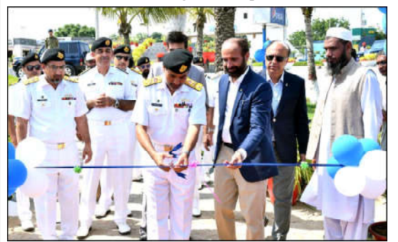
KARACHI: Commandant PNS BAHADUR inaugurating World Maritime Day Gala 2024 at Pakistani Maritime Museum.

ISLAMABAD (Online): Election Commission of Pakistan has filed miscellaneous petition in Supreme Court (SC) on the matter of implementation of order regarding reserved seats.