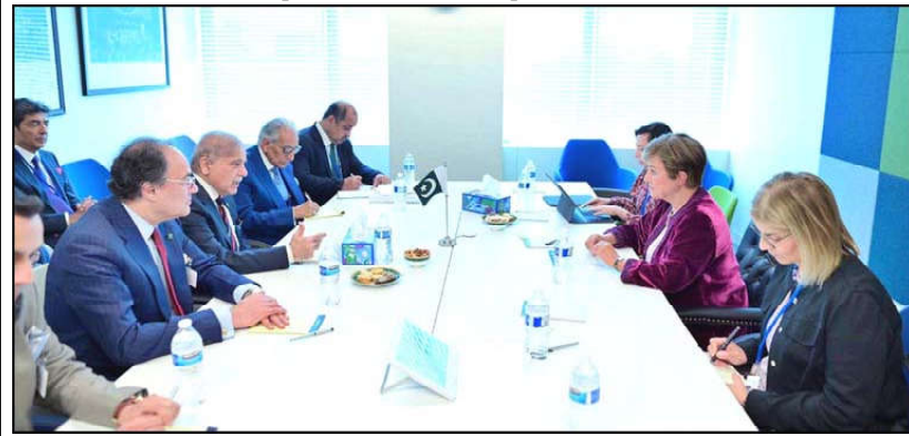
NEW YORK: Prime Minister Muhammad Shehbaz Sharif meets Ms. Kristalina Georgieva, the Managing Director of the International Monetary Fund (IMF) on the sidelines of the UNGA.

NEW YORK (APP): Prime Minister Shehbaz Sharif on Wednesday urged the United Nations Security Council to apply sanctions against Israel including arms & trade embargo for its genocidal acts against the Palestinians.