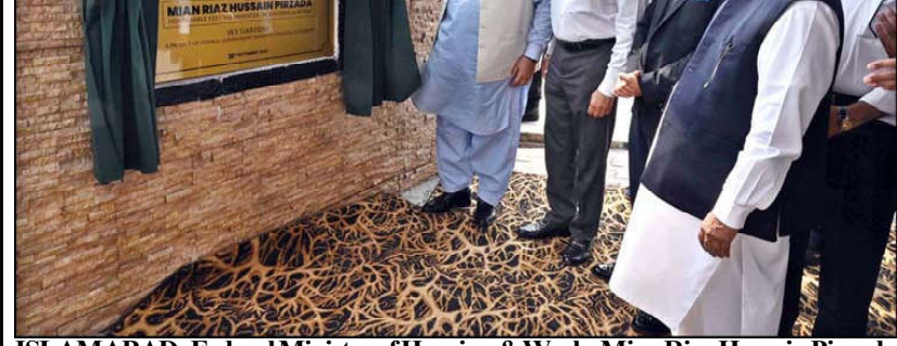
ISLAMABAD: Federal Minister of Housing & Works Mian Riaz Hussain Pirzada unveiling plaque to inaugurate Commoners Bridge at Sky Gardens a project of Federal Government Employees Housing Authority Murree Expressway.

ISLAMABAD (APP): Education across various provinces and departments. The committee, at the ministry's request, also proposed an evaluation of the budgetary allocations, advocating for an increase in funding for education. The agenda included discussions on allowances for professors and teachers, the provision of classrooms, issues related to retired teachers, degree attestations, and other significant student-related concerns. During the session, Senator Manzoor Ahmad raised a public importance point regarding the discontinuation of allowances for professors, teachers, and employees of BUIEMS University. It was reported that these allowances had been halted on the directive of the Governor of Balochistan, who serves as the university's Chancellor. Despite multiple representations by the faculty, the university management's case was not acceded to by the