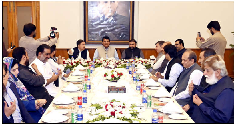
QUETTA: Chief Minister Mir Sarfraz Bugti hosted dinner in honour of the Federal Minister for SAFRON, Amir Muqam, Governor, Jaffar Khan Mandokhail, Speaker of Provincial Assembly, Abdul Khaliq Achakzai and Provincial Ministers

Independent Report QUETTA: The Chief Minister Mir Sarfraz Bugti hosted dinner in honour of the Federal Minister for SAFRON, Amir Muqam, Governor, Jaffar Khan Mandokhail, Speaker of Provincial Assembly, Abdul Khaliq Achakzai and Provincial Ministers here on Thursday.