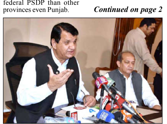
QUETTA: Minister SAFRON and Kashmir Affairs Amir Muqam briefs the press at Commissionerate of Afghan Refugees.

Independent Report He mentioned that Rs. 120 billion have been allocated for Balochistan in the current PSDP by the federal government, which are higher than other provinces.