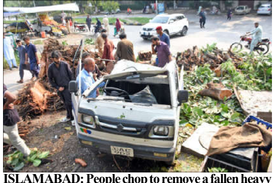
ISLAMABAD: People chop to remove a fallen heavy tree on a loading van at Sittara Market during heavy rainfall, in the Federal Capital.

ISLAMABAD (APP): Federal Minister for Maritime Affairs Qaiser Ahmad Sheikh on Thursday said that the present government was trying its best to improve the maritime sector. In a message on the occasion of World Maritime Day issued here, the minister said that the Secretary General of the International Maritime Organization also appreciated our excellent and marvelous performance. He further said that Pakistan Navy was also helping the ministry to resolve maritime sector issues. Paying special attention toward maritime security and blue economy, he added. Qaiser Sheikh said that digitization of Ports through Maritime Single Window was in progress, adding that modern world class training programs were being conducted in Pakistan Marine Academy. The revenue of Karachi Port Trust (KPT) has also increased compared to last year, he added. The minister said that Pakistan's location in terms of maritime trade was the most important in the region, adding that he was ready to sit with every stakeholder for the betterment of ports.