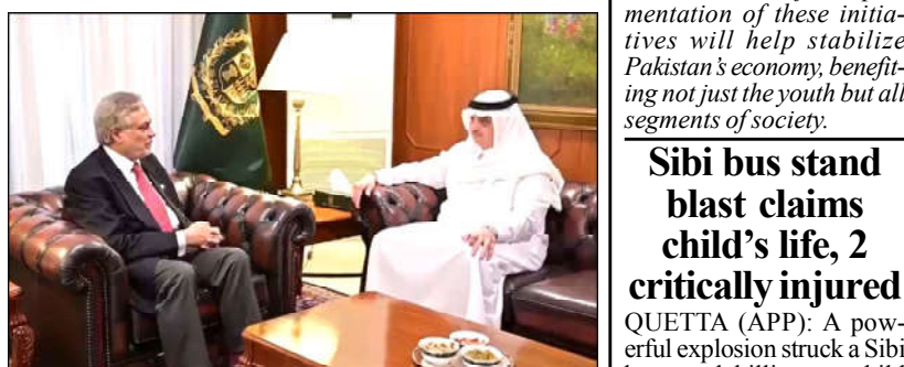
ISLAMABAD: Saudi Ambassador to Pakistan, Nawaf bin Saeed Ahmad Al-Malki meeting with Deputy Prime Minister and Foreign Minister Mohammad Ishaq Dar.

Independent Report QUETTA: The Chief Minister Balochistan, Mir Sarfraz Bugti has stated that the government, security forces and masses would lighten the candles of peace in the province.