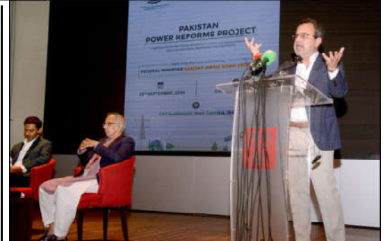
KARACHI: Federal Minister for Power Sardar Awais Ahmed Khan Leghari addresses an event on Pakistan Power Reforms at IBA main campus.

However, according to the Forex Association of Pakistan (FAP), the buying and selling rates of the dollar in the open market stood at Rs 279 and Rs 280.50 respectively. The price of Euro increased by Rs 1.64 to close at Rs 310.95 against the last day's closing of Rs 309.31, according to the State Bank of Pakistan (SBP).