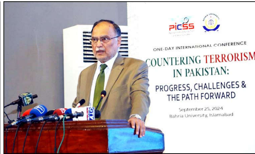
ISLAMABAD: Federal Minister for Planning, Development and Special Initiatives, Ahsan Iqbal addressed a one-day seminar on Countering Terrorism in Pakistan: Progress, Challenges, and the Way Forward held at local university in Islamabad.