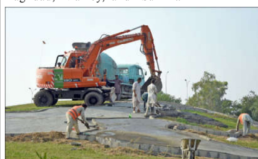
ISLAMABAD: Labourers are busy construction work of newly Pakistan map on a green belt during development work, in the Federal Capital.

ISLAMABAD (APP): Indus River System Authority (IRSA) on Wednesday released 184,400 cusecs water from various rim stations with inflow of 151,600 cusecs. According to the data released by IRSA, water level in River Indus at Tarbela Dam was 1535.86 feet and was 137.86 feet higher than its dead level of 1,398 feet. Water inflow and outflow in the dam was recorded as 91,900 cusecs and 95,000 cusecs respectively. The water level in River Jhelum at Mangla Dam was 1220.45 feet, which was 172.45 feet higher than its dead level of 1,050 feet. The inflow and outflow of water was recorded 15,300 cusecs and 45,000 cusecs respectively. The release of water at Kalabagh, Taunsa, Guddu and Sukkur was recorded as 127,100, 108,900, 88,500 and 36,500 cusecs respectively. Similarly, from River Kabul, a total of 18,300 cusecs of water released at Nowshera and 4,200 cusecs released from River Chenab at Marala.