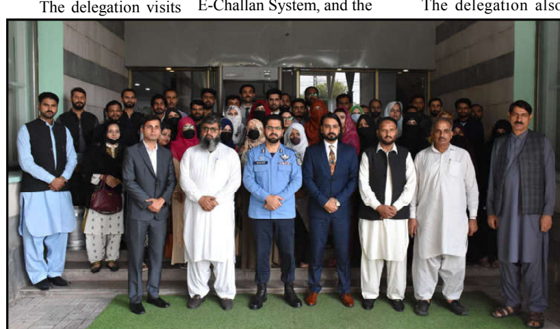
the command and control center, the data hub unit, modern technology-equipped cameras, and the Police operations center hall. They were fully briefed about the procedures and advantages of this project. Furthermore, the delegation was informed that "Pucar-15" emergency helpline. The delegation was also apprised of the functionality and benefits of the Safe City cameras in the city. The modern cameras of Safe City are playing a crucial role in ensuring the safety of the city, preventing crimes and safeguarding

Independent Report ISLAMABAD: The under training officers of Intelligence Bureau Academy Islamabad combined intelligence course visited Safe City Islamabad, a public relations officer said. The delegation visits Safe City Islamabad is playing a significant role in various departments through modern techniques, including the Police Operations Center, Emergency Control Center, Data Hub Unit, Dispatch Control Center, E-Challan System, and the lives and property of citizens. Face recognition cameras have been installed at the entry and exit points of the city which are playing an important role in identifying suspicious elements. The delegation also met with Director General (DG) Safe City Shkir Hussain Dawar and acknowledged the modern technical system of the Islamabad Police and its benefits. The delegation expressed special gratitude to DG Safe City Islamabad and his team for this successful visit.