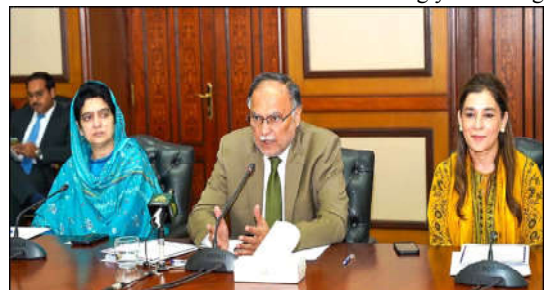
ISLAMABAD: Federal Minister for Planning, Development, and Special Initiatives, Ahsan Iqbal chaired the inaugural meeting of the Education Task Force.

He stressed that the amendments in constitution should be made with consensus according to the requirements of the country and people.