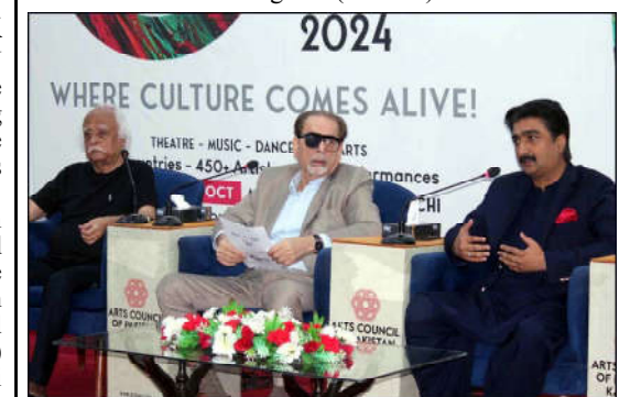
KARACHI: Sindh Minister for Culture, Tourism, Antiquities and Archives Syed Zulfiqar Ali Shah along Arts Council of Pakistan President Muhammad Ahmad Shah addressing to media persons during press conference regarding World Culture Festival Karachi, held at Arts Council building in Karachi.

spread from the mihrab and minbar can make a difference in public health awareness," he expressed the hope. He noted the growing number of dengue cases in Rawalpindi and underscored the importance of religious leaders in spreading the message of cleanliness and prevention. He concluded by urging everyone to follow the teachings of Prophet Muhammad (SAWW).