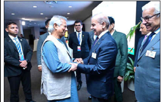
NEW YORK: Chief Advisor (Head of Government) of the Interim Government of Bangladesh Dr. Muhammad Yunus receives Prime Minister Muhammad Shehbaz Sharif at the reception to commemorate 50th Anniversary of Bangladesh's membership in the United Nations.