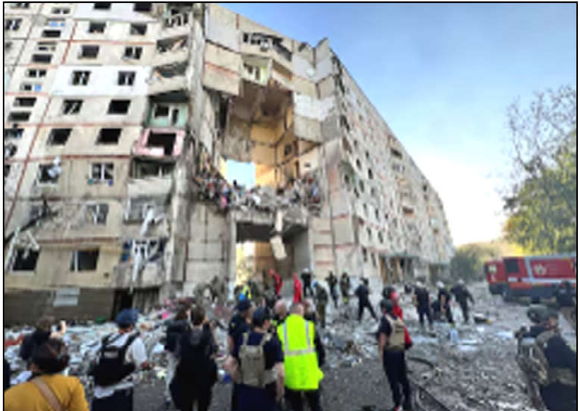
Firefighters and rescuers work at the site of an apartment building hit by a Russian air strike, amid Russia's attack on Ukraine, in Kharkiv.

Monday's footage of Israeli strikes sending up plumes of dust and smoke seemed grimly familiar.