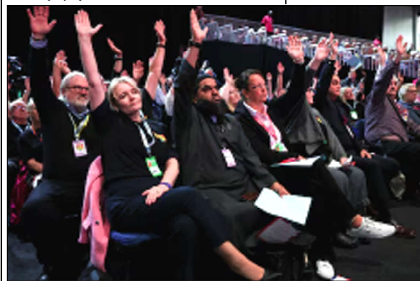
Sharon Graham, general secretary of Unite the Union, votes with other union members at the Britain's Labour Party's annual conference in Liverpool, Britain.

The group, which has recently expanded by including Iran, the United Arab Emirates, Egypt and Ethiopia, has not publicly reacted to the Taliban government's comments.