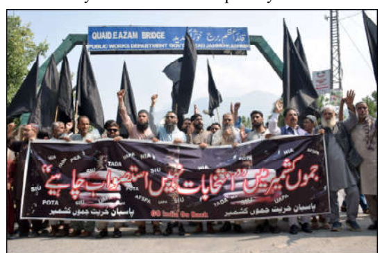
MUZAFFRABAD: Activists of Pasban-e-Hurriyat Jammu and Kashmir hold banner during protest in front of United Nation Office, in the city.

In light of this situation, I would like to extend an invitation for you to Governor's House Peshawar. Khyber Pakhtunkhwa, in near future at your convenience. It's my firm conviction that through this visit the beautiful face of the province blended with hospitality.