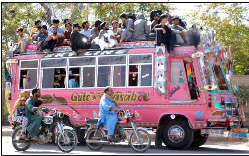
QUETTA: A view of large number of people sitting on the roof top of the passenger bus while traveling in city cause any incident.

Meanwhile, a bazaar in Sada market, Kurram that belonged to one of the tribes involved in the conflict was blown up and fortunately, no casualty happened in this incident. Residents of the Bhagan tribe reportedly blocked the main Peshawar-Peshawar artery, creating troubles for commuters. Police said a grand jirga was scheduled for 10:00 am today as the Commissioner Kohat and RPO have also reached Parachinar to persuade the rival groups for ceasefire. Elders of Turi-Bangash tribes were also attending the jirga.