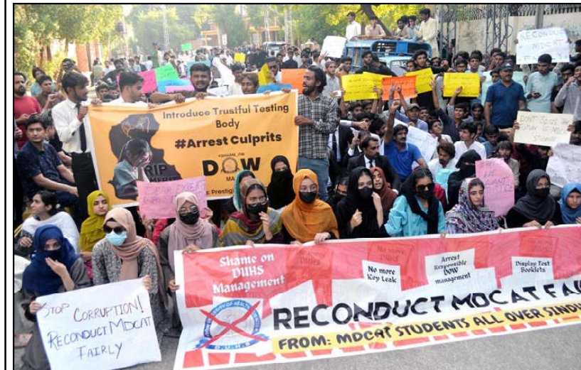
HYDERABAD: Students all over Sindh hold a protest against alleged unfair test of MDCAT, demanding reconduct MDCAT fair test, in Hyderabad.

LAHORE (APP): At least sixteen people were killed while 1403 injured in 1330 road accidents in all 37 districts of Punjab during the last 24 hours. Out of them, 578 people with serious injuries were shifted to different hospitals, while 825 victims with minor injuries were treated on the spot by Rescue Medical Teams. Analysis showed that 744 drivers, 55 underage drivers, 183 pedestrians, and 492 passengers were among the victims of road crashes. Statistics showed that 271 road accidents were reported in Lahore which affected 285 people placed in the provincial capital at top of the list followed by Faisalabad 96 with 93 victims.