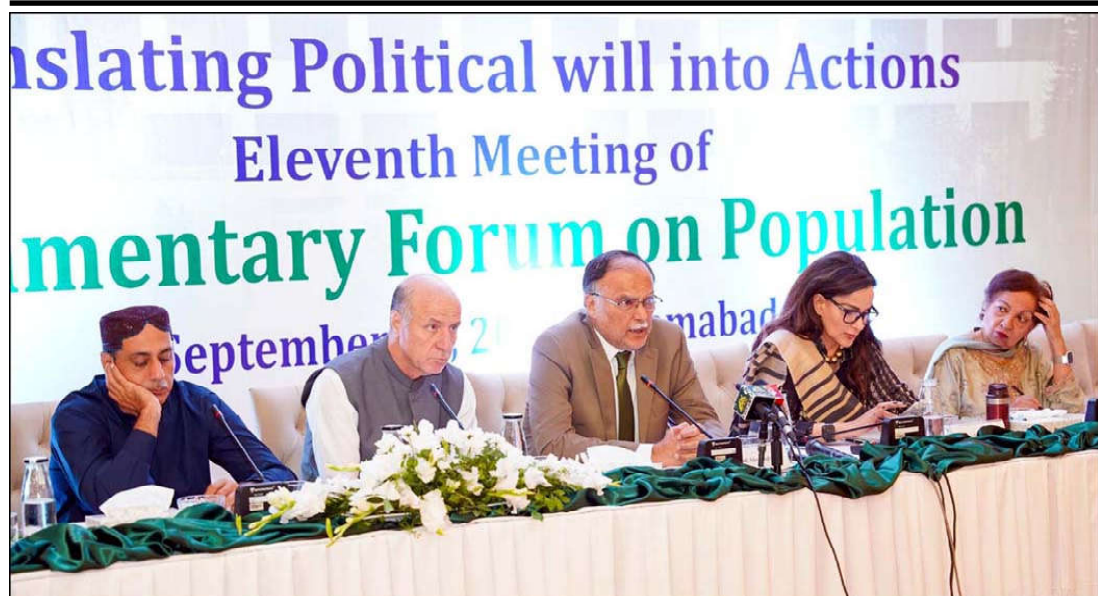
ISLAMABAD: Federal Minister for Planning, Development, and Special Initiatives, Ahsan Iqbal addressing as the chief guest during the 11th Parliamentary Forum on Population, in Islamabad.