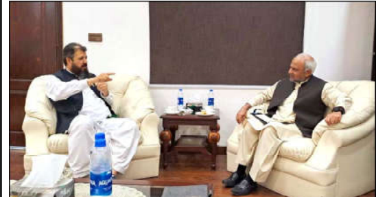
QUETTA: Senator Shakoor Khan Achakzai meeting with acting DG NADRA Balochistan Fayyazur Rehman

some of the region's existing challenges. Deputy Chairman Syedaal Khan emphasized the importance of agriculture in Balochistan and commended Prime Minister Shehbaz Sharif's solar scheme, which is specifically designed to support the province's farmers. He also noted the Prime Minister's strong commitment to the development and prosperity of Balochistan, highlighting that, under the guidance of former Prime Minister Nawaz Sharif, electricity tariffs have been reduced to ease the burden on the people. Additionally, efforts are being made to increase electricity production and minimize load shedding across the country.