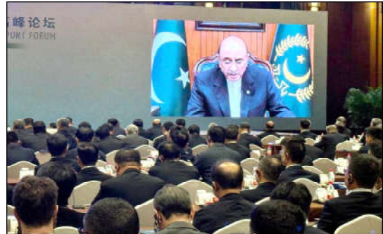
ISLAMABAD: President Asif Ali Zardari addressing the Global Sustainable Transport Forum-2024, through a video message, in Beijing, China.

Similarly, the Pakistanis "presently residing in Lebanon are advised to travel out through commercial flights which are still available," the FO Spokesperson said in a statement.