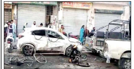
QUETTA: A view of destroyed vehicle seen on blast site. Twelve people were injured in a blast that targeted a police van near Eastern Bypass in Quetta, hospital and government officials said.

Meanwhile the Government of Balochistan has issued orders for investigation into the terrorists' attack on the police mobile in Quetta. According to the spokesman of provincial government, the police mobile was targeted in the terrorism attack in eastern bypass area of Quetta.