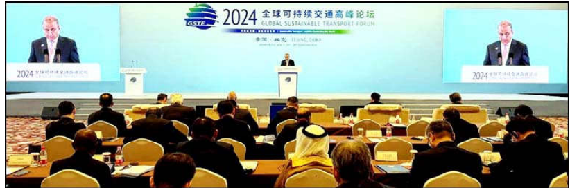
BEIJING: Federal Minister for Communications, Abdul Aleem Khan addressing during the opening session of Global Transport Forum 2024, in Beijing.