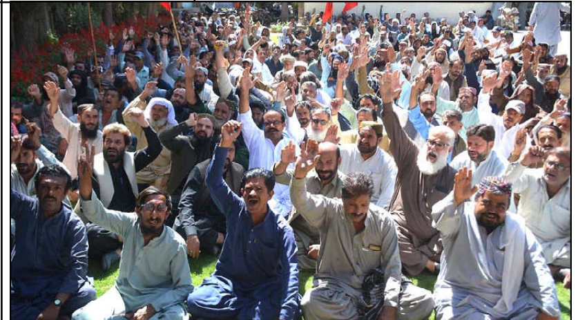
QUETTA: WASA employees' hold protest in favor of their demands'.