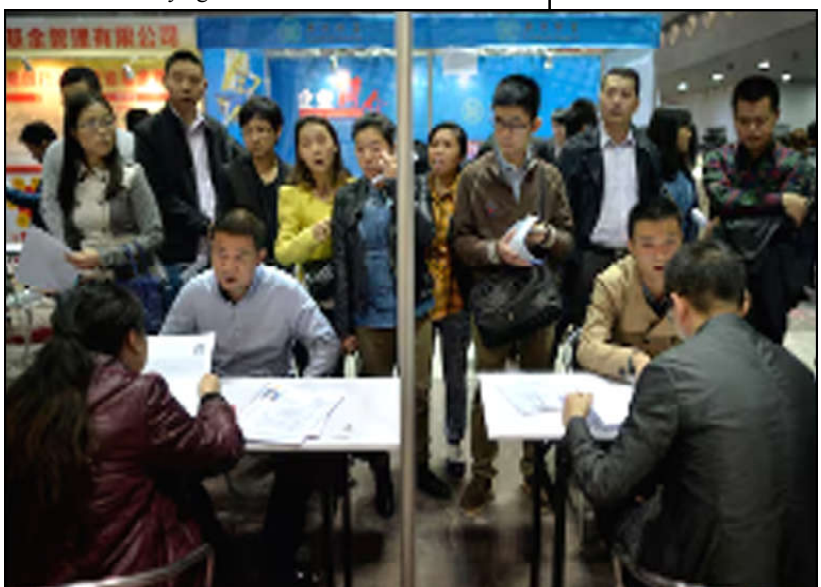
Job seekers speak to recruiters during their interviews at a job fair in Chongqing municipality.

More than 24 per cent of voters had cast their ballots between 7 am (0130 GMT) when the polls opened, and 11 am, the region's chief electoral officer said.