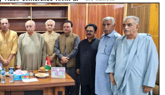
QUETTA: Chairman PkMAP and Chief of Tahafuz Aain Pakistan Mehmood Khan Achakzai photographed with journalists