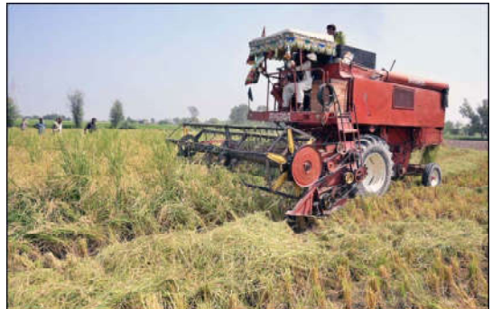
SARGODHA: Farmers using a harvester machine to harvest rice in the fields on the outskirts of the city.

Shanghai Cooperation Organisation (SCO) has provided a meaningful opportunity to develop confidence among the member states as well as regional countries for the promotion of peace.