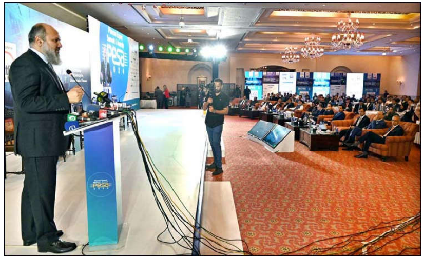
ISLAMABAD: Federal Minister for Commerce, Jam Kamal Khan Addressing a 7th Pharma Export Summit and Awards 2024 ceremony at local hotel in federal capital.

He noted that local pharmaceutical exports registered about 13 percent growth during the last financial year, underscoring the industry's critical role.