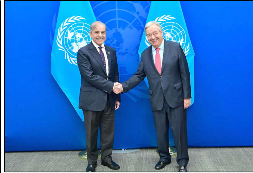
NEW YORK: Prime Minister Muhammad Shehbaz Sharif meets with Secretary General of the United Nations Antonio Guterres on the sidelines of 79th session of United Nations General Assembly.

Imran Khan further commented that to cover up election fraud, they want their own judges. They are trying to ensure that PTI does not rise in any way. He also mentioned that they are not being allowed to hold any public gatherings and if permission is not granted for the rally in Rawalpindi, they will protest.