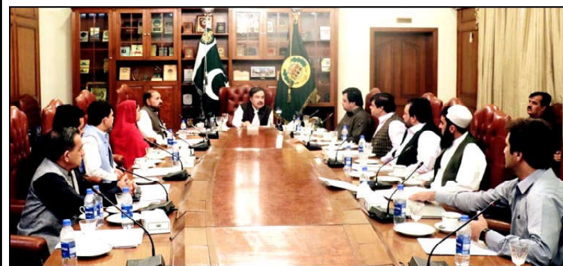
QUETTA: Governor Balochistan Sheikh Jaffar Khan Mandokhail presiding over annual meeting of Pakistan Red Crescent Society Balochistan

He highlighted that over the last five years, devastating floods, heavy rainfall and extreme weather conditions had severely damaged Pakistan's transport infrastructure including roads, rails, bridges and other critical transport networks that isolated millions of people, particularly in rural areas.