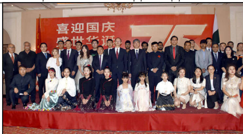
ISLAMABAD: Chinese Students group photo after a Performance During the 75th National Day of the People's Republic of China, Organized by the Overseas Chinese Association of Pakistan.