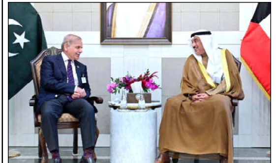
NEW YORK: Prime Minister Muhammad Shehbaz Sharif held a meeting with the Crown Prince of Kuwait His Highness Sheikh Sabah Al-Khaled Al-Hamad Al-Mubarak Al-Sabah on the sidelines of the 79th United Nations General Assembly Session.

Prime Minister Shehbaz also underscored the need for stemming the rising tide of Islamophobia, and discrimination against Muslims worldwide.