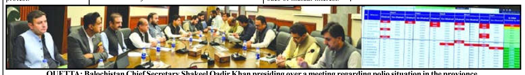
QUETTA: Balochistan Chief Secretary Shakeel Qadir Khan presiding over a meeting regarding polio situation in the province

The minister emphasized that the government's aim was not just to enroll children in schools but to provide them with quality education. "We must equip every child with basic computer skills and modern technical education, along with establishing state-of-the-art laboratories," he stated. Terming the initiative as a significant challenge, he underscored that no educational reforms would succeed without improving teacher training in the country.