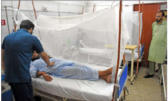
ISLAMABAD: Patients being treated in the special dengue ward of the Polyclinic Hospital in the Federal Capital.

It was noted that the Pakistan Engineering Council (PEC) oversees the building code and that notifications are issued by the Ministry of Science and Technology. The code establishes minimum standards for building safety, structural integrity, and