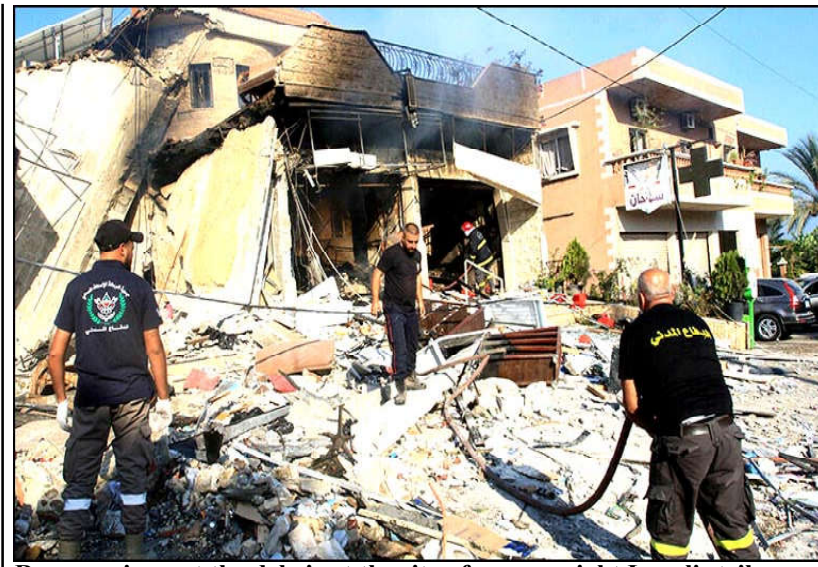
Rescuers inspect the debris at the site of an overnight Israeli strike on a pharmacy in the southern Lebanese village of Akbiyeh.

Monday's bombardment of Lebanon was by far the largest, not just in the past year, but since the Israel-Hezbollah war in the summer of 2006. That war killed 1,200 people in Lebanon, mostly civilians, and 160 Israelis, most of them soldiers, and devastated large swaths of Hezbollah's strongholds. Pakistan condemned the Israeli aggression "in the strongest possible terms". A statement from the Foreign Office (FO) said the act of aggression was a "grave violation" of the UN Charter and international law. "It is a dangerous escalation that has further endangered peace and security in an already volatile region," the FO added. It reaffirmed full support for Lebanon's sovereignty and territorial integrity, saying that Pakistan stood in solidarity with the people of Lebanon and for their right to live in peace and security.