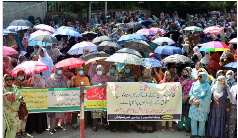
RAWALPINDI: Members of Punjab Teachers Union protesting outside the Press Club against the privatization of government schools.

She further highlighted the steps taken by the government to promote women's welfare across Punjab.