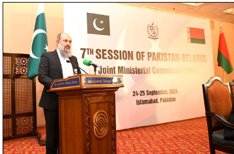
ISLAMABAD: Federal Minister for Commerce Jam Kamal Khan addressing to the 7th Session of Joint Ministerial Commission between Pakistan and Belarus.

issues. The problems of landowners affected by road expansion projects will be resolved, and payments will be made promptly. Asad stated that the district administration is taking effective measures to resolve public issues. The difficulties faced by people regarding land revenue and land transfers will be addressed. The issues of landowners affected by road expansion projects will be resolved quickly, ensuring the projects' completion without hindrance.