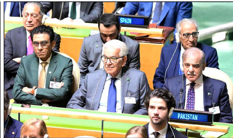
NEW YORK: Prime Minister Muhammad Shehbaz Sharif attending the inaugural session of United Nations General Assembly, New York.

ISLAMABAD (APP): Pakistan on Tuesday strongly condemned Israel's latest military aggression against Lebanon, massacring hundreds of civilians. "This act of aggression against the Republic of Lebanon is a grave violation of the UN Charter and international law. It is a dangerous escalation that has further endangered peace and security in an already volatile region," a Foreign Office press release said. It said Pakistan reaffirmed its full support for Lebanon's sovereignty and territorial integrity, and stood in solidarity with the people of Lebanon and for their right to live in peace and security.