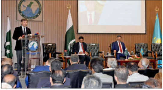
ISLAMABAD: Ambassador of Kazakhstan to Pakistan Yerzhan Kistafin addressing during a conference titled "Rising Kazakhstan agenda for building regional cooperation" organized by Embassy of Kazakhstan at Institute of Regional Studies, in the Federal Capital

The project includes a research centre for the digital documentation of Buddhist heritage sites and a conservation laboratory for the treatment of museum artefacts.