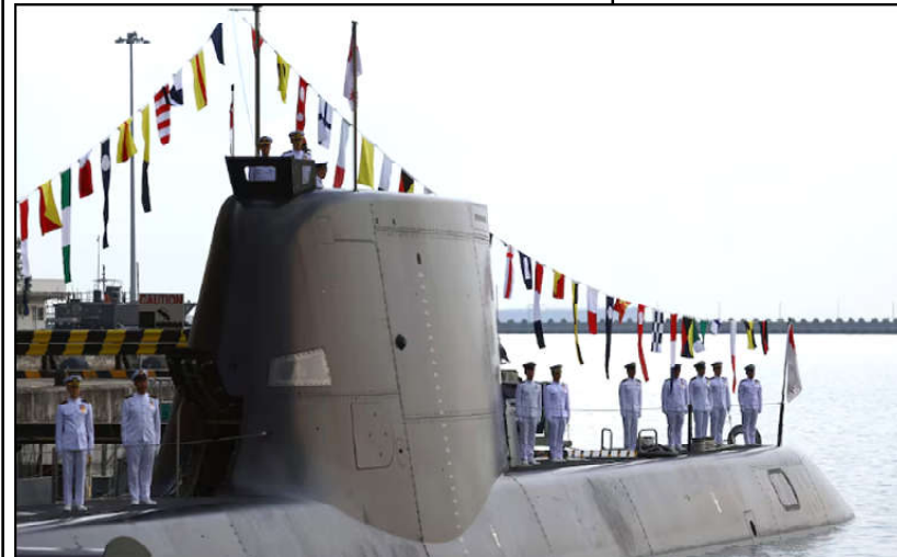
A view of RSS Impeccable during a commissioning ceremony of the Republic of Singapore Navy's first and second Invincible-class submarines Invincible (INV) and Impeccable (IPB) at the Changi Naval Base in Singapore.

Stretching across several Mexican states, the storm uprooted trees and electrical posts and damaged roofs, officials told reporters at a briefing on Tuesday. The affected area is home to both cargo ports and some of the country's top beach resorts. Around two-thirds of local power users were without electricity and phone service was also hit, officials said. Video posted on social media showed sheets of rain pummeling empty streets overnight near the large Lazaro Cardenas port.