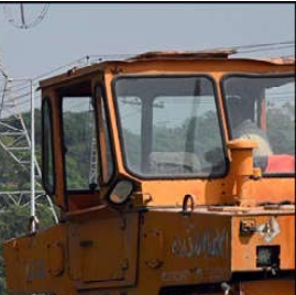
ISLAMABAD: Labourers busy in road construction with the help of heavy machinery during development work near Faizabad.

ISLAMABAD: Islamabad Police conducted one day road safety training for students and teachers of Islamabad Model College for Girls G-8/4 to sensitize the participants about the traffic rules and road safety measures. More than 400 students and teachers participated in the workshop and it got an overwhelming response from them. Students were educated during the workshop about dangers of risky driving, rights