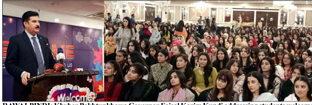
RAWALPINDI: Khyber Pakhtunkhwa Governor Faisal Karim Kundi addressing students welcome event at Punjab College D-9 Campus.

He engaged participants in a focused discussion about the powers and functions of local government officials, using practical examples to illustrate key concepts and enhance understanding.