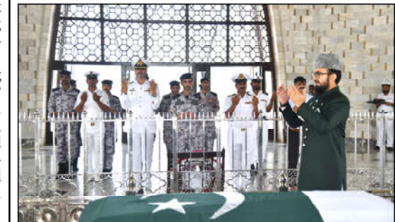
Qatar Emiri Naval Forces delegation offering Fataha at Mazar-e-Quaid during visit to Karachi.