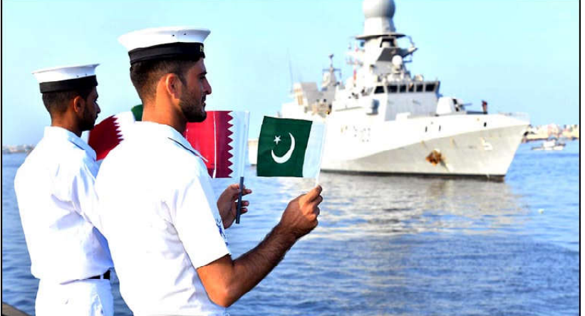
KARACHI: Warmly welcomed by Pakistan Navy officers and sailors upon arrival of Qatar Emiri Naval Forces Ship (QENS) ALKHOR visited Karachi for exercise ASAD ALBHAR-111.