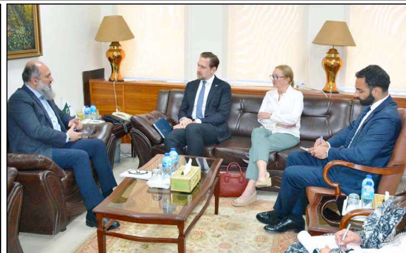
ISLAMABAD: Federal Minister Jam Kamal and UK Trade Commissioner Oliver Christian Discuss Strengthening Bilateral Trade and Exploring New Avenues for Partnership.

This discussion marked a significant step in strengthening trade ties, with both parties expressing optimism for the future of UK-Pakistan trade relations.