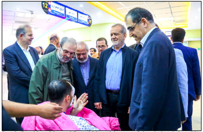
Iran's President Masoud Pezeshkian visits one of the victims injured by pager explosions across Lebanon, in a hospital in Tehran, Iran.