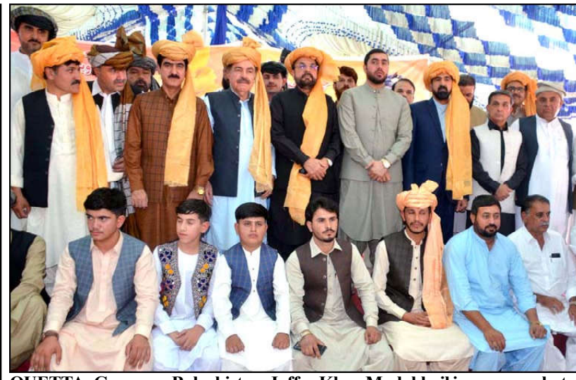
QUETTA: Governor Balochistan, Jaffar Khan Mandukhel in a group photograph with Parliamentarians, Bureaucrats, Member Civil Societies and Students on occasion of Pashtun Culture Day.