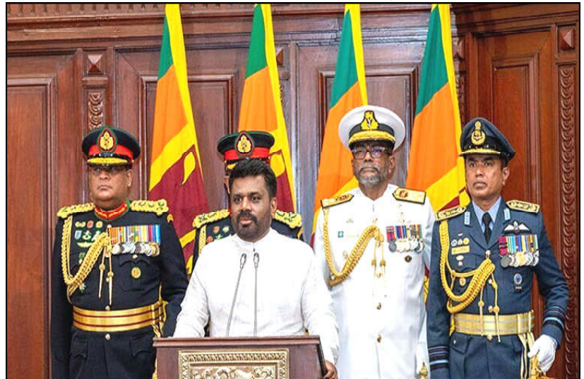
Sri Lanka's newly elected President Anura Kumara Dissanayake addresses a gathering after taking his oath of office at the Presidential Secretariat in Colombo.

TOKYO (AFP/APP): Heavy rain that triggered floods and landslides on a Japanese peninsula recovering from an earthquake this year killed at least six people, local media reported Monday. Public broadcaster NHK and other outlets said six were dead, while a fire department official told AFP that one had died and five were "in a state of cardio-respiratory arrest", a term used in Japan before a feared death can be confirmed by a doctor. The regional government in Ishikawa on the Sea of Japan coast said two were missing and the status of eight people was unknown. Heavy rain pounded Ishikawa from Saturday, with more than 540 millimetres (21 inches) recorded in the city of Wajima over 72 hours, the heaviest continuous rain since comparative data became available. The region is still reeling from a magnitude-7.5 quake at the start of the year, which toppled buildings, triggered tsunami waves and sparked a major fire. Floodwaters inundated emergency housing built for those who had lost their homes in the New Year's Day quake, which killed at least 374 people, according to Ishikawa government figures.