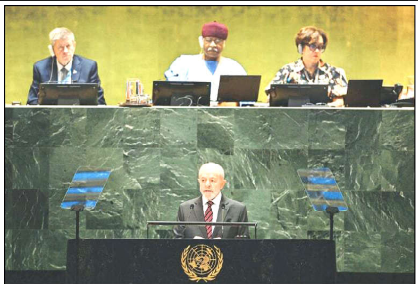
NEW YORK: President of Brazil Luiz Inácio Lula da Silva speaks during 'Summit of the Future' on the sidelines of the UN General Assembly.