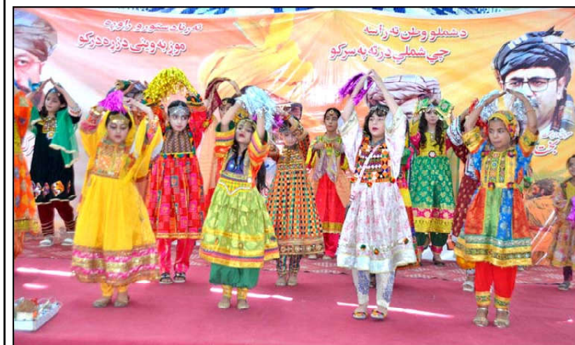
QUETTA: Students performing traditional dance (Pashtu Attan) on occasion of Pashtun Culture Day.

In addition to this, the Chief Minister exhorted the Provincial Ministers and Parliamentary Secretaries to form effective mechanism for giving hearing to the public issues. He expressed the government's resolve to improve the service delivery by making departments efficient as sustainable solution of the public issues is possible through good governance.