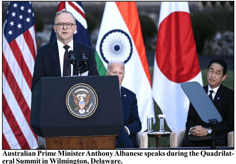
Australian Prime Minister Anthony Albanese speaks during the Quadrilateral Summit in Wilmington, Delaware.