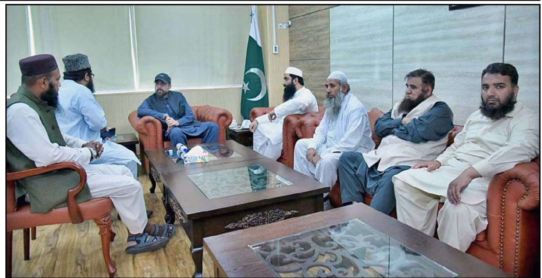
ISLAMABAD: Federal Minister for Religious Affairs and Interfaith Harmony Chaudhry Salik Hussain meeting with religious scholars.

leaders, we can overcome these challenges," Salik added. He commended the religious scholars and saints for rejecting the narratives of extremists and terrorists, calling for an end to the exploitation of religion for terrorist activities. He remarked, "Anyone or any group that takes up arms against the state is a terrorist, and we must unite as a nation to eradicate the scourge of terrorism."