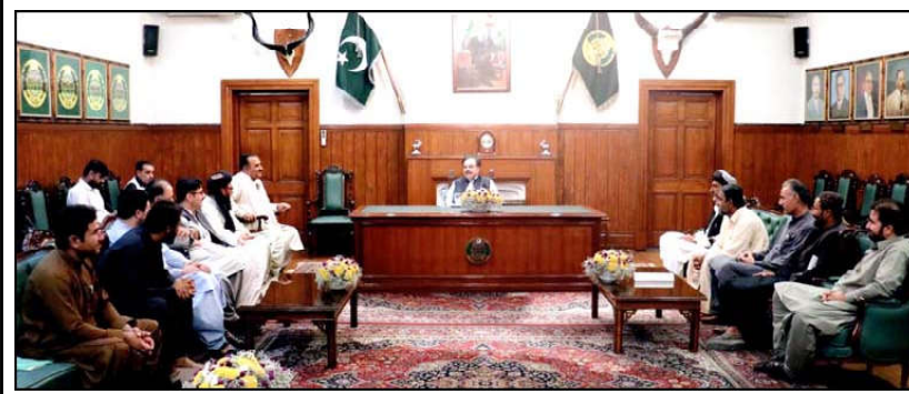
QUETTA: Different delegations meeting with Governor Balochistan Sheikh Jaffar Khan Mandokhail