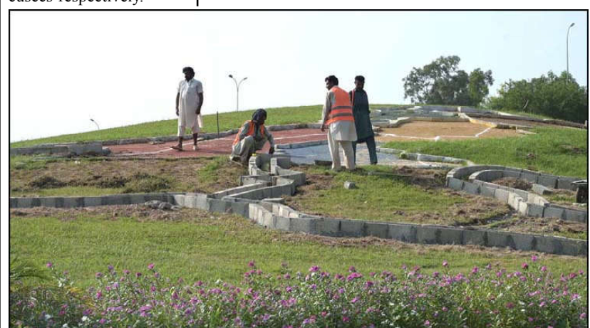
ISLAMABAD: CDA workers busy in fixing cemented blocks for preparing Pakistan Map on greenbelt at Zero Point.

ing here. However, the Deputy Commissioner lauded the district administration's decision to make all stamp papers online to facilitate the citizens. The meeting was attended by officers of Punjab Land Revenue Authority who briefed the deputy commissioner on Online Registration System.