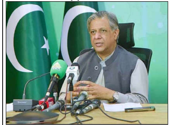
ISLAMABAD: Federal Minister for Law and Justice Senator Azam Nazeer Tarar addressing an important press conference.

"I am grateful for this gracious gesture that reflects the iron brotherhood and All Weather Strategic Cooperative Partnership between Pakistan and the People's Republic of China," the prime minister wrote on his X timeline in response to a congratulatory letter he received from President Xi.