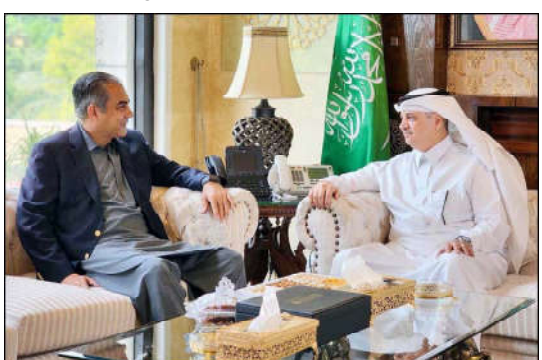
ISLAMABAD: Federal Minister for Interior Mohsin Naqvi in a meeting with Ambassador of Saudi Arabia Nawaf bin Said Ahmed Al-Maliki.