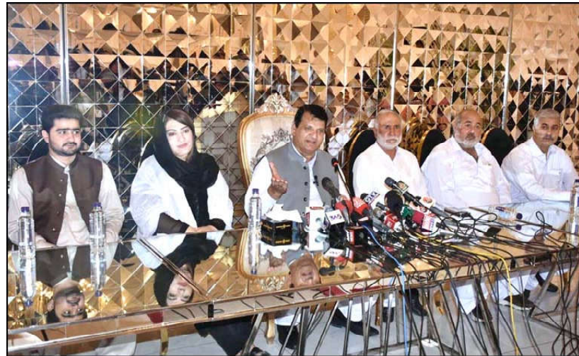
PESHAWAR: Federal Minister for Kashmir Affairs, GB, SAFRON and President PML-N Khyber Pakhtunkhwa Engr. Amir Muqam addressing a press conference.

for the first time, policemen in KP had been incited to protest, making it unsafe for people to leave their homes after night, especially in southern districts and merged areas of the province. Strongly criticizing the KP government's poor performance especially in higher education sector in the province, where about 25 public sector universities are operating without Vice Chancellors, marring education standards and research works immensely. Instead of appointing VCs, the Chief Minister KP had announced plans to sell university properties, which Muqam argued would lead to economic collapse for these cash-starved educational institutions in the province.