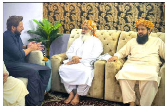
KARACHI: Jamiat Ulema-e-Islam (JU-F) Chief, Maulana Fazal-ur-Rehman exchanges views with Former Pakistan Captain and All-Rounder, Shahid Khan Afridi during meeting held in Karachi.