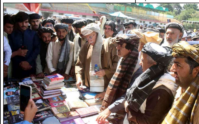
QUETTA: Pashtunkhwa Milli Awami Party (PkMAP) Chairman, Mehmood Khan Achakzai take keen interest at a stall during ceremony on the occasion of Pashtun Culture Day, at Sadiq Shaheed Ground in Quetta.