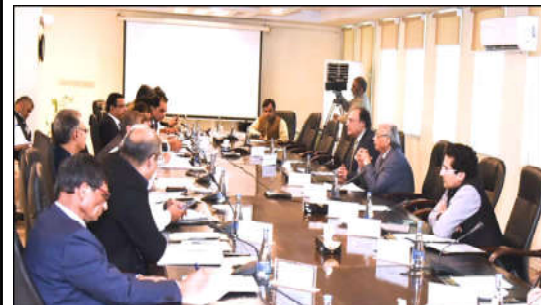
ISLAMABAD: Federal Minister for Finance and Revenue Senator Muhammad Aurangzeb chairs the meeting of the Economic Coordination Committee (ECC) at the Finance Division.

ISLAMABAD: Chief Justice of Pakistan Qazi Faez Isa has nominated Justice Aminuddin Khan as the third member of the committee tasked with forming benches and fixing cases under Article 184(3) of the Constitution. This move follows the promulgation of an ordinance on the Supreme Court Practice and Procedure Act, which aims to enhance transparency in Pakistan's judicial process. The committee, established under the newly amended Practice and Procedure Act, will be led by the chief justice, with the senior puisne judge (Justice Mansoor Ali Shah) and a third senior judge as members. The ordinance grants the Chief Justice the discretion to nominate a Supreme Court judge as the third member of this committee as needed.