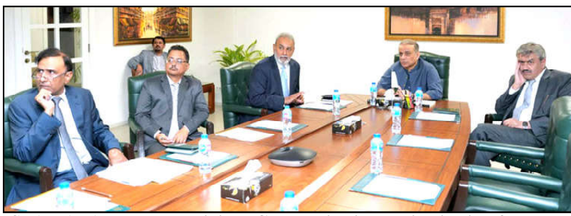
ISLAMABAD: Federal Minister Communications, Privatization & Board of Investment Abdul Aleem Khan presides over high level meeting of NHA.

had been the first investor of Sahiwal Coal Power Plant established under the China-Pakistan Economic Corridor. Briefing the prime minister, the company head said that the textile parks aimed at boosting textile exports and making the country a hub of textiles and garments. To be powered by solar energy, the textile parks would be developed as zero-carbon and automated facility to enhance the exports to $2 billion in its first phase and $5 billion in the second one besides creating from 0.3 million to 0.5 million jobs.