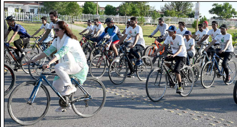
ISLAMABAD: A large number of youth participating in a cycle rally "Cycle for life" to promote environmental preservation, raise awareness about the dangers of drug use among youth and engage youth in healthy activities organized by the Prime Minister's Youth Program at Constitution Avenue D-chowk.