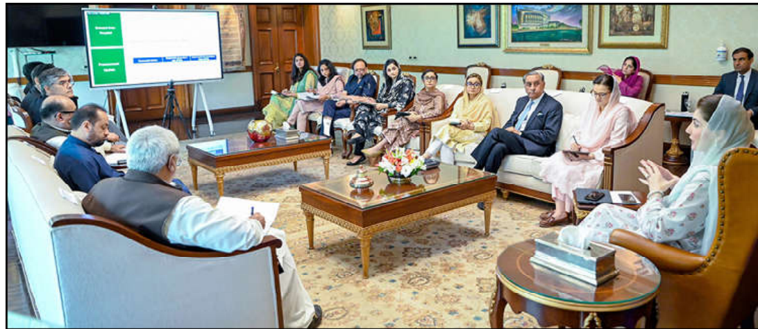
LAHORE: Punjab Chief Minister Maryam Nawaz Sharif presides over the special meeting about Health Department.

Minister was updated that Rs 278 billion have been allocated for the development schemes, out of which Rs 83 billion have been released so far. Monitoring is being introduced through modern technology including drones and GIS mapping. Chief Minister Maryam Nawaz Sharif was further briefed, "Progress on projects will be ensured against clear timeline." She reviewed current status of the development projects and their completion dates. She said, "I will not compromise on transparency, speed and quality of implementation of these projects to ensure maximum public welfare."