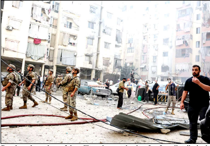
People and members of the military inspect the site of an Israeli strike in the southern suburbs of Beirut, Lebanon.

The Israeli military reported warning sirens sounded in northern Israel following the Beirut strike. Israeli media reported heavy rocket fire in northern Israel. Hezbollah said it had fired Katyusha rockets at what it described as the main intelligence headquarters in northern Israel "which is responsible for assassinations". White House national security spokesman John Kirby said he was not aware of any Israeli notification to the United States before the Beirut strike, adding that Americans were strongly urged not to travel to Lebanon, or to leave if they are already there.