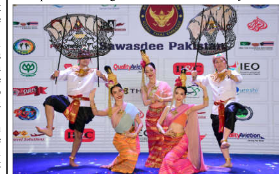
ISLAMABAD: Thai artists performing Thai traditional dance during a ceremony titled "Sawasdee Pakistan" organized by Thai Embassy at a local Mall, in the Federal Capital.