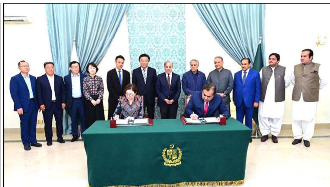
ISLAMABAD: Prime Minister Muhammad Shehbaz Sharif witnesses signing of an MoU between Board of Investment and RUYI Shangdong.