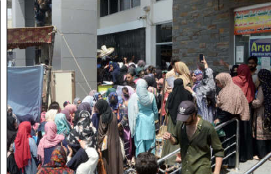
HYDERABAD: Large number of candidates gathered outside the National Database and Registration Authority office for interviews for the various jobs in NADRA office, in the city.

The Minister for Labour said that the issuance of E-Card will secure all data of the patients and ensure the provision of treatment facilities to all visitors and they will be got rid of waiting in long queues.