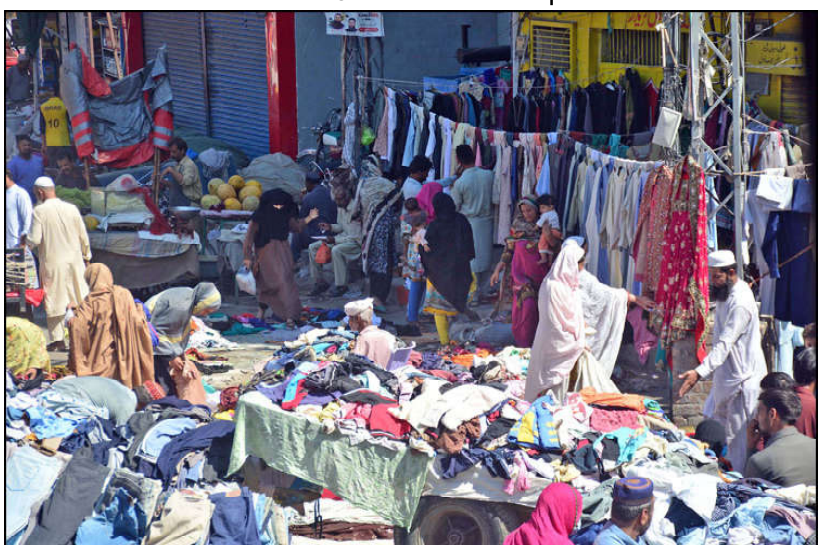
RAWALPINDI: People are busy buying secondhand clothes in a Landa Bazaar at Namakmandi area in the city.

is a critical metric in the industry," Chen explained adding.