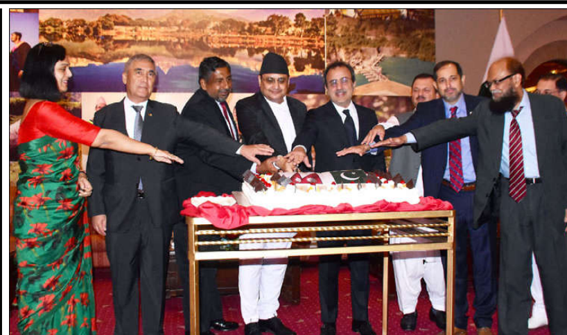
ISLAMABAD: Federal Minister of Energy Awaiz Ahmad Khan Leghari, Ambassador of Nepal to Pakistan Tapas Adhikari, and others cutting the cake during National Day ceremony of Nepal at a local hotel.