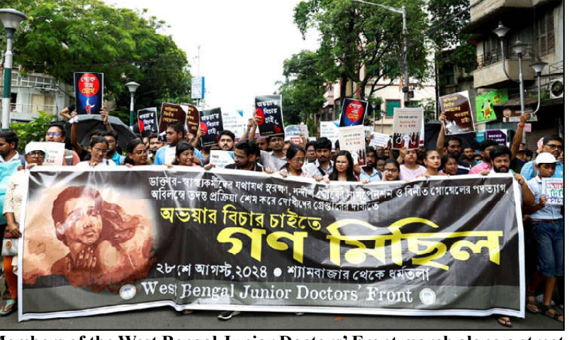
Members of the West Bengal Junior Doctors' Front march along a street during a protest condemning the rape and murder of a trainee medic at a government-run hospital, in Kolkata, India.