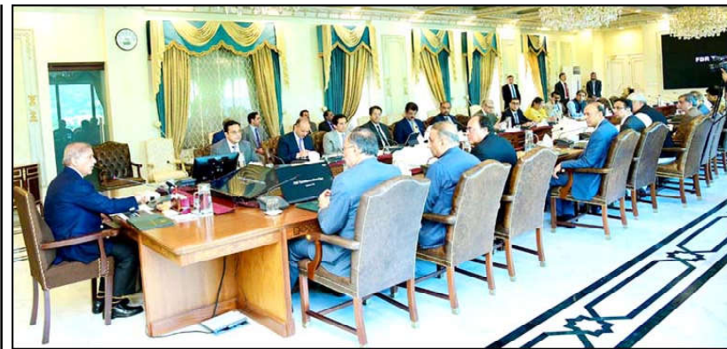
ISLAMABAD: Prime Minister Muhammad Shehbaz Sharif chairs a meeting on transformation plan of Federal Board of Revenue.