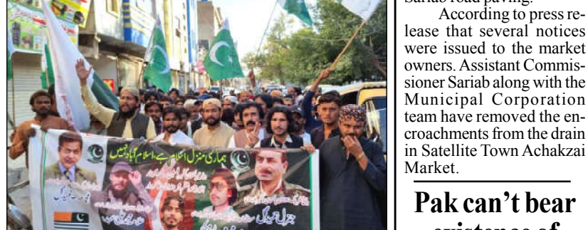
QUETTA: Members of Tehreek-e-Jawan-e-Pakistan are holding rally in favor of Pakistan Armed Forces, at Quetta press club.