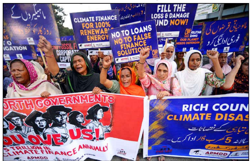
KARACHI: Members of Pakistan Fisher Folk Forum are holding protest demonstration for awareness of Climate Change, at Karachi press club.

tals, schools, BHUs, RHCs and bazzars in their respective different areas. It was informed that in all 811 non-functional schools have been made functional in the province. Show cause notices have been issued to the absentee teachers. In all 36 Levies personnel have been dismissed from the service. Similarly, 181 acres of land have been vacated from the illegal occupants. Speaking on the occasion, Chief Secretary directed to all Deputy Commissioners to conduct meetings of District Education Group and District Health Committees on regular basis.