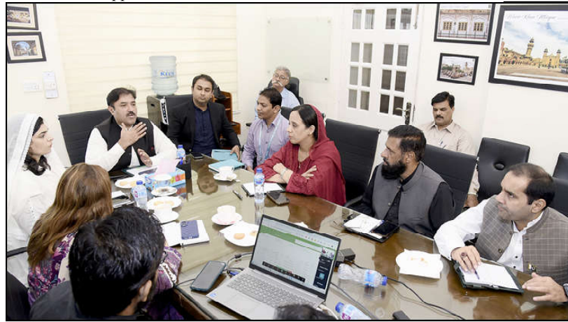
LAHORE: Punjab Local Government Minister Zeeshan Rafique chairs high level meeting regarding preparation of app for citizens under "Suthara Punjab Program".

Alongside, several development projects at the adjacent Jinnah College for Women have been completed, including flooring, repairs, and other improvement works. Furthermore, the renovation and restoration of the historic Government Hussain Sharif Higher Secondary School No. 1 in Peshawar City, as well as the repair, renovation,