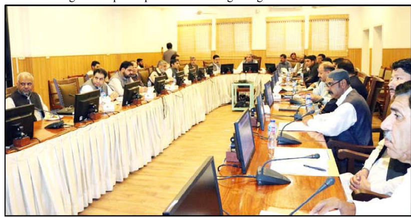
QUETTA: Speaker Balochistan Assembly Captain (ret'd) Abdul Khaliq Achakzai presiding over a meeting with Task Force of District Administration Chaman for solution of problems