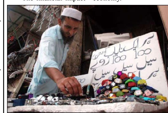
PESHAWAR: Vendor selling and displaying wrist watches to attract the customers at Khyber Bazaar.