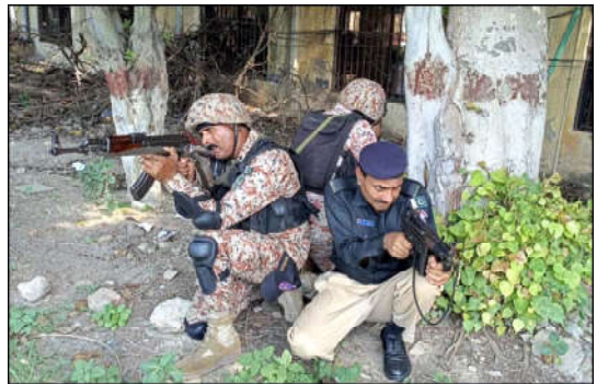
KARACHI: Police and Rangers officials are taking part in mock exercise as a practice to defend in perception of any terrorist attack, at Cantt Railway Station in Karachi.

Punjab Information Minister Azma Bukhari has thrown down the gauntlet, challenging critics to compare the performance of previous Chief Minister Buzdar with the current CM.