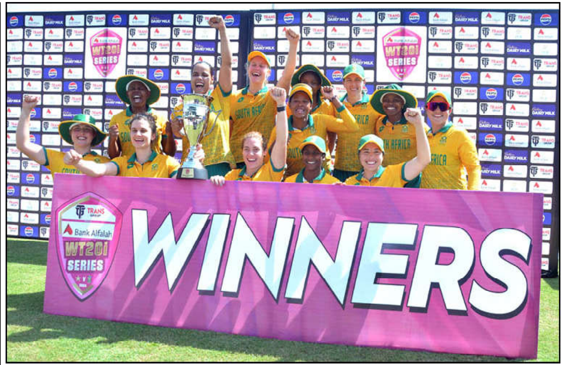
MULTAN: The South Africa Women's cricket team celebrates with the trophy after winning the series 2-1 against Pakistan Women at Multan Cricket Stadium.

Ahmad Nadeem said in his opening address that the aim of the conference is to achieve world peace in the light of the Seerah of Holy Prophet PBUH. If the world wants peace, it must come to the life of Prophet Muhammad PBUH, he mentioned. Instead of wandering here and there for world peace, come towards the Seerah of Holy Prophet PBUH. He said that important topics such as the clash of civilizations have also been kept in this festival. For the solution of social problems, guidance should be taken from the life of Holy Prophet PBUH.