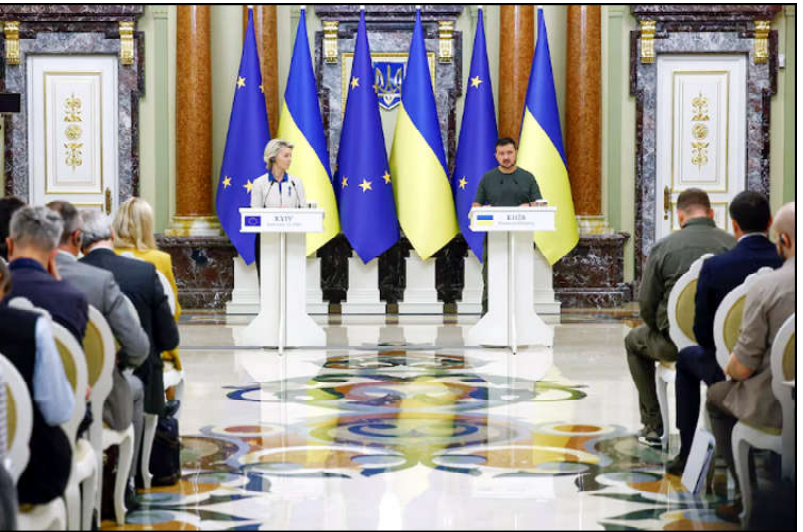
European Commission President Ursula von der Leyen and Ukraine's President Volodymyr Zelenskiy attend a joint press conference, amid the Russia-Ukraine conflict, in Kyiv, Ukraine.

"There is no flooding in the city centre at the moment (...). The recreational beaches are flooded, but I think we all expected it, and I think for now everything looks optimistic." The army said 16,000 soldiers were helping out in the region, alongside