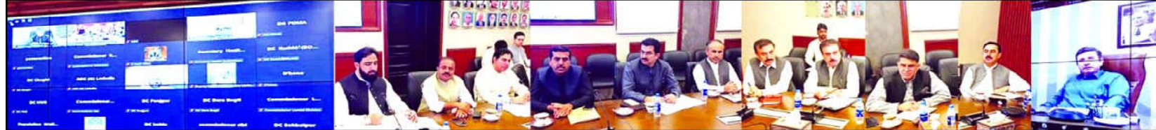
QUETTA: Chief Secretary Balochistan Shakeel Qadir Khan addressing Divisional Commissioners and Deputy Commissioners Conference