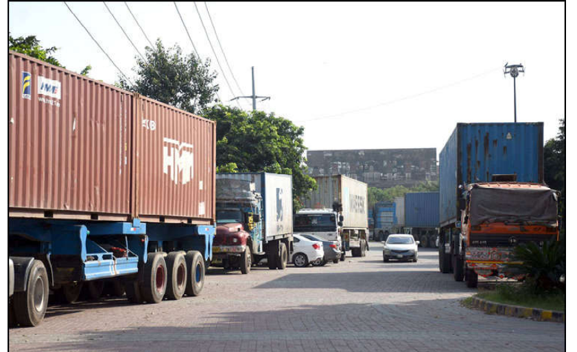
LAHORE: A view of heavy shipping containers placed alongside a road for road block due to PTI public gathering (Jalsa) at Minto Park, headed on 21 September Saturday, in the Provincial Capital.

He further stated that the government aims to ensure that the real benefits of the health insurance program reach the common man, with plans to shift a larger portion of the health insurance program from the private to the public sector.