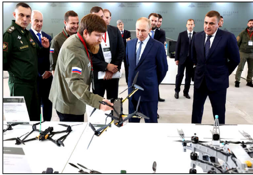
Russia's President Vladimir Putin visits a drone production facility of the Special Technology Centre in Saint Petersburg, Russia.

Monitoring Desk PARIS: French Prime Minister Michel Barnier, who met with several party leaders on Thursday, could be nearing a deal on a cabinet, French media said, two weeks after President Emmanuel Macron named him to the post. Barnier, the European Union's former Brexit negotiator, has struggled to name a new government, underlining the complicated topography of France's political landscape after Macron's ill-fated decision to call a snap legislative election this summer. The vote delivered an unruly hung parliament that has left political unity hard to come by.