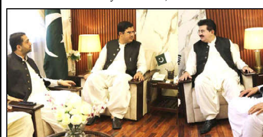
QUETTA: Chairman Public Accounts Committee Asghar Ai Tareen and former Chairman Senate & MPA Sadiq Sanjrani and former Home Minister Balochistan Mir Ziaullah Lango during a meeting.

PESHAWAR (APP): A report from the Counter-Terrorism Department (CTD) on Thursday reported that 324 people including police officials, officers and civilians have been martyred in terror incidents in restive Khyber Pakhtunkhwa (KP) since the start of this year. Moreover, it said 616 others including civilians have been injured due to attacks by anti-state elements. In Peshawar alone, 103 police officials have been martyred, with 154 others injured in terrorism-related incidents. The report also noted that 103 civilians have died, and 159 have sustained injuries. Dera Ismail Khan has reported the deaths of 63 security personnel, including 49 from the Frontier Corps, and 124 injuries. Furthermore, 8 law enforcement officials were martyred, with 4 others wounded.