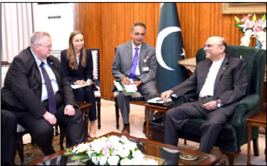
ISLAMABAD: President Asif Ali Zardari in a meeting with the visiting Deputy Prime Minister of Russia, Alexei Overchuk, at Aiwan-e-Sadr.

UNITED NATIONS (APP): A top Pakistani diplomat Wednesday told the U.N. Security Council that the Tehrik-e-Taliban (TTP), which has Afghan rulers' protection, was emerging as an umbrella organization for other terrorist groups, whose objectives, he said, were the destabilization of Afghanistan's neighbours. "While some of our friends may believe that they are only threatened by Daesh, they should also be concerned by the threat they could confront from a strengthened TTP in the not too distant future," Ambassador Munir Akram warned the 15-member Council during its debate in the situation in Afghanistan. Pakistan, he said, will take national action, cooperating with regional and international organizations to eliminate TTP's threat. "The TTP (which we in Pakistan call Fitna Al Khawari) is an organization of special concern to Pakistan and should be of concern to the entire region and the world," the Pakistani envoy said, while giving details of its deadly cross-border attacks that resulted in the deaths of hundreds of civilians and soldiers. Even three years after the Taliban assumed the reins of power in Afghanistan, the situation continues to be dire and deeply concerning, Ambassador Akram said. There will be no normalization "until the fundamental issues that trouble Afghanistan are addressed — terrorism."