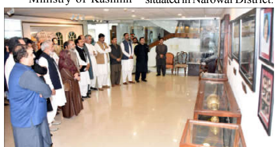
Delegation of members of the Provincial Assembly of Khyber Pakhtunkhwa visiting senate museum at Parliament House Islamabad

ISLAMABAD (Online): Islamabad High Court (IHC) has issued notice to secretary National Assembly (NA) and others and sought reply within 10 days in connection with case pertaining to arrest of PTI MNA Zain Qureshi from Parliament House. Chief Justice (CJ) IHC Aamer Farooq heard the case against detention of Zain Qureshi Thursday. The CJ IHC inquired this incident happened when. Counsel Taimore Malik said the members of parliament were arrested on September 9. The court remarked we obtain report from NA. The court while issuing notice to interior ministry, chief commissioner Islamabad.