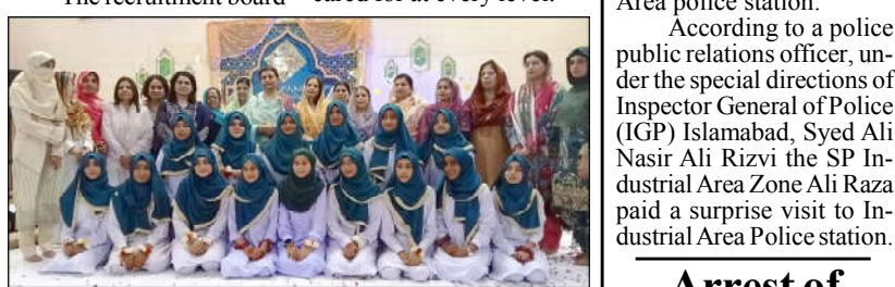
ISLAMABAD: Students and teachers pose for a group photo at annual Mehfil-e-Milad ceremony at IMCG (PG)G-10/4.