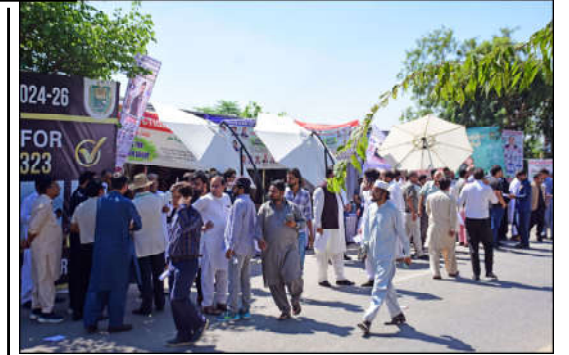
ISLAMABAD: Traders casting their votes during ICCI Elections for the year 2024-26 in the Federal Capital.

ISLAMABAD (APP): The per tola price of 24 karat gold increased by Rs. 800 and was sold at Rs. 268,500 on Thursday compared to its sale at Rs. 267,700 on the last trading day. The price of 10 grams of 24 karat gold also increased by Rs. 685 to Rs. 230,195 from Rs. 229,510 whereas the price of 10 gram 22 karat gold went up to Rs. 211,012 from Rs. 210,384, the All Sindh Sarafa Jewellers Association reported. The price of per tola and ten gram silver remained unchanged at Rs. 2,950 and Rs. 2,529.14, respectively. The price of gold in the international market increased by $8 to $2,577 from $2,569, the Association reported.