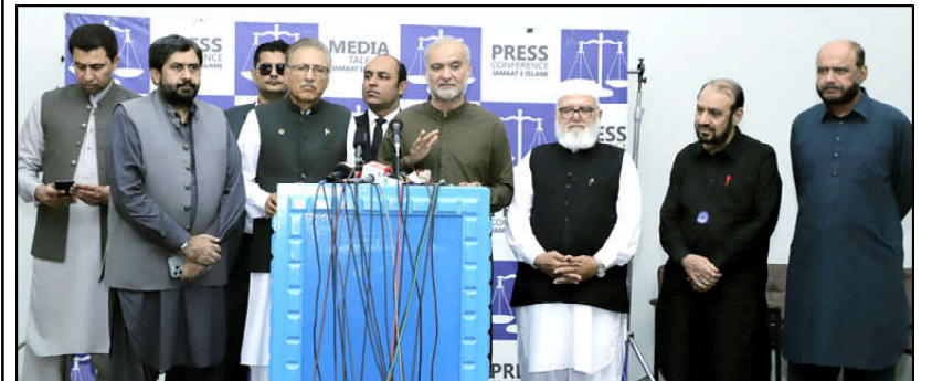
LAHORE: Ameer Jamaat-e-Islami Hafiz Naeem-ur-Rehman and former President and PTI Senior Leader Dr. Arif Alvi talking to media persons.

WASHINGTON (APP): Ambassador Rizwan Saeed Sheikh Wednesday presented his Letter of Credence to President Joe Biden as the 30th envoy of Pakistan to the United States. At a ceremony, held at the Blair House, the President welcomed Ambassador Sheikh, saying the United States will continue to stand with Pakistan in dealing with key global and regional challenges. The ceremony was attended by members of the diplomatic community and senior officials of the U.S. administration, according to a press release of the Pakistan embassy. In his remarks, Ambassador Sheikh conveyed greetings from the President, Prime Minister and the people of Pakistan to the leadership and people of the United States, saying the two countries have a rich legacy of cooperative relations and have laid enduring foundations to strengthen bilateral ties. Recalling U.S. assistance to Pakistan, especially during its nascent phase of statehood, the Ambassador observed that the two countries continue to invest in their relationship and are stepping up cooperation in climate change, energy, health, trade, and investment.