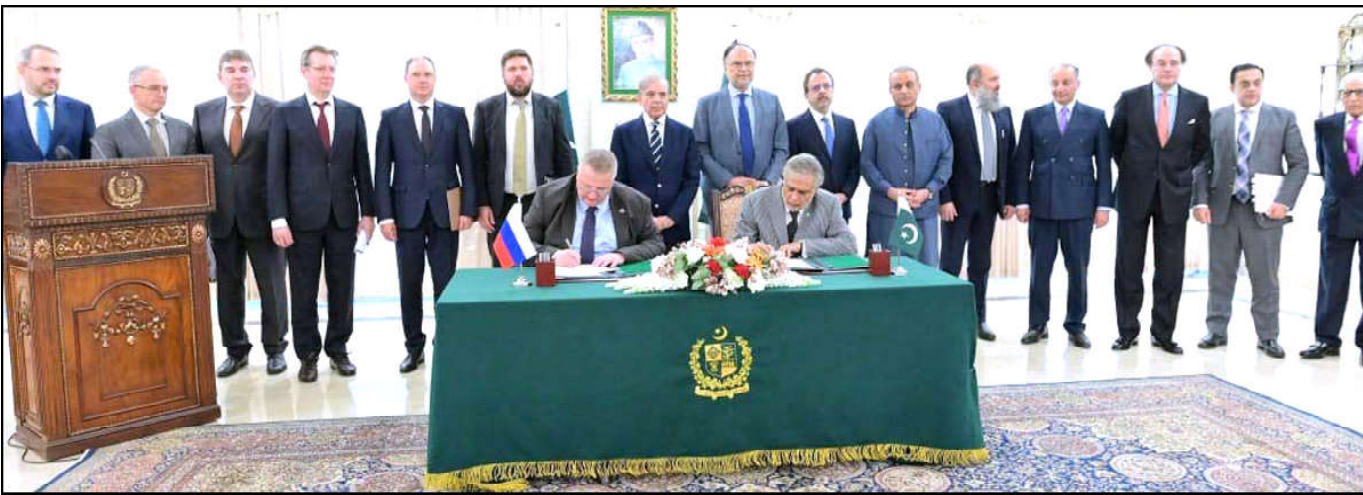
ISLAMABAD: Prime Minister Muhammad Shehbaz Sharif and Deputy Prime Minister of Russian Federation witness signing of a Memorandum of Understanding between Pakistan and Russia to increase cooperation in different fields.