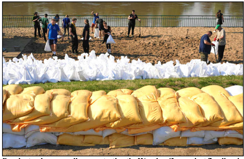
People stand near sandbags protecting the Wroclaw Zoo against flooding, in Wroclaw, Poland.