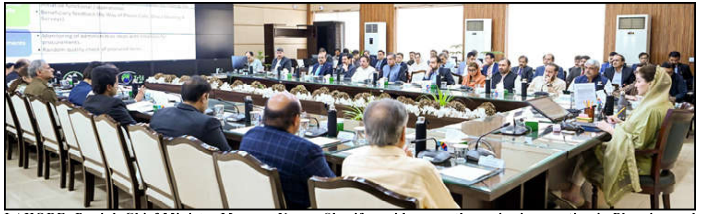
LAHORE: Punjab Chief Minister Maryam Nawaz Sharif presides over the reviewing meeting in Planning and Development Board.

RAWALPINDI (APP): Anti-Narcotics Force (ANF) while conducting a raid in Karachi foiled an attempt to smuggle drugs and weapons and recovered 1200 grams charras, seven pistols and ammunition, said an ANF Headquarters spokesman here on Thursday. He informed that ANF conducted a raid at a courier office near Nursery Stop in Karachi and recovered 1200 grams hashish and weapons, concealed in electronic goods sent from Peshawar. The recovered weapons included five 9 mm pistols, two 30 bore pistols and 17 magazines with 55 rounds.