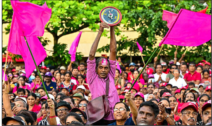
A supporter of National People's Power (NPP) presidential candidate Anura Kumara Dissanayake, holds the party symbol during a rally ahead of the upcoming presidential elections in Colombo.