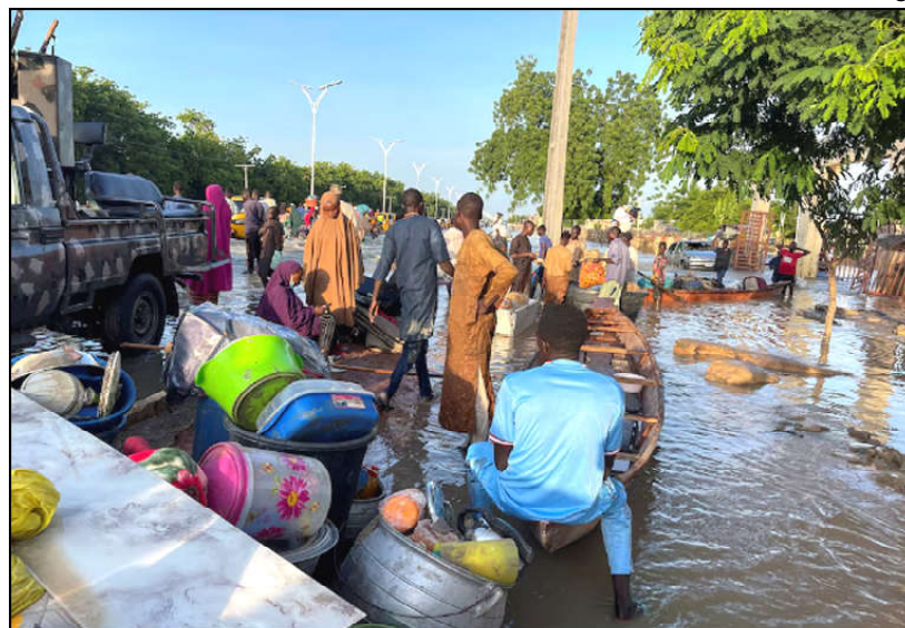
Flood victims stand beside their belongings offloaded from the canoe that helped them to move to safety in Maiduguri, Nigeria.

Monitoring Desk ISTANBUL: Turkey on Thursday accused Israel of seeking to expand the war in Gaza to Lebanon with the "alarming" wave of deadly explosions that swept through Hezbollah strongholds. "The escalation in the region is alarming," Foreign Minister Hakan Fidan said on state-run TRT television. "We see Israel mounting its attacks towards Lebanon step by step." The blasts have killed 32 people in two days, including two children, wounding more than 3,000 others, according to Lebanese health ministry figures. Israel has not commented on the unprecedented operation in which Hezbollah operatives' walkie-talkies and pagers exploded in supermarkets, at funerals and on streets. But its defence minister Yoav Gallant, referring to Israel's border with Lebanon, said Wednesday: "The centre of gravity is moving northward." "Turkey blamed Israel for the blasts. 'We have come to a point where these operations carried out by Israel have become increasingly provocative, and in return, Iran, Hezbollah and elements close to them have no choice but respond,'" Fidan said.