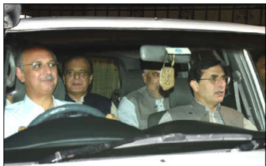
ISLAMABAD: PTI delegation arriving for meeting with JUI(F) chief Mulana Fazulrehman at his residence, in the Federal Capital.

The prime minister also stressed Pakistan's preparedness for the phase-down of hydrofluorocarbons (HFCs) under the Kigali Amendment.