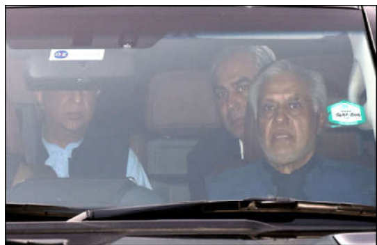
ISLAMABAD: Deputy Prime Minister Ishaq Dar, Interior Minister Mohsin Naqvi leaving Mulana Fazulrehman residence after the meeting with JUI(F) chief Mulana Fazul Rehman

The Chief Minister said that joint stance on the national and regional interests reflects the sustainable democratic thinking.