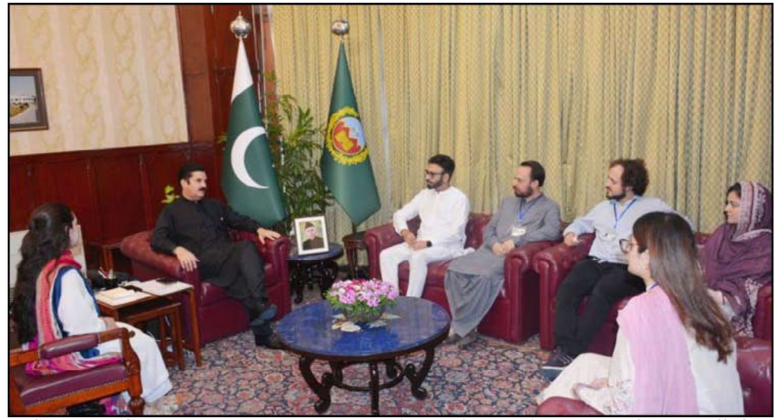
PESHAWAR: Governor Khyber Pakhtunkhwa Faisal Karim Kundi called on by faculty staff of the department of Arts & Design of Iqra National University Peshawar at Governor House.

After the decrease in inflation, the 4% reduction in the interest rate is a testament to Prime Minister Shehbaz Sharif's hard work, honesty, and sound economic policies. She further added that the PML-N had promised to bring inflation to single digits in the first year, a goal they achieved in just six months.