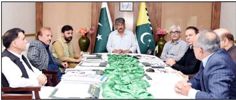
MIRPUR: Prime Minister AJK Chaudhry Anwarul Haq presiding over a meeting regarding AJK University