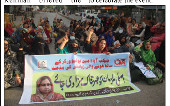
KARACHI: Lady Health Workers protesting in favour of their demands in the Provincial Capital.

Addressing a briefing at DC Office here on Sunday, she said that Eid Milad was a prestigious occasion and the Punjab government had chalked out a comprehensive strategy to facilitate the faithful at maximum extent to celebrate the event.