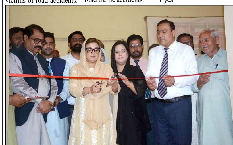
FAISALABAD: Punjab Information and Culture Minister Ms. Uzma Bukhari inaugurates the Islamic calligraphy exhibition for Rabi' Al-Awwal at the Arts Council.

According to the data, 1,185 motorbikes, 66 auto-rickshaws, 119 motorcars, 23 vans, nine passenger buses, 27 trucks and 111 other types of vehicles and slow-moving carts were involved in the road traffic accidents.