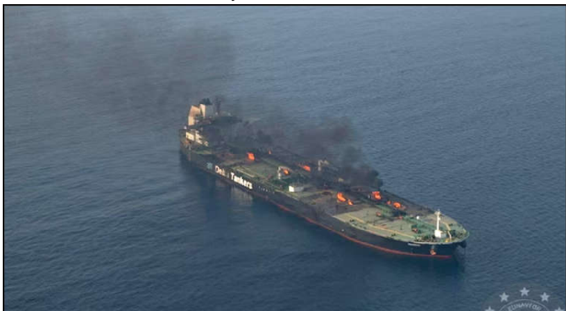
Flames and smoke rise from the Greek-flagged oil tanker Sounion, which has been on fire after an attack by Houthi militants, on the Red Sea.

"Turning the duty to protect Italy's borders from illegal immigration into a crime is a very serious precedent. My full solidarity," she added. Meloni, who rose to power in 2022, has vowed to clamp down on unauthorised arrivals from North Africa with harsher immigration laws, restrictions on sea rescue charities and plans to build migrant reception camps in Albania. At the same time, she has opened the door to hundreds of thousands of migrants to work in Italy legally in tough labour gaps in the country and stopped migrant smugglers.