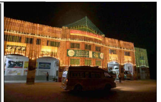
SARGODHA: A beautifully decorated Rescue 1122 building in celebration of 12th Rabi-ul-Awal.

In his address, the IGP said that over 1,500 departmental promotions across various cadres and ranks will take place this year.