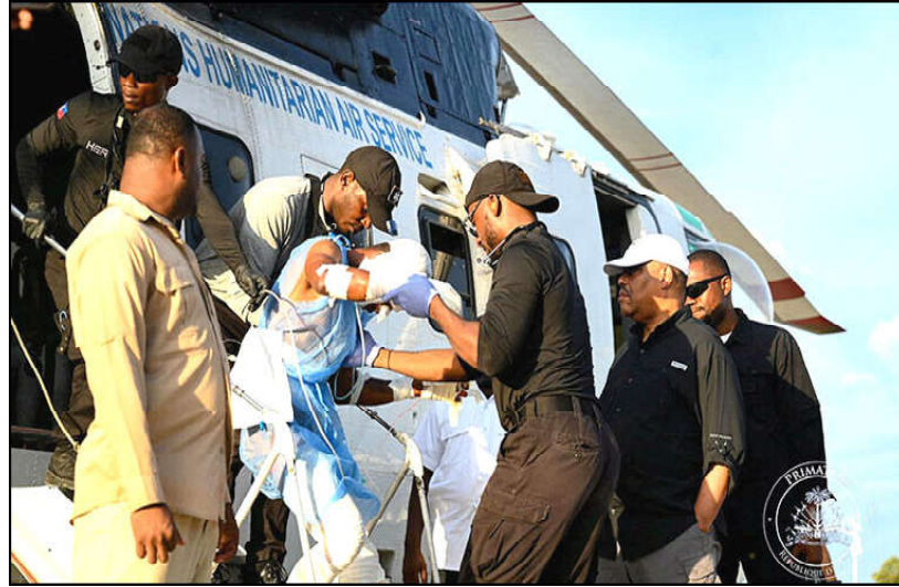
Haiti Prime Minister Garry Conille looks on, as an injured victim who was evacuated to receive medical care following a fuel truck explosion exits a helicopter, in Port-au-Prince, Haiti.

Ukraine's Yermak, in turn, said of Russian President Vladimir Putin: "Loud threats of Putin's regime testify only to his fear that terror may come to an end."