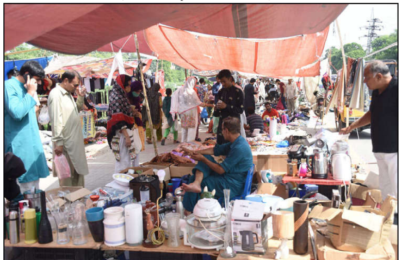
LAHORE: Citizens busy in shopping at Shadman Sunday market in the Provincial Capital.