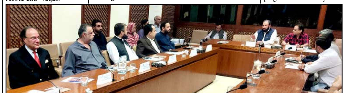
Senator Hidayatullah Khan, presiding over a meeting of the Senate Standing Committee on Narcotics Control after being elected as Chairman of the Committee at Parliament House Islamabad.

Pakistan stood third in the year 2023 for conducting 7,836 space events in the country during the festive week which is an honour for the country.