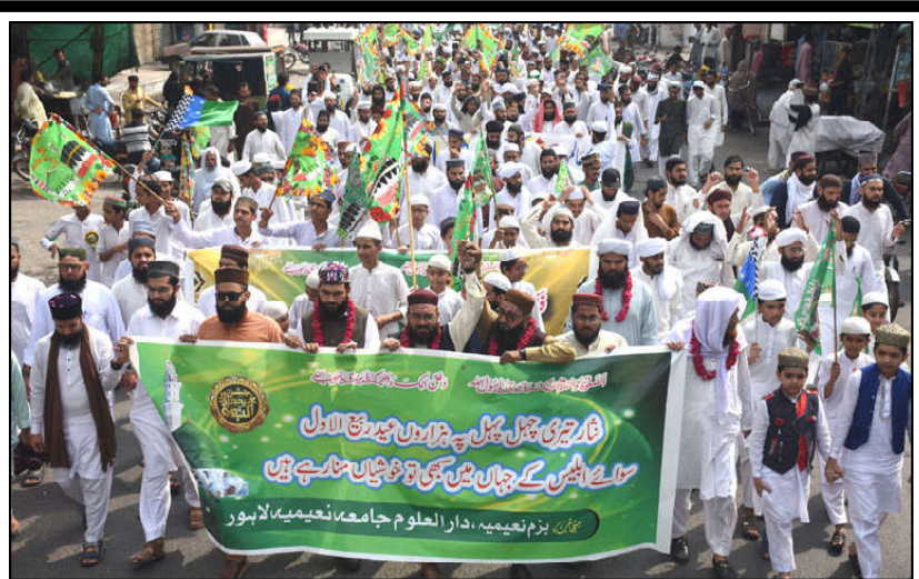
LAHORE: Participants of the Eid Milad-ul-Nabi rally passing through Queen Mary Road.