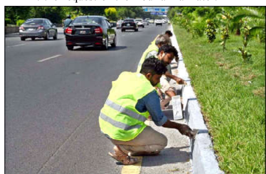
ISLAMABAD: Workers busy repairing cemented blocks at center path of Islamabad Highway.

The QAU Alumni remains committed to contributing positively and constructively towards the betterment of our alma mater.