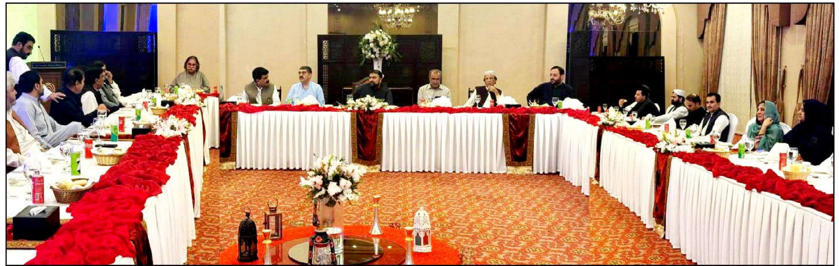
ISLAMABAD: MNAs, MPAs and Senators belong to Balochistan attending a dinner hosted by Chief Minister Balochistan Mir Sarfraz Ahmed Bugti

Ahsan Iqbal said China has also shown willingness for the second phase of CPEC. He said China has given assurance for the establishment of five new corridors including that of growth, livelihood, innovation, green economy and open regional inclusive development.