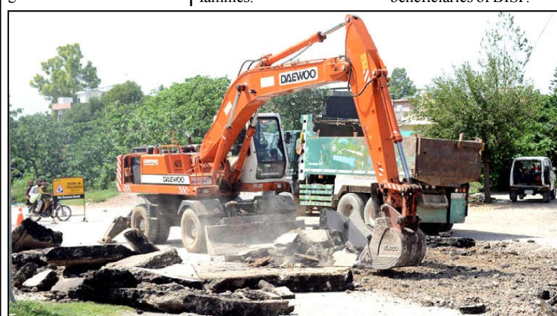
ISLAMABAD: Work in progress of reconstruction of road.

These meetings focused on resolving the challenges hindering the issuance of birth certificates and B-forms to the registered beneficiaries of BISP.