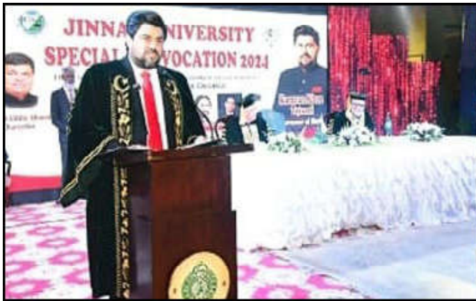
KARACHI: Governor Sindh Kamran Khan Tessori addressing Special Convocation 2024 of Jinnah University at Governor House