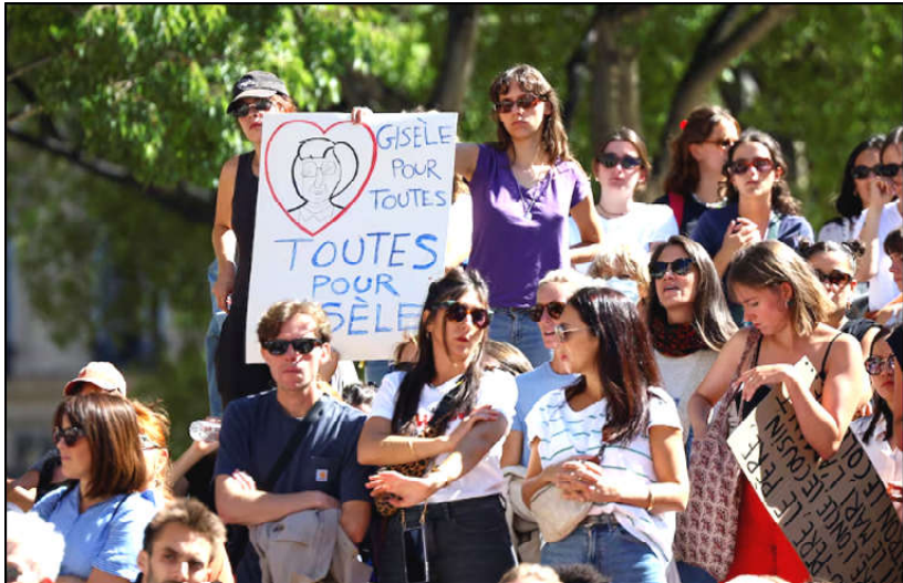
People gather next to a placard that reads: "Gisele for all women, all women for Gisele", during a demonstration in support of Gisele Pelicot, who was allegedly drugged and raped by men solicited by her husband Dominique Pelicot, and of all rape victims, as the trial continues, near the courthouse in Marseille, France.