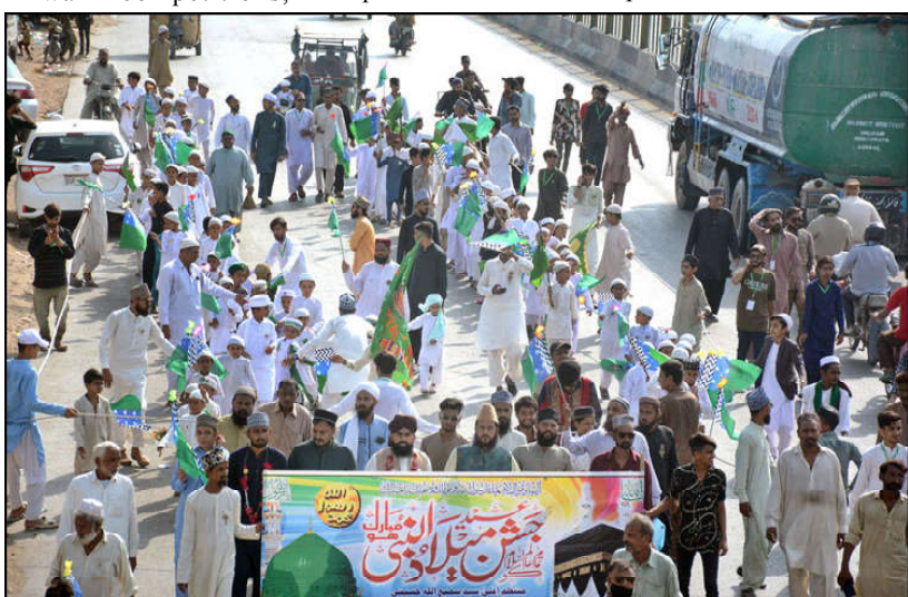
KARACHI: Madrassa students participate in a Jashn-e-Eid Milad ul Nabi rally organized by Jamaat Ahle Sunnat and Madrassa Darul Uloom Qasmia Rahmania at Lines Area.