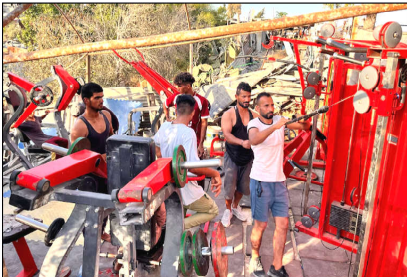
Palestinians exercise in an outdoor gym which was reopened after the owner recovered equipment from under the rubble, amid the Israel-Hamas conflict, in Khan Younis, in the southern Gaza Strip.

Monitoring Desk SYDNEY: Australia will strip military awards from a group of war veterans over allegations those under their command committed war crimes in Afghanistan, Defence Minister Richard Marles said on Thursday. A four-year inquiry chaired by Major General Paul Brereton concluded in 2020 there was credible information of the alleged unlawful killing of 39 people by or involving 25 Australian Defence Force members, as part of a culture of forcing junior recruits to kill defenceless captives to "blood" them for combat.