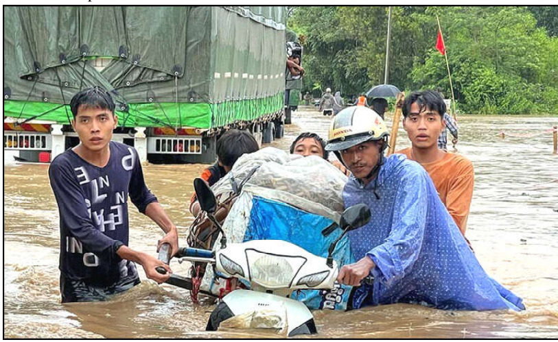
People wade through flood waters in Thagaya in Myanmar's Bago region.

Guterres summed up the past year as "very tough, very difficult." It has been dominated by the war in Gaza, which began just two weeks after leaders left New York following last year's assembly when Palestinian Hamas militants killed 1,200 people and took about 250 hostages in a cross-border rampage into Israel, according to Israeli tallies. Describing Israel's retaliation against Hamas in Gaza — where local health officials say some 41,000 Palestinians have been killed since the war began — Guterres said there have been "very dramatic violations of the international humanitarian law and the total absence of an effective protection of civilians."