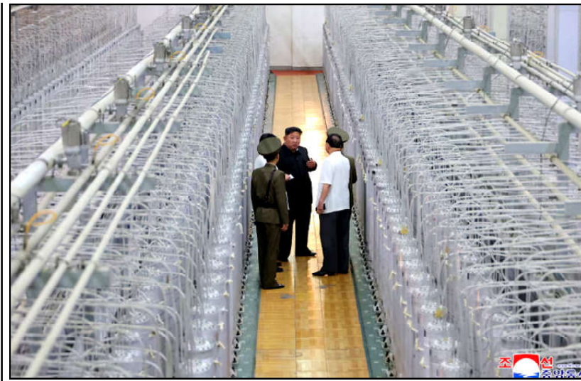
North Korean leader Kim Jong Un tours facilities during a visit to the Nuclear Weapons Institute and the production base of weapon-grade nuclear materials at an undisclosed location in North Korea.

a new type of centrifuge. Kim said North Korea needs greater defense and preemptive attack capabilities because "anti-(North Korea) nuclear threats perpetrated by the U.S. imperialists-led vassal forces have become more undisguised and crossed the red line," KCNA said. South Korea's Unification Ministry strongly condemned North Korea's push to boost its nuclear capability. A ministry statement said North Korea's "illegal" pursuit of nuclear weapons in defiance of U.N. prohibitions is a serious threat to international peace. It said North Korea must realize it cannot win anything with its nuclear program. North Korea first showed a uranium enrichment site in Yongbyon to the outside world in November 2010, when it allowed a visiting delegation of Stanford University scholars led by nuclear physicist Siegfried Hecker to tour its centrifuges.