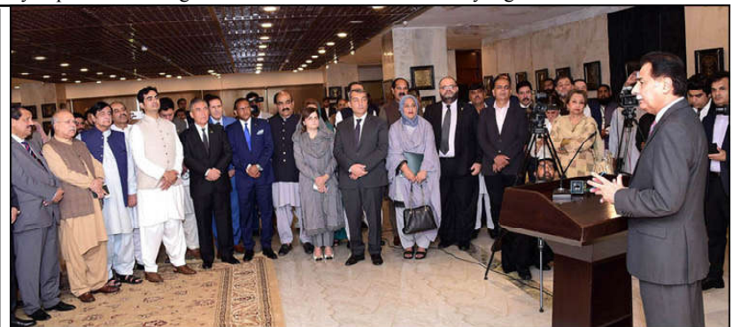
ISLAMABAD: Speaker National Assembly Sardar Ayaz Sadiq addressing the inauguration ceremony of the Calligraphy Exhibition in connection to celebrate the Eid Milad-un-Nabi (SAW) at Parliament House.