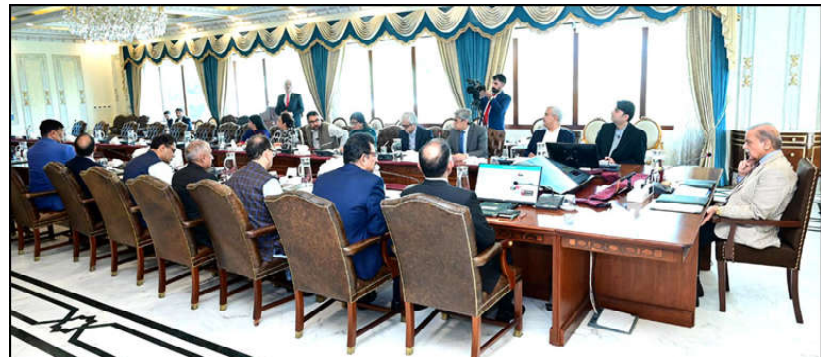
ISLAMABAD: Prime Minister Muhammad Shehbaz Sharif chairs a review meeting regarding Monkey Pox.