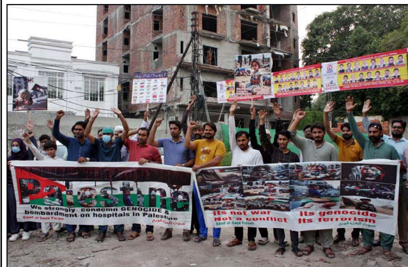
LAHORE: Members of Sawt-ul-Gaza Forum are holding protest demonstration against Israeli cruel and inhumane acts and express unity with the innocent people of Palestine, at Lahore press club.