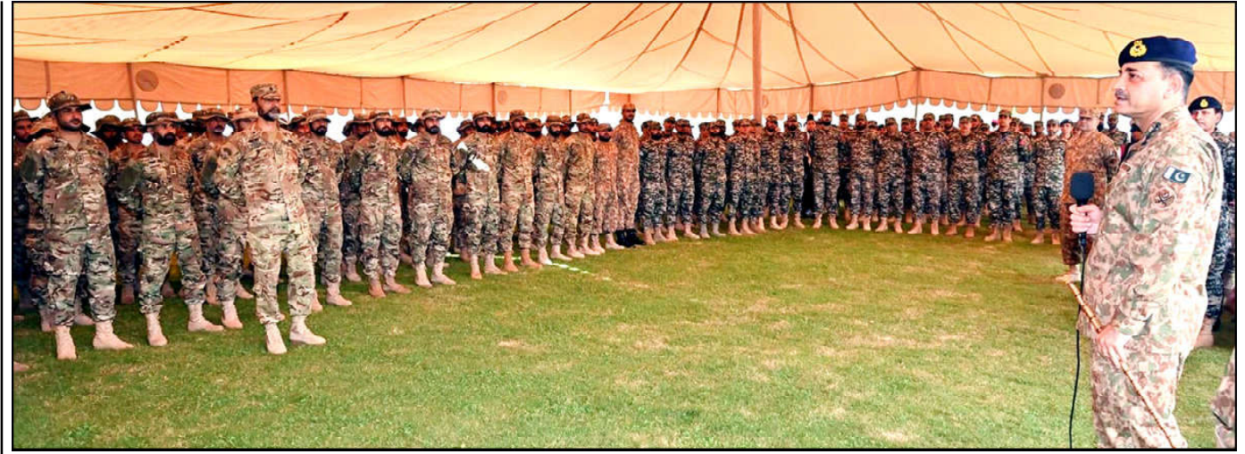
RAWALPINDI: Chief of the Army Staff General Syed Asim Munir interacting with the troops, who had participated in the recently conducted counter-terrorism actions in Tirah Valley and surroundings, in Orakzai District.

Earlier upon his arrival, the COAS laid the wreath at the Yadgar-e-Shuhada and was received by the Corps Commander Peshawar.