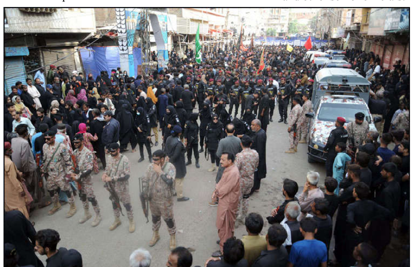
HYDERABAD: Shiite Muslims attend the Last Procession (Chup Tazia) at Qadam Gah Mola Ali (R.A.), while a large number of security officials escort the procession.

RAWALPINDI (APP): Anti-Narcotics Force (ANF) while conducting 10 operations across the country managed to recover 419 kg drugs worth Rs 190 million and arrested 10 accused including two Afghan nationals and two women, said an ANF Headquarters spokesman here on Friday. He informed that 70 grams ice was recovered from two suspects going on a motorcycle near a university on Laltrar Road Islamabad. 2.4 kg hashish was recovered from a vehicle intercepted near Wapda Town Peshawar and an accused was arrested. 50 grams heroin and 16 grams ice were recovered.