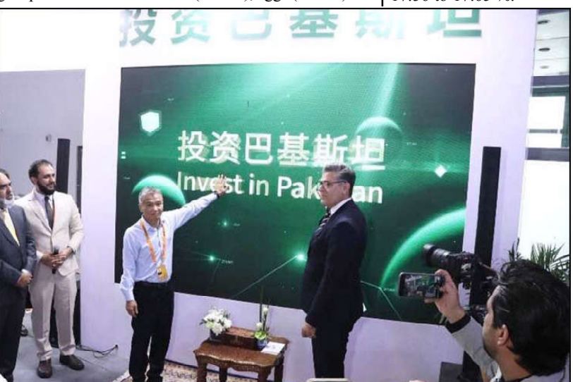
BEIJING: The Pakistan Pavilion at the prestigious China International Fair for Trade in Services (CIFTIS) 2024 was inaugurated by Pakistan's Ambassador to China, Khalil Hashmi accompanied by Zhang Yanqing, Deputy Secretary-General of the People's Government of Pingdingshan City.

ISLAMABAD (APP): The weekly inflation, measured by the Sensitive Price Indicator (SPI), witnessed a nominal increase of 0.01 percent for the combined consumption groups during the week ended on September 12, the Pakistan Bureau of Statistics (PBS) reported on Friday. According to the PBS data, the SPI for the week under review in the above-mentioned group was recorded at 319.28 points as compared to 319.24 points during the past week. As compared to the corresponding week of last year, the SPI for the combined consumption group in the week under review witnessed an increase of 14.36 per cent. The weekly SPI with the base year 2015-16 =100 covers 17 urban centres and 51 essential items for all expenditure groups. Likewise, SPI for the lowest consumption group of up to Rs 17,732 witnessed increase of 0.58 per cent and went up to 312.14 points from last week's 310.35 points. The SPI for consumption groups of Rs 17,732 to 22,888 and Rs 22,889-29,517 increased by 0.69 percent and 0.05 percent whereas for consumption groups from Rs 29,518-44,175 and above Rs 44,175, it decreased by 0.12 percent and 0.30 percent respectively. During the week, out of 51 items, prices of 15 (29.41%) items increased, 14 (27.45%) items decreased and 22 (43.14%) items remained stable. The items, which recorded major decrease in their average prices on a week-on-week basis included bananas (6.04%), pulse mash (1.33%), wheat flour (0.97%), LPG (0.96%), eggs (0.91%).