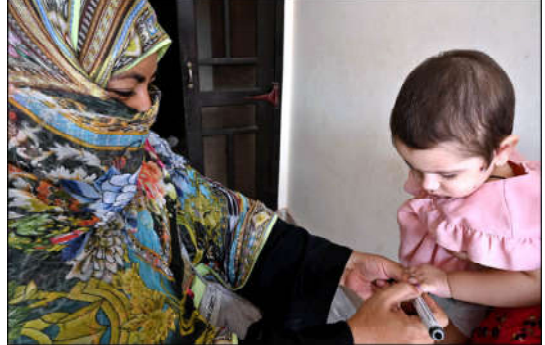
ISLAMABAD: A health worker administers a polio vaccine drop to a baby girl during the door-to-door campaign of the Pakistan Polio Eradication Program in the federal capital.

ISLAMABAD (APP): Federal Minister for Housing and Works, Mian Riaz Hussain Pirzada, informed the National Assembly on Friday that the Green One, Green Two, and Sky Garden housing projects are progressing well and are expected to be completed by December 2025. During the question hour, he invited assembly members to visit the project sites, assuring them that arrangements could be made for them to accompany ministry officials during such visits. Addressing another query, the minister clarified that no final decision has been made regarding the future of Pakistan Public Works Department (PWD) employees. He assured the assembly that these employees remain government servants and that their jobs are not at risk. There will be no unjust treatment towards them. He also mentioned that a legislative amendment is being prepared to address any changes concerning the PWD. He said that no definitive decision will be made until the bill is presented and approved in the Assembly.