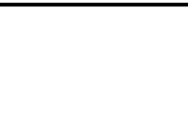
ISLAMABAD: A view of heavy shipping containers removing from D-chowk with the help of heavy machinery, in the Federal Capital.