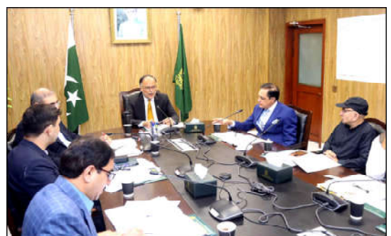
ISLAMABAD: Federal Minister for Planning, Development, and Special Initiatives, Ahsan Iqbal, presides over a review meeting on the progress of the Diamer Basha Dam project.

The Planning Minister said that during the tenure of the previous government, the cost of the project was estimated at Rs600 billion and even Rs750 billion in various meetings of the standing committees, while on paper, an estimate of Rs480 billion was being shown till date.