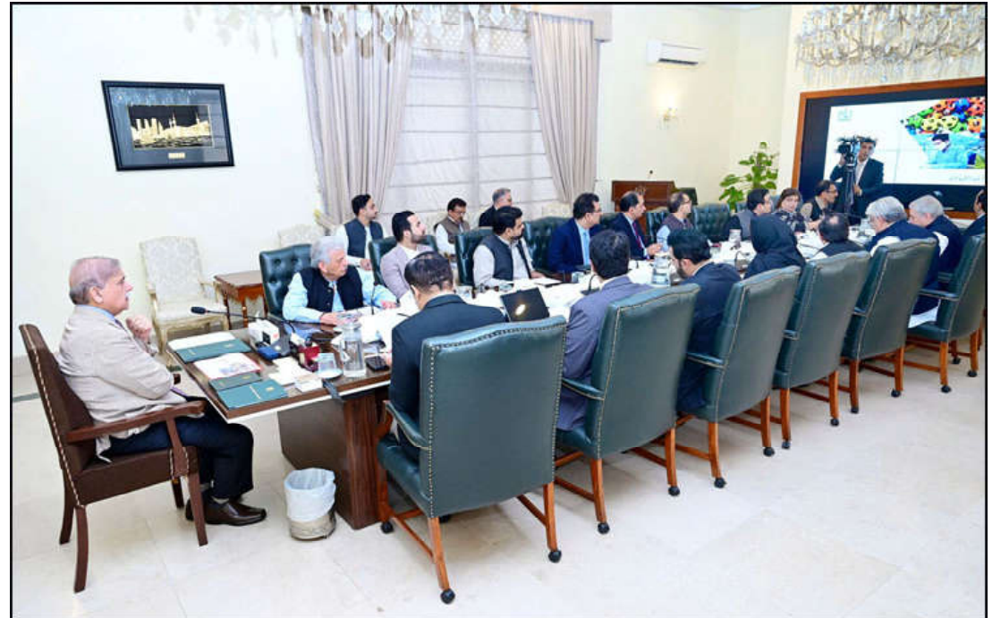
ISLAMABAD: Prime Minister Muhammad Shehbaz Sharif chairs the first session of the steering committee of Small and Medium Enterprises Development Authority (SMEDA).