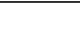
ISLAMABAD: A view of heavy shipping containers removing from D-chowk with the help of heavy machinery, in the Federal Capital.