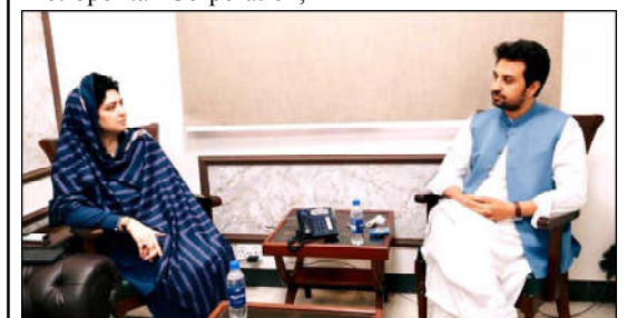
QUETTA: Provincial Minister for Education Raheela Hameed Khan Durrani meeting with Provincial Finance Minister Mir Shoaib Nausherwani