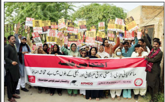
FAISALABAD: Activists of Pakistan Labour Faqani Movement hold a banner during protest rally in favor of their demands, in the city.

ISLAMABAD (APP): The 100-Index of the Pakistan Stock Exchange (PSX) continued with bullish trend on Friday, gaining 315.44 more points, a positive change of 0.40 percent, closing at 79,333.06 points against 79,017.62 points on the last working day. A total of 916,053,875 shares were traded during the day as compared to 584,276,012 shares the previous day, whereas the price of shares stood at Rs 21.236 billion against Rs 16.364 billion on the last trading day. As many as 438 companies transacted their shares in the stock market, 184 of them recorded gains and 211 sustained losses, whereas the share price of 43 companies remained unchanged. The top three trading companies were WoldCall Telecom with 87,808,556 shares at Rs 1.38 per share, Pervez Ahmed Company with 75,919,967 shares at Rs 2.03 per share and Kohinoor Spinning with 63,753,533 shares at Rs 8.41 per share. Unilever Pakistan Foods Limited witnessed a maximum increase of Rs 102.50 per share price, closing at Rs 17,542.50, whereas the runner-up was Ismail Industries Limited with a Rs 93.97 rise in its per share price to Rs 1,700.00. Hoechst Pakistan Limited witnessed a maximum decrease of Rs 49.00 per share closing at Rs 1,951.00.