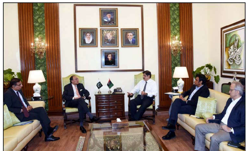
KARACHI: Sindh Chief Minister, Syed Murad Ali Shah exchanging views with Muhammad Aurangzeb, Federal Minister for Finance and Revenue during meeting held at CM House in Karachi.