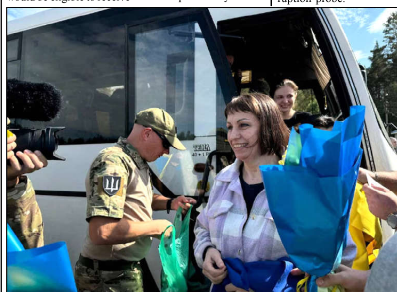
Ukrainian prisoners of war (POWs) are seen after a swap, amid Russia's attack on Ukraine, at an unknown location in Ukraine, in this handout picture released.

Monitoring Desk ATHENS: A Greek appeals court on Friday reduced the prison sentences of 11 men involved in trafficking 1.2 metric tons of cocaine from the Caribbean into Europe and Africa, in one of the biggest drug busts in Greece's history. Greek police said in 2020 it had dismantled the criminal group after a months-long investigation with assistance from the United States' Drug Enforcement Administration (DEA) and the Albanian and Spanish police. A court in 2021 had handed the defendants, nationals of Albania, the Netherlands and Greece, multi-year sentences including life imprisonment.