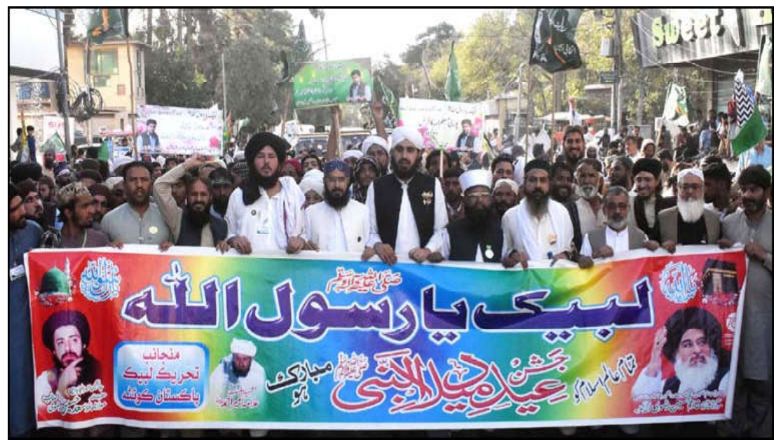
QUETTA: Activists of Tehreek-e-Labbaik (TLB) are holding Jashan-e-Eid Milad-un-Nabi (SAW) rally in connection of 12th Rabi-ul-Awwal coming ahead, at Mannan Chowk in Quetta.