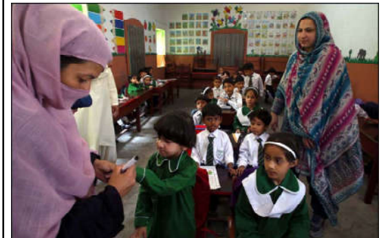
PESHAWAR: A health worker administers polio-vaccine drops to a child during anti-polio immunization campaign, at a School in Peshawar.