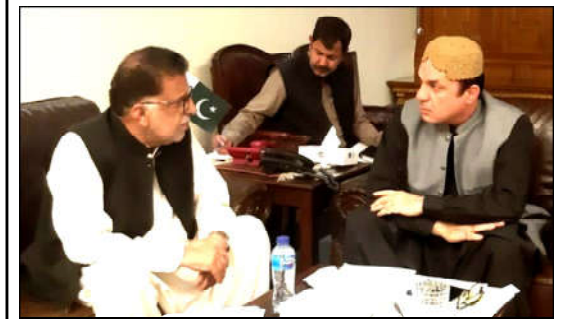
QUETTA: Provincial Minister for Irrigation Mir Muhammad Sadiq Umrani meeting with Speaker Balochistan Assembly Captain (retd) Abdul Khaliq Achakzai

"The European Union is keen to enhance both bilateral and multilateral cooperation with Pakistan," he added.