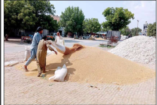
BAHAWALPUR: Laborers gather wheat to sell on the roadside at Galla Mandi Bahawalpur.

ISLAMABAD (APP): Minister of State for Finance, Revenue, and Power Ali Pervaiz Malik said on Sunday that the government chalked out economic reforms to seek long-term stability in the country. Talking to a private news channel, he said that the Pakistan Muslim League Nawaz (PML-N) government worked hard to resolve economic problems. Through the positive and consistent economic policies, the inflation was brought down from 40 percent to a single digit, he added. Today, all the economic indicators were on a positive trajectory, as Fitch and Moody's were also given positive ratings to the economy of the country, he added. Ali Pervaiz said that the government is going to finalize a deal with the International Monetary Fund (IMF) very soon.