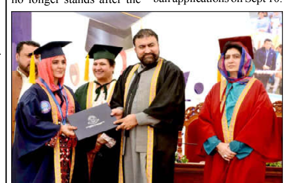
QUETTA: Balochistan Chief Minister Mir Sarfraz Ahmed Bugti and Education Minister Raheela Hameed Khan Durrani distributing certificates to girls during the 1st Convocation 2024 at Govt Girls Post Graduate College Quetta.

restoration of NAB amendments, as the crime is invalid under the current law. The NAB prosecutor stated that following the restoration of amendments, the case is no longer within NAB's jurisdiction. The accountability court judge, Muhammad Ali Warraich, took a three-hour break before announcing the decision to transfer the new Toshakhana reference to a Special Central Court. The court also ruled that the relevant court will hear bail applications on Sept 10.