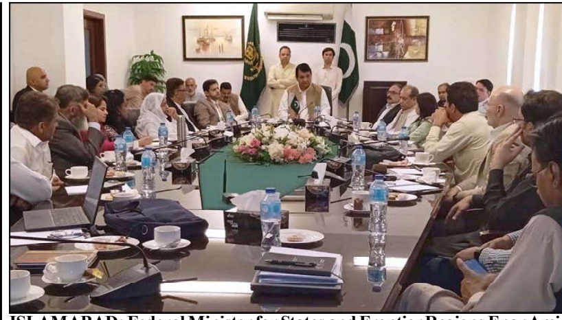
ISLAMABAD: Federal Minister for States and Frontier Regions Engr Amir Muqam chairs a meeting of representatives of different NGOs.

accused and said that there should be no exception for those who do not follow the constitution of the country. "Even the enemies of the country cannot do what happened on May 9 and how the military installations were targeted", he said. Earlier, the Governor KP visited the exhibition and praised the work of artists and crafters for showcasing their live skills for the visitors and general public. The exhibition included stalls of unique types of embroidery, block printing, truck art, hand printing, knitting, fancy products, weaving, pottery, khaadi work and other arts and crafts. Faisal Karim Kundi praised the skills of the artists, saying that besides showcasing talent from different parts of Pakistan, this exhibition is also promoting soft image of the country.