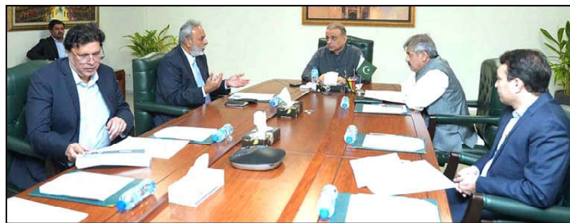
ISLAMABAD: Federal Minister for Communications, Privatization & Board of Investment Abdul Aleem Khan presides over high level meeting on NHA.