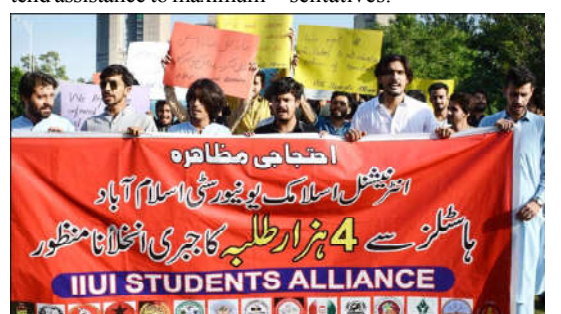
ISLAMABAD: Students of International Islamic University protesting outside NPC against eviction from hostel and administrative incompetence.