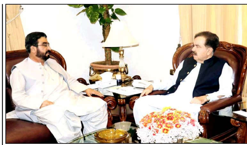
QUETTA: Provincial Minister Mir Asim Kurd Gallo meeting with Governor Balochistan Sheikh Jaffar Khan Mandokhail

GWADAR: On the special instructions of Commissioner Makran Dawood Khan Khilji and under the directives of Deputy Commissioner Hamoodur Rehman, Additional Deputy Commissioner (Revenue) Sarbuland Khan inspected two major development projects in Gwadar.