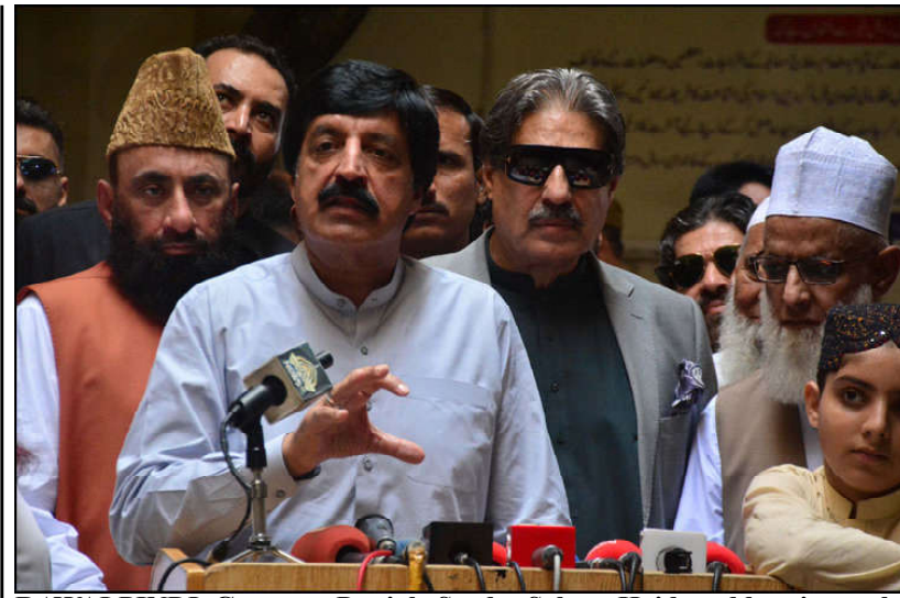
RAWALPINDI: Governor Punjab, Sardar Saleem Haider addressing to the media at Madrasa Tahleem ul Qur'an Raja Bazar.

Salim reiterated his commitment to serving the people. Responding to a question, he said that the doors of Governor House are open for CM KPK. "I will ask Ali Amin Gandapur to refrain from spreading unrest", he said adding that politics couldn't be run by aggressive slogans. "Politics can't be run by raising Mola Jutt slogans", he said and asked the KPK CM to avoid irresponsible behavior. The governor condemned Gandapur's statement regarding journalists saying it an 'irresponsible' statement.