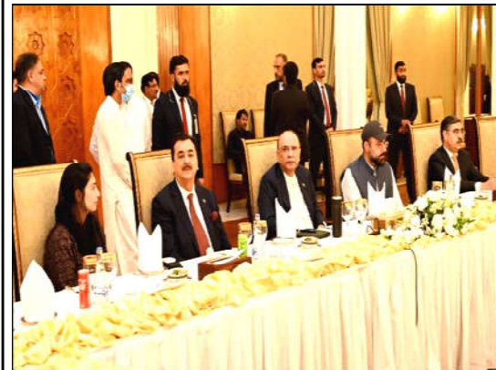
ISLAMABAD: President Asif Ali Zardari attending a dinner held in honour of Parliamentarians belonging to different political parties at President House.