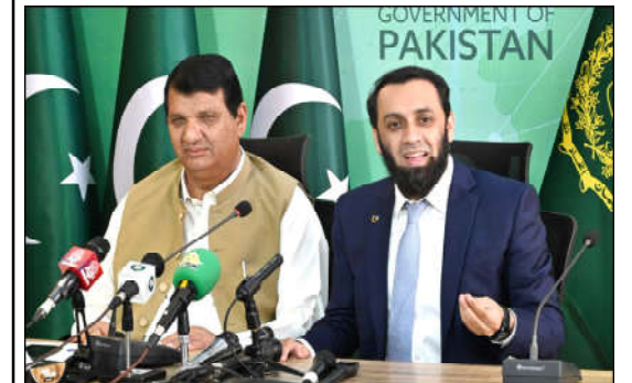
Chief Minister Maryam Nawaz's abusive outburst against woman political opponents and journalists at the Sangiani public rally clearly showed his misdeed and sheer disregard for centuries-old Pashtoon norms and culture.

ISLAMABAD (APP): Federal Minister for Information, Broadcasting, National Heritage and Culture Attaullah Tarar on Monday said Khyber Pakhtunkhwa Chief Minister