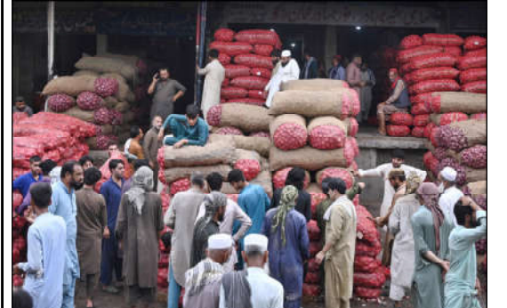
ISLAMABAD: Dealers and wholesalers engage in negotiations over onion sack sales at the Fruits and Vegetables market.