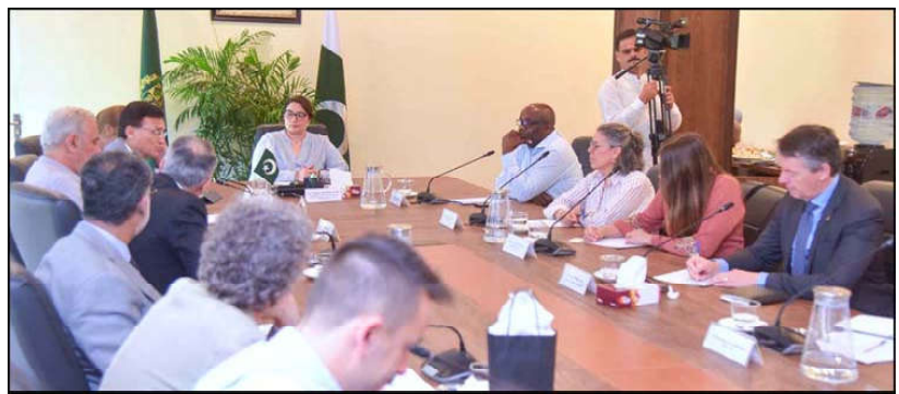
ISLAMABAD: Coordinator to Prime Minister on Climate Change, Romina Khurshid Alam chairs a high-level meeting regarding 'Recharge Pakistan Programme' at the M/o Climate Change & Environmental Coordination.

The DG highlighted the project's focus on integrating nutrition into social protection, such as the provision of iron-folic acid supplements, and the importance of cross-sectoral collaboration in health, education, and social protection for its successful implementation. The SOPRAN project, spanning seven districts including Faisalabad, Swat, Shaheed Benazirabad, Quetta, Kotli, Skardu, and Islamabad aims to provide comprehensive nutrition education, access to fortified foods, and community-driven behavior change initiatives.