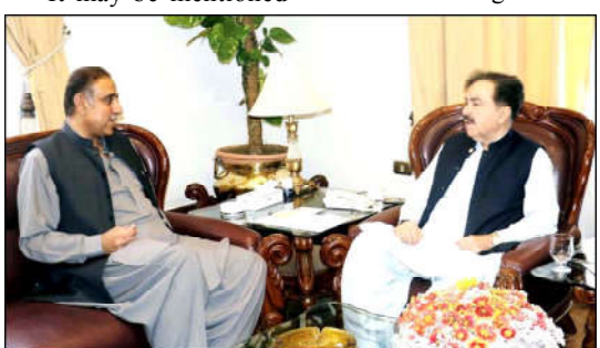
QUETTA: Provincial Minister Mir Saleem Ahmed Khosa meeting with Governor Balochistan Sheikh Jaffar Khan Mandokhail