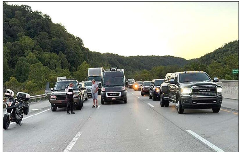
Drivers park on the the lanes of the I-75 highway after reports of multiple people shot about nine miles north of London.

Its military claimed Sunday to have captured another small town as it advances towards the key logistics hub of Pokrovsk in the eastern Donetsk region. The defence ministry in Moscow said its troops had "liberated the settlement of Novohrodivka," which lies around 20 kilometres (12 miles) from Pokrovsk.