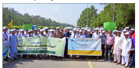
ISLAMABAD: National Commission for Human Development (NCHD) organized a Literacy Day Walk in collaboration with UNESCO in the Federal Capital.

ISLAMABAD (APP): Pakistan Meteorological Department (PMD) has forecast mainly hot and dry weather for most parts of the country during the next 24 hours. However, partly cloudy weather with rain-wind/thunderstorm is likely at isolated places in Gilgit-Baltistan, Potohar region, Kashmir and upper KP. According to the synoptic situation, continental air was prevailing over most parts of the country. A Shallow westerly wave has approached northern/western parts of the country from Monday night.