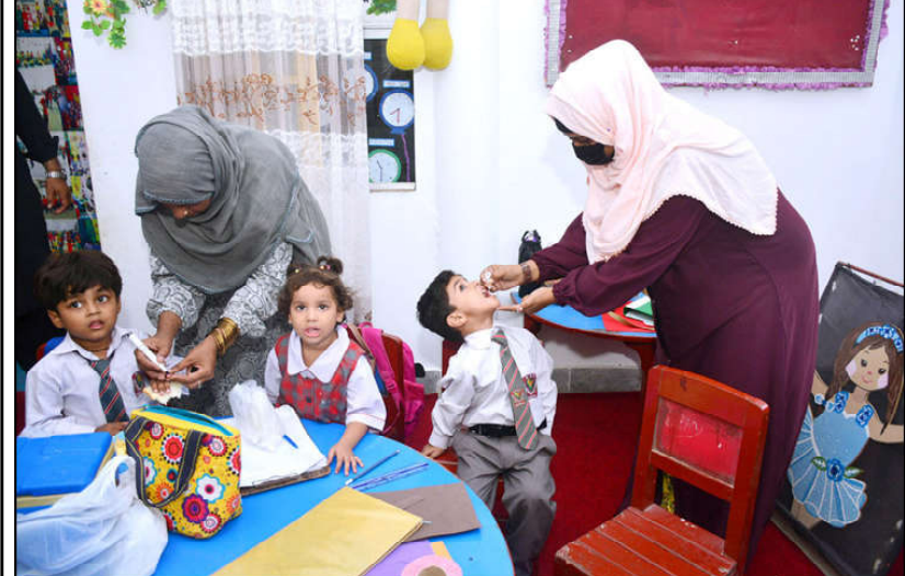
HYDERABAD: Lady Health workers administering polio drops to child student to kicks off nationwide Polio Eradication Programme 2024 at local private school.