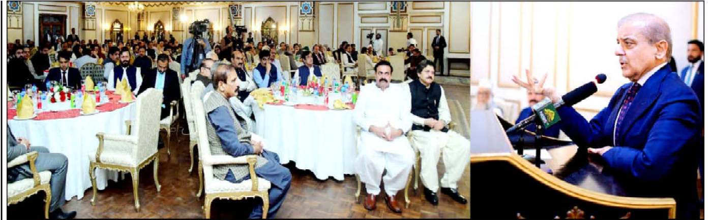
ISLAMABAD: Prime Minister Muhammad Shehbaz Sharif addresses at the dinner hosted in honour of the Parliamentarians of Coalition parties of the government

it was not possible to achieve the goal of the country's development without making the life of the common man easier. As regards the power tariffs, the prime minister said the government was taking measures to provide maximum relief to the low-income segments of the society. He said that the process of right sizing and downsizing in the government offices had been started to reduce the expenditures. The prime minister, while stressing the need for political stability and continuity in policies, said that everybody should have to get together to steer the country out of the economic quagmire.