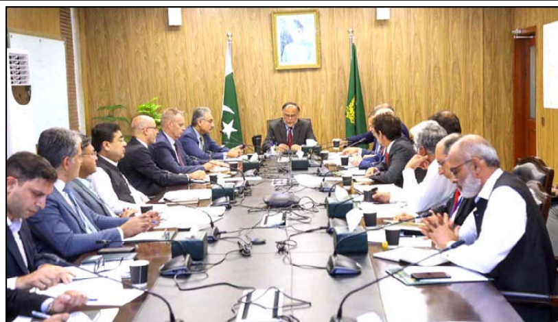
ISLAMABAD: Federal Minister for Planning, Development & Special Initiatives, Ahsan Iqbal, chairing the 4th meeting of the Policy and Strategy Committee (PSC) and the Oversight Board on Post-Flood Reconstruction Activities.

The 4RF outlines four key objectives: enhancing governance and institutional capacity to restore lives and livelihoods, reviving economic opportunities.