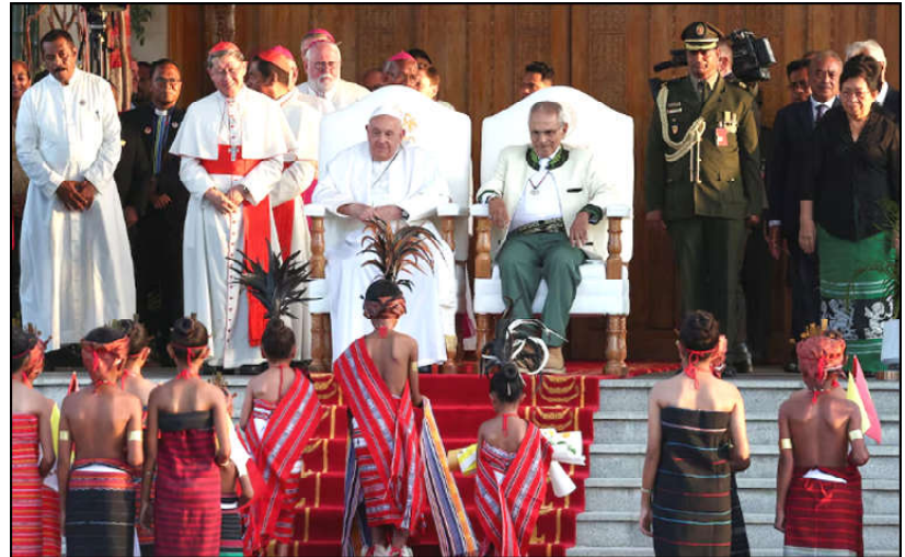
Pope Francis watches as children in traditional attire present gifts, next to East Timor's President Jose Ramos Horta, during a meeting at the Presidential Palace in Dili, East Timor.

According to news reports, many of these embassies continued to resist Taliban rule, operating independently and grappling with a lack of financial support.