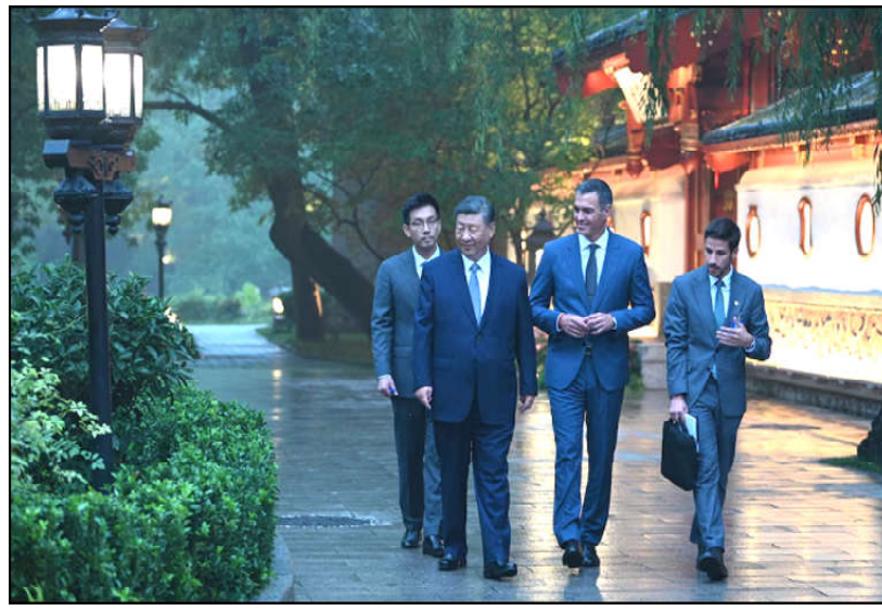
Spain's Prime Minister Pedro Sanchez and China's President Xi Jinping meet at Diaoyutai State Guesthouse in Beijing, China.

But in a promising sign for Spain's pork producers, a separate source with direct access to Xi's meeting with Sanchez said the two leaders had "found harmony and understanding," when asked about possible curbs on China's outbound pork shipments.