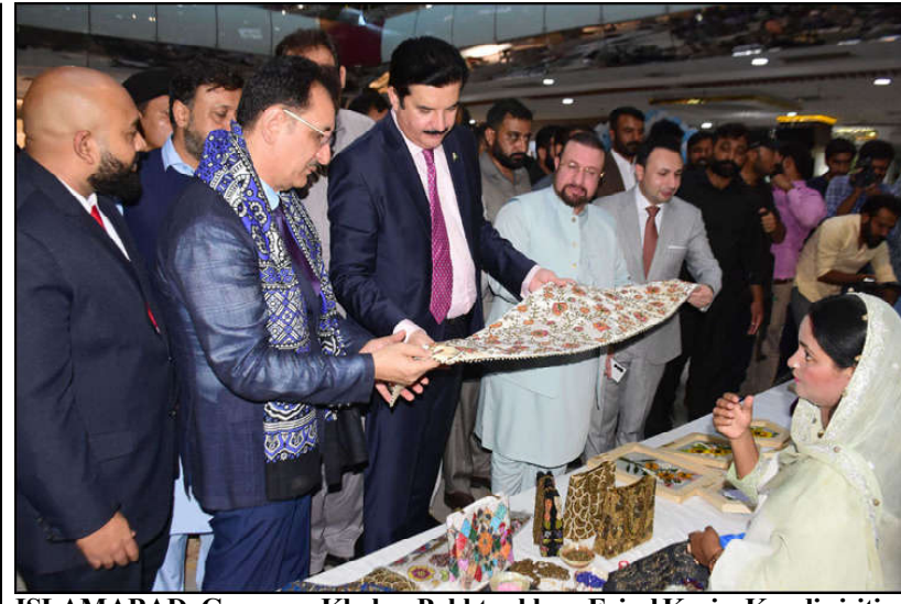
ISLAMABAD: Governor Khyber Pakhtunkhwa Faisal Karim Kundi visiting Artisans at work exhibition in the Federal Capital.

The minister said TDAP has planned nine international exhibitions and two outgoing delegations for Germany for B2B engagements. TDAP regularly conducts the series of webinars and seminars for market awareness.