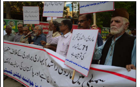
KARACHI: Members of Pakistan Bihar Joint Action Committee are holding protest demonstration for acceptance of their demands, at Karachi press club.