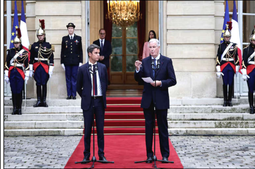
France newly appointed Prime minister Michel Barnier delivers a speech next to outgoing Prime minister Gabriel Attal during the handover ceremony at the Hotel Matignon in Paris, France.