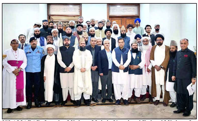
ISLAMABAD: Interior Minister Mohsin Naqvi and Federal Minister for Religious Affairs Chaudhary Salik Hussain in a group photo with a delegation of scholars and religious leaders.

Continued from page 1 The impugned judgment had referred to Article 9 (security of person) but did not even briefly explain how anyone's security was undermined or affected by the Amendments. Reference was also made to Article 14 (inviolability of dignity of man) but there was no explanation forthcoming on how any of the Amendments had affected anyone's dignity.