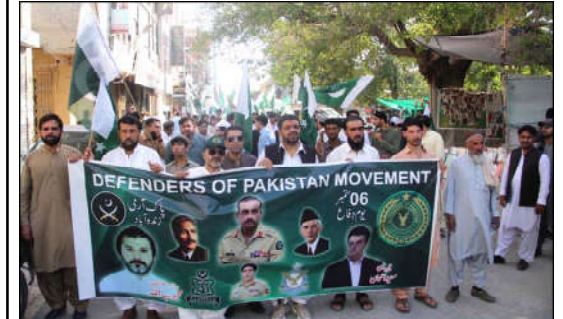
QUETTA: Members of Defenders of Pakistan Movement are holding rally to pay homage to the Ghazis and Shuhada of 06 September 1965 Indo-Pak War on the occasion of Defence Day of Pakistan, at Quetta press club.