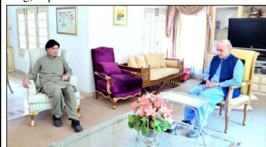
ISLAMABAD: Prime Minister Muhammad Shehbaz Sharif offering condolences to Chaudhary Nisar Ali Khan on the demise of his sister.

Ahsan Iqbal added that the government has set up a policy board to ensure the implementation of the Five Year Plan, and Vision 2030. Key areas such as exports, digital development, environment, energy and equity have been prioritized under this framework.