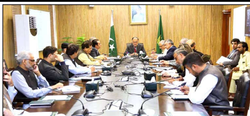
RAWALPINDI: Federal Minister for Planning, Development, and Special Initiatives Ahsan Iqbal chairs the first meeting of the Planning Commission's Policy Board.

He said that if government members didn't turn up in the session next time, then we would pinpoint towards quorum.