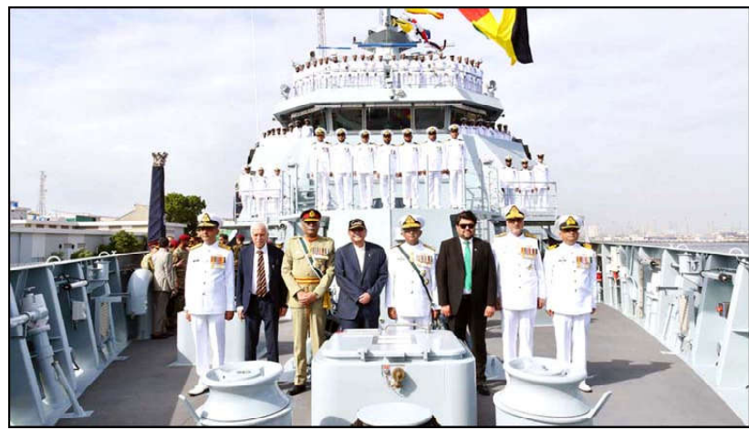
KARACHI: President Asif Ali Zardari in a group photo with senior military officials and crew of Pakistan Navy Ship Hunain during its induction ceremony.

were thwarted by the valiant Armed Forces and were handed an unforgettable defeat, on all fronts. He saluted the families of Shuhada, whose immense resilience and strength continued to inspire the nation. The prime minister emphasized that divisions within the nation posed threat to the country's integrity and any movement in the country aimed at weakening the state will not