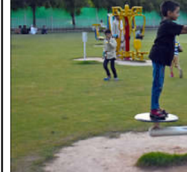
ISLAMABAD: Children enjoy playing during pleasant weather at Sukh Chayn Park, in the Federal Capital.

Moreover, it is meant to introduce the history, culture, and language of Pakistan to various globally renowned universities. After detailed deliberation, the Letter of Cooperation (LOC) was signed on 17 July 2023.