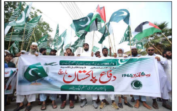
PESHAWAR: Pakistan Markazi Muslim League workers held a rally in connection with Pakistan Defence Day in front of the Press Club.