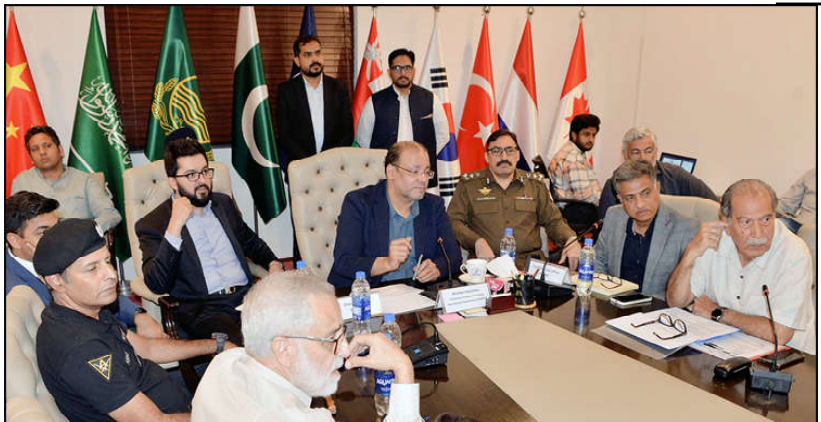
LAHORE: Punjab Minister for Industries and Commerce Chaudhary Shafay Hussain presides over the meeting of Industrialists.