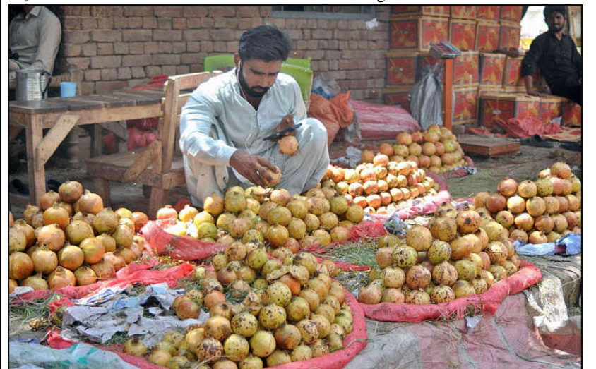
MULTAN: A vendor arranging and displaying seasonal fruit pomegranates to attract the customers at his roadside setup.

the martyrs of September 6, 1965, and noted that the brave soldiers of armed forces, together with the entire nation, crushed the malafide intentions of the enemy and made a history of patriotism, national unity, and courage. The president of Tajir Insaf KP said that September 6 was a historic day for the nation when the armed forces made it clear to the enemy that the Pakistani nation and its armed forces know very well how to protect their freedom and defend the borders of the motherland.