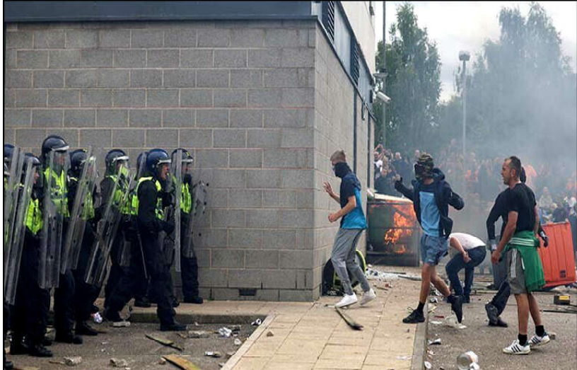
Demonstrators clash with police officers during an anti-immigration protest, in Rotherham.

The pope also visited Istiqlal Mosque, Southeast Asia's largest, and signed a joint declaration with the national grand imam.