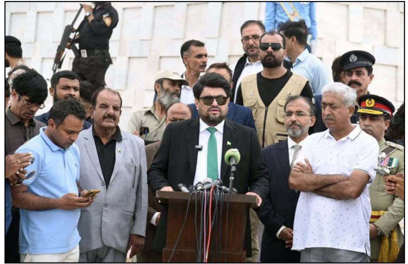
KARACHI: Governor Sindh, Kamran Khan Mustafa, addressing to media at the mausoleum of Quaid-e-Azam Muhammad Ali Jinnah on the occasion of Pakistan Defence Day.

LAHORE (APP): Former prime minister and president of the Pakistan People's Party (PPP) Central Punjab, Raja Pervaiz Ashraf, called for observing the Defence Day as a day of renewed commitment to the nation. In a statement issued on Friday, he highlighted the significance of September 6, when Pakistan's armed forces inflicted major losses on an enemy far superior in size. He praised the enduring bond between the country's military and its people in their collective fight against terrorism and extremism, calling it an unforgettable chapter of national unity. Former premier emphasised that nations, which thrive, never forget their martyrs and heroes, underscoring the importance of honoring those who sacrificed their lives for the country. He reiterated Pakistan's unwavering support for the Kashmir cause, expressing solidarity with the people of the occupied valley.