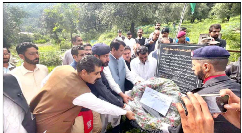
HAVELI KAHUTA: Federal Minister for Kashmir Affairs and Gilgit-Baltistan Engr. Amir Muqam laying floral wreath at the graves of martyred on the occasion of Pakistan Defence Day.

ISLAMABAD (APP): As Pakistan marks the 59th anniversary of the 1965 war, the nation comes together to honor the bravery and sacrifices of its heroes who laid down their lives for the country where digital platforms are seen flooded with gratitude to the valiant martyrs and armed forces who defended the motherland against all odds.