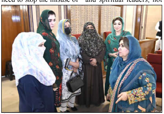
QUETTA: Women MPAs talking with Deputy Speaker Ghazala Gola before start of Balochistan Assembly session

Baloch demanded an immediate inquiry into the incident and action against those responsible for the unauthorized raid. He also emphasized that the National Party will not tolerate such acts of harassment and intimidation against its leaders and workers.