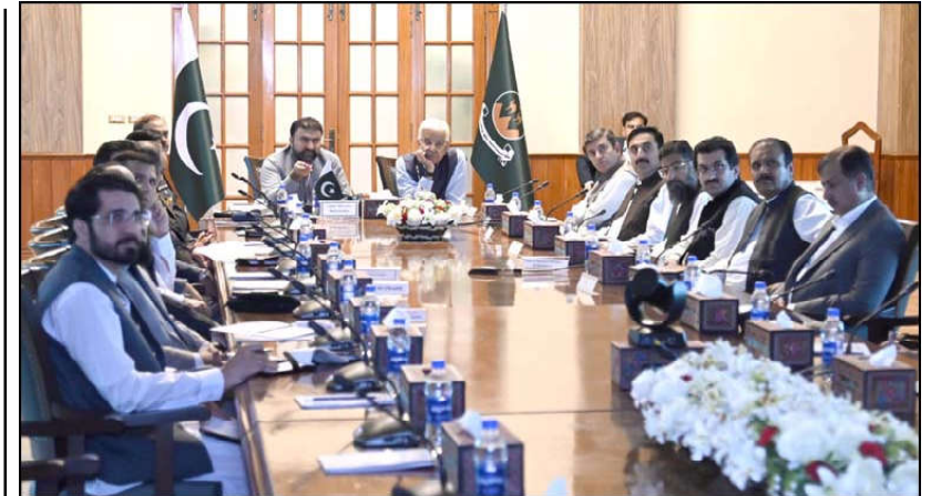
QUETTA: Federal Defense Minister Khawaja Asif and Chief Minister Balochistan Mir Sarfaraz Ahmed Bugti presiding over a meeting regarding law and order

brave officers and men of Pakistan Army who sacrificed their lives for the motherland," he said, highlighting the Pakistan Army's commitment to ensuring the sanctity and protection of martyrs and their families. "Our martyrs are our top priority, and we will continue to safeguard their honour." The army chief reiterated that the motto of the Pakistan Army—"Faith, Piety, and Jihad"—remains its greatest strength, enabling the military to counter any threats from enemies. He praised the unmatched bravery and professionalism of Pakistan's armed forces, not just in conventional warfare but also in countering the scourge of terrorism. General Munir spoke about the ongoing fight against terrorism, noting that Pakistan's forces have achieved remarkable success in controlling the threat, which has no parallel globally. "The army of any other country has not been able to achieve the success with which our forces have contained the menace of terrorism," he stated, adding that thanks to the efforts of the security forces and law enforcement agencies, today Pakistan stands safe from instability. However, the COAS also highlighted new and emerging challenges such as "digital terrorism" and the so-called 5th-generation warfare. He warned that these forms of terrorism, driven by the collaboration of foreign and anti-national