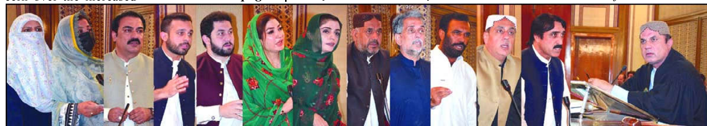
QUETTA: Provincial Ministers, Parliamentary Secretaries and MPs expressing their views on point of order during Balochistan Assembly session

MOHMAND (INP): Security forces in Mohmand district successfully foiled a terrorist attack, killing four terrorists. According to sources, the terrorists attempted to infiltrate the Civil Administration Colony. Security forces engaged the terrorists, resulting in their elimination. Sources further indicate that a clearance operation is currently underway in the area.