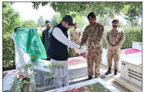
RAWALPINDI: Federal Minister for Overseas Pakistanis and Human Resource Development Chaudhry Salik Hussain visited Army Graveyard to pay tribute to the unwavering bravery and ultimate sacrifices of armed forces in Racecourse.

minute. On this day, our brave soldiers protected the country as well as the lives of millions of patriots, he added. Murad said that the day proved we were a living nation. "We always remember our martyrs, who sacrificed their tomorrow for our today," Chief Minister Sindh said. He further said that the Pakistan Army had full capacity to defend the motherland. "We stand by the side of our Pakistani forces," he said adding that once again Pakistan was going through a very critical period, on which we need to unite. He concluded that Pakistan would always remain forever.