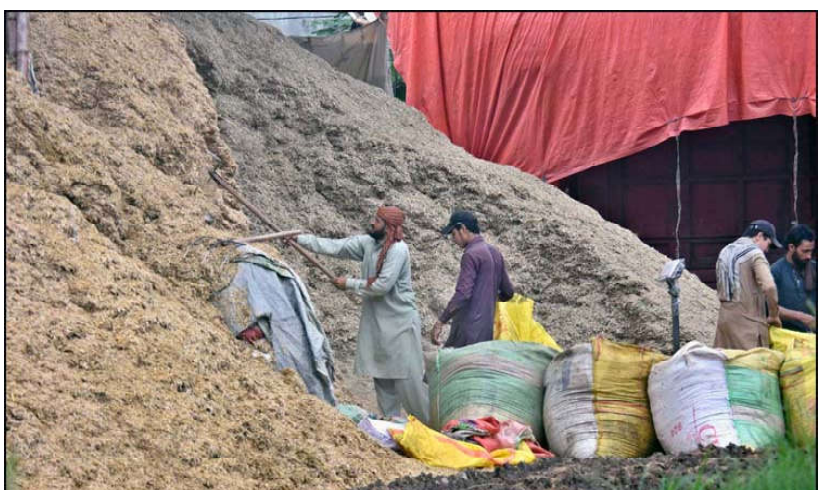
RAWALPINDI: Labourers busy in packing husk into sacks to transport different areas at Pirwadi in twin cities.

the company's commitment to embracing the latest technologies to provide a modern workspace, ensuring long-term sustainability, and delivering excellent value to shareholders, investors, employees, suppliers, and vendors. During the meeting, Mr. Khan gave a comprehensive presentation on investment opportunities in Pakistan. He noted that Tunisia's geographical location is strategically important for Pakistan due to its connections with developed European countries and its position at the crossroads of emerging African markets.