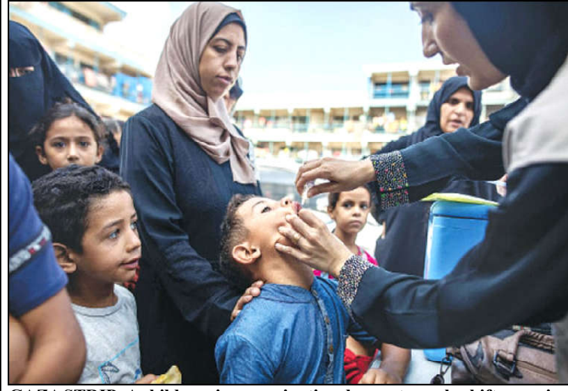
GAZASTRIP: A child receives vaccination drops at a makeshift camp in a school at Khan Yunis for people displaced by the Israeli aggression.

Yoon has made it a diplomatic priority to mend ties with Tokyo and improve security cooperation including with Washington to tackle North Korea's military threats, which led to a historic trilateral summit at Camp David last year.