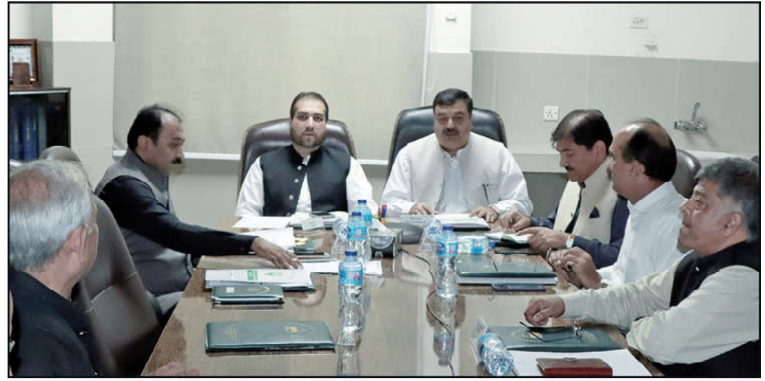
LAHORE: Punjab Minister for Livestock and Agriculture Syed Ashiq Hussain Kirmani presides over the meeting to review initiative taken for development of Livestock sector.

in key areas. In line with its mandate to fight poverty and improve lives and livelihoods, ADB will deepen its focus on five of the region's most pressing development issues: climate action, private sector development, regional cooperation and public goods, digital transformation, and resilience and empowerment. This enhanced focus will guide the allocation of staff and resources for greatest impact.