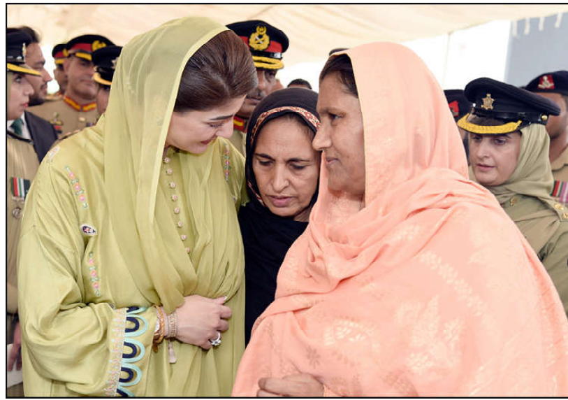
LAHORE: Punjab Chief Minister Maryam Nawaz Sharif talking to relative of martyred during her presence at monument of martyred on the eve of Defence Day.

Gandhara Buddhist exhibition and symposium will be held in Peshawar and Swat. Governor Kundi advocated for art and culture exchanges between Thailand and Khyber Pakhtunkhwa, particularly focusing on Buddhist civilization. The Thai delegation shared gifts and assured fully support for cultural exchange. They said that Pakistan is rich of Buddhism civilization. There is good diplomatic relations between the two countries and we want to develop it more. Meanwhile, Farrukh Toirov, Deputy Representative of the Food and Agriculture Organization (FAO) in Pakistan called on the Governor.