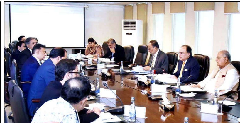
ISLAMABAD: Federal Minister for Finance and Revenue, Senator Muhammad Aurangzeb chairing a meeting of CCoSOEs at the Finance Division.

the relief goods. Meanwhile, the questions about Home department and PDMA were deferred because of the absence of respective provincial ministers. In the meantime, the members of opposition also staged token out from the House after they were not allowed to speak about PDMA. However, the members joined the session after sometime ending their token walk out. Earlier, on a point of order, the Member of Provincial Assembly and former Chief Minister, Dr. Abdul Malik Baloch said that some 3,000 people of the province have been included in the fourth schedule list. Those who were included in the fourth schedule list are: former Deputy Speaker, politicians, media persons besides others.