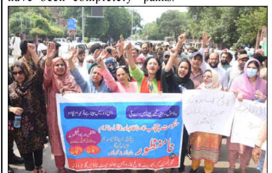
LAHORE: Professors and lecturers are protesting for their demands at Mall Road in the provincial capital.

The petitioner took the plea FIA arrested him on baseless grounds. FIA registered case on the basis of tweet.