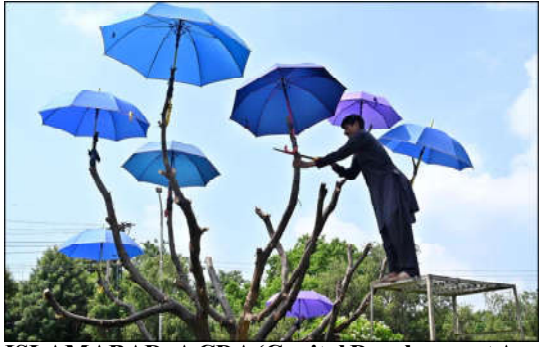
ISLAMABAD: A CDA (Capital Development Authority) worker is busy installing umbrellas on a tree at the Kashmir Chowk for beautification of Federal Capital.