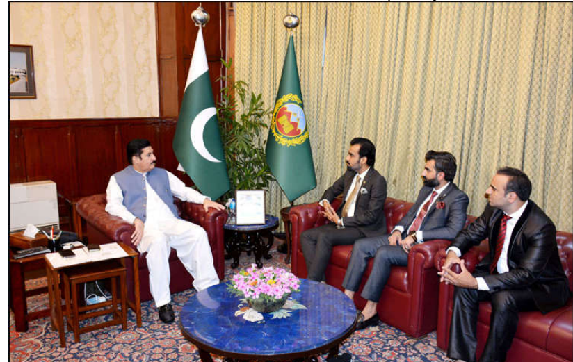
PESHAWAR: Governor Khyber Pakhtunkhwa Faisal Karim Kundi is called on by representative delegation of UK-Pakistan Trade & Investment Board at Governor House.

center.punjab.gov.pk, houses a comprehensive database encompassing a wide range of human capital from both public and private sectors. This includes skilled, semi-skilled, and unskilled individuals, creating a dynamic platform for potential job seekers and employers alike. The portal is designed to bridge the gap between employment exchange agencies, promoters, workers, and job seekers catering to the diverse needs of the job market.