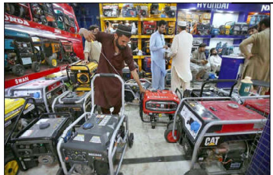
PESHAWAR: Vendor selling and displaying power generators to attract the customers at Sadar Bazaar.