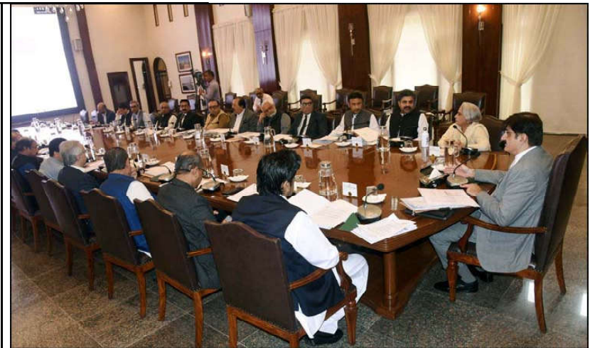
KARACHI: Sindh Chief Minister, Syed Murad Ali Shah presides over 45th meeting of Public Private Partnership Policy Board, at CM House in Karachi.