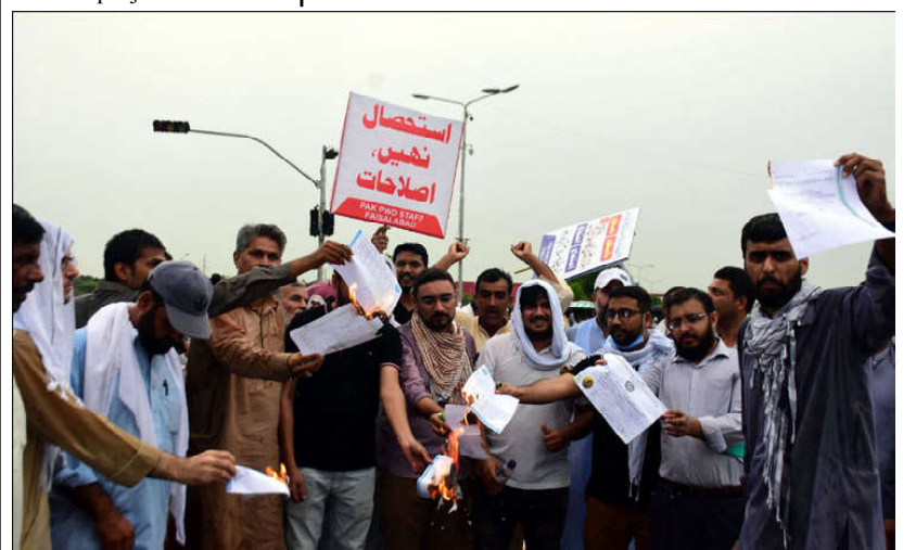
ISLAMABAD: Employees of PWD burning their professional degrees during a sit-in protest (Dharna) in favor of their demands at Srinagar Highway in the Federal Capital.

ISLAMABAD (APP): Ministry of Overseas Pakistanis and Human Resource Development has set up a Pakistani-German Facilitation & Reintegration Centre (PGFRC) in Lahore with an advisory desk at Overseas Pakistani Foundation (OPF) here at the head office. An official source told APP that the objective was to facilitate the return of overseas Pakistanis in terms of their skill development in Pakistan's social and economic fabric for gainful employment. It is being implemented in collaboration with Deutsche Gesellschaft für Internationale Zusammenarbeit (GIZ) GmbH and supported by the German Federal Ministry for Economic Cooperation and Development (BMZ). The Memorandum of Understanding (MoU) between Deutsche Gesellschaft für Internationale Zusammenarbeit (GIZ) GmbH and Overseas Pakistani Foundation, Ministry of Overseas Pakistanis & Human Resource Development on technical assistance to the facilitation & reintegration centre for Pakistani workers has been signed.