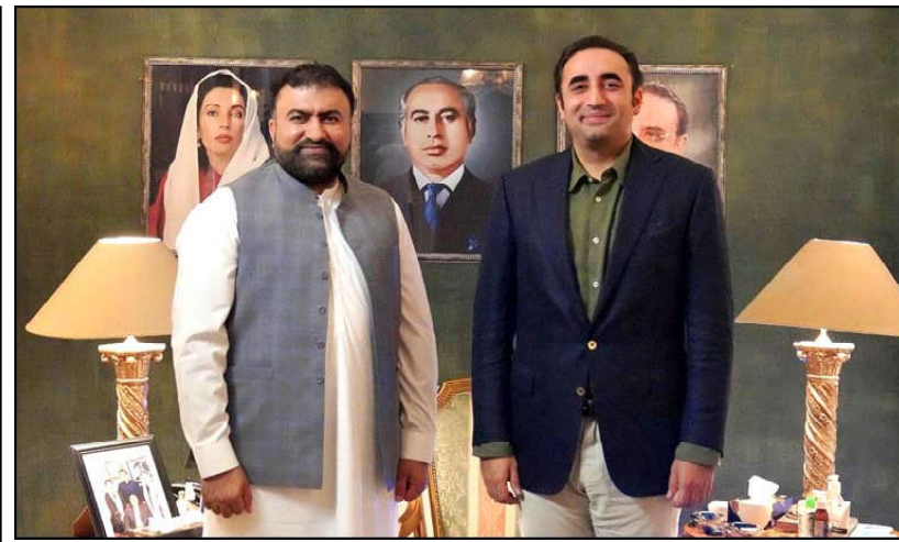
ISLAMABAD: Chief Minister Balochistan Mir Sarfaraz Ahmed Bugti photographed with Chairman PPP Bilawal Bhutto Zardari.