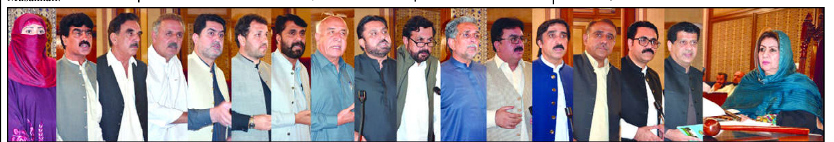
QUETTA: Provincial Ministers, Parliamentary Secretaries and MPs expressing their views on condemnation resolutions presented in Balochistan Assembly

He sought the increase in the number of top court judges from 17 to 21 as "more than 53,000 cases" pending in the apex court.