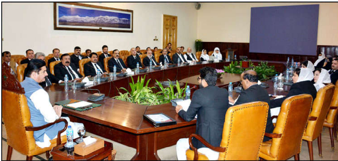
PESHAWAR: Khyber Pakhtunkhwa Governor Faisal Karim Kundi in a meeting with the representative of delegation of International Lawyers Association at Governor House.

LAHORE (APP): Punjab Chief Minister Maryam Nawaz Sharif has reviewed the Green Transport System project under which 5,000 electric buses will be run across Punjab. In the first phase 1,000 buses would be provided to start the project in major cities of Punjab and in five years, an 'end-to-end' green transport system will be launched in major cities.