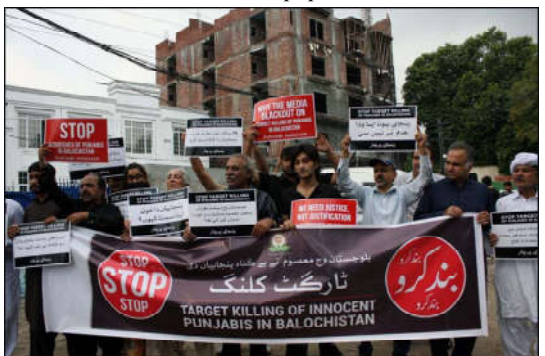
LAHORE: Members of Punjabi Panchar Organization are holding protest demonstration against target killing of Punjabis in Balochistan, at Lahore press club.

The minister further noted that sugarcane crops have been fully destroyed on 26,382 acres and partially damaged on 69,689 acres. The unprecedented rains have led to a 21% loss in cotton and a 41% loss in date palms.