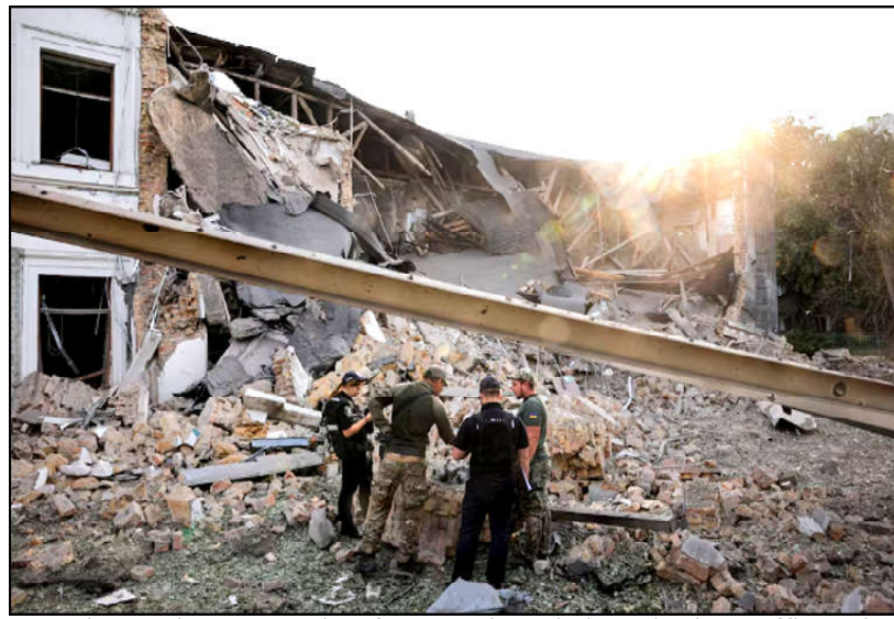
Investigators inspect the site of the Russian missile strike in an office building, amid the Russia-Ukraine conflict, in Kyiv, Ukraine.