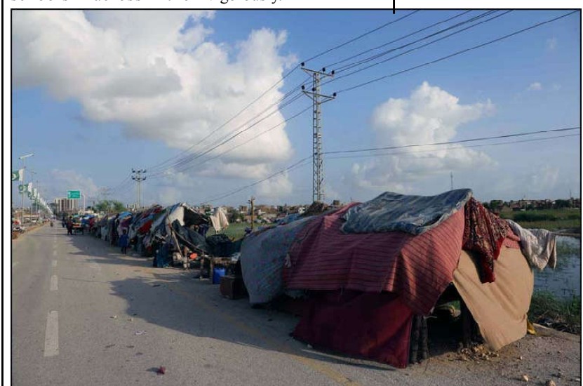
HYDERABAD: Flood affected people of Golarchi area are living under the open sky at roadside makeshift houses as they are waiting for government relief after destruction due to flash flooded caused by recent heavy downpour of monsoon season, near Hyderabad.

Attended by participants from Tourism department and its allied authorities including Galiyat Development Authority, Kaghan Development Authority, Upper Swat Development