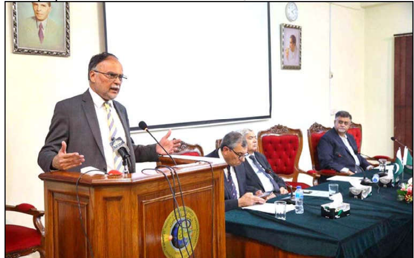
ISLAMABAD: Federal Minister for Planning, Development and Special Initiatives, Prof. Ahsan Iqbal, addressing a symposium on "Climate Change and Health Development Consequences in Pakistan at the Pakistan Academy of Sciences.