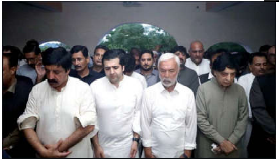
LAHORE: Punjab Governor, Sardar Saleem Haider Khan offering funeral prayers for mother in the law in his native village Malal, Fateh Jang. Former Federal Interior Minister, Chaudhry Nisar Ali Khan and other high ups are also present.

The Smart Classroom Project aligns with the government's vision of nurturing talent and driving economic growth through technology.