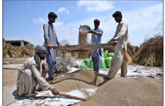
LARKANA: Farmers busy cleaning grain in their field in a traditional way near Larkana-Tando Masti Road.

ISLAMABAD (APP): The price of 24 karat per tola gold witnessed no change on Monday and was traded at Rs.262,500, the All Sindh Sarafa Jewellers Association reported. The price of 10 gram 24 karat and 10 gram 22 karat gold also remained constant at Rs. 225,051 and Rs.206,297. The price of per tola and ten gram silver remained unchanged at Rs.2,950 and Rs.2,529.14, respectively. The price of gold in the international market remained stagnant at $2,503, the Association reported.