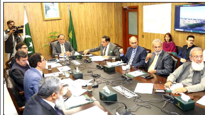
ISLAMABAD: Federal Minister for Planning Development & Special Initiatives Prof. Ahsan Iqbal chairing a meeting to review the progress of Public Sector Development Programme (PSDP) projects in Balochistan.

He said that there was extreme of barbarism on highways of the province in the midnight of August 25 and 26.