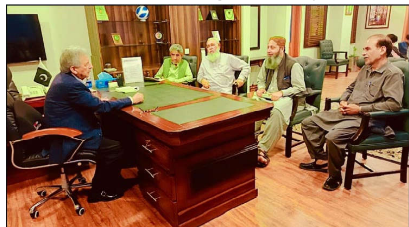
A delegation of the Utility Store Corporation meets with Federal Minister for Industries and Production, Rana Tanveer Hussain in Islamabad.