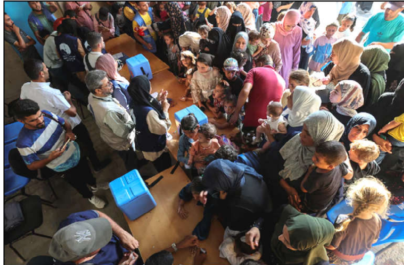
Palestinians gather for a polio vaccination campaign, at a United Nations healthcare center in Deir Al-Balah in the central Gaza Strip.

from the Central Election Commission reported by the TASS news agency. It had 69 seats in the outgoing parliament. Just over 2 million people in the energy-rich nation cast their ballots, bringing the turnout at the time of the close of polling stations to 37.3%, said Central Election Commission chief Mazahir Panakhov. Exit polls suggested dozens of other seats would go to candidates who are nominally independent of political parties but in practice back the government as well as to minor pro-government parties.