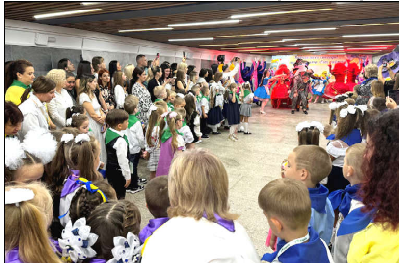
Teachers, students and their parents celebrate the beginning of a school year at an underground school located at a metro, amid the Russia-Ukraine conflict, in Kharkiv, Ukraine.

Monitoring Desk KABUL: Taliban supreme leader Hibatullah Akhundzada has ordered Afghan officials to enact a sweeping new morality law curtailing women's rights and enshrining an austere vision of Islamic society, Taliban authorities last month announced the law, which includes rules that women's faces, bodies and voices should be "covered" outside the home, among 35 articles dictating behaviour and lifestyle. While many of the measures have been informally enforced since the Taliban's takeover in 2021, their formal codification sparked an outcry from the international community and rights groups. Akhundzada told civil and military officials "they should implement ... the law of promoting virtue in society", a statement by the Information and Culture Department of Faryab province said.