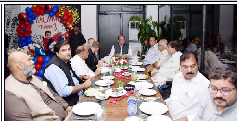
LAHORE: A delegation of International Labour and Trade Unions meeting with Punjab Minister for Industries and Commerce Ch. Shafay Hussain.

Ch. Shafay Hussain emphasized that promoting solar energy and electric vehicles is the Punjab.