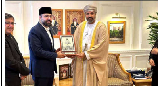
OMAN: Federal Minister for Overseas Pakistanis and Human Resource Development, Chaudhry Salik Hussain, receiving a souvenir from Oman's Minister of Labour, Dr Mahad bin Said bin Ali.

Instead to focus on improving law and order situation in southern districts, he said that maladministration and poor governance besides corruption cases have started surfacing in Khyber Pakhtunkhwa. He said that recent corruption allegations by the Provincial Ministers and advisers against each others has exposed the anti corruption claims of the rulers of Khyber Pakhtunkhwa. Engr Amir Muqam who is also the President of Pakistan Muslim League Nawaz in Khyber Pakhtunkhwa said that Chief Minister Khyber Pakhtunkhwa lacked vision for people welfare and that agitation politics was his main focus.