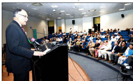
LAHORE: The Federal Minister for Planning, Development & Special Initiatives, Ahsan Iqbal Addressing to Asia's Energy Transition Summit at LUMS University.

He said that Pakistan is China's best friend and our cooperation will always continue.