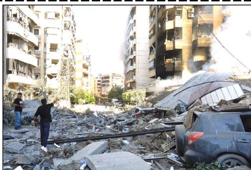
BEIRUT: People inspect the devastation in the Hadath district of the Lebanon capital's southern suburbs in the aftermath of intense Israeli air strikes.