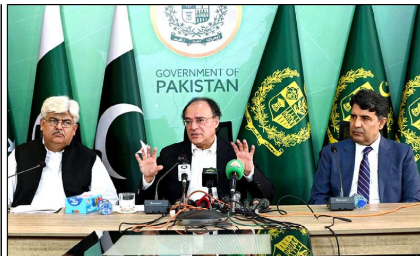
ISLAMABAD: Federal Minister for Finance and Revenue Senator Muhammad Aurangzeb addressing a press conference at PTV Headquarter.

He said that it had been cleared by local as well as foreign thinktanks that the moment Pakistan puts foot on paddle and growth rate crosses 4 percent, it runs out of dollars because of being import led economy. Resultantly the country is stuck in balance of payment position and therefore had to run back the lenders.