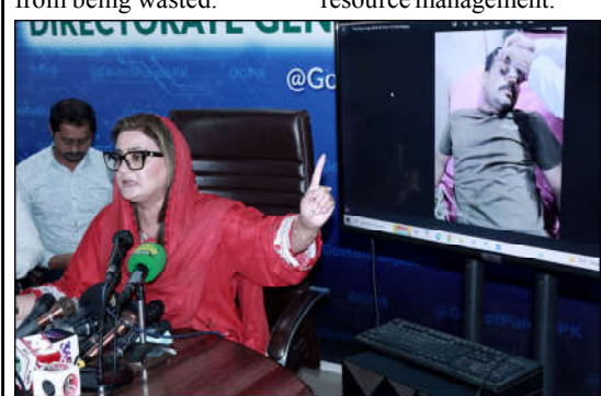
LAHORE: Punjab Information Minister Azma Bukhari talking to media persons at DGPR.

MUZAFFARGARH (APP): Pakistan People Party senior leader and former federal minister Mehar Irshad Sial strongly condemned the brutal killing of seven labourers from south Punjab in Panjgur, Balochistan. In a statement issued here on Sunday, he said: "We strongly condemn the murder of poor labourers". He called for every possible measure to ensure the rights and safety of labourers, stressing the need for swift action.