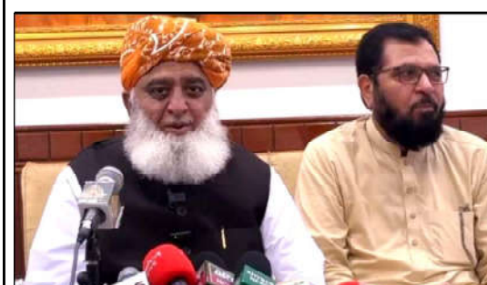
ISLAMABAD: Amir JUI Maulana Fazlur Rehman addressing a Press conference.