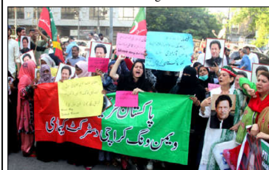
KARACHI: Workers of PTI protest in favour of their demands in the Provincial Capital.