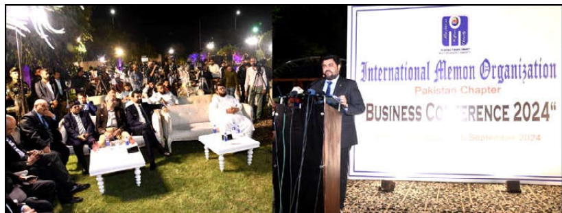
KARACHI: Governor Sindh Kamran Khan Tessori addressing International Memon to Memon Business Conference.

Vowing to come back with "all resources", he regretted that the police fired teargas and rubber bullets at the protesters.