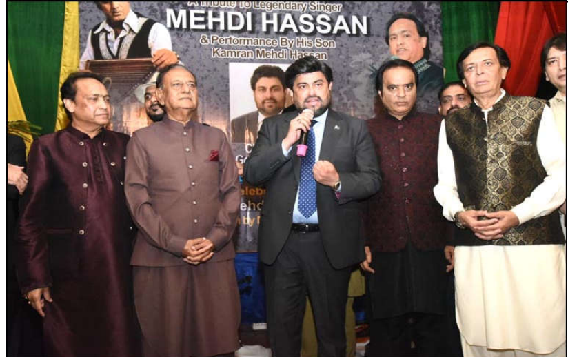
KARACHI: Governor Sindh Kamran Khan Tessori talking with media members during a ceremony in memory of legendary singer Mehdi Hassan organized by Pakistan-American Cultural Center.