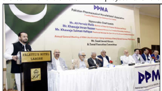
LAHORE: Punjab Minister for Health Imran Nazir addressing the oath taking ceremony of PPMA North Zone.