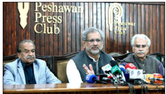
PESHAWAR: Former prime minister and Awam Pakistan Party leader, Shahid Khaqan Abbasi addresses to media persons during press conference held at Peshawar press club.

This hands-on learning experience instills a sense of ownership and environmental stewardship in the children while promoting healthy, sustainable living practices.