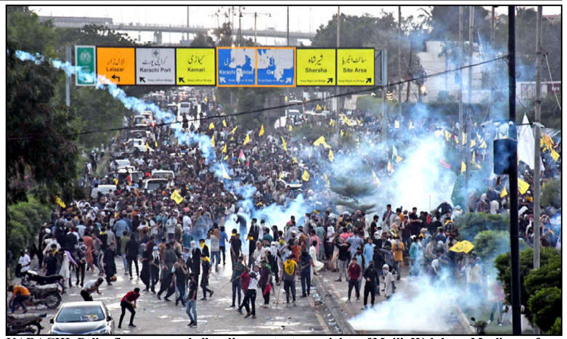
KARACHI: Police fires teargas shell to disperse to stop activists of Majlis Wahdat-e-Muslimeen from reaching the U.S. Consulate during an anti-Israel protest in the Provincial Capital.

LUMS Energy Institute (LEI) in collaboration with Pakistan Renewable Energy Coalition (PREC) has arranged the three-day summit to facilitate discussion on transition to renewable energy. Leading energy experts, researchers, civil society activists, policymakers and parliamentarians attended the event. The event was aimed at highlighting the need for coordinated efforts across Asia to mobilise finances for a transition towards renewable energy, a move away from fossil fuels and improving energy efficiency and conservation.