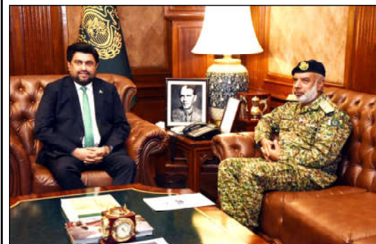
The Governor thanked the martyrs and soldiers of the Navy for protecting seas and marine resources. Tessori said that the spirit of the officers and men of the Navy is a valuable asset for every person in the nation. He said that the Pakistan Navy was the pride of the country. They also discussed the further improvement of infrastructure in the coastal belt of Sindh, especially the creek area.