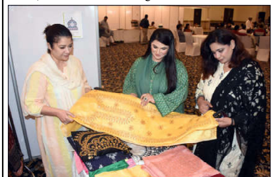
LAHORE: Women are busy buying clothes on a stall at a local hotel, in the Provincial Capital.

The gathering sought to address challenges in the tourism sector and explore avenues for exponential growth.