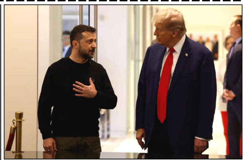
Republican presidential nominee and former U.S. President Donald Trump and Ukraine's President Volodymyr Zelenskiy meet at Trump Tower in New York City, U.S.

non-starter for Kyiv - Trump replied: "We'll see what happens." Still, Trump said on Friday he was pleased to meet with Zelenskiy, a marked change in tone from some of his previous comments on the campaign trail. On Monday, Trump said Zelenskiy wanted Harris to win the election. He has also called Zelenskiy "the greatest salesman of all time" because his country has received billions of dollars in military aid from the United States and Europe. "It's an honor to have the president with us, and he's been through a lot," Trump said on Friday. "He's been through a tremendous amount, like probably nobody else, almost nobody else in history, if you really get right down to it, and we're going to have a discussion and see what we could come up with."