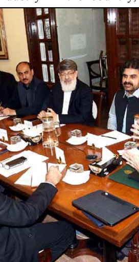
KARACHI: Sindh Chief Minister, Syed Murad Ali Shah chairs a follow-up meeting on the Malir Expressway project, at CM House in Karachi.

particularly Artificial Intelligence. Honourable Chief Minister Sindh, Syed Murad Ali Shah, and notable civil community members attended the inauguration ceremony. Chief Minister Sindh emphasized the importance of IT domain for optimal exploitation of potential of youth and economic growth. COAS highlighted that such projects are aimed at providing the most conducive environment to further promote the growth of IT industry in the country,