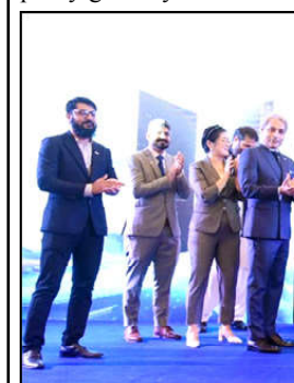
KARACHI: Sindh Governor Kamran Khan Tessori launching the LONGI solar Panels Hi-MO 9 & Hi-MO X10.

He said that tourism is also a means of providing employment, increasing exports and spreading prosperity globally.