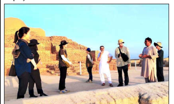
MOHENJO DARO: A tourist delegation from Korea are visiting and expressed keen interest in the historical ruins of the World Heritage Monuments of Mohenjo Daro.

LAHORE (APP): At least thirteen persons were killed and 1400 injured in 1334 Road Traffic Crashes (RTCs) in all 37 districts of Punjab during the last 24 hours. Out of these, 617 people with serious injuries were shifted to different hospitals, while 783 victims with minor injuries were treated at the incident site by Rescue Medical Teams thus reducing the burden of hospitals. Furthermore, the analysis showed those 783 drivers, 64 underage drivers, 140 pedestrians.