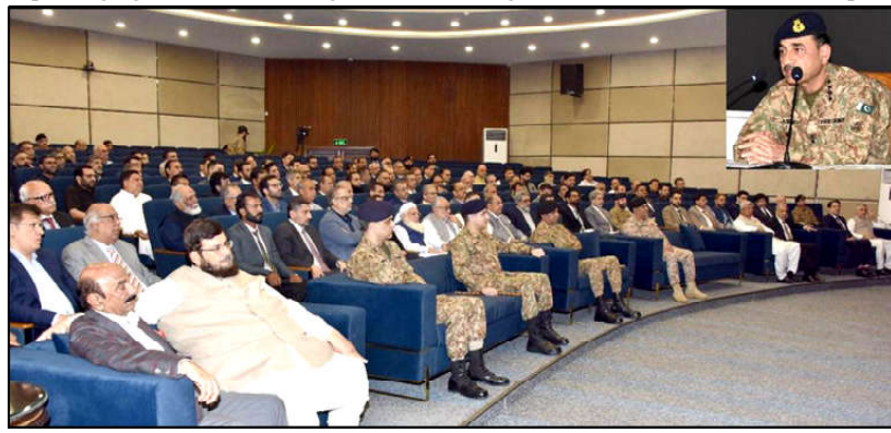
KARACHI: Chief of Army Staff (COAS) General Asim Munir interacting with the business community of Karachi.

The IMF Executive Board approved a 37-month loan on Wednesday. These fresh inflows will be reflected in the central bank's liquid foreign exchange reserves figures, which will be released on Thursday, October 3, 2024, the SBP said in a statement.