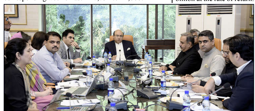
LAHORE: Punjab Finance Minister Mujtaba Shuja-ur-Rehman presides over the 8th meeting of Punjab Public Finance Management Reforms Steering Committee.