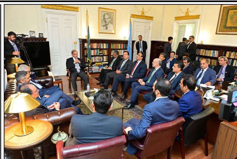
NEW YORK: Prime Minister Muhammad Shehbaz Sharif meets with a delegation of prominent Pakistani-American Bankers on the sidelines of 79th session of the United Nations General Assembly.

KARACHI (APP): The State Bank of Pakistan (SBP) injected Rs1,589.5 billion in the market through reverse repo purchase Open Market Operation (OMO) on Friday. According to OMO results issued here, the SBP conducted Open Market Operation, Reverse Repo Purchase (Injection) on September 27, 2024 for 7-day and 28-day tenors and accepted 20 bids cumulatively amounting to Rs1,589.5 billion. The central bank received 14 bids for 7-day tenor cumulatively offering an amount of Rs1,420.05 billion at the rate of return.