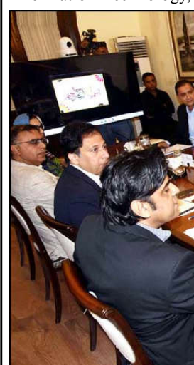
KARACHI: Sindh Chief Minister, Syed Murad Ali Shah chairs a follow-up meeting on the Malir Expressway project, at CM House in Karachi.

During his visit, COAS also inaugurated Innovista Indus IT Park, a hub aimed at empowering Pakistan's youth by fostering academia-industry collaboration in the field of Information Technology,