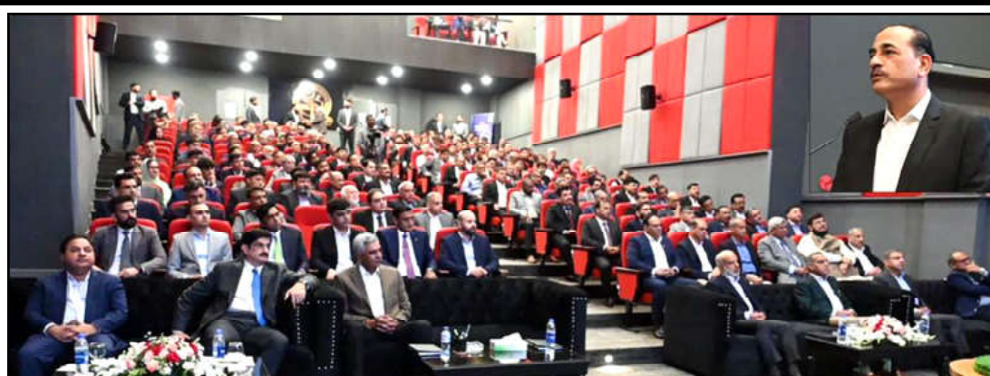
KARACHI: Chief of Army Staff (COAS) General Asim Munir addressing inaugural ceremony of Innovista Indus IT Park, a hub aimed at empowering Pakistan's youth by fostering academia-industry collaboration in the field of Information Technology, particularly Artificial Intelligence.

He further said that tourism promotes peace and understanding between nations and cultures.